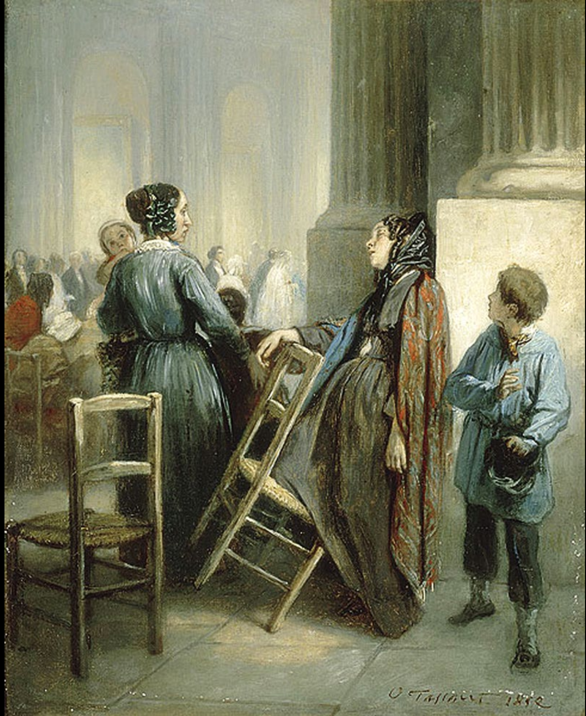
Abandoned Octave Tassaert Musee Fabre Montpellier, France