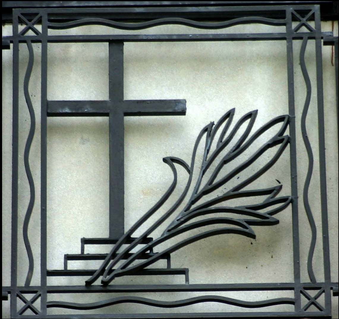
Cross with Wheat

Benton Chapel Vanderbilt Divinity School Nashville, TN