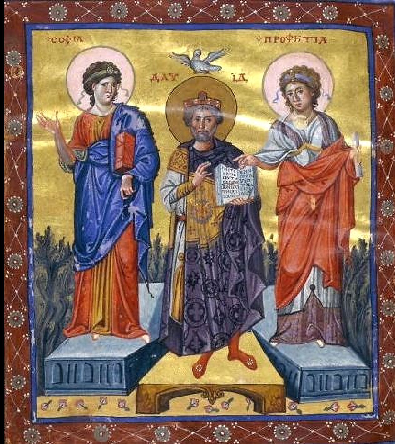
Wisdom and Prophecy with King David