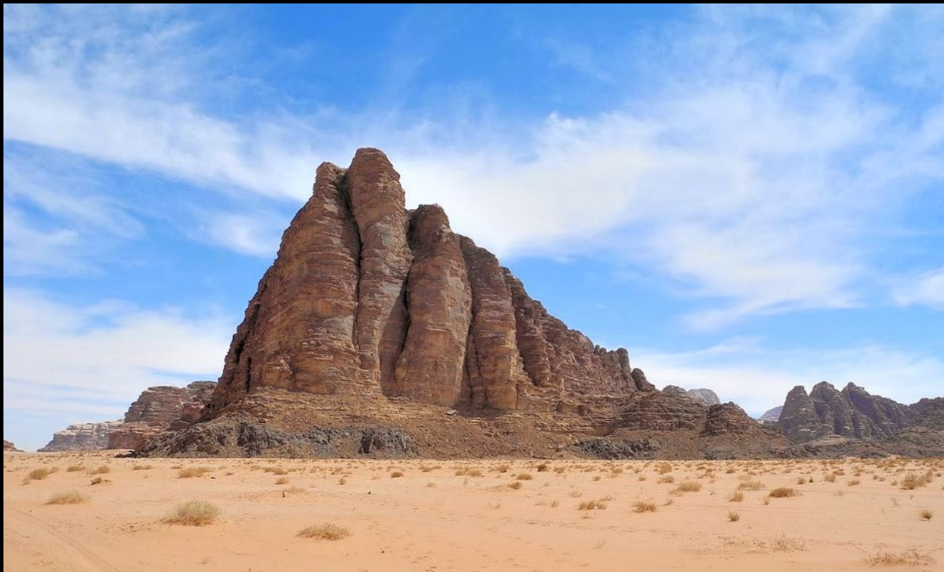
The Seven Pillars of Wisdom -- Jordan desert