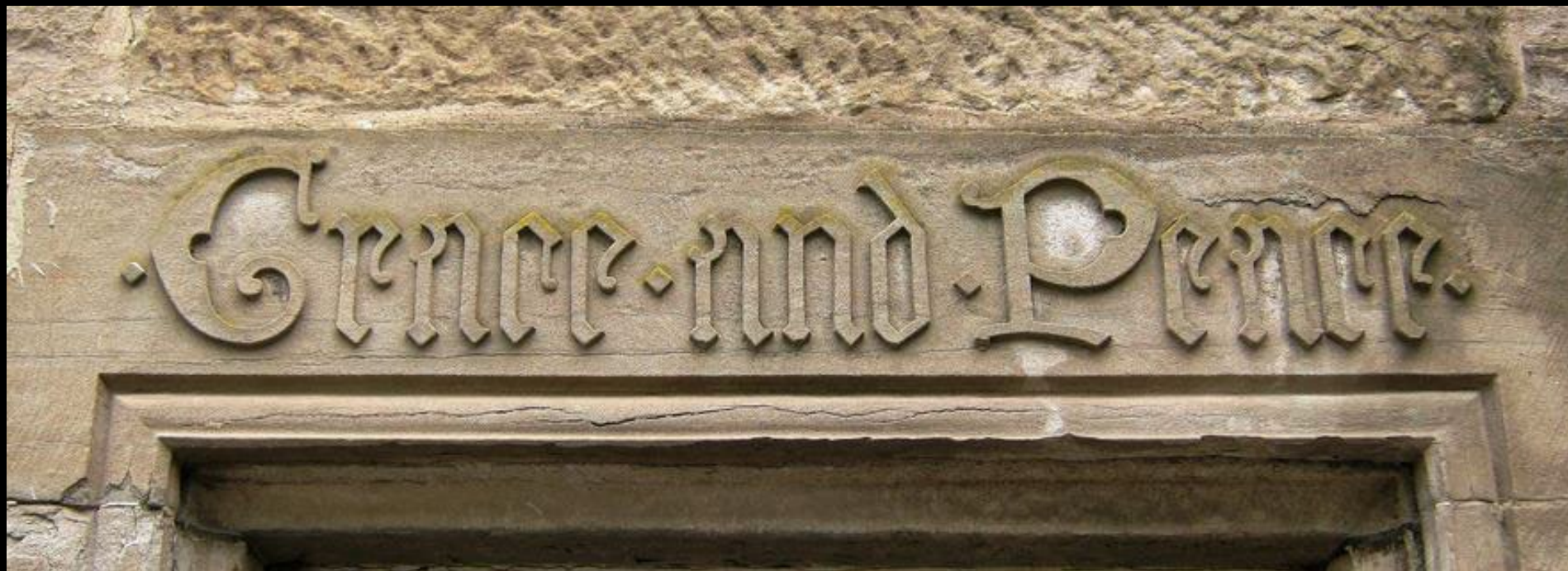
Grace and Peace -- Entry doorway to home in Perth, Scotland