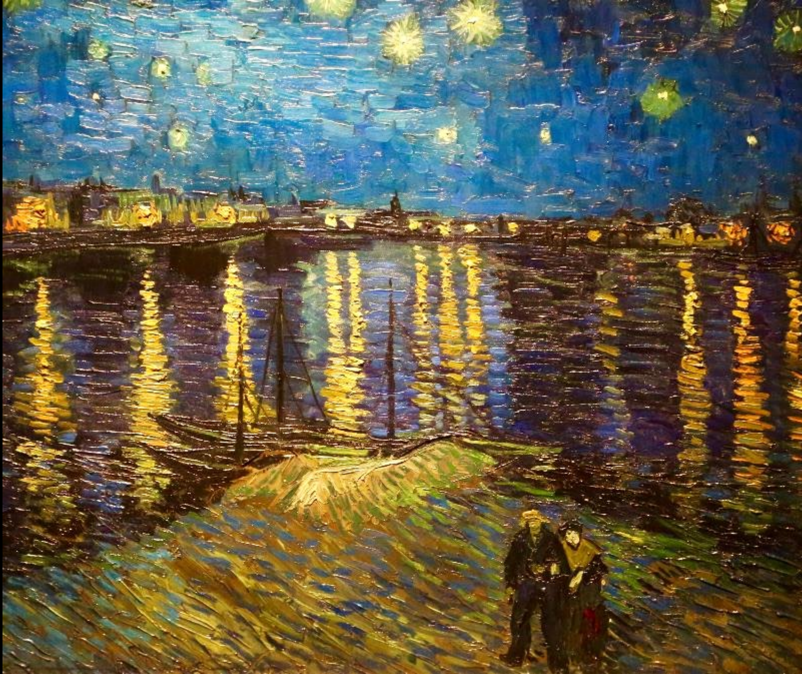
Starry Night -- Vincent van Gogh, Musee D'Orsay, Paris, France