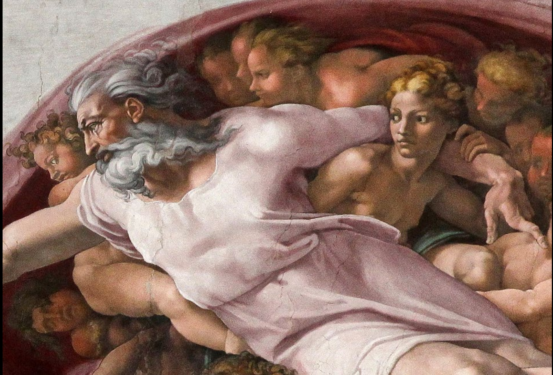
Creation of Adam, detail -- Michelangelo, Sistine Chapel, Vatican City