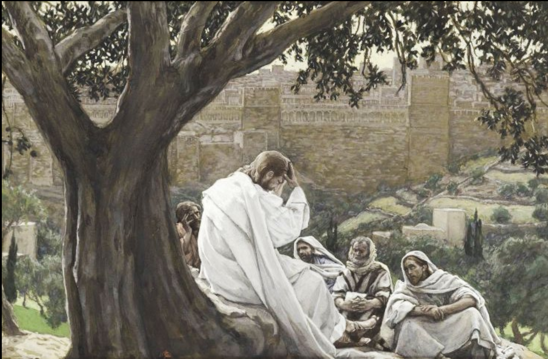
Prophecy of the Destruction of the Temple -- James Tissot, Brooklyn Museum, New York, NY