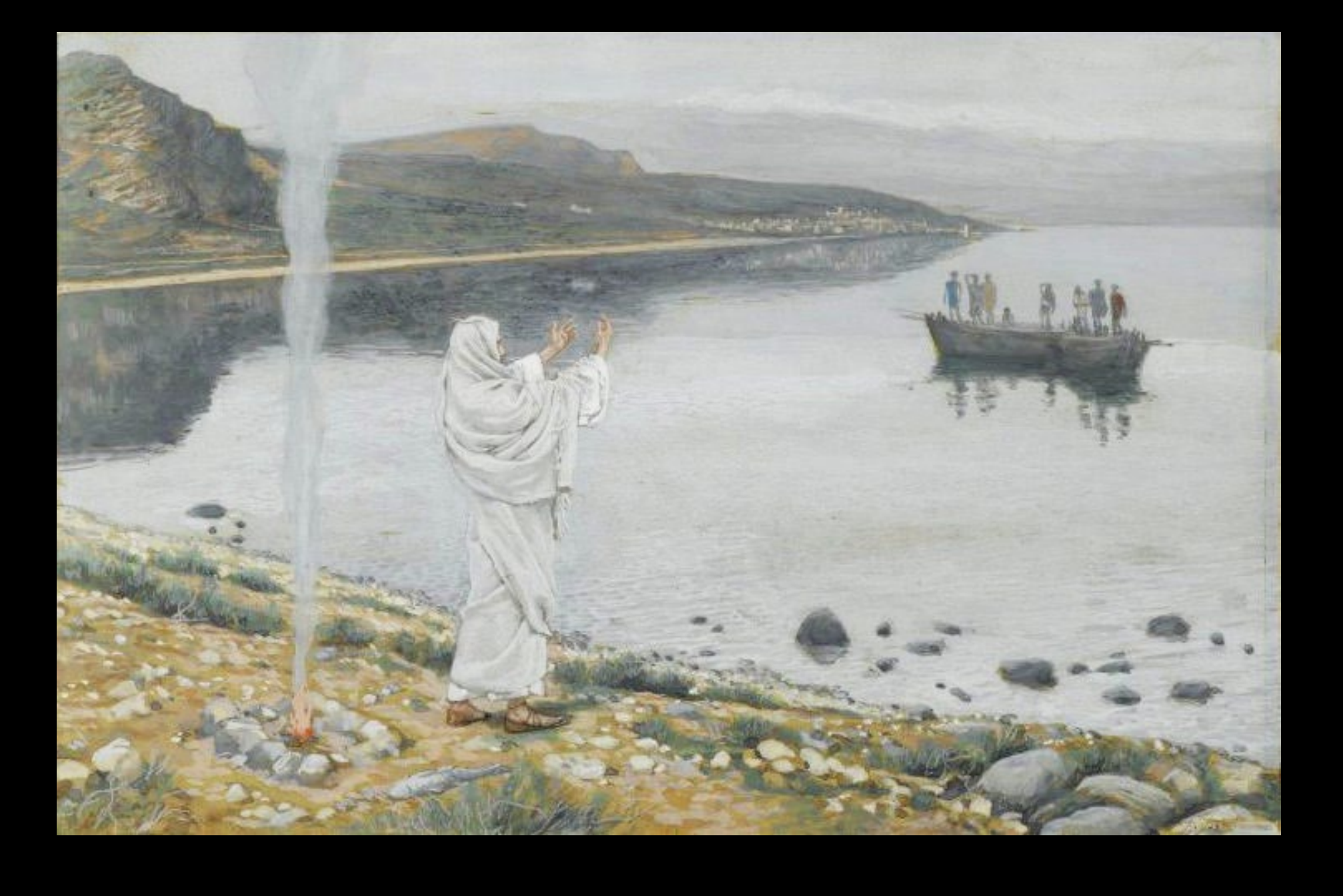
Christ Appears on the Shore of Lake Tiberias -- James Tissot, Brooklyn Museum of Art, New York, NY