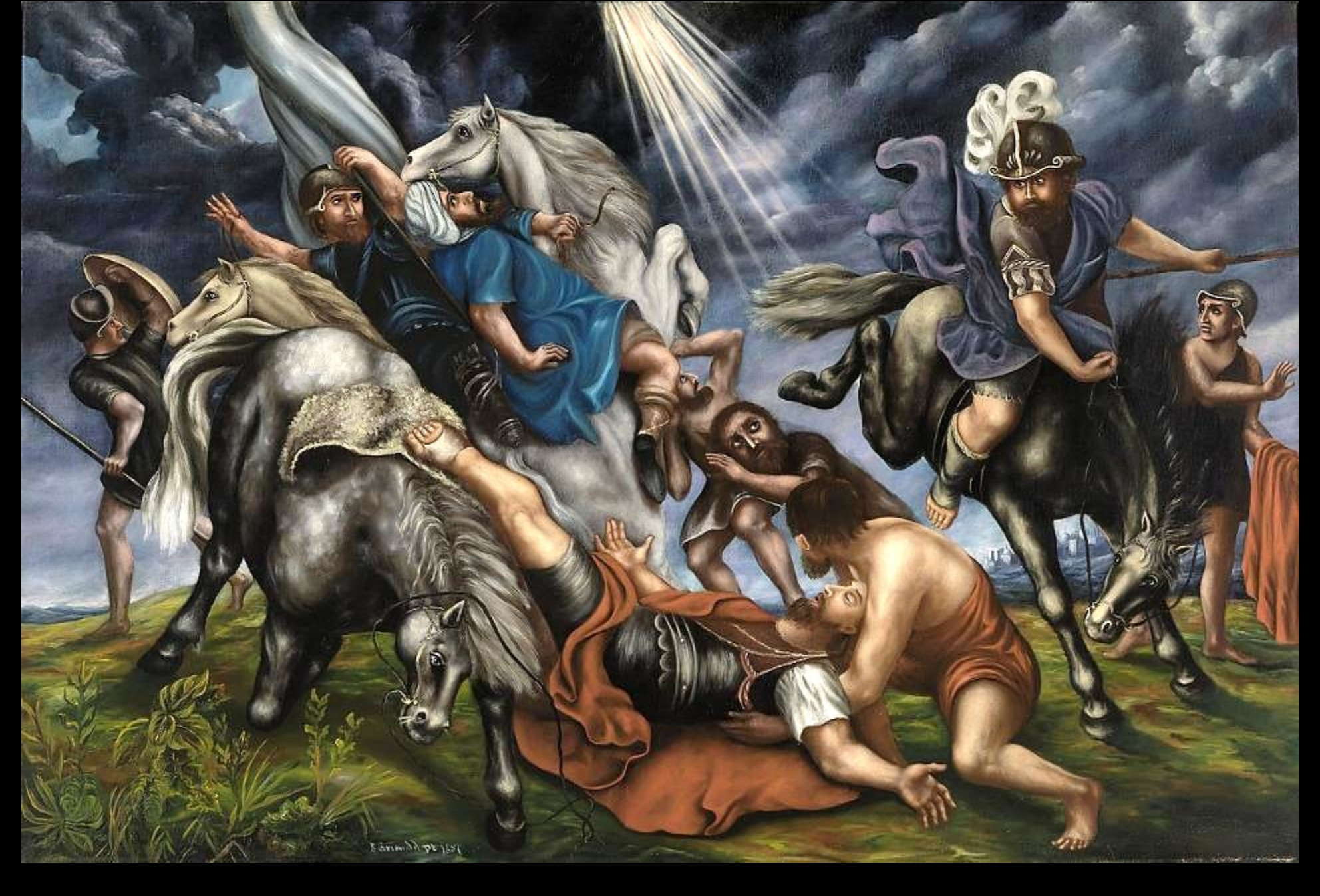
Conversion of Saul -- Simeon Griswold, Smithsonian Museum of American Art, Washington, DC