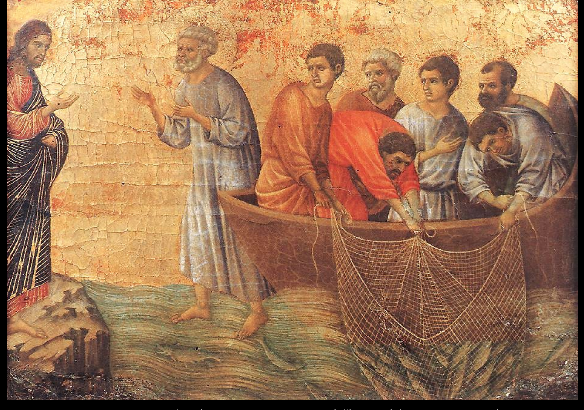
Appearance on Lake Tiberias -- Duccio, Museo dell'Opera del Duomo, Siena, Italy