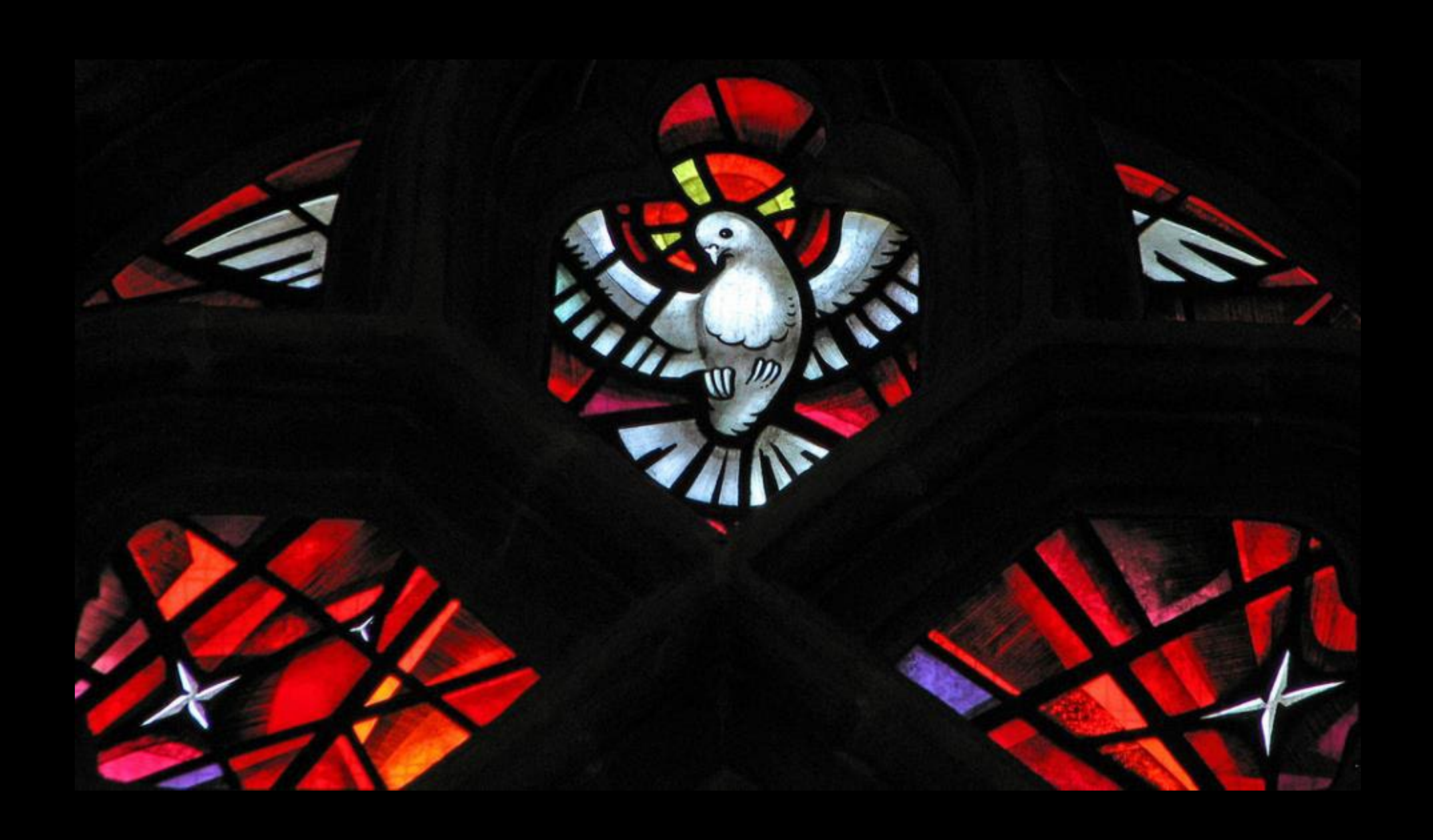
Holy Spirit -- St. George's Cathedral, Southwark, England