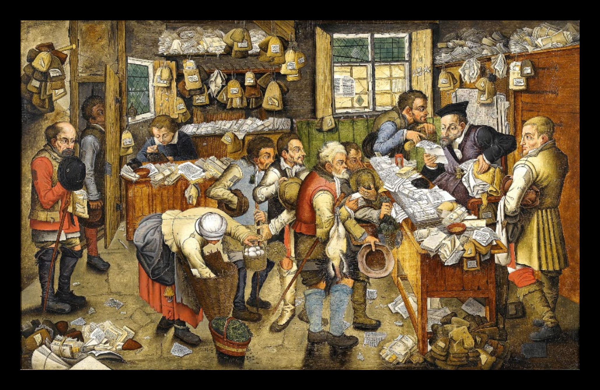
Payment of the Tithe, or, the Tax Collector -- Workshop of Pieter Brueghel the Younger