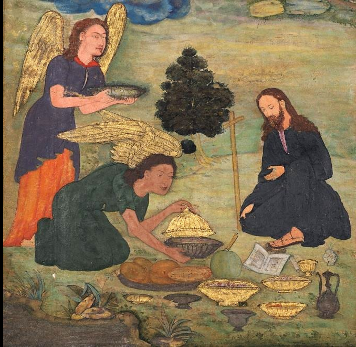
Angels Bring Bread to Jesus in the Wilderness -- India, early 17 th c.