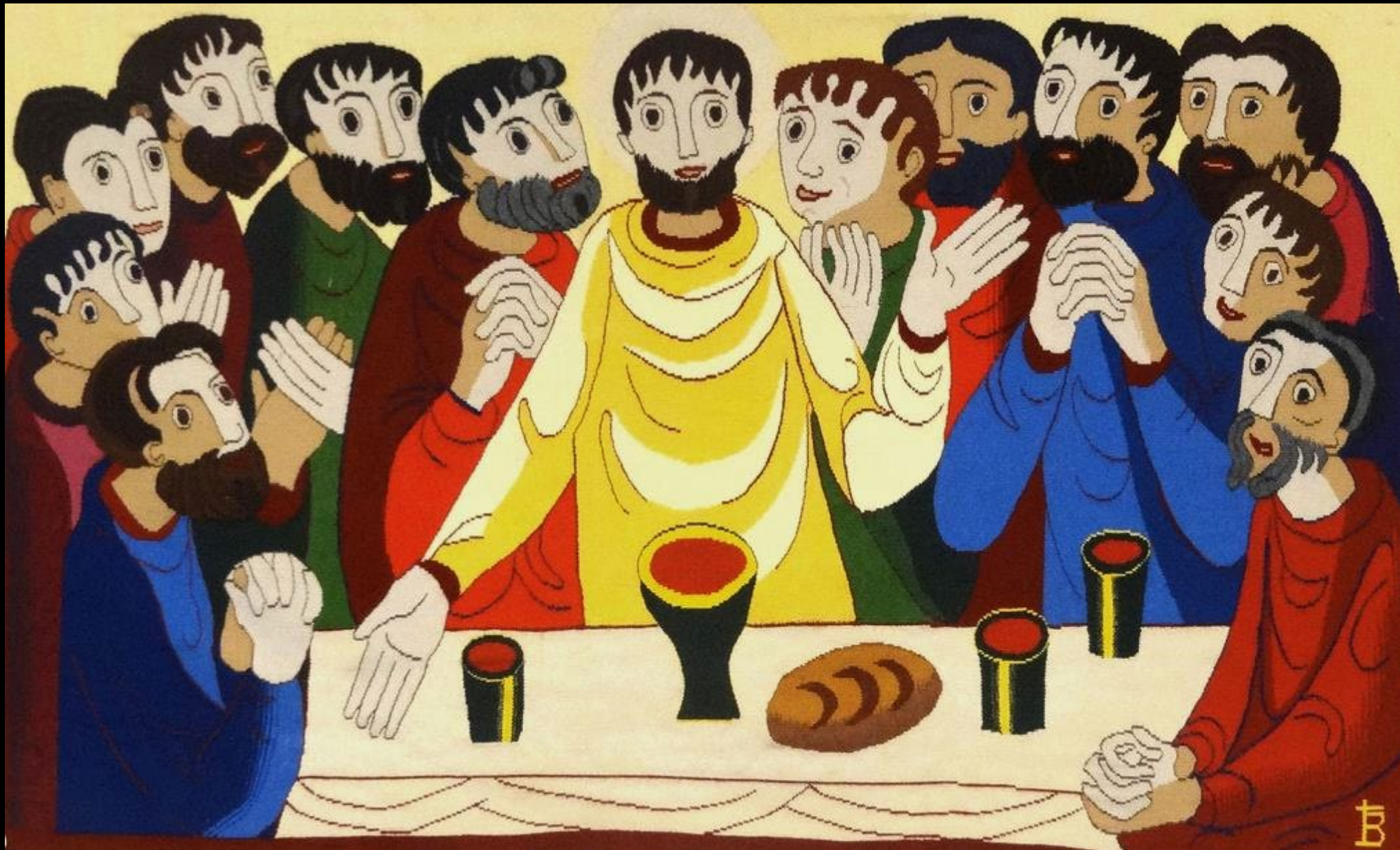
The Last Supper -- Bose Monastery, Bose, Italy