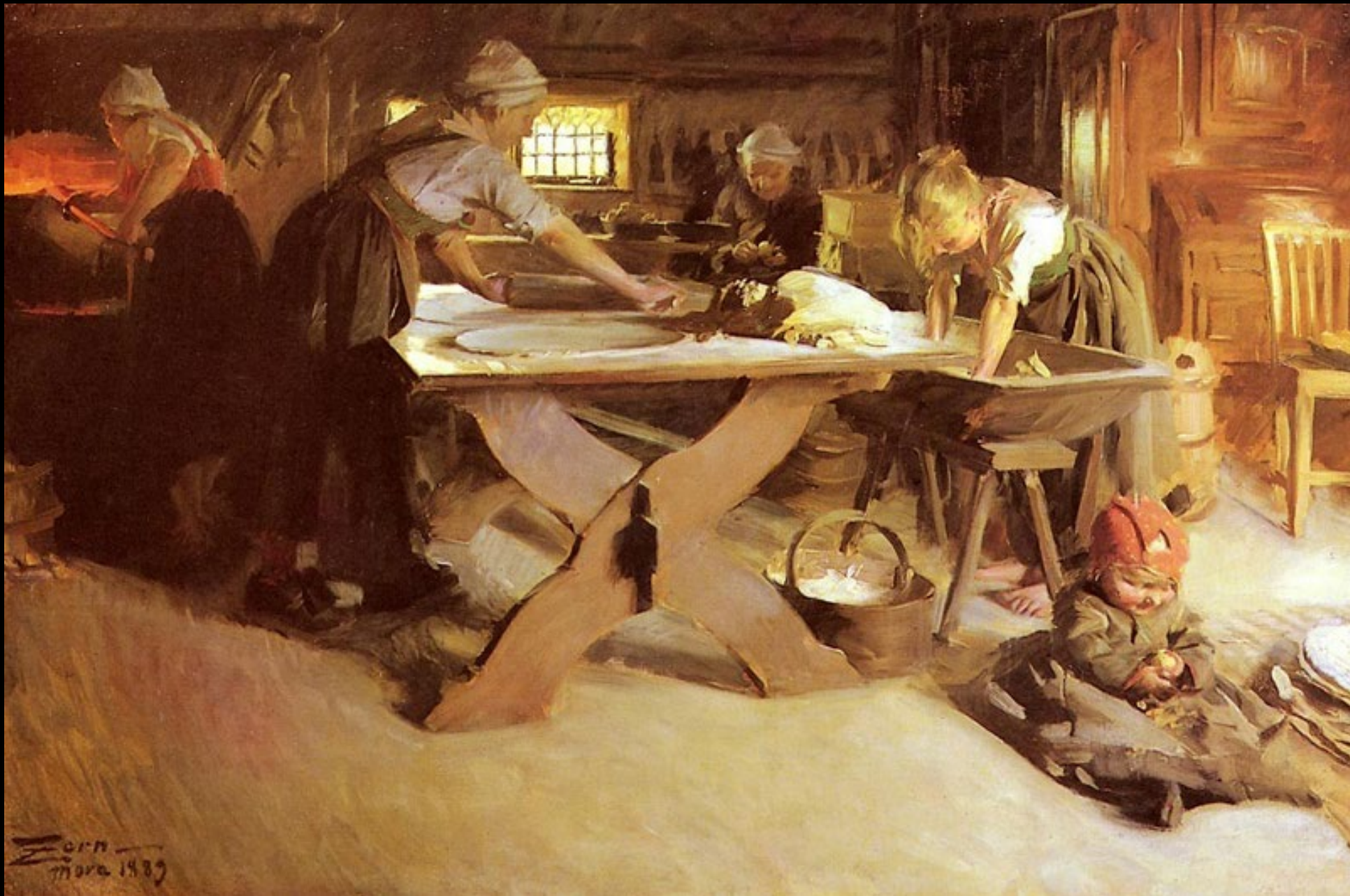
Bread Baking -- Anders Zorn