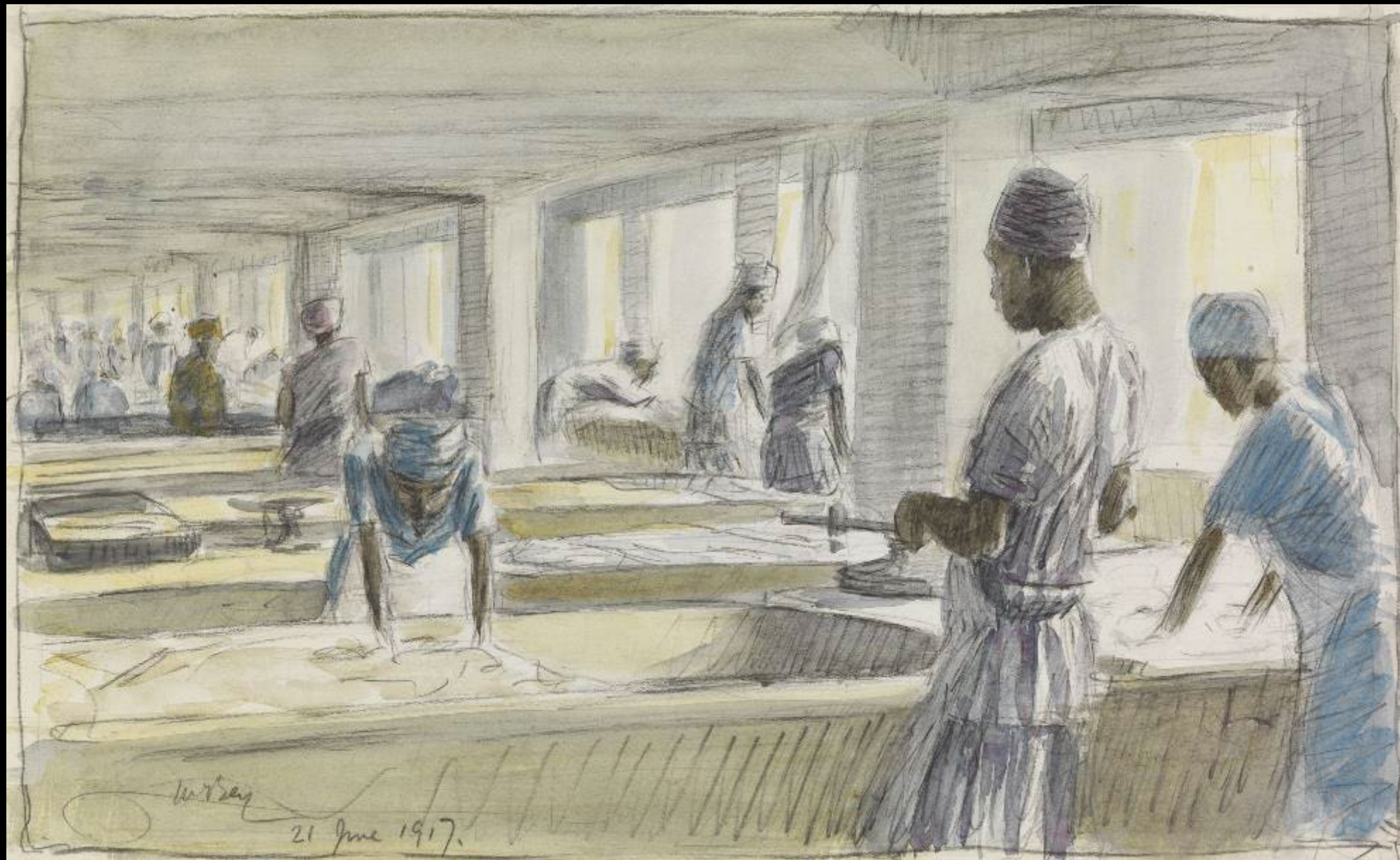
Making Bread -- James McBey