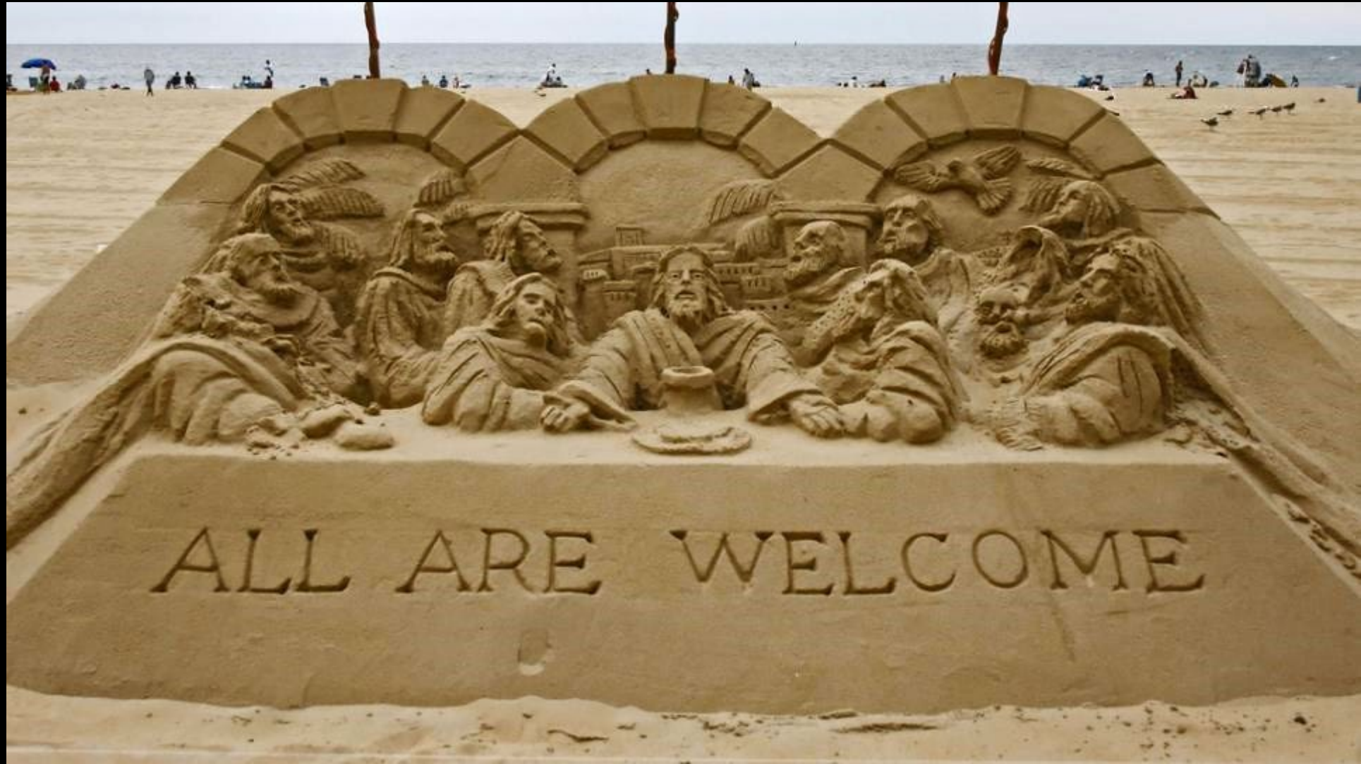
All Are Welcome in the Kingdom of God -- Sand sculpture, Ocean City, MD