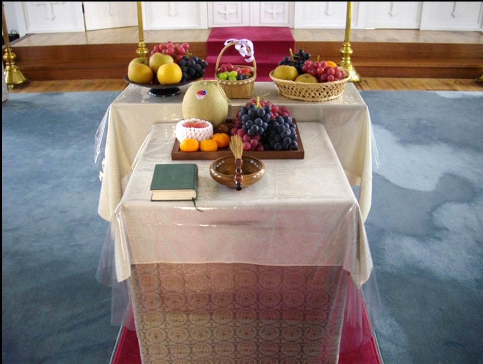
Altar Offering of First Fruits, Japanese Orthodox Holy Resurrection Cathedral, Tokyo, Japan