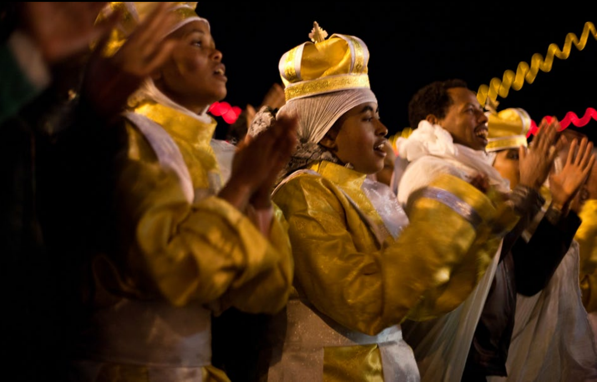
Ethiopian and Eritrean Refugees Celebrate Christmas