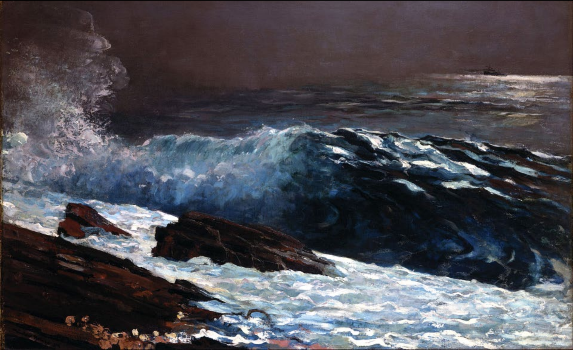
Sunlight Appears on the Coast -- Winslow Homer, Toledo Museum of Art, Toledo, OH