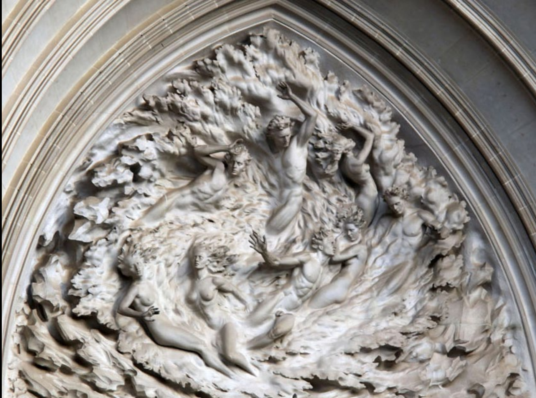
"Out of Nothing" – The Creation of Humankind -- Frederick Hart, Washington National Cathedral, DC