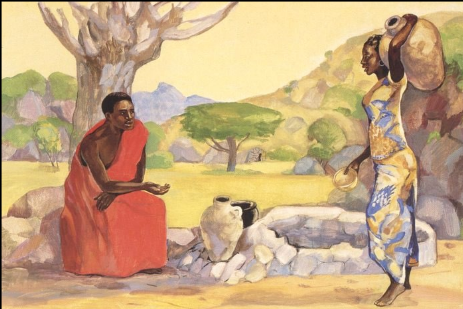
Jesus and the Woman at the Well -- JESUS MAFA, Cameroon