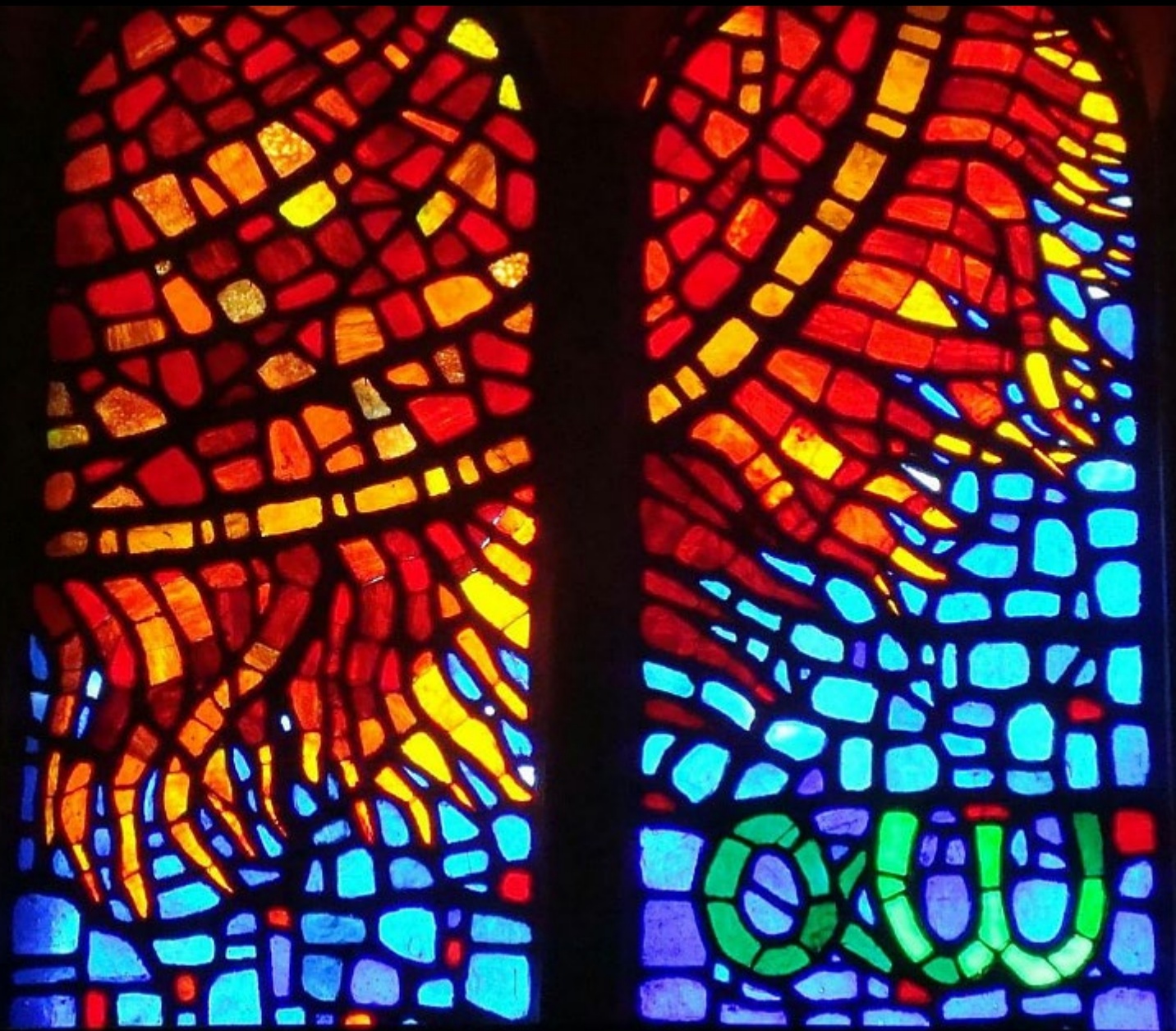
Alpha and Omega -- Saints Kings Church, Mexico City, Mexico