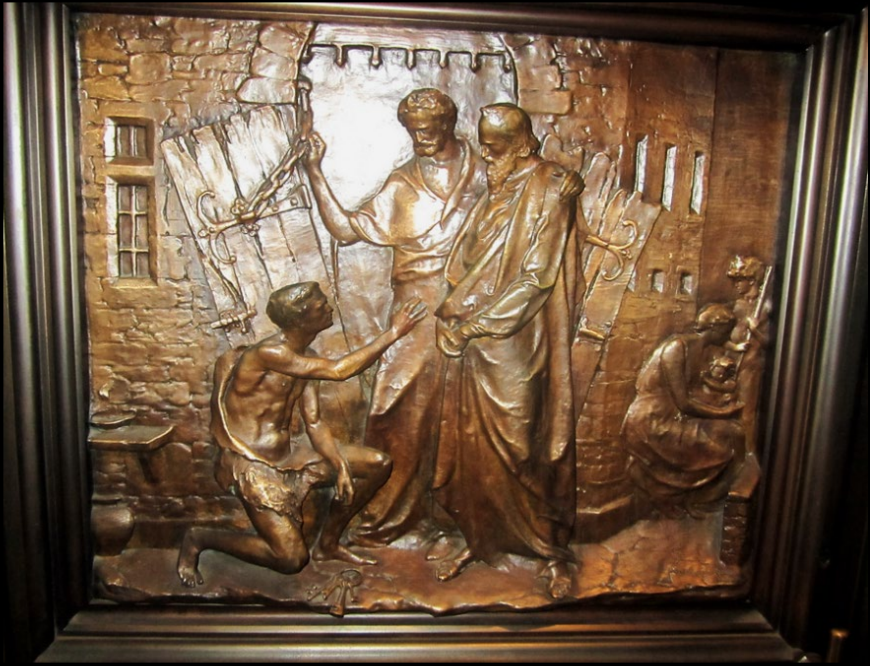
The Jailer, Paul, Silas, and the Jailer's Family -- Bronze doors, Trinity Church, New York, NY