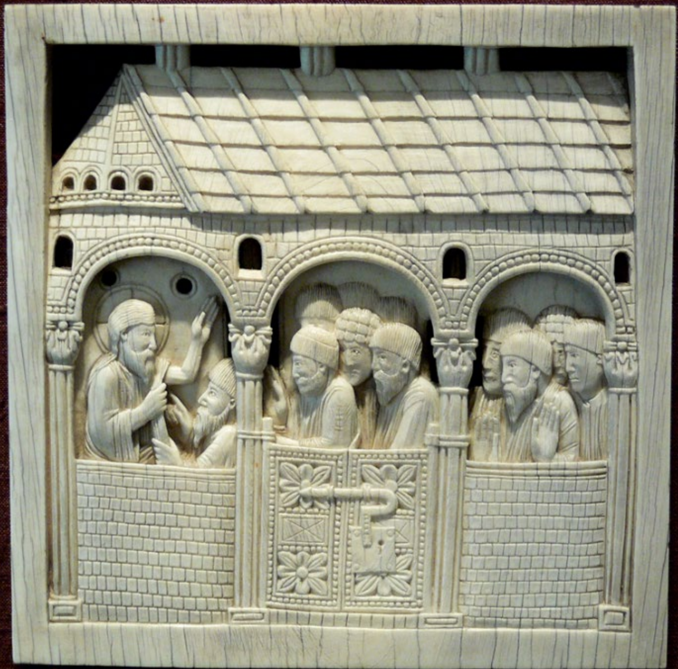
Christ Appearing to His Disciples

Bavarian National Museum, Munich, Germany