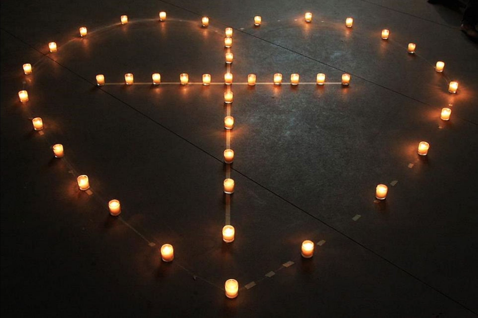
God is Love -- Camp Tejas, Giddings, Texas