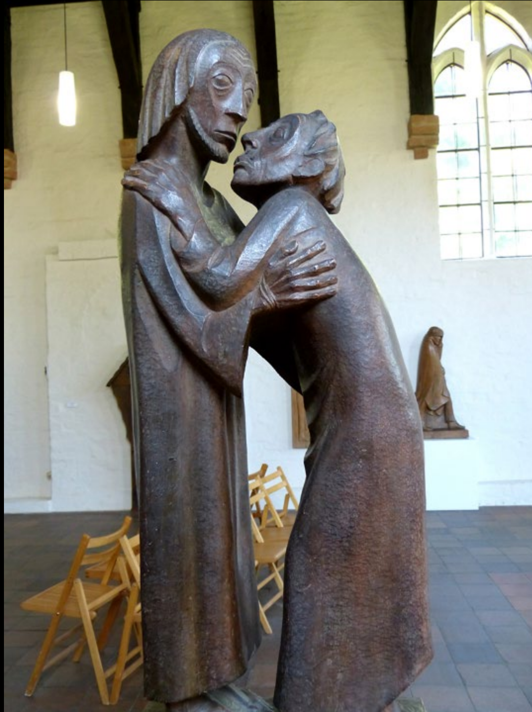
Reunion Ernst Barlach St. Gertrude's Chapel, Gustrow, Germany