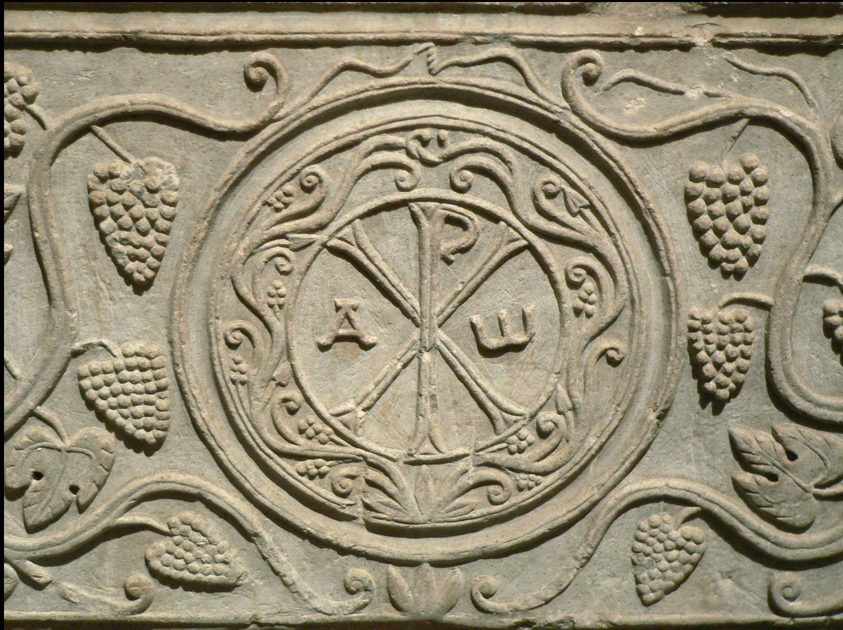
Sarcophagus of Drausin -- Louvre, Paris, France