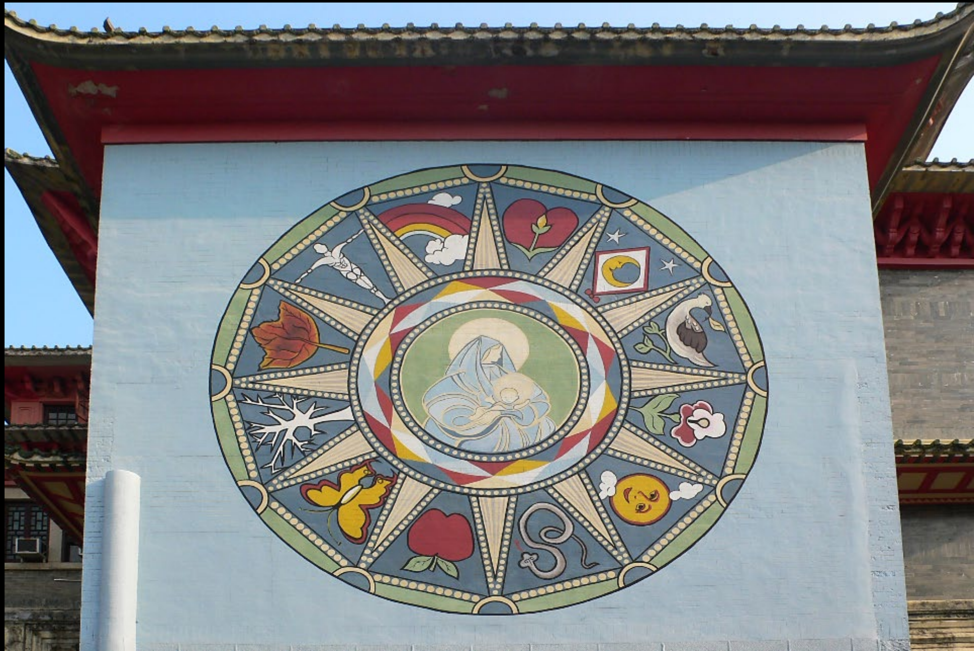
Holy Spirit -- Holy Spirit Seminary, Hong Kong, China