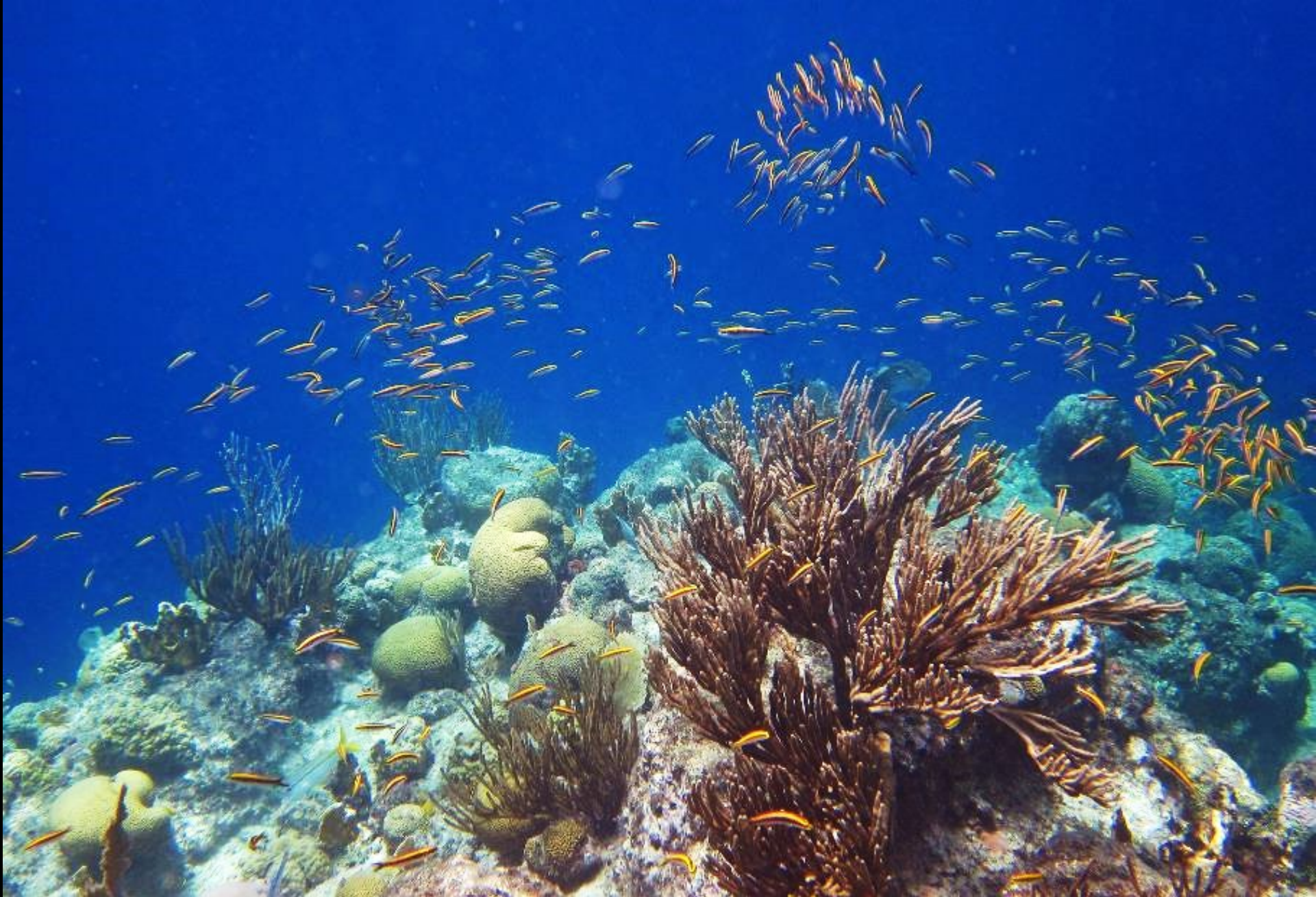
Coral Reef near Curacao