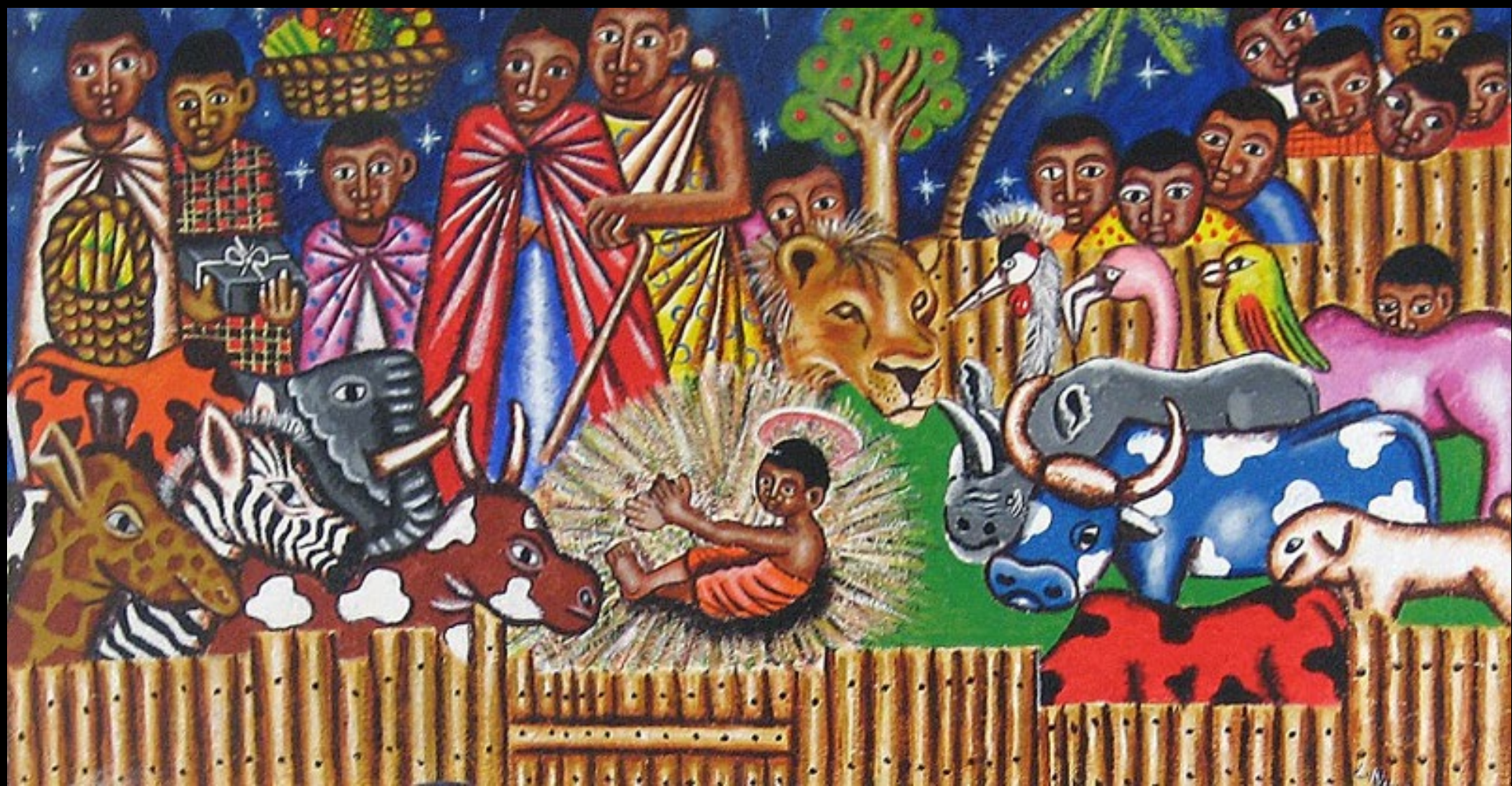
Kenyan Nativity, 2007