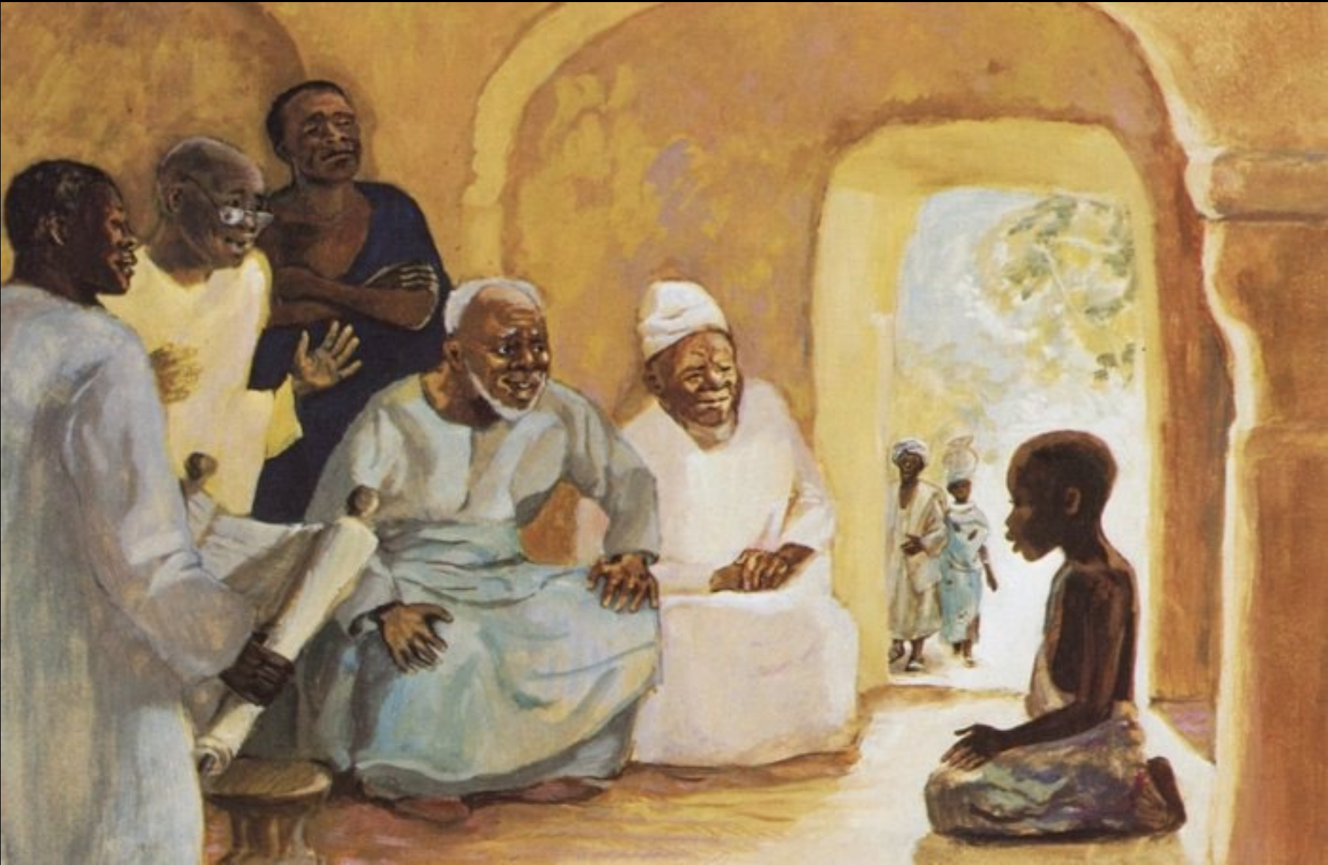
Christ Child Teaching in the Temple -- JESUS MAFA, Cameroon