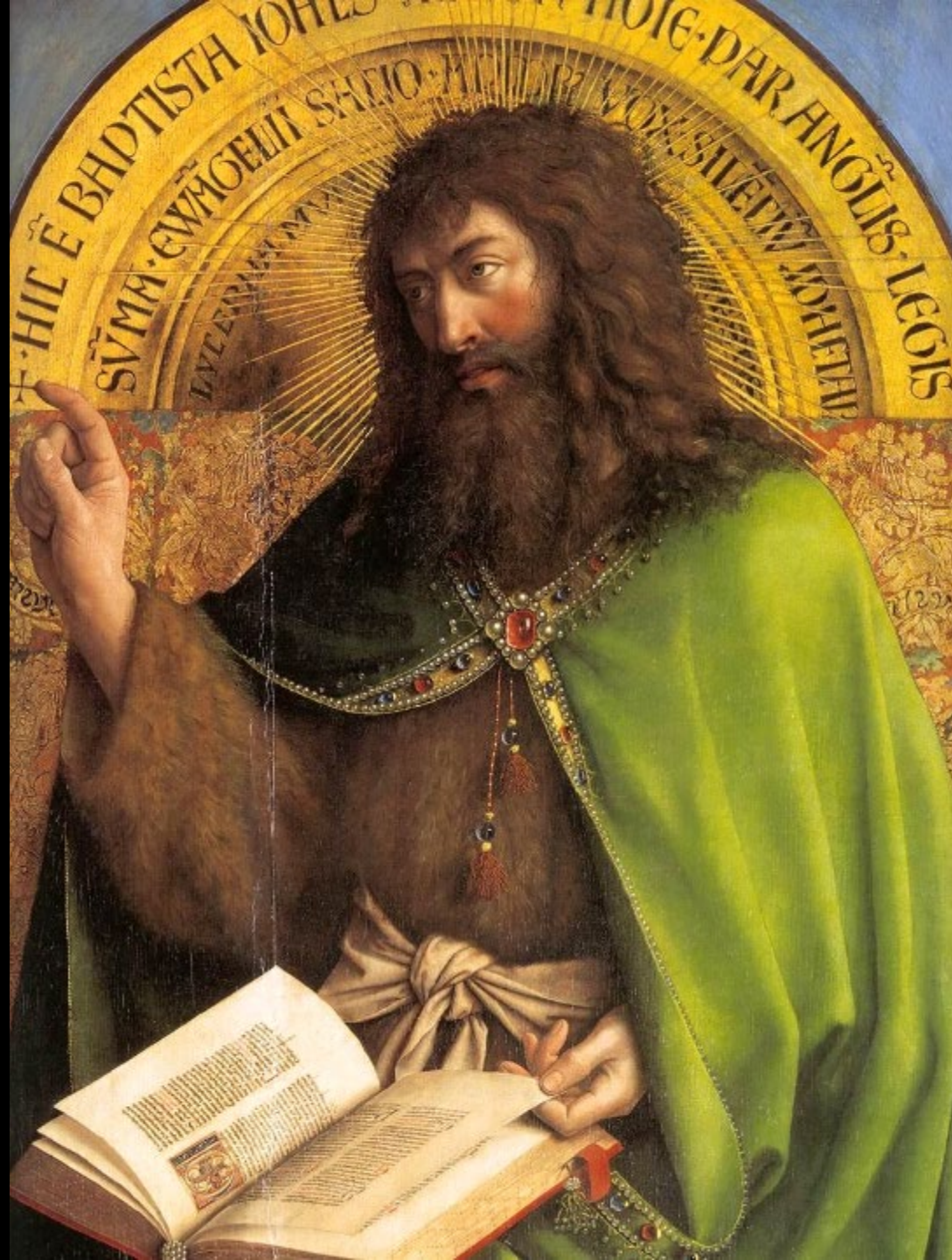
John the Baptist Jan van Eyck Ghent Altarpiece St. Bavo Cathedral Ghent, Belgium