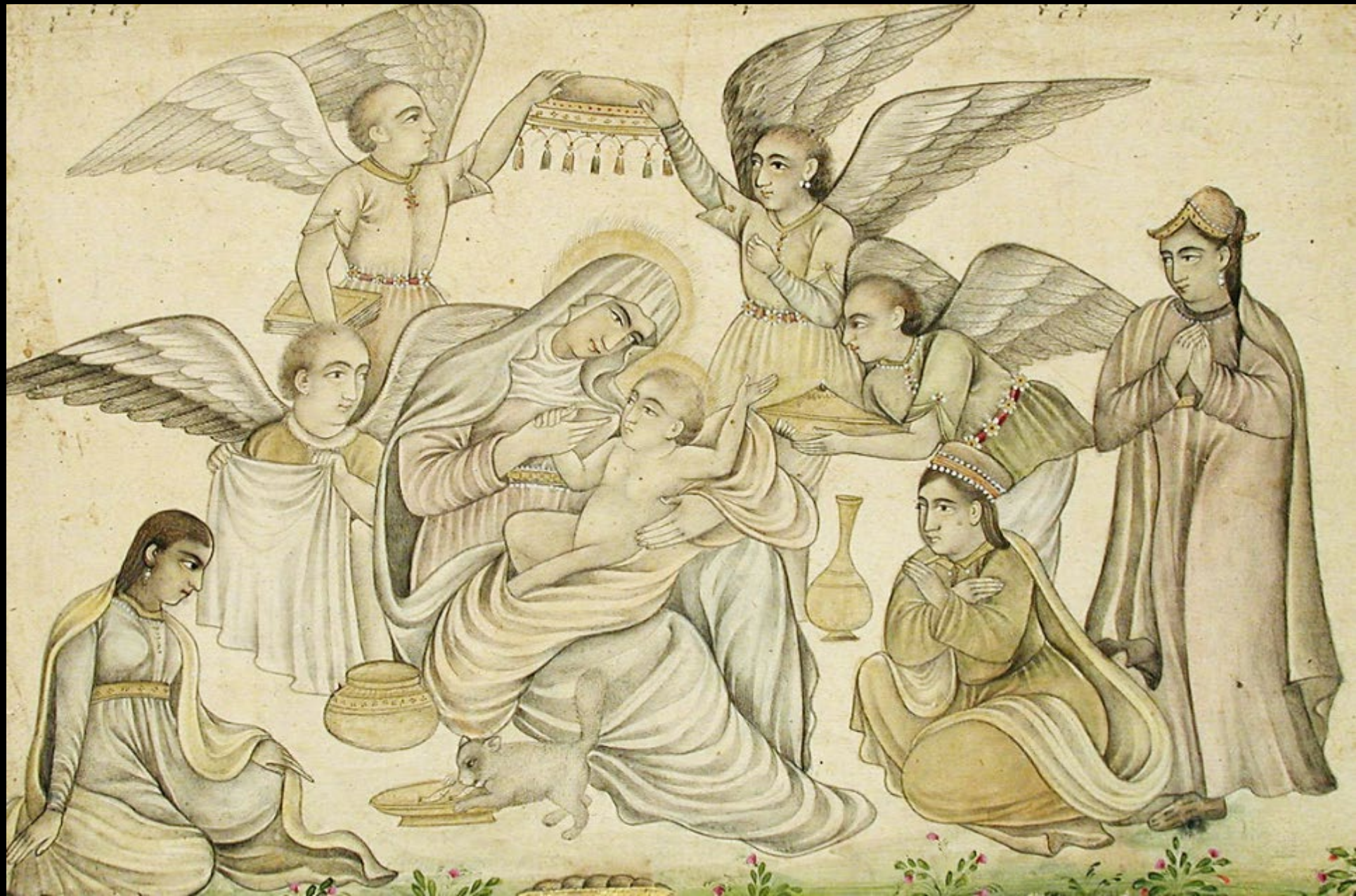
Angels Attend Mary and Jesus -- India, c. 1665, San Diego Museum of Art, San Diego, CA