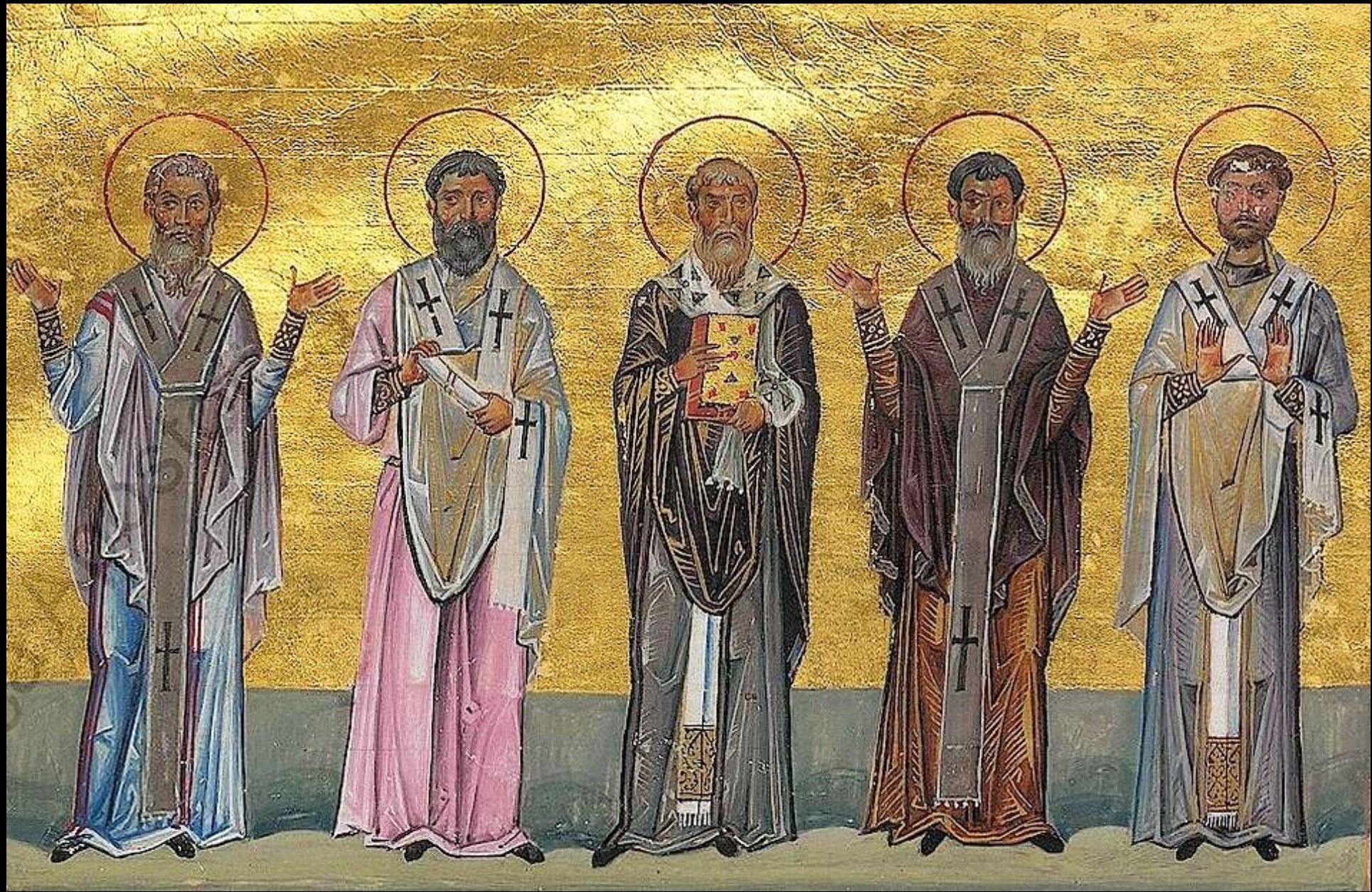
Patrobulus, Hermas, Linus, Caius, and Philologus of the 70 Disciples from the Menologion of Basil II