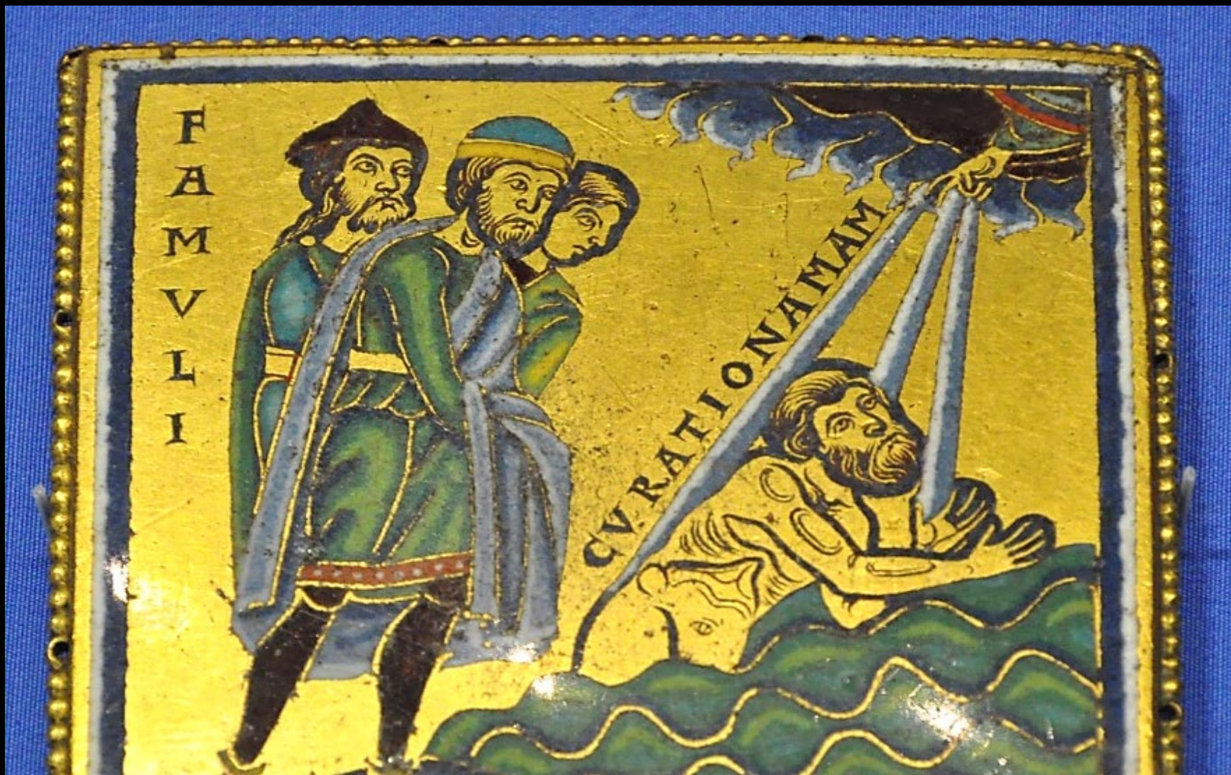
Naaman Bathing in the Jordan -- champlevé enamel, c. 1150, British Museum, London, England