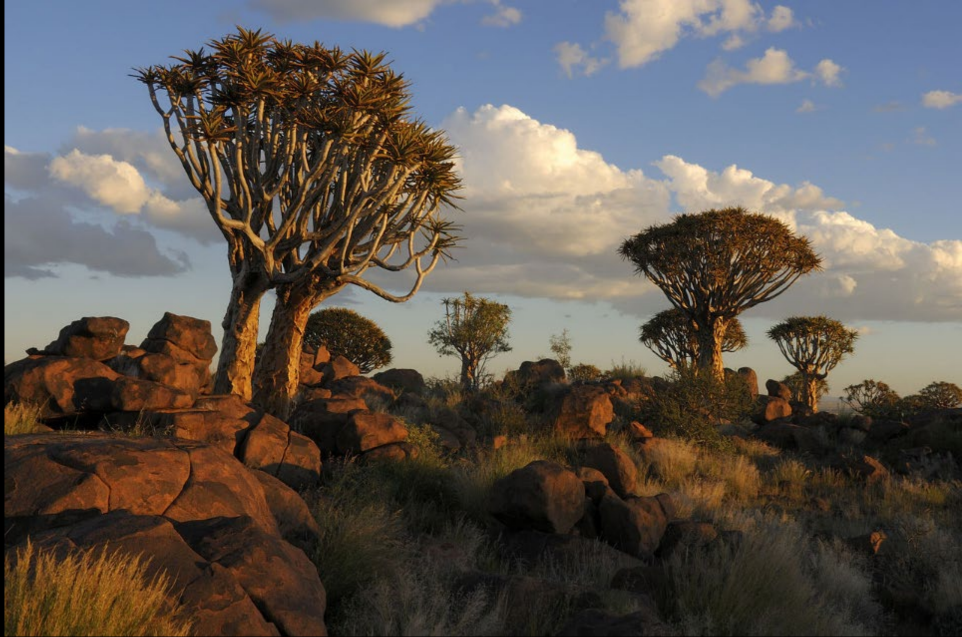
Quiver Tree Forest near Keetmanshoop, Namibia, in the evening