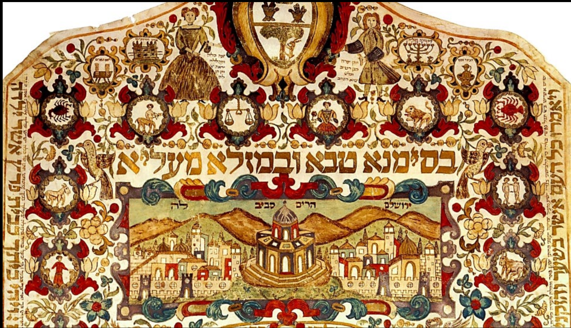
Marriage contract with a depiction of Jerusalem -- Israel Museum, Jerusalem