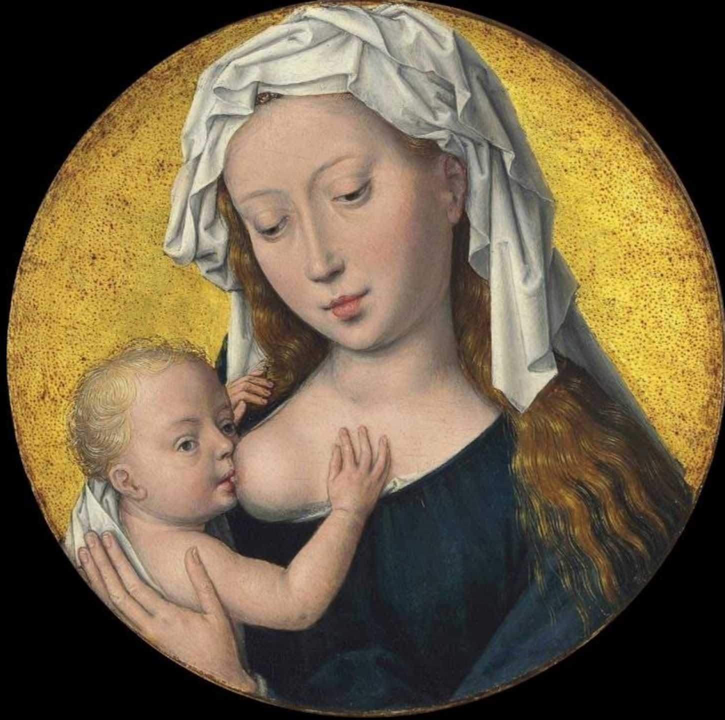
Madonna Lactans, or the Nursing Madonna