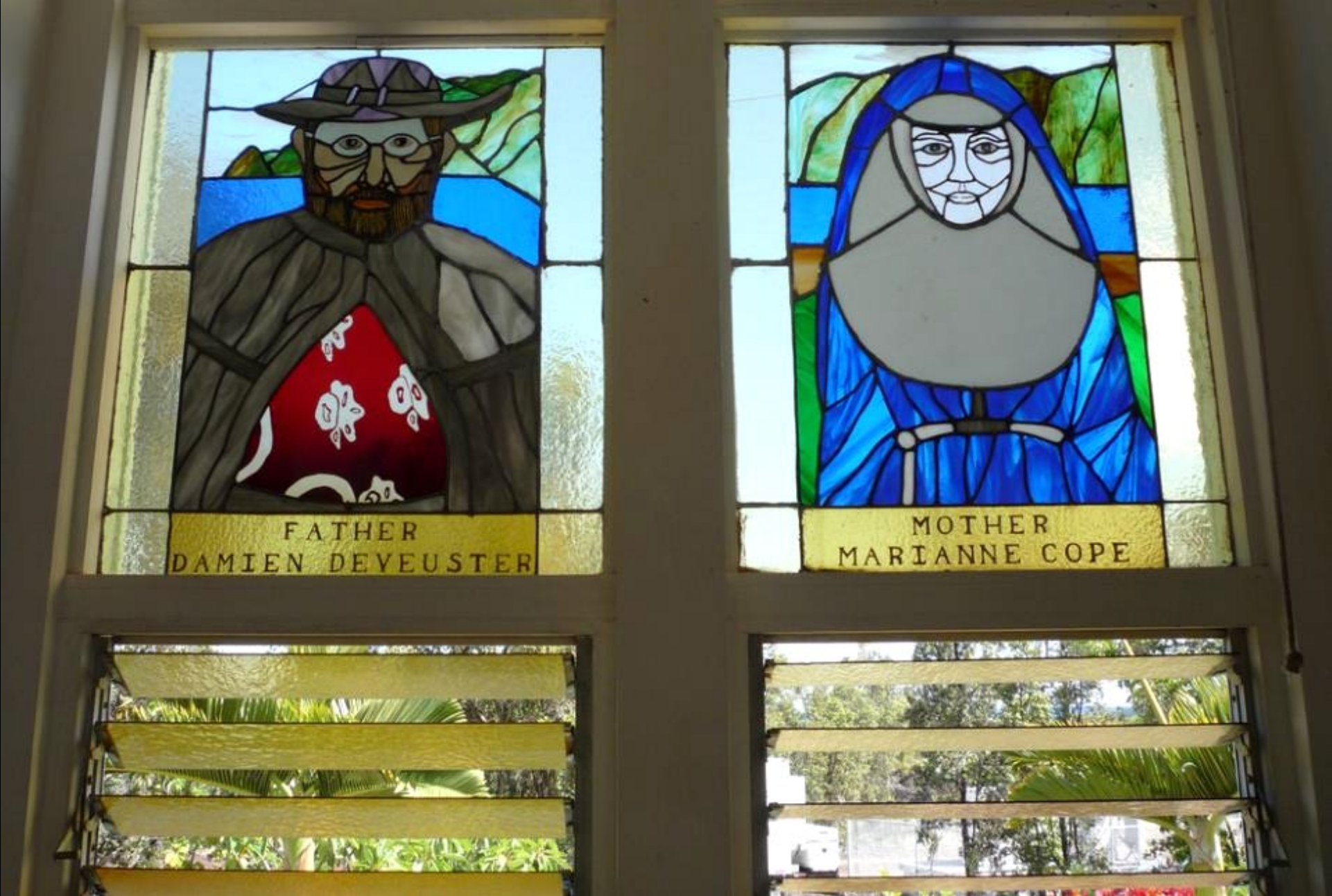
Father Damien and Mother Marianne, caregivers for Hansen's Disease sufferers, Kalaupapa, HI