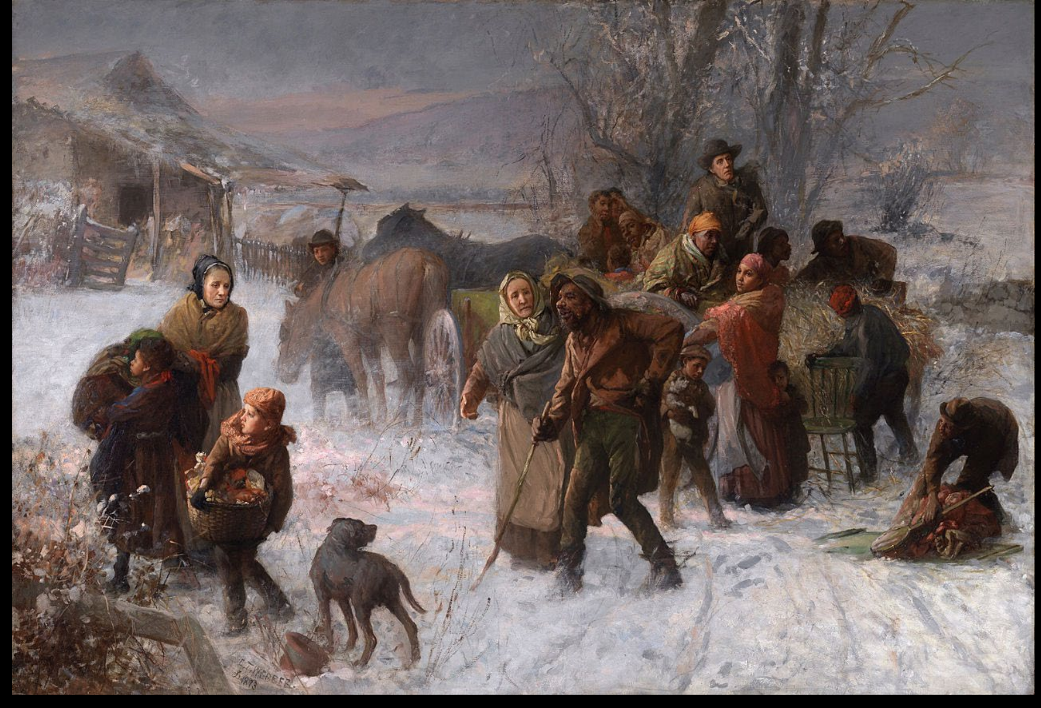
Underground Railroad -- Charles Webber, Cincinnati Art Museum, Cincinnati, OH