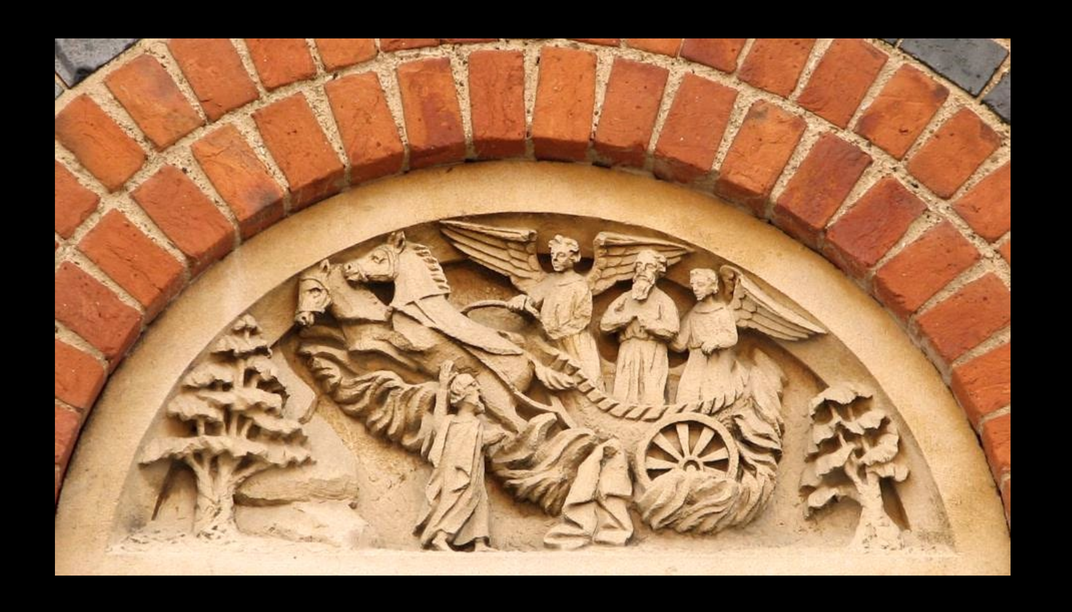
Elijah and Elisha -- Tympanum of Home on Walton Well Road, Oxford, England