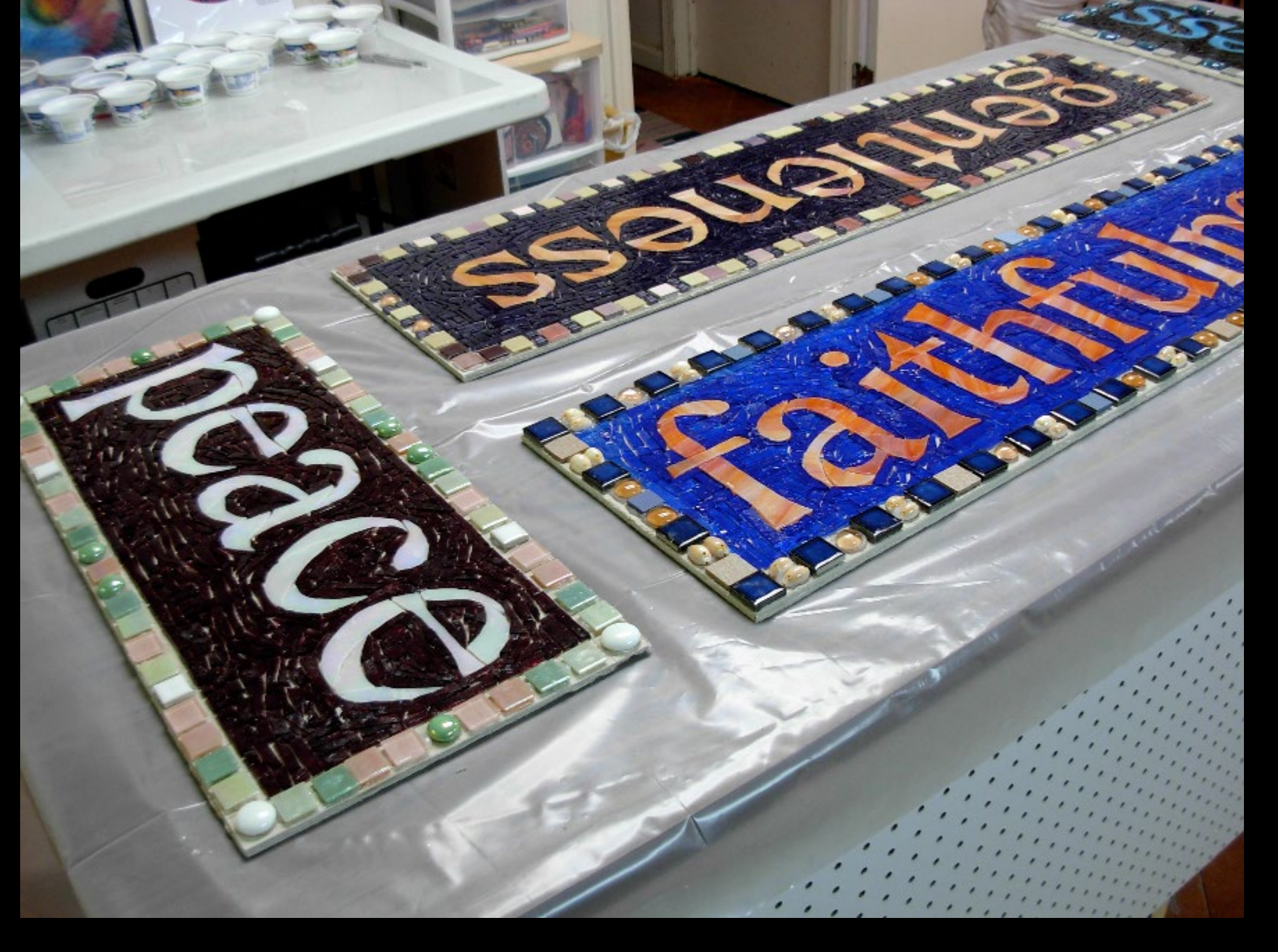
Ready to grout – Fruit of the Spirit mosaic commission -- Suzanne Halstead