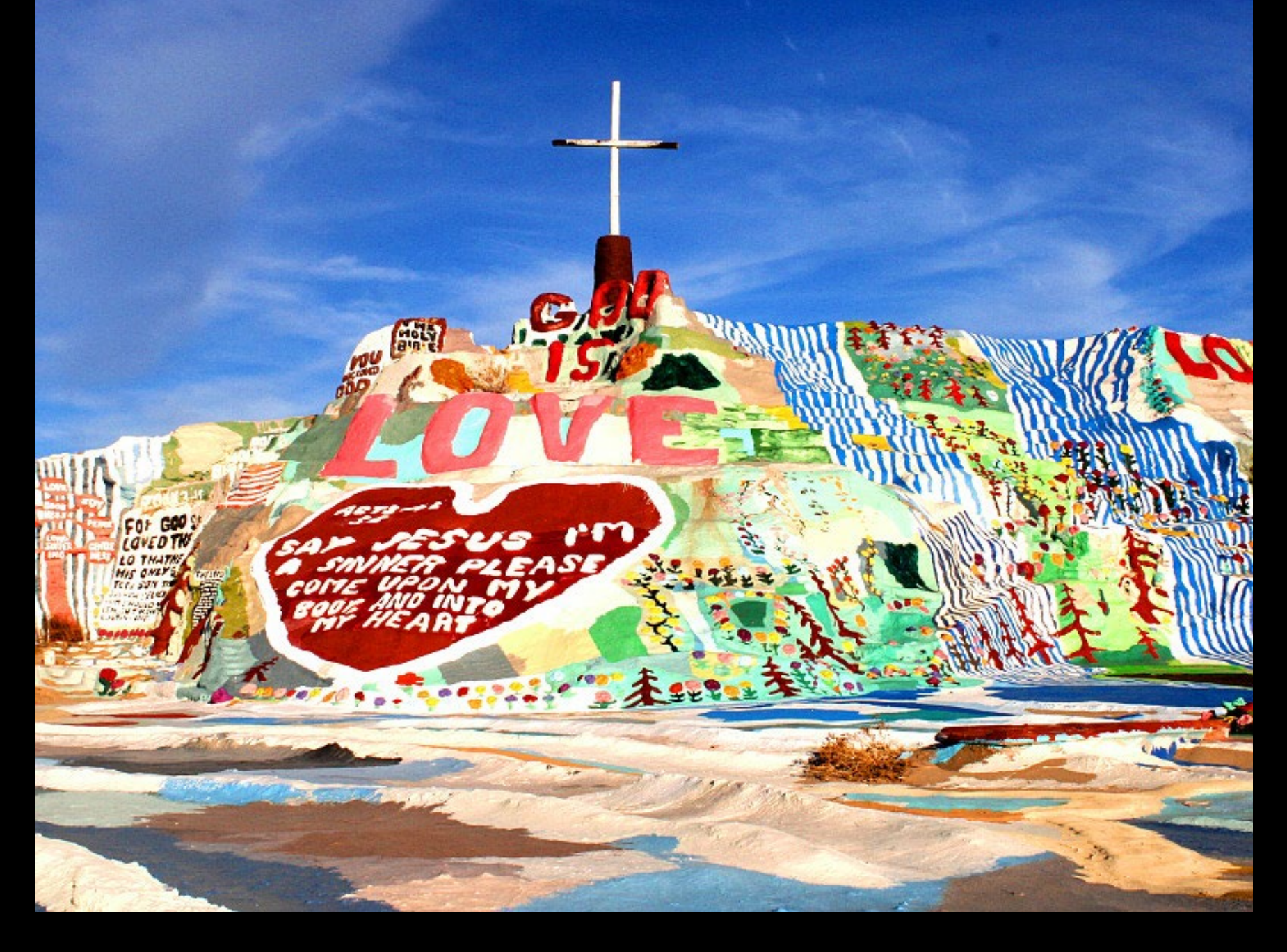
Salvation Mountain -- Leonard Knight, Imperial County, CA