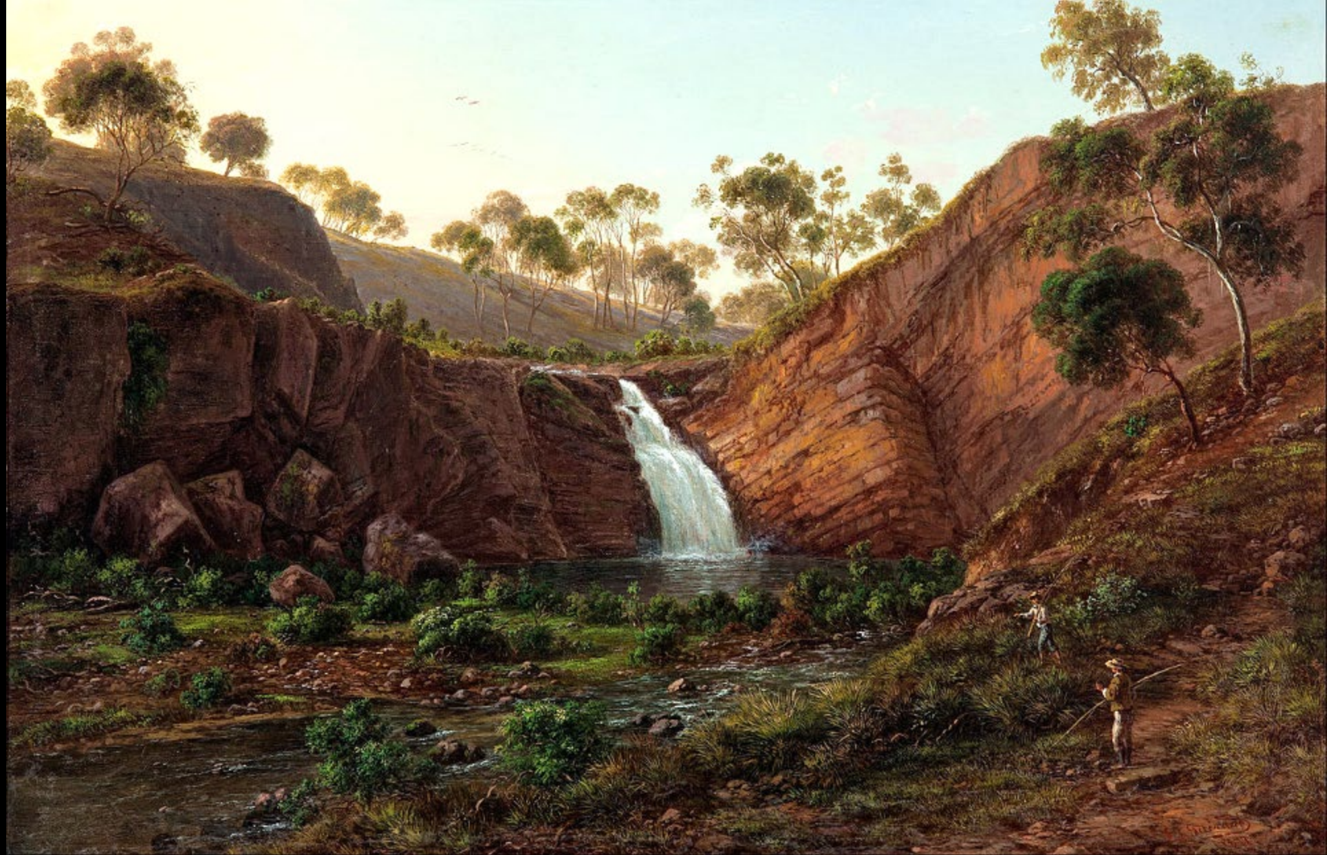
Waterfall on the Clyde River, Tasmania -- Eugene von Guerard, Art Gallery of South Australia, Adelaide