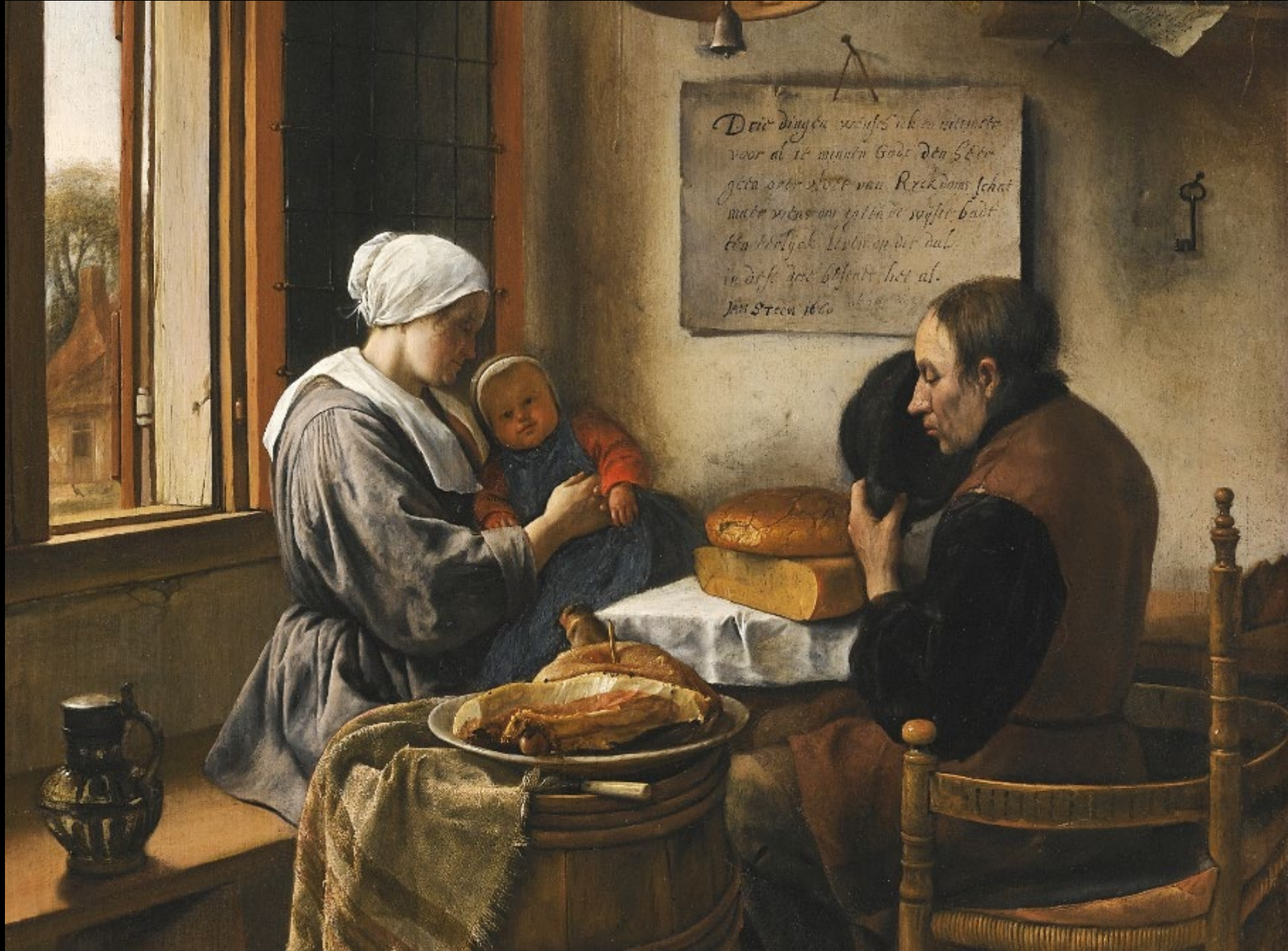
The Prayer Before the Meal -- Jan Steen, 1660