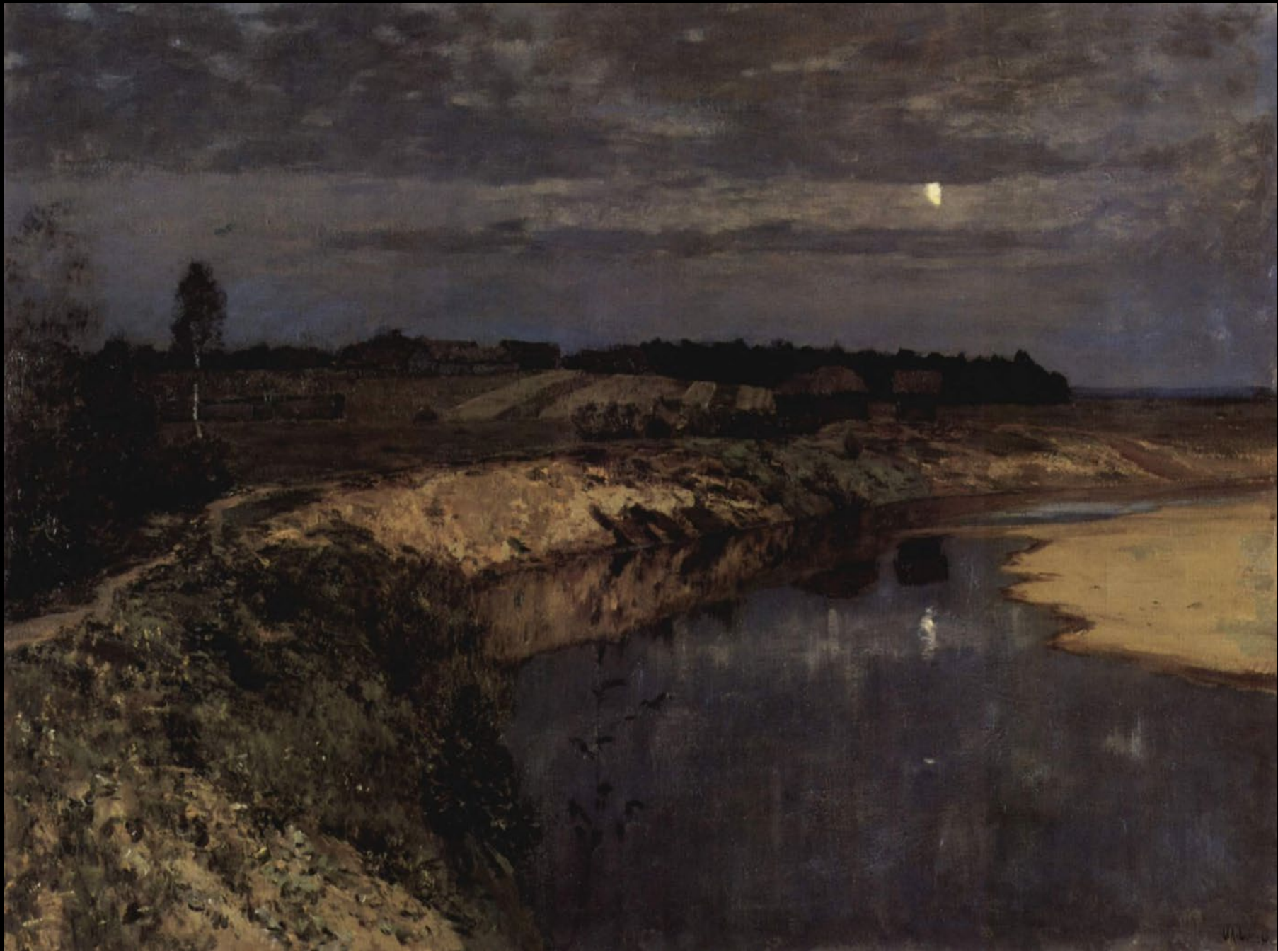
Silence -- Isaac Levitan, State Russian Museum, St. Petersburg