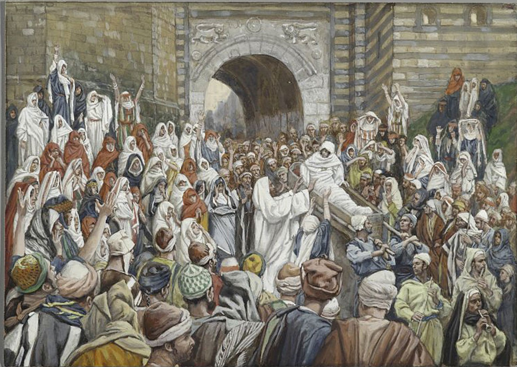
Raising of the Son of the Widow of Nain, James Tissot, ca. 1886-1894