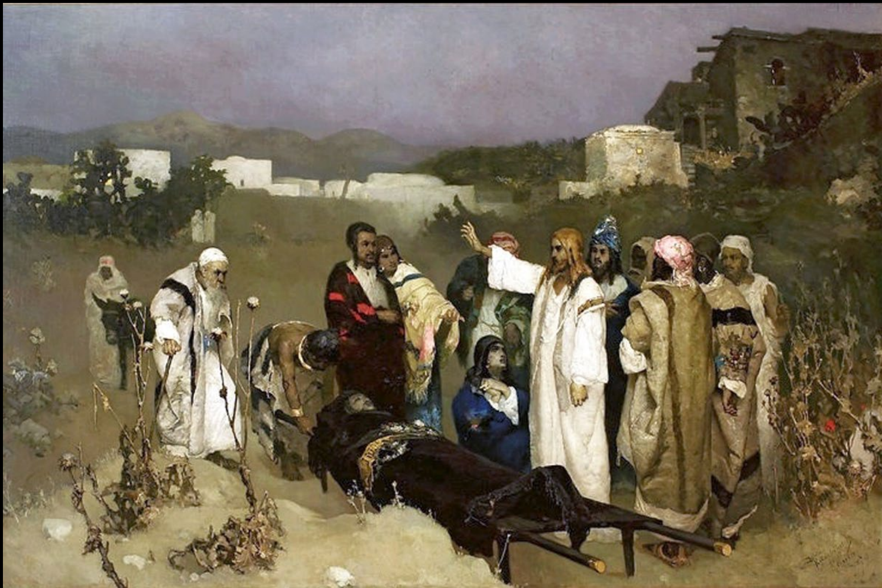
Raising of the Son of the Widow of Nain Wilhelm Kotarbiński, 1879