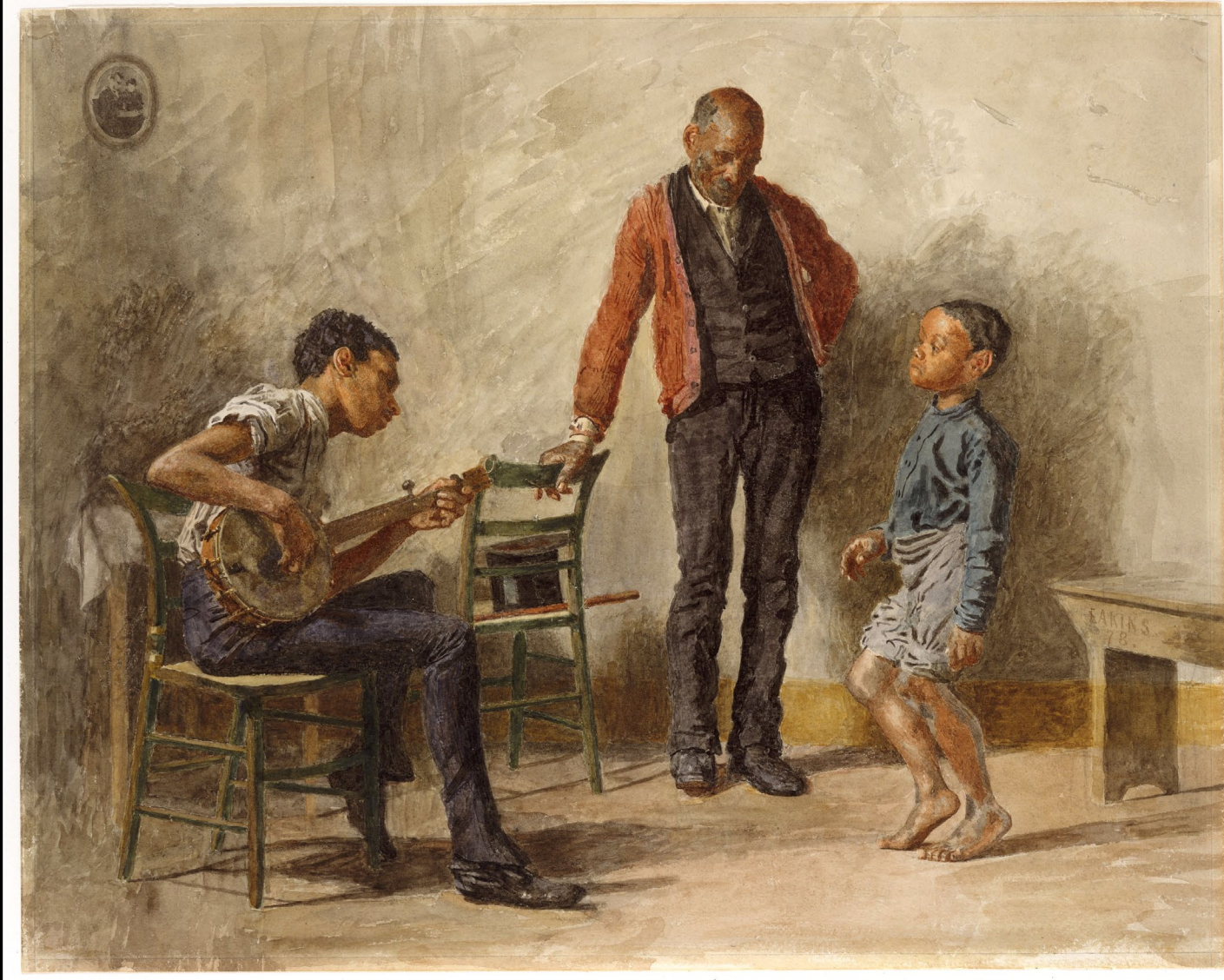
Dancing Lesson Thomas Eakins, 1878