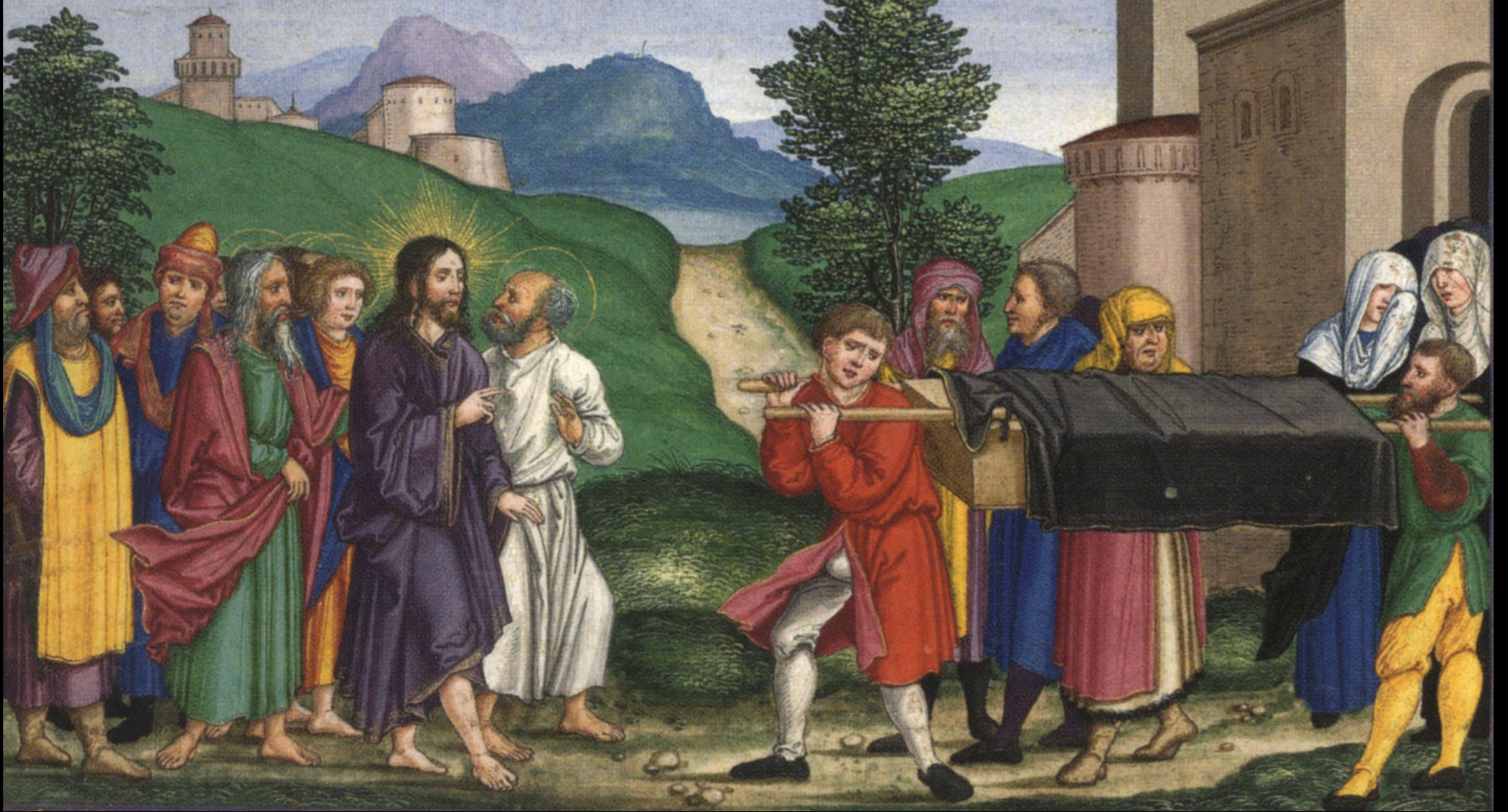
Raising of the Son of the Widow of Nain, Matthias Gerung, from the Ottheinrich Bible, ca. 1530-1532