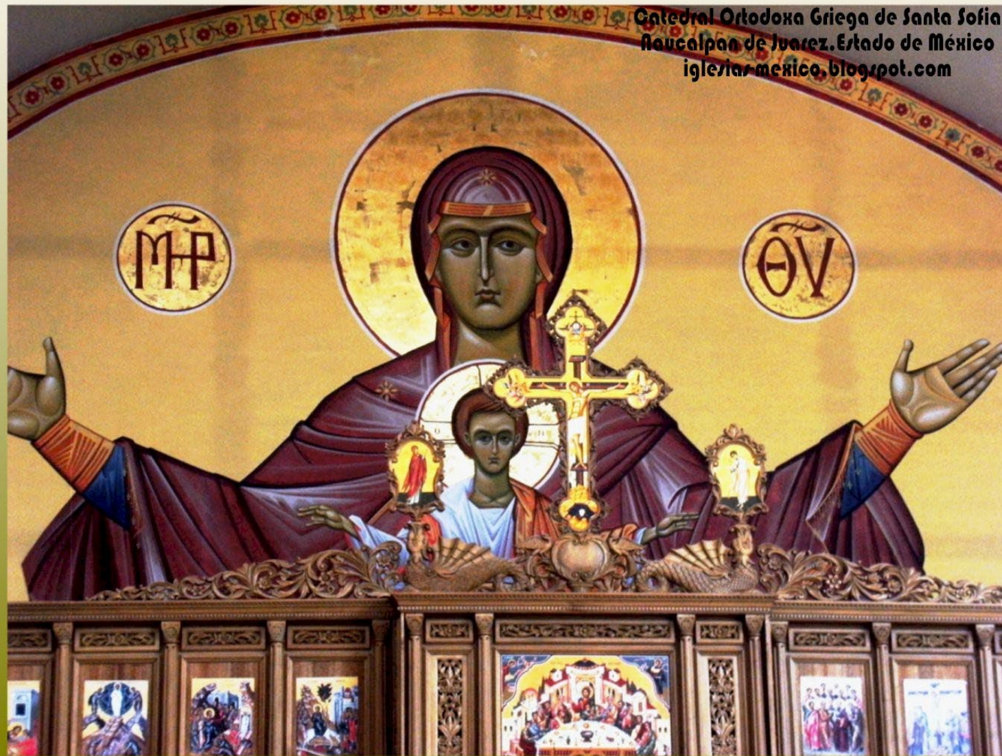
Iglesia Ortodoxa Griega, icon, Naucalpan, Mexico

Catedral Ortodoxa Griega de Santa Sofía Naucalpan de Juárez, Estado de México iglesia.mexico.blogspot.com