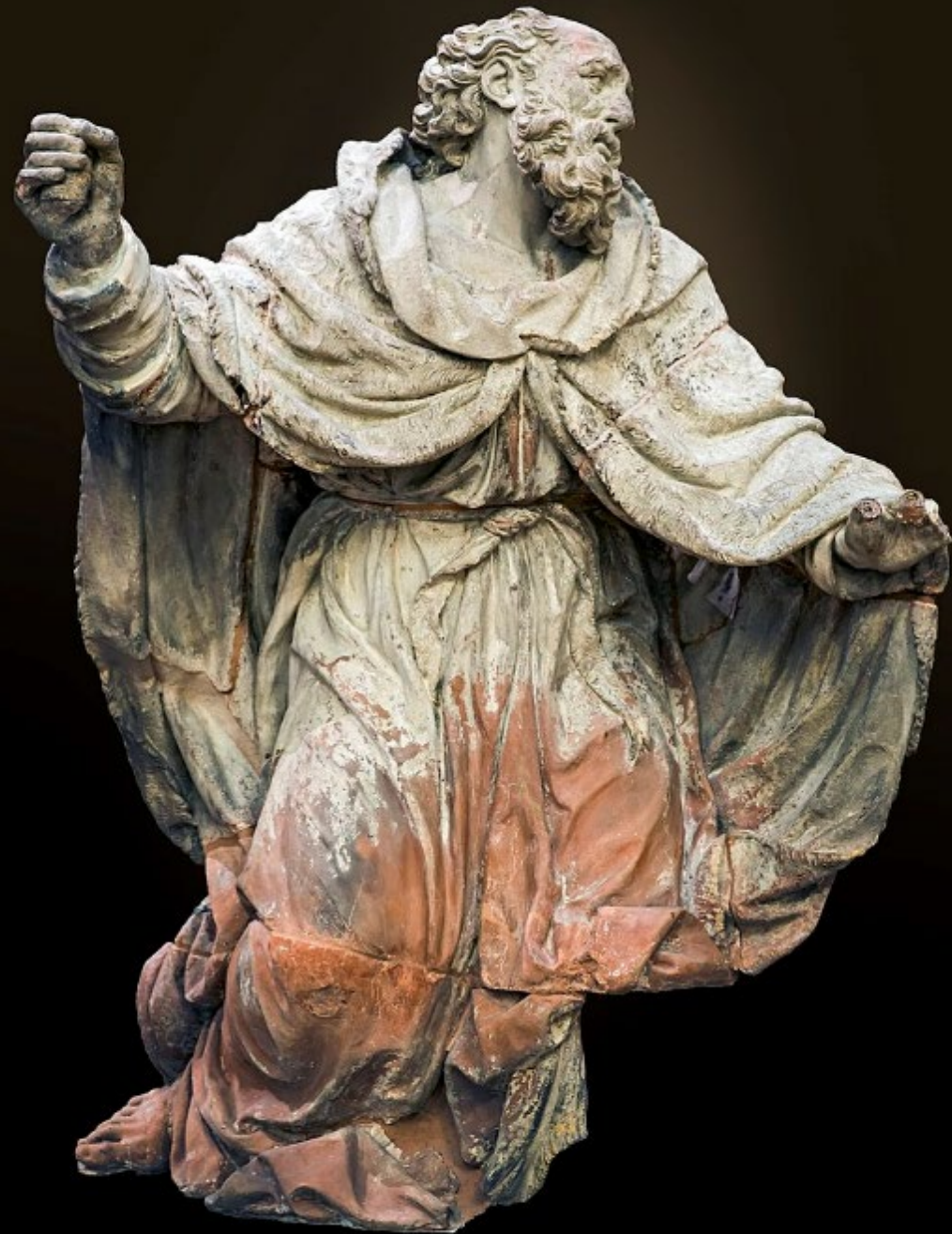
Prophet Elijah on Mount Carmel

Marc Arcis Musée des Augustins Toulouse, France