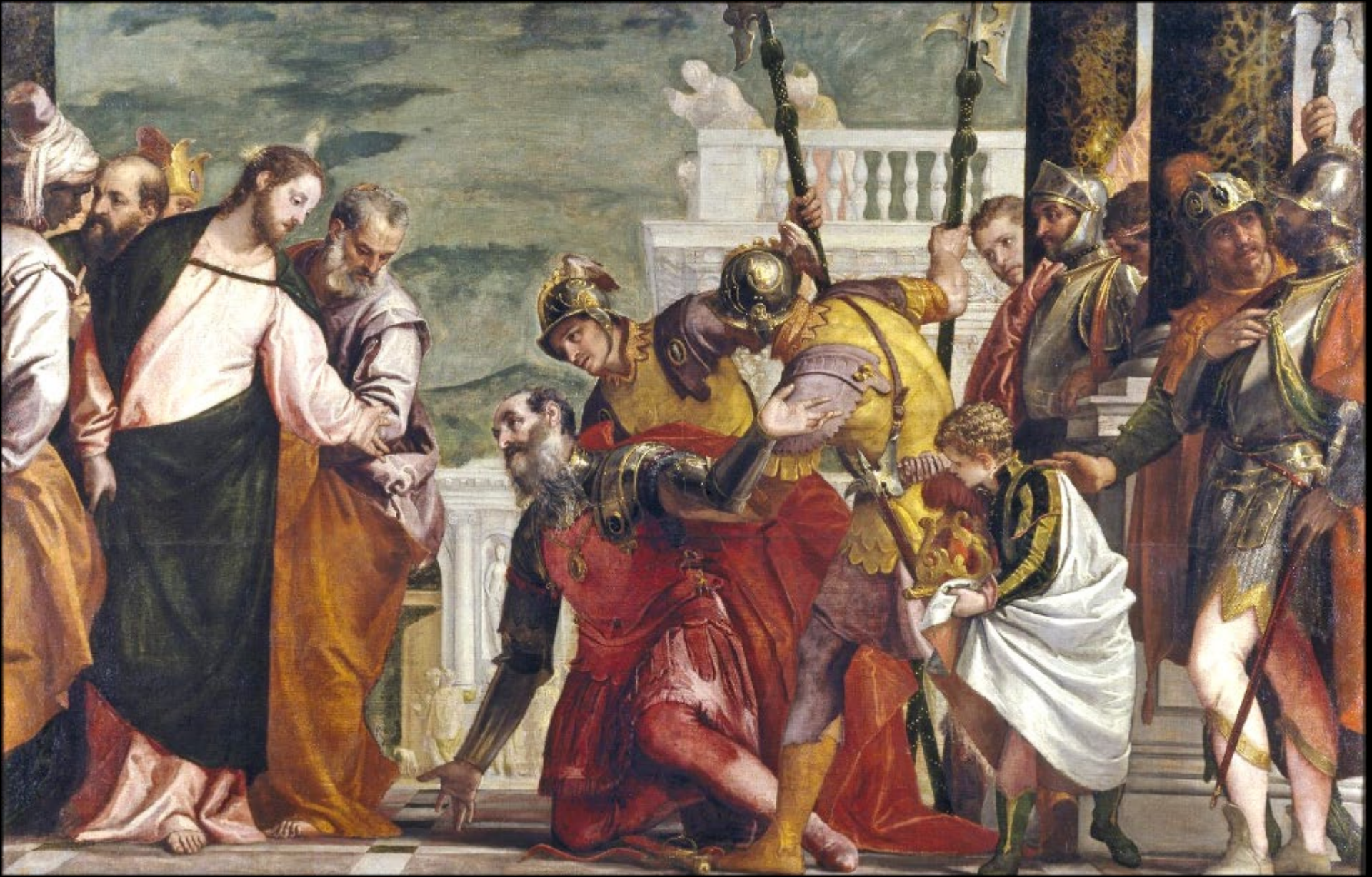
Jesus Heals the Centurion's Servant -- Paolo Veronese, Prado, Madrid, Spain