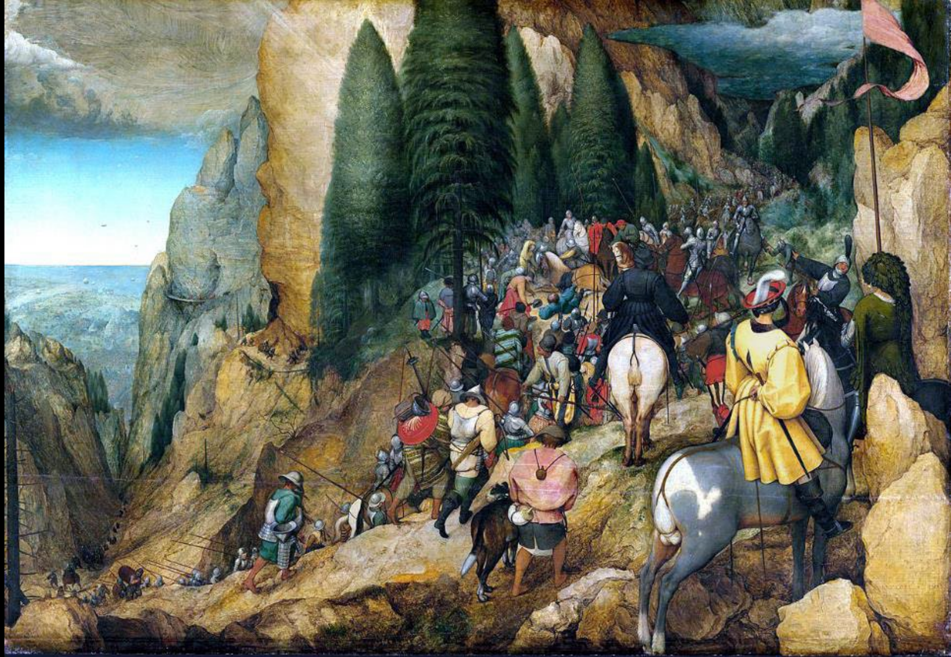
Conversion of Paul -- Pieter Bruegel the Elder, Kunsthistorische Museum, Vienna, Austria