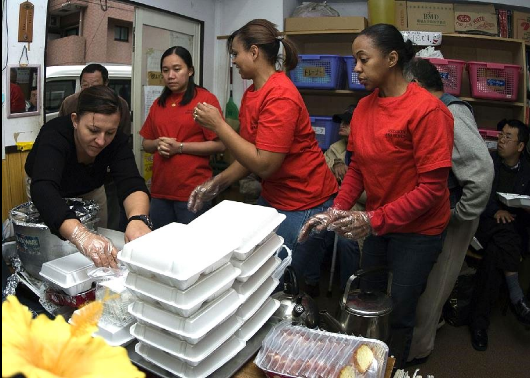
Preparing Meals for the Homeless -- U. S. Navy volunteers, Sanagi-tachi Shelter, Yokohama, Japan