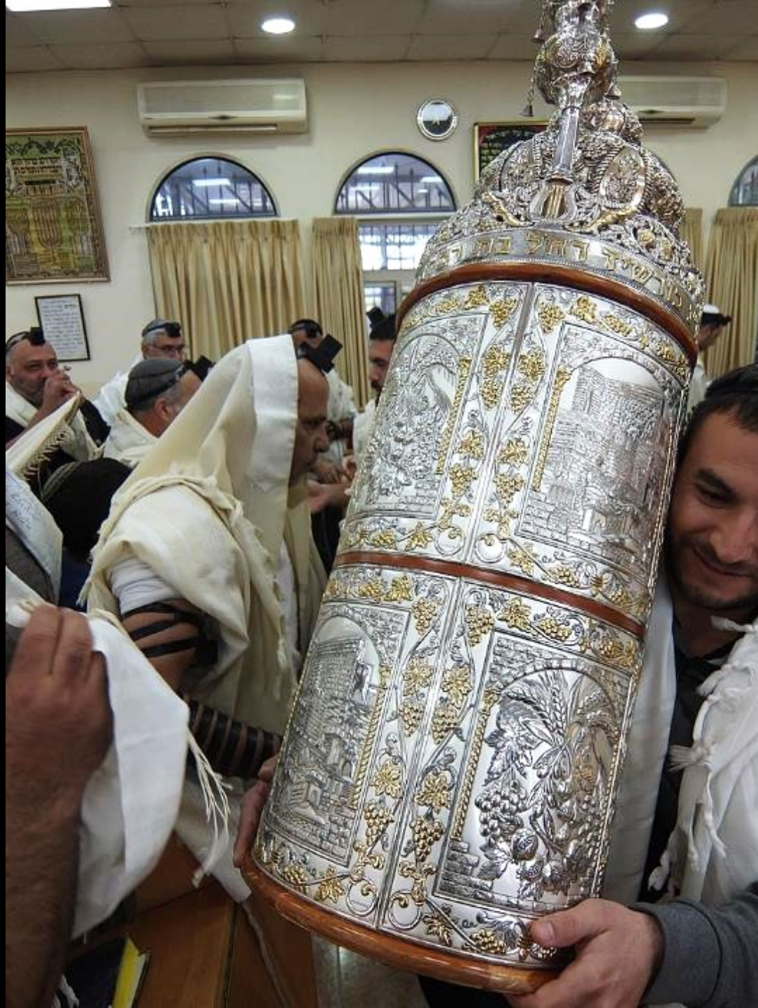
Silver and Gold Torah Case