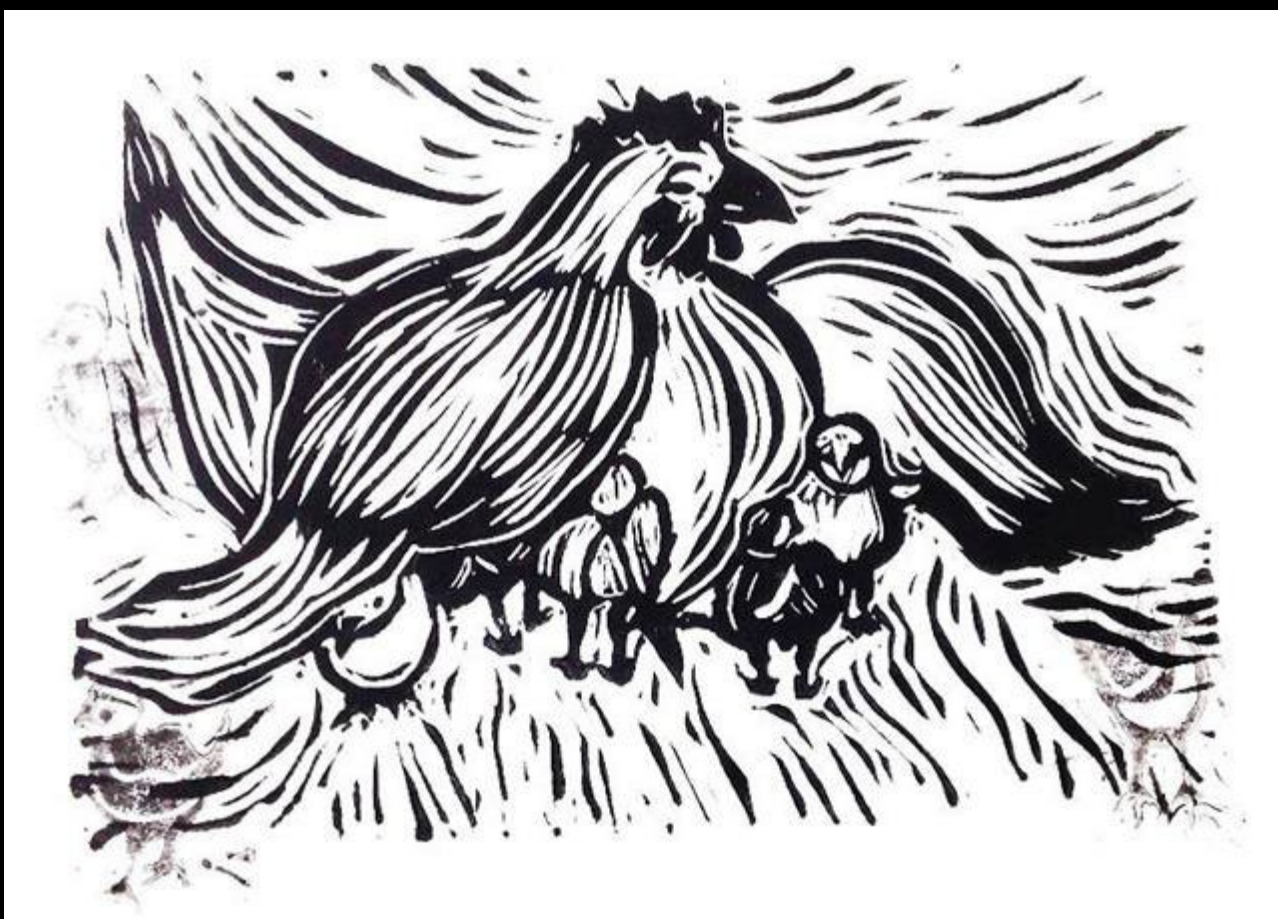
Hen Protecting Chicks -- Cara Hochhalter, liturgical artist