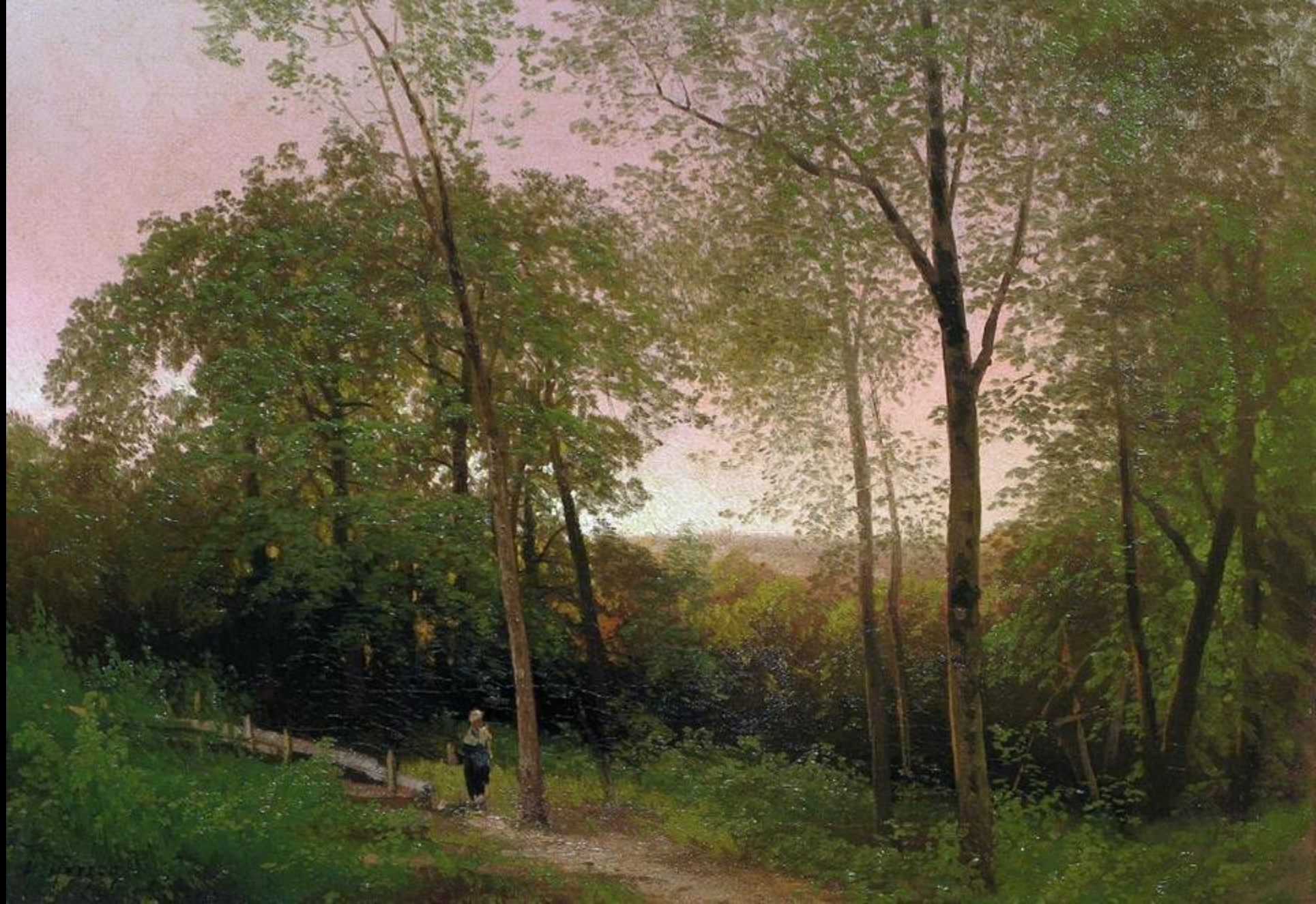
A Walk Along a Path at Sunset -- Hermann Herzog, Vose Galleries, Boston, MA