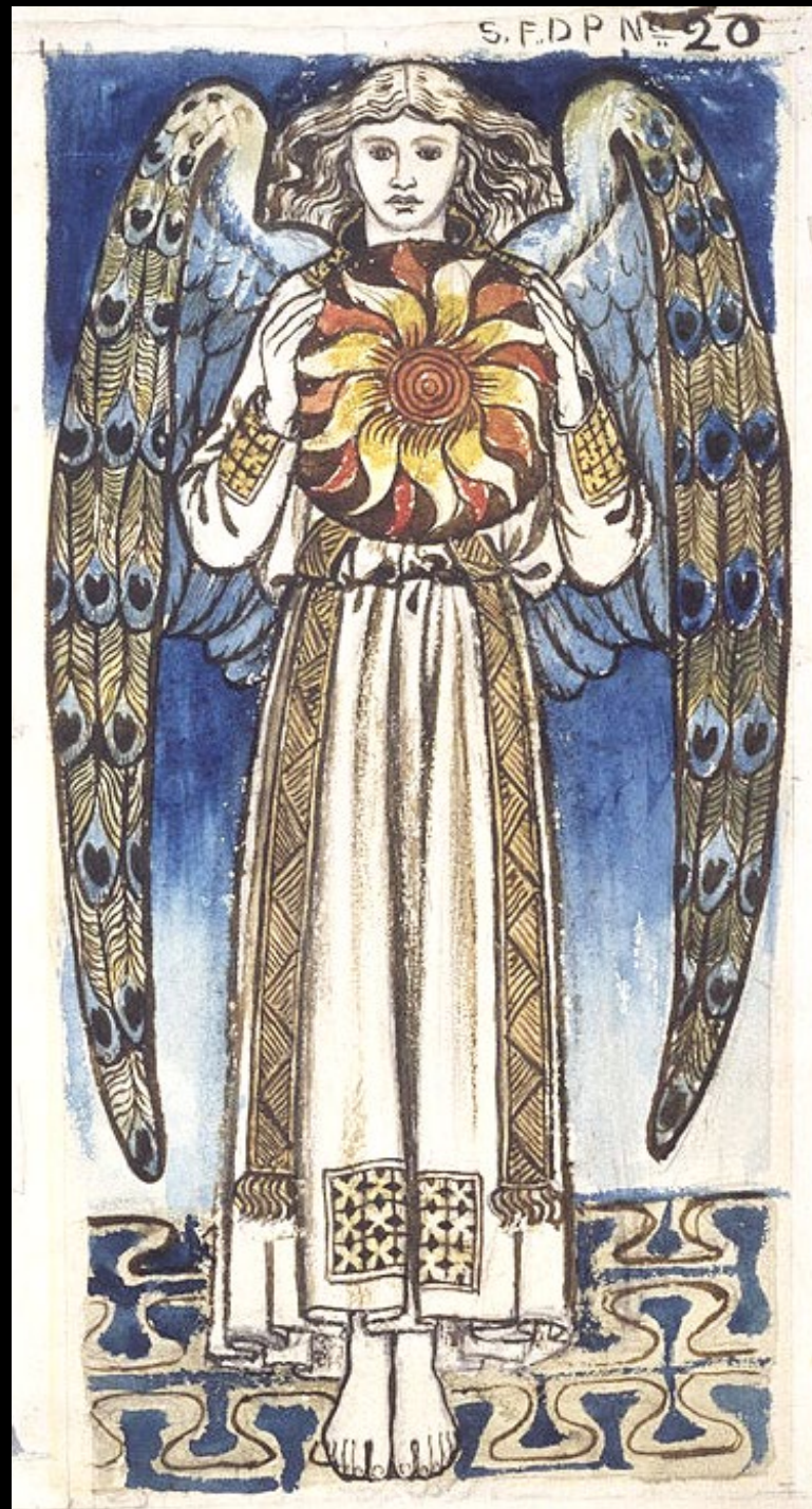
Day: Angel Holding the Sun

William Morris Museum of Fine Arts Houston, TX