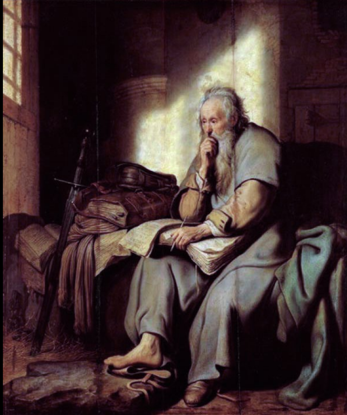
Paul in Prison Rembrandt Staatsgalerie Stuttgart Stuttgart, Germany