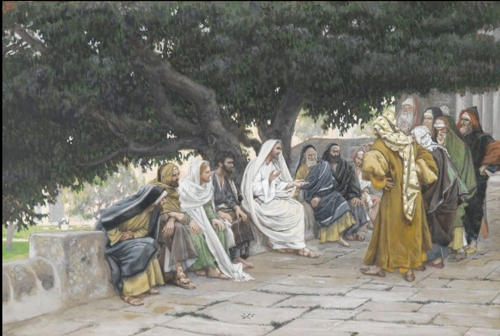
Pharisees and Sadducees Question Jesus -- James Tissot, Brooklyn Museum, New York, NY