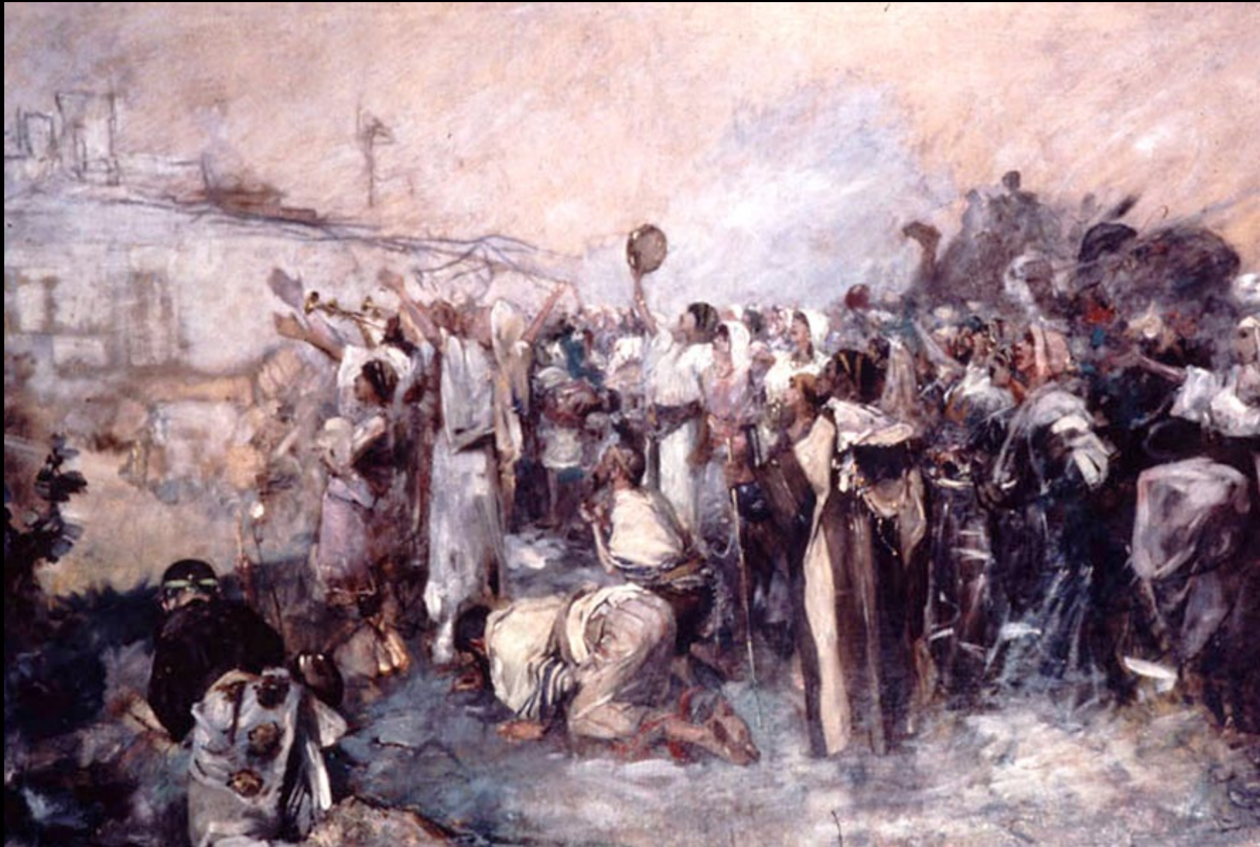
Miriam's Song after the Exodus from Egypt -- Samuel Hirszenberg, Yeshiva Museum, New York, NY