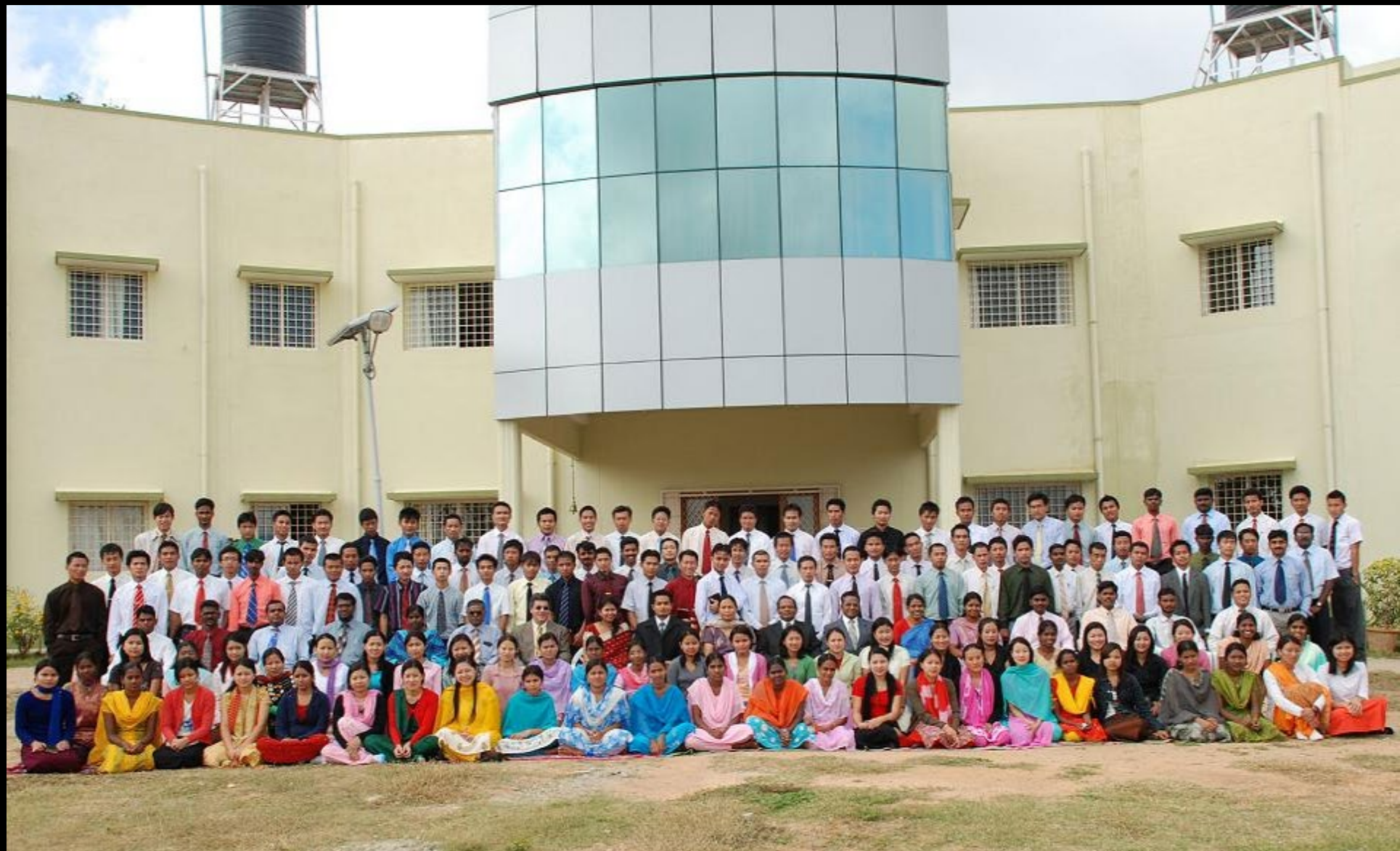
Maranatha Baptist Bible College and Seminary, Bangalore, India