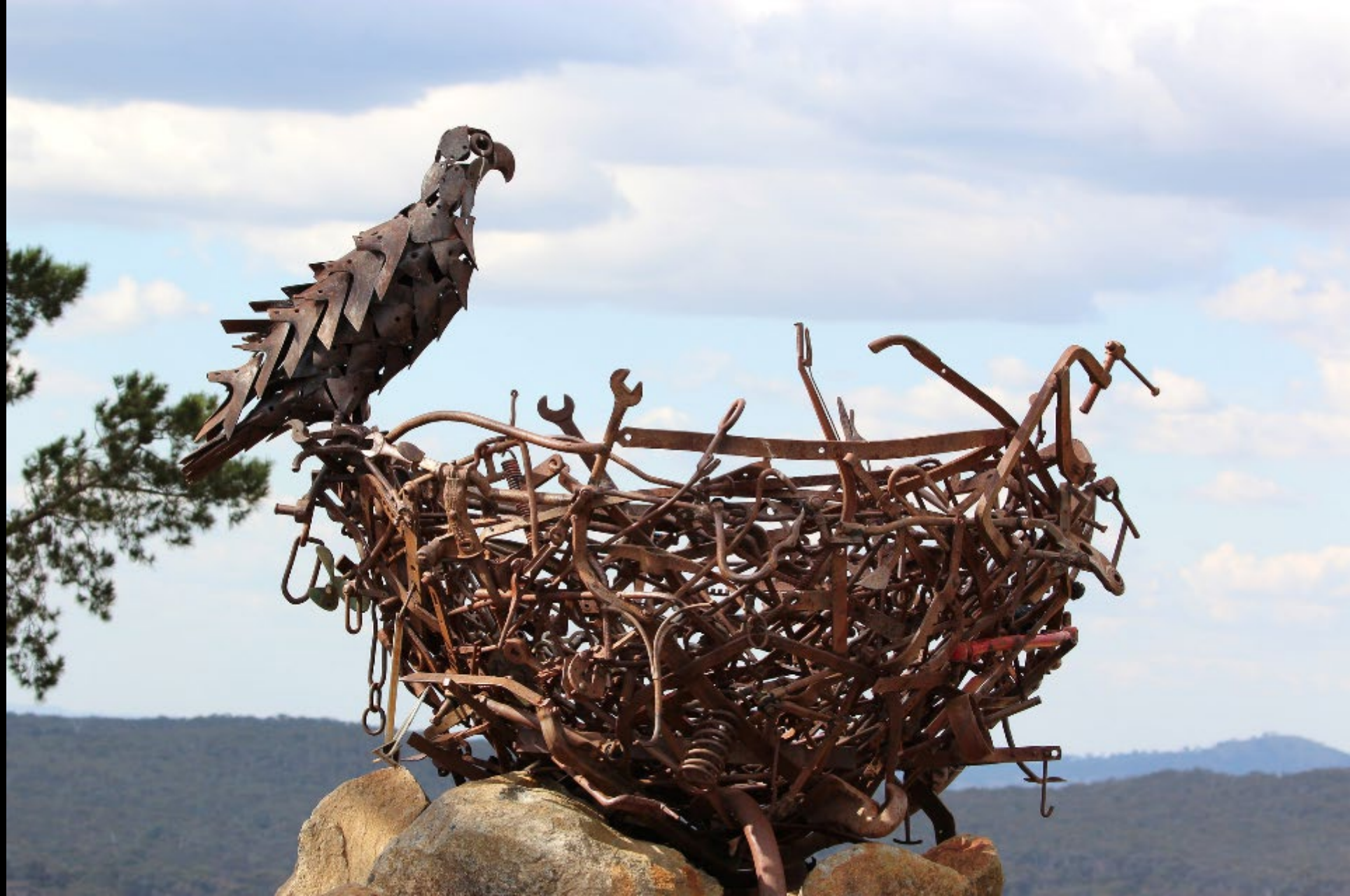
Eagle Protecting It's Nest -- National Arboretum, Canberra, Australia