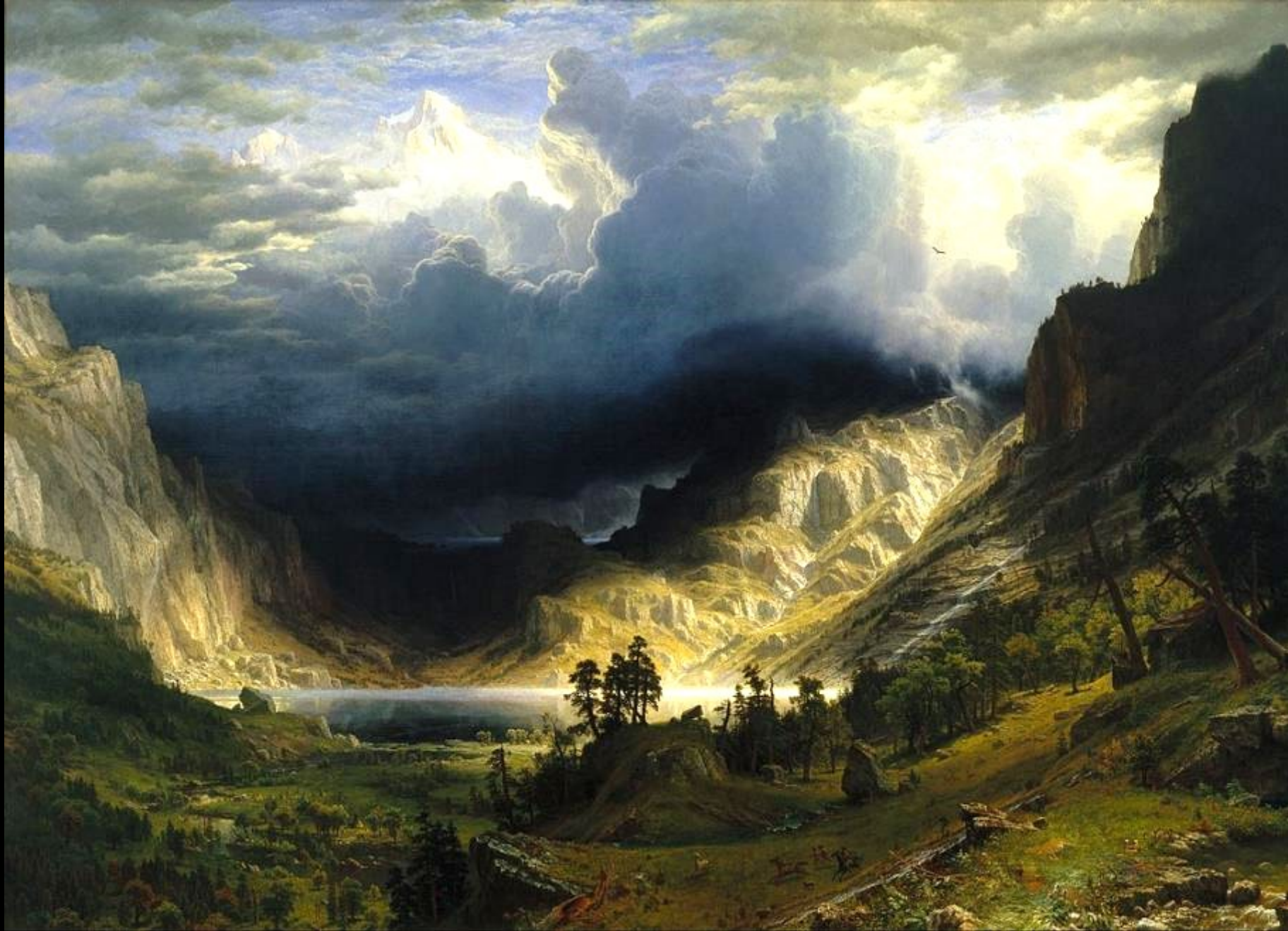
Storm in the Rocky Mountains -- Albert Bierstadt, Brooklyn Museum, New York, NY