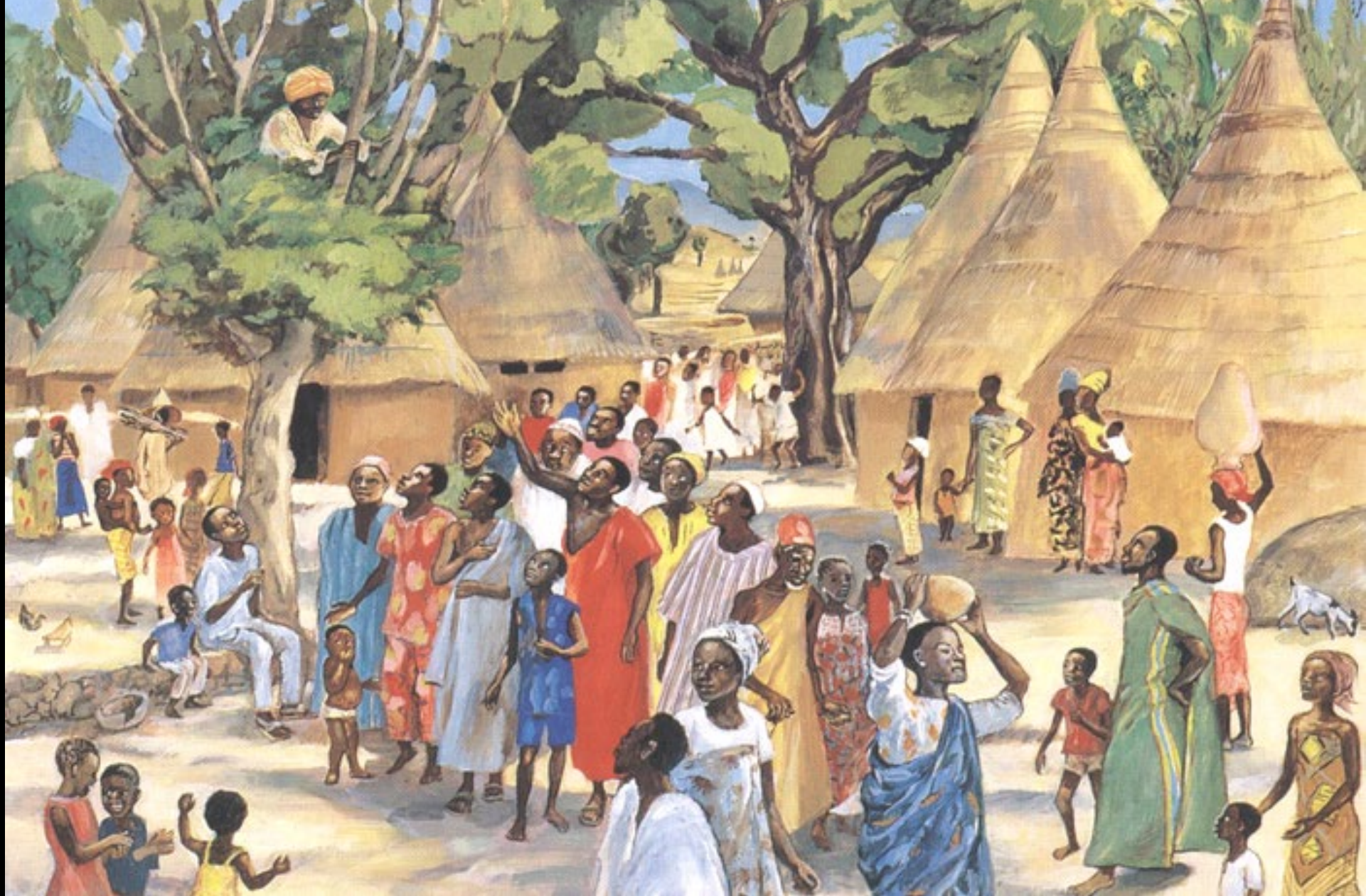
Zacchaeus Meets Jesus -- JESUS MAFA, Cameroon