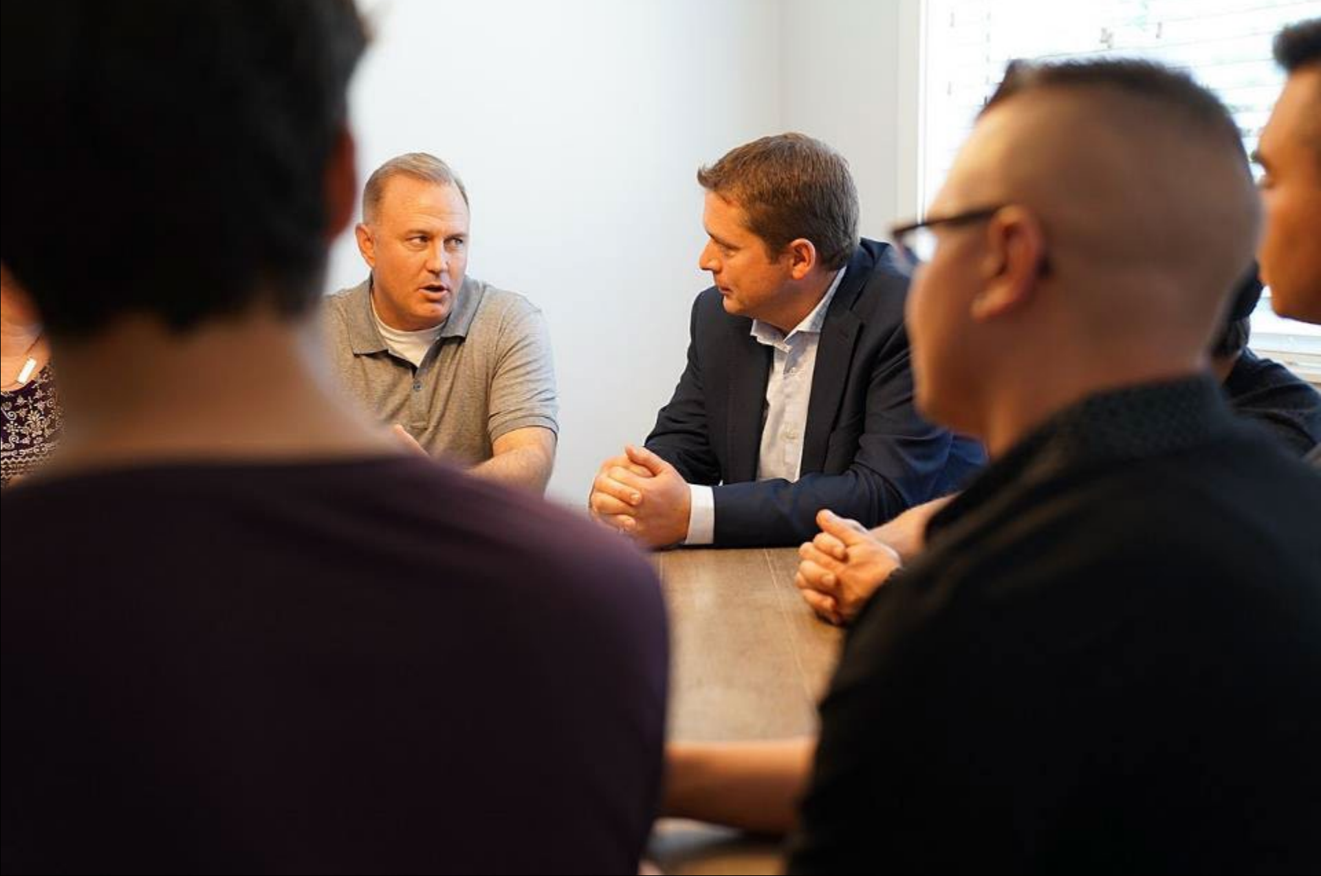
Opioid Abuse Recovery Group -- Cedars Society, Surrey, British Columbia