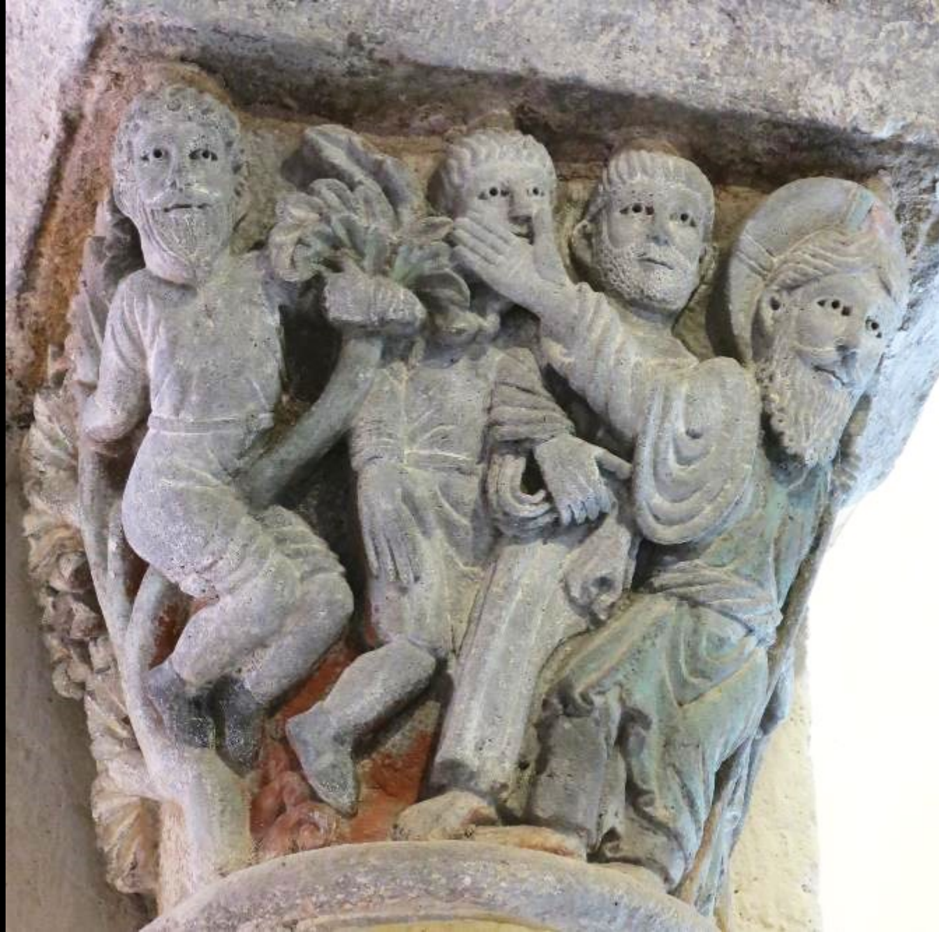
Zacchaeus and Christ -- Capital on column, Church of St. Nectaire, St. Nectaire, France