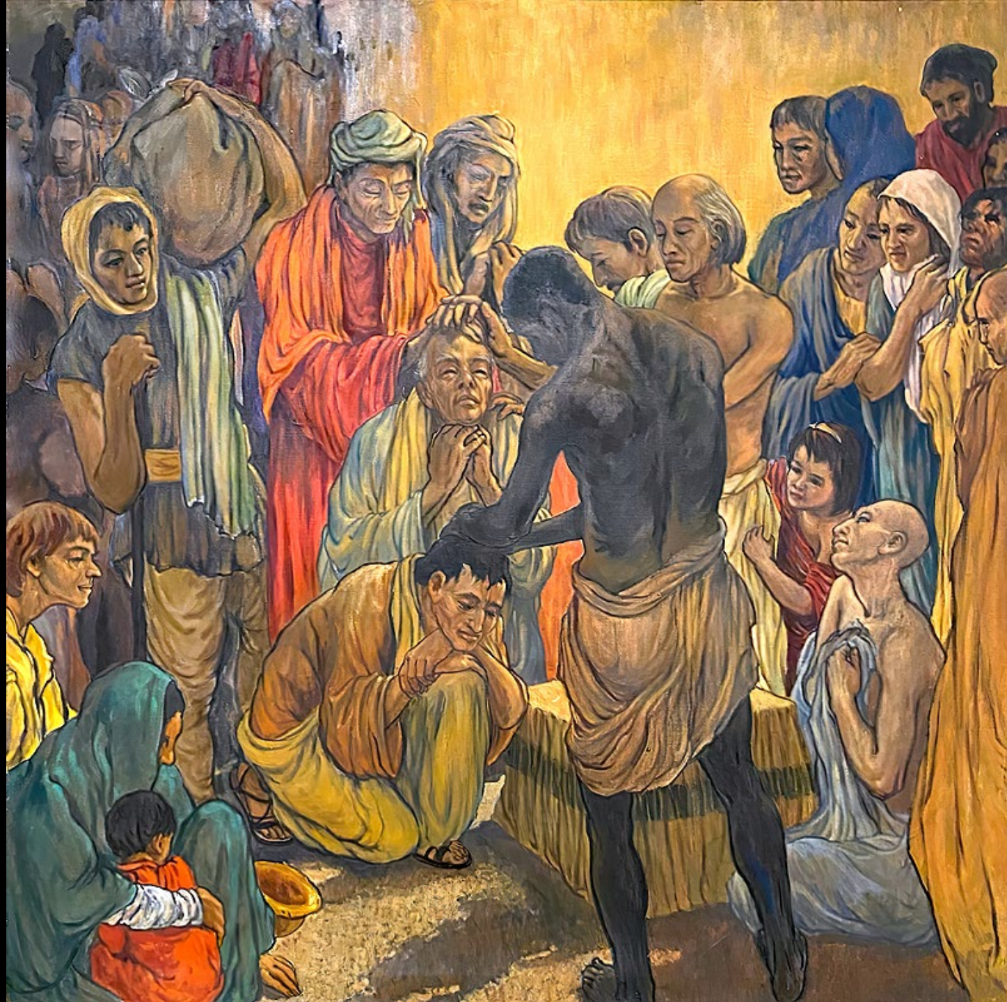
Dedication of Paul and Barnabas