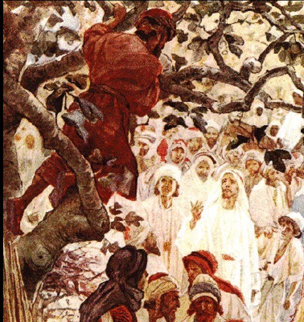
Christ Speaks to Zacchaeus