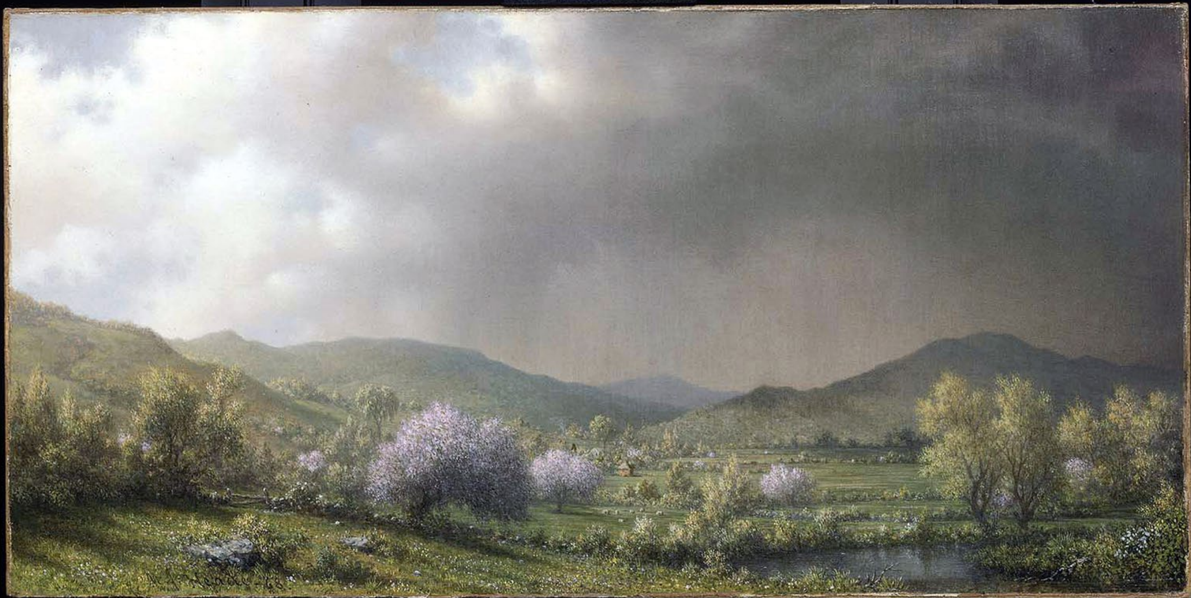
April Showers -- Martin Heade, Museum of Fine Arts, Boston, MA