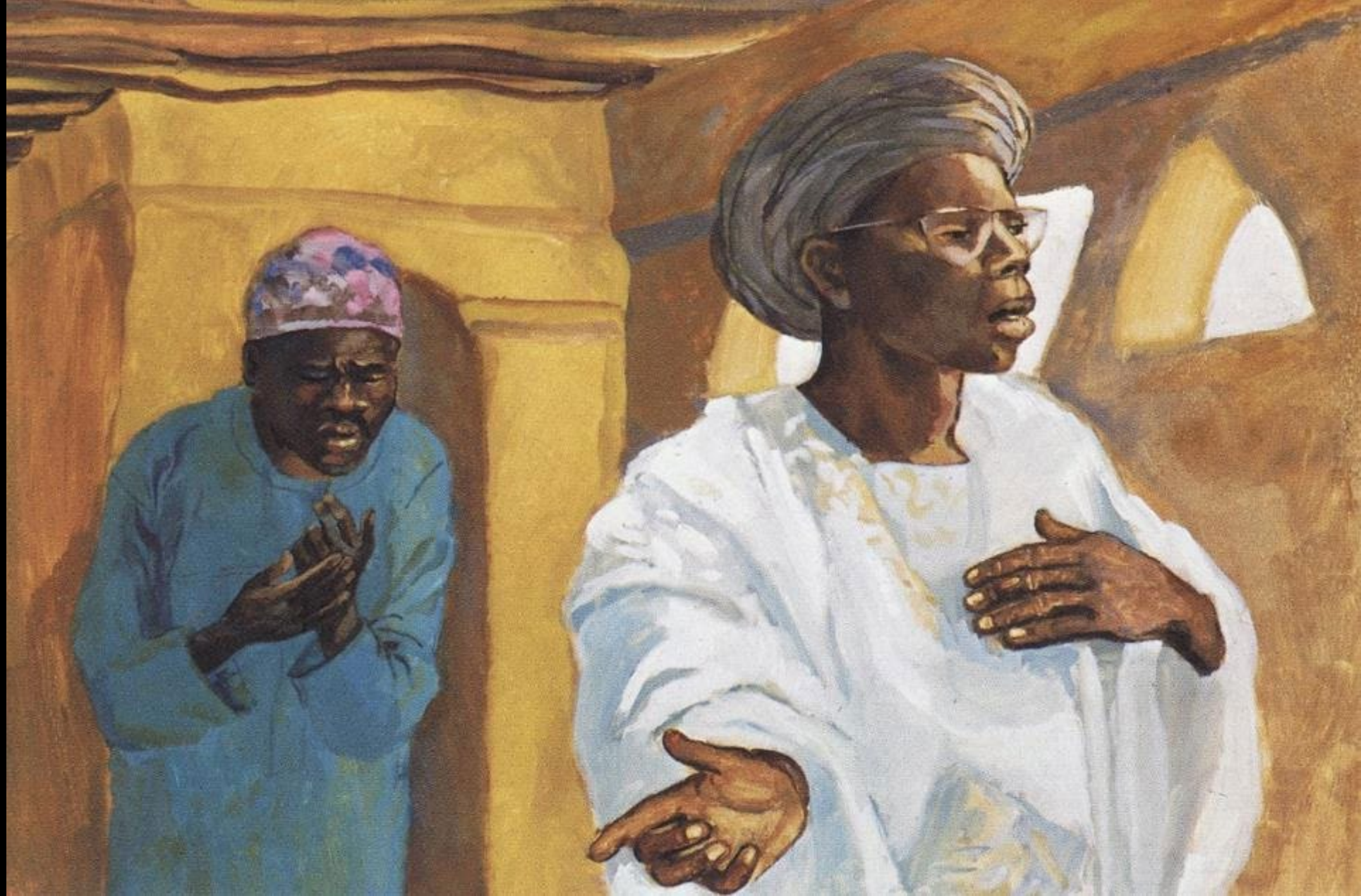
The Pharisee and the Tax Collector -- JESUS MAFA, Cameroon