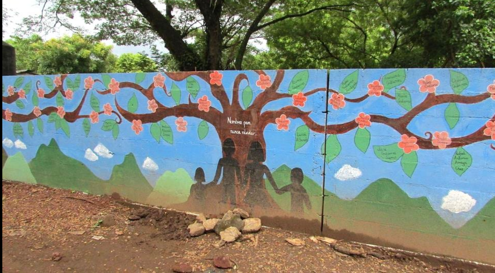
Tribute to the Lost Community Members from the Civil War -- Nuevo Gualcho, El Salvador