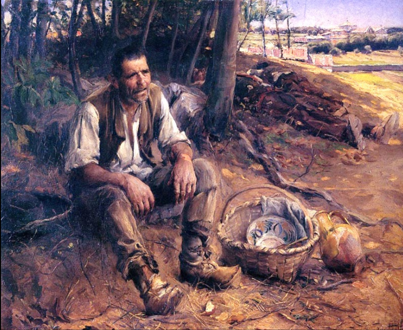
The Siesta -- Jose Malhoa, Museu Nacional de Belas Artes, Rio de Janeiro, Brazil