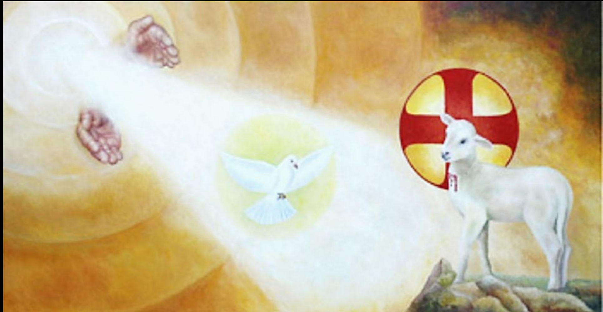
Hands of God, the Holy Spirit, and Lamb of Christ -- Church of the Holy Trinity, Caaupe, Paraguay