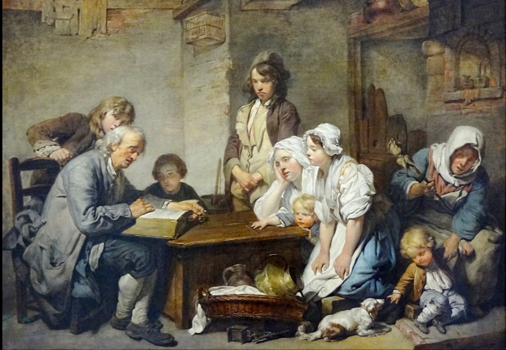
Reading the Bible -- Jean-Baptiste Greuze, Louvre Museum, Paris, France