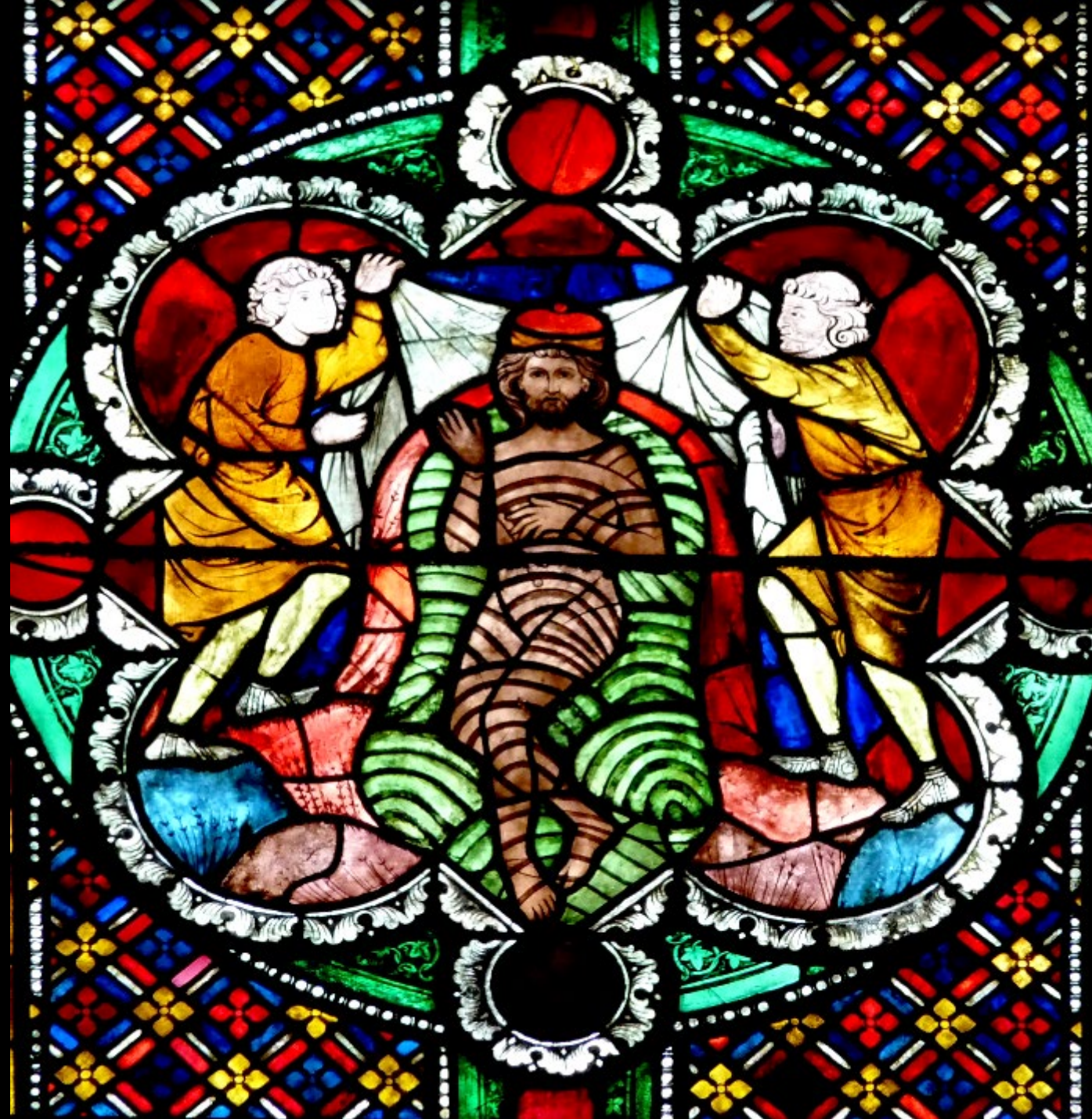
Naaman Bathes in the Jordan