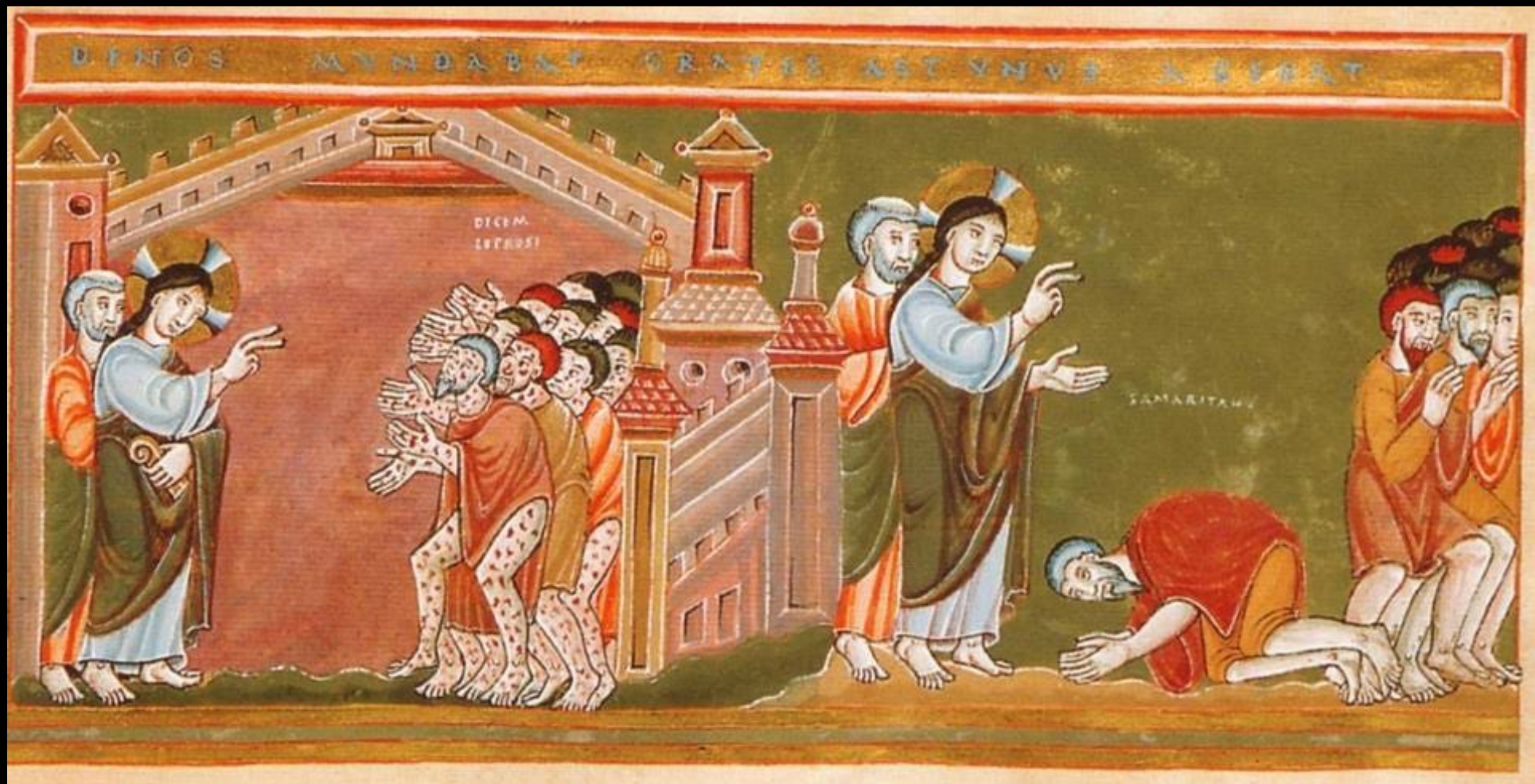
Christ and the Ten Lepers -- Codex Aureus Epternacensis, Freising, Germany