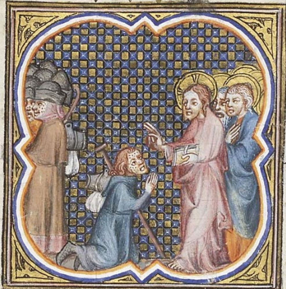
Christ Heals the Ten Lepers

National Library of the Netherlands Hague, Netherlands