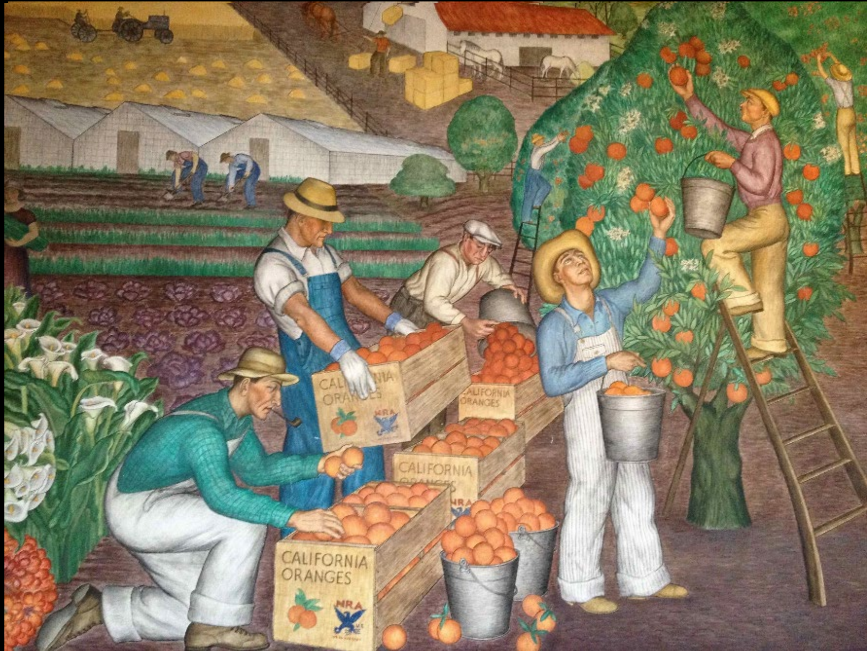
Migrant Farm Workers -- Mural, Coit Tower, San Francisco, CA