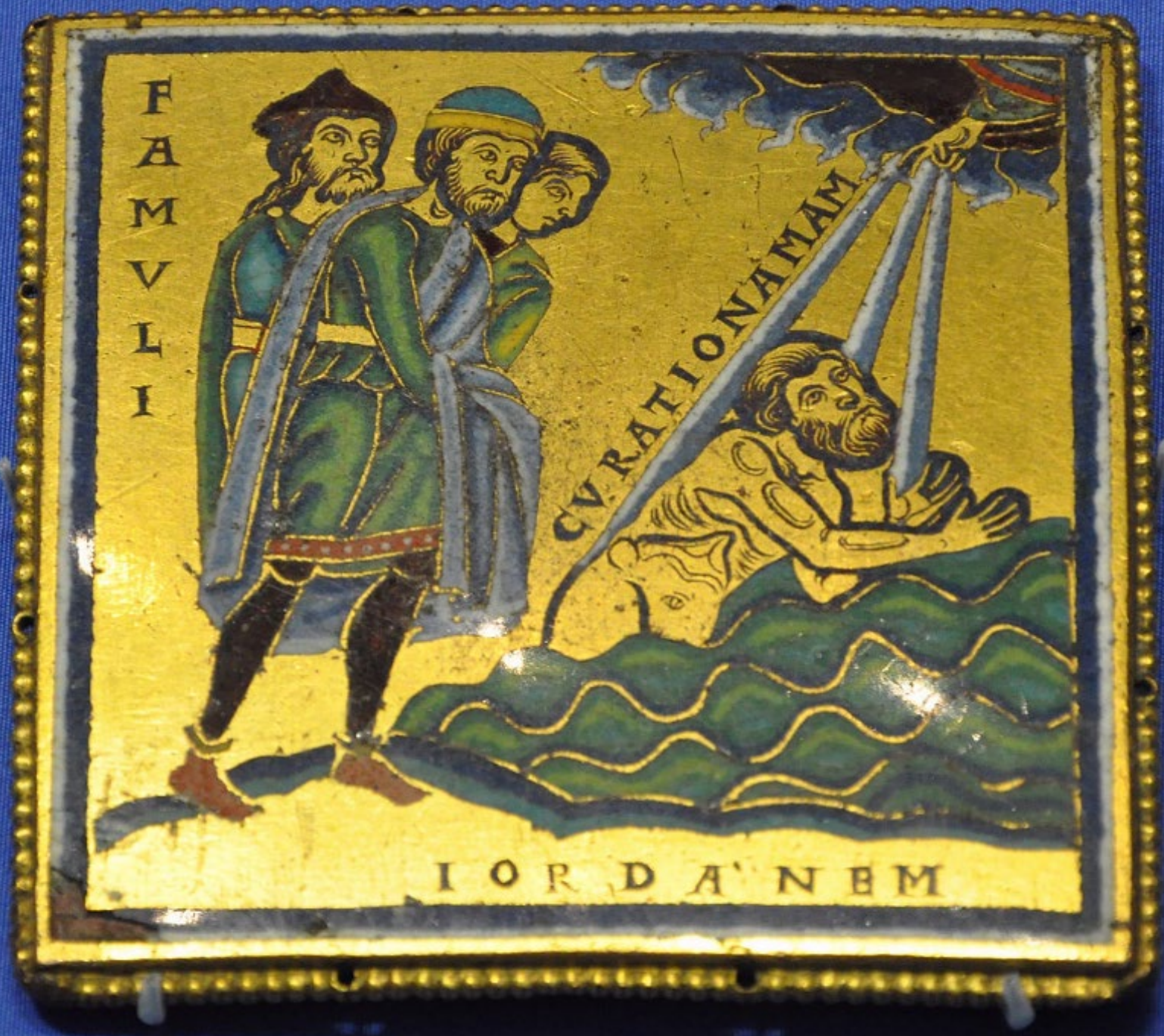
Naaman is Cured of Leprosy