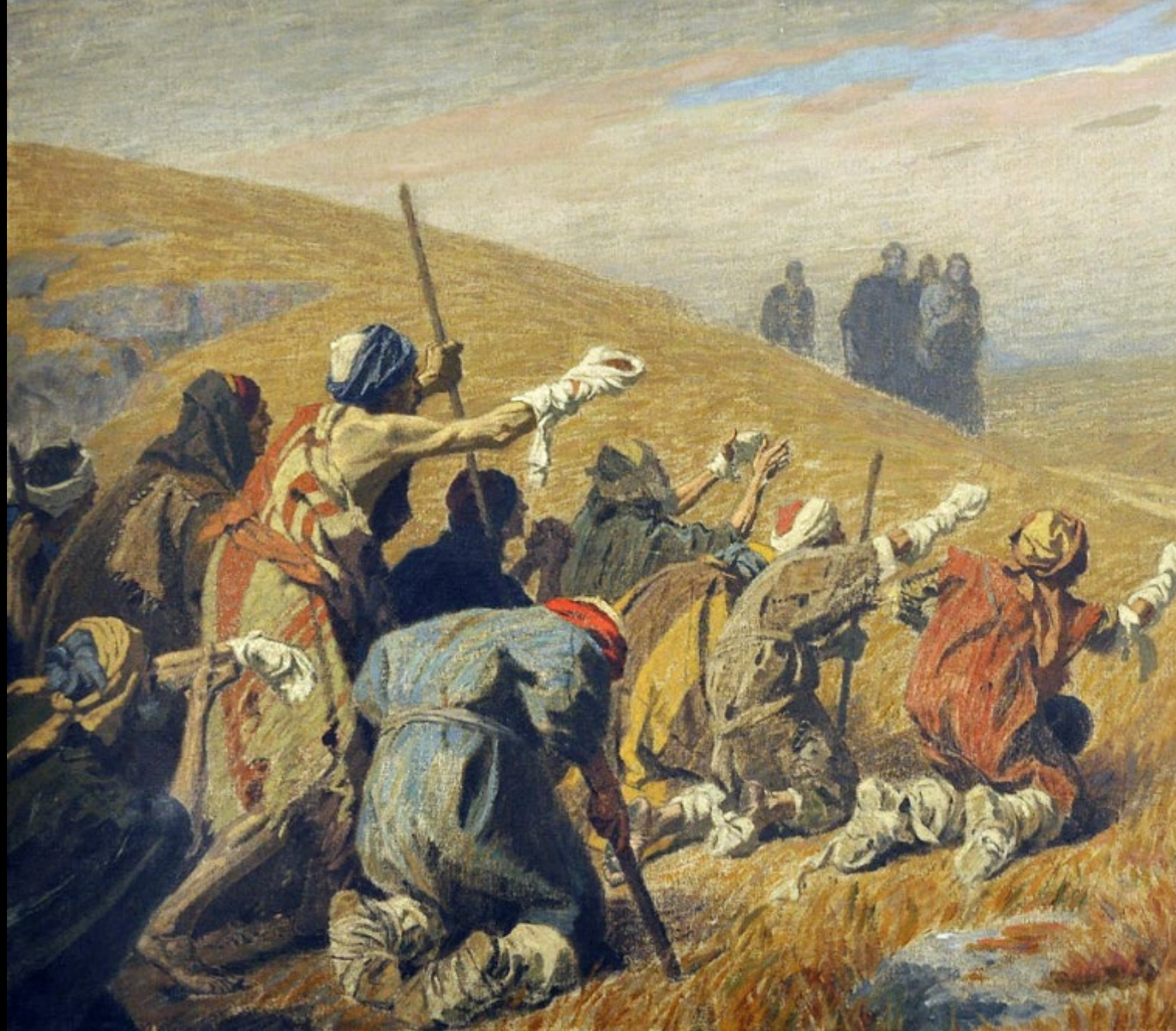
Ten Lepers Call Out to Jesus, detail -- Gebhard Fugel, Diocesan Museum, Freising, Germany