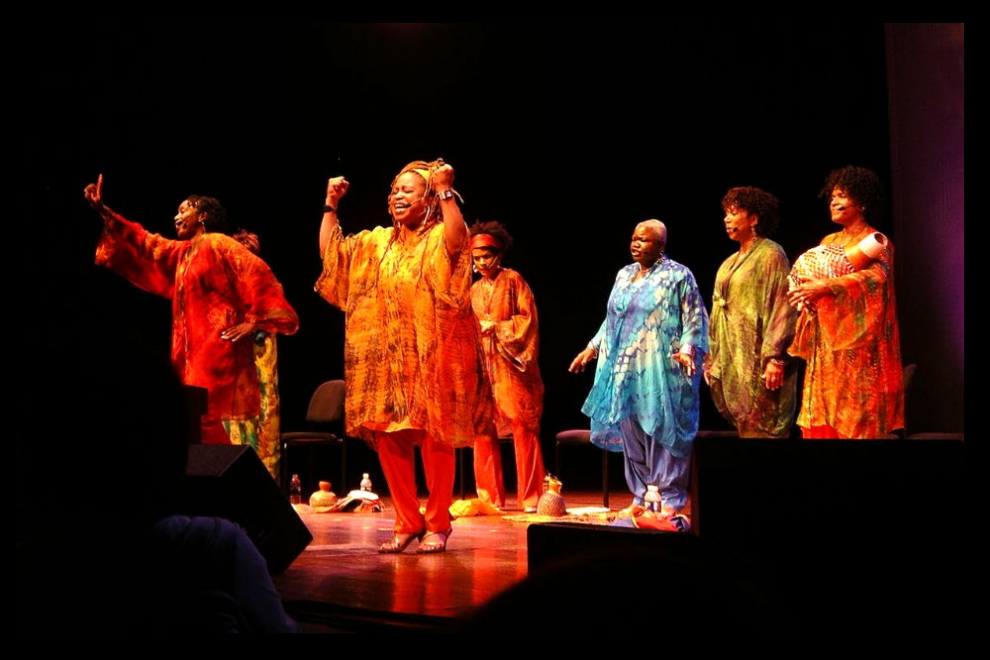
Sweet Honey in the Rock, African-American Gospel choir