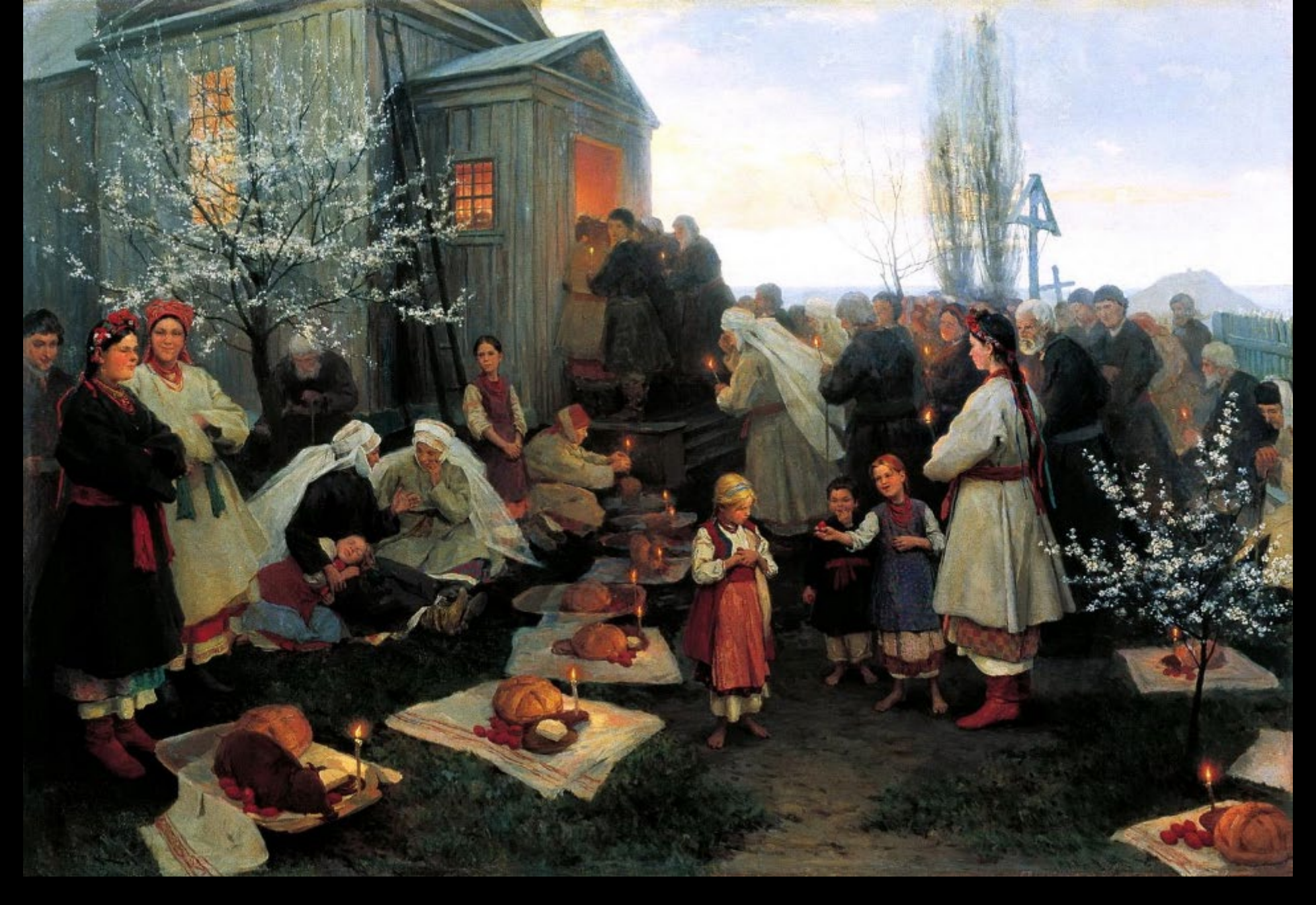
Waiting for the Blessing -- Mycola Pymonenko, Rybinsk Museum, Rybinsk, Russia