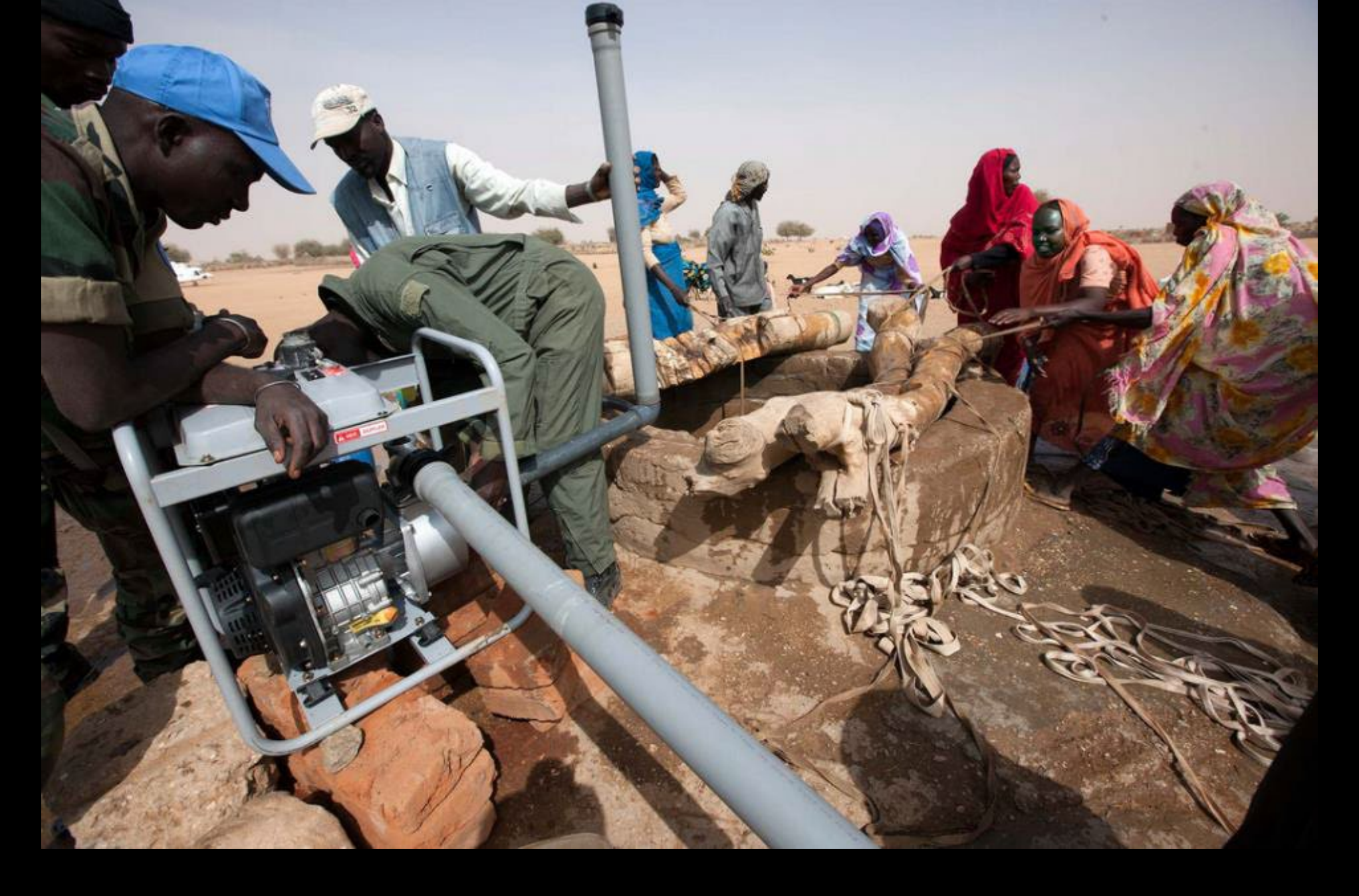
Construction of Water Pump for Well -- North Darfur, Sudan