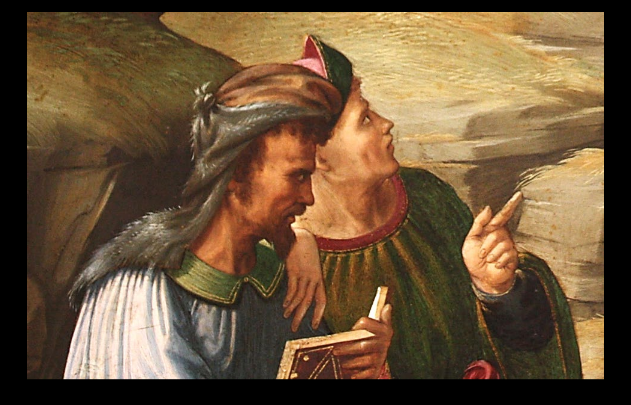
Pharisees, detail from John the Baptist Bearing Witness -- Francesco Granacci, Met Museum, New York