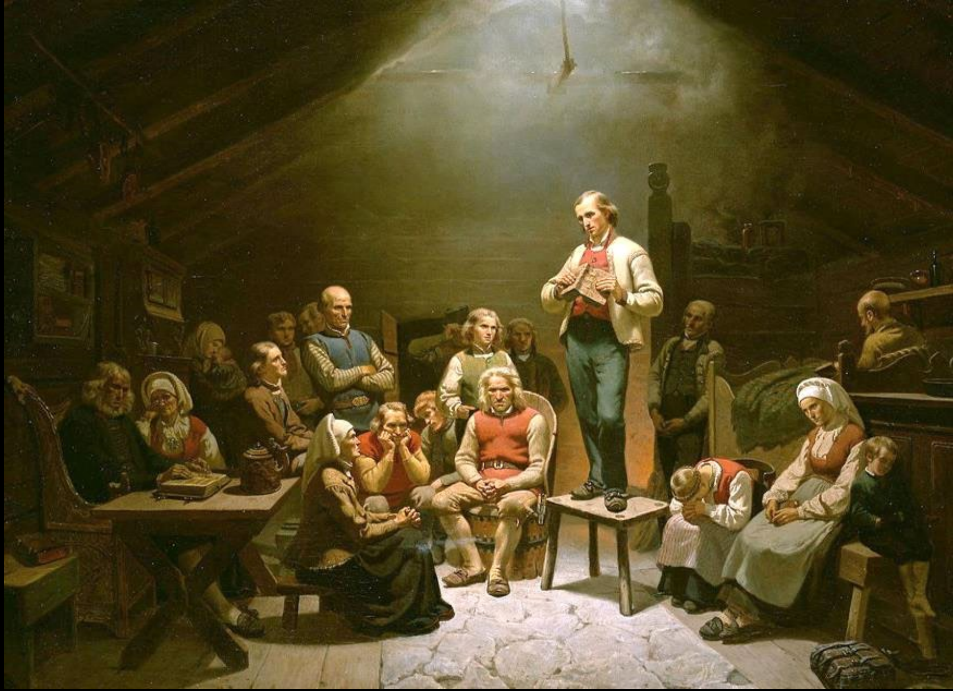
Low Church Devotion -- Adolf Tidemand, National Gallery of Norway, Oslo, Norway