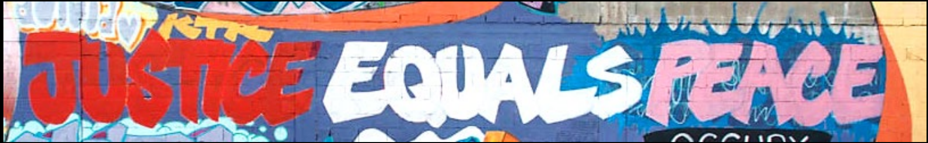
Justice Equals Peace -- detail of mural in Christchurch, New Zealand