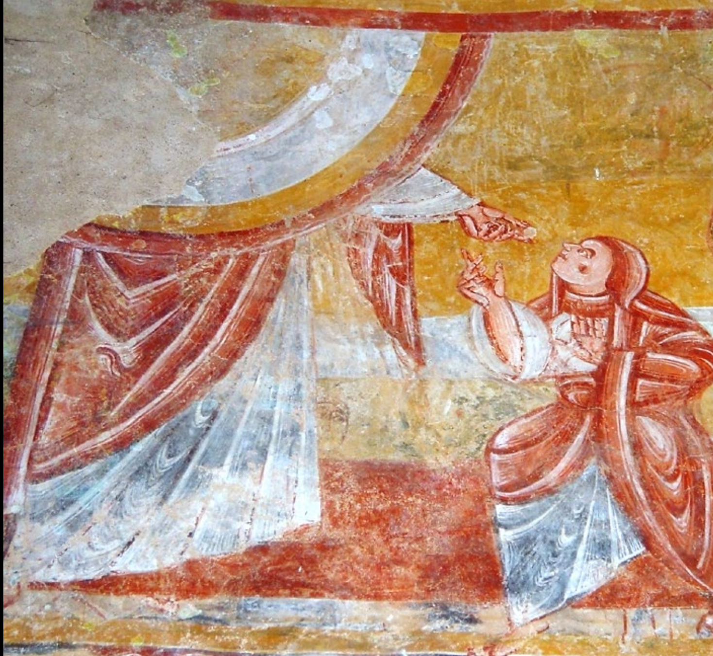
The Lord Gives Jeremiah His Words -- Church of St. Martin, Nohant-Vic, France