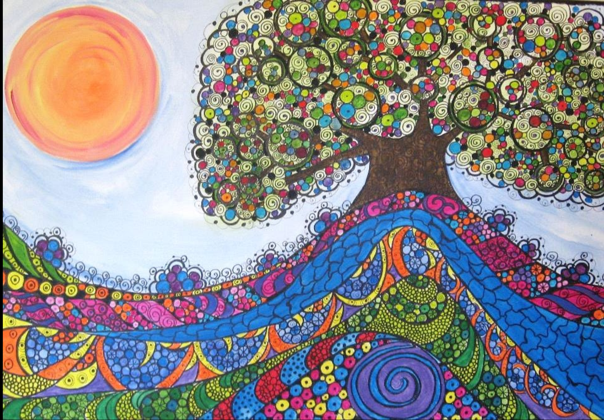
Tree of Hope for Breast Cancer Survivors -- Julie Leuthold