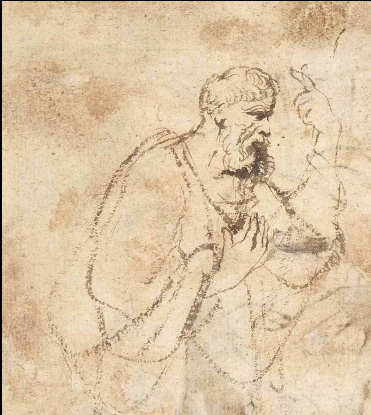
Study for a Pharisee

Anthony van Dyck Metropolitan Museum of Art New York, NY