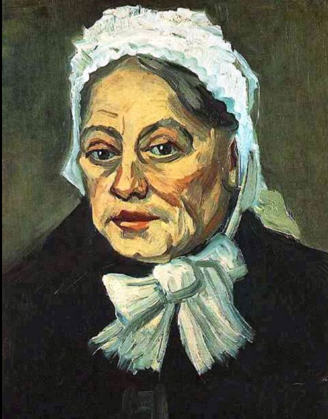
The Midwife Vincent van Gogh Van Gogh Museum Amsterdam, Netherlands