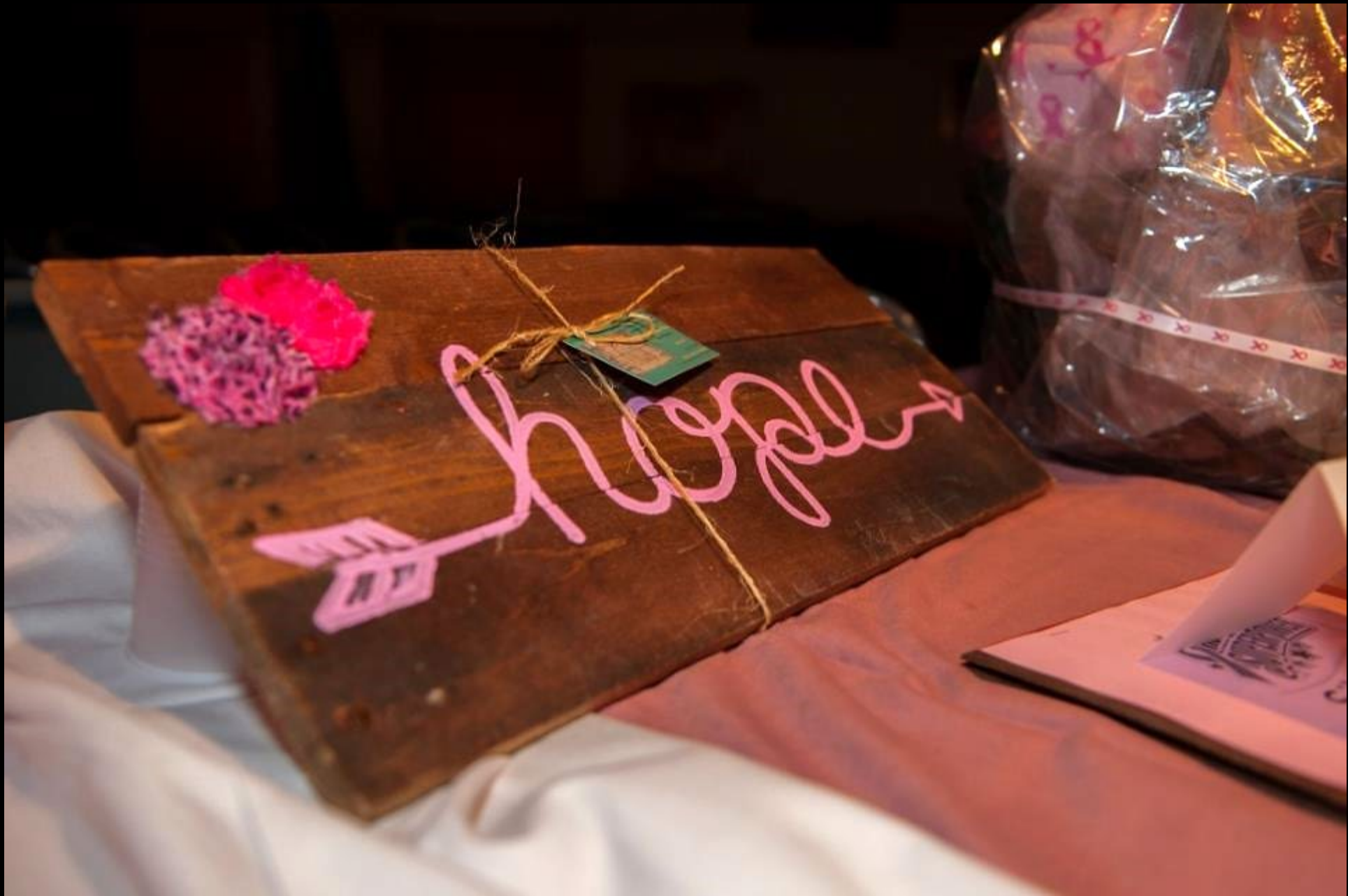
"Hope" for breast cancer patients at Minot Air Force Base medical services