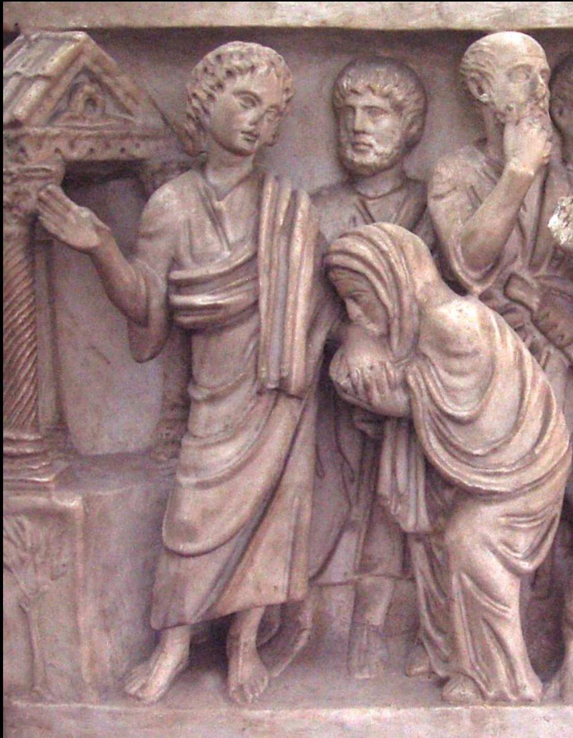
Christ Healing the Woman Bent Over

Two Brothers Sarcophagus Vatican Museum, Vatican City