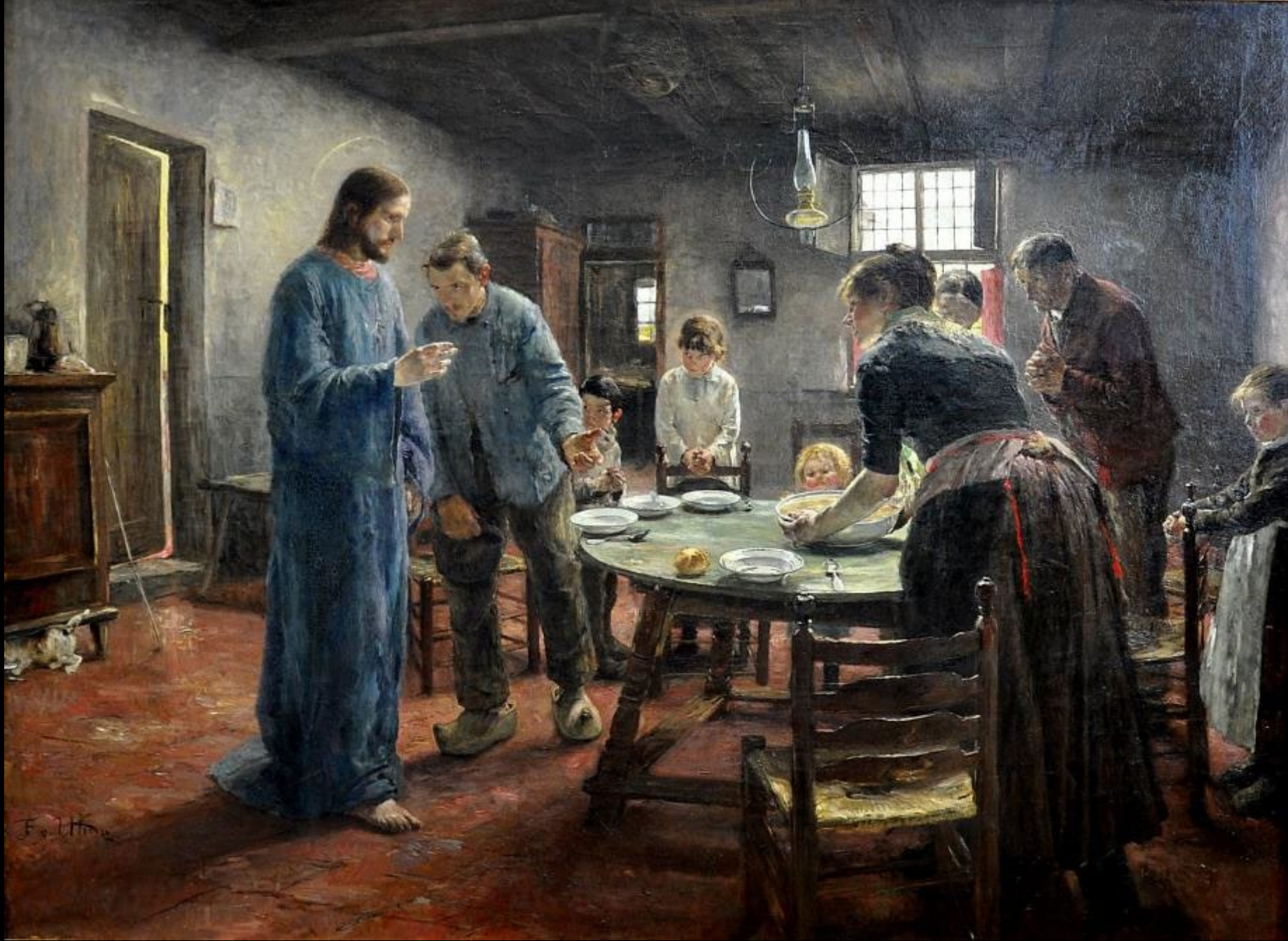
The Mealtime Prayer -- Fritz von Uhde, Alte Nationalgalerie, Berlin, Germany