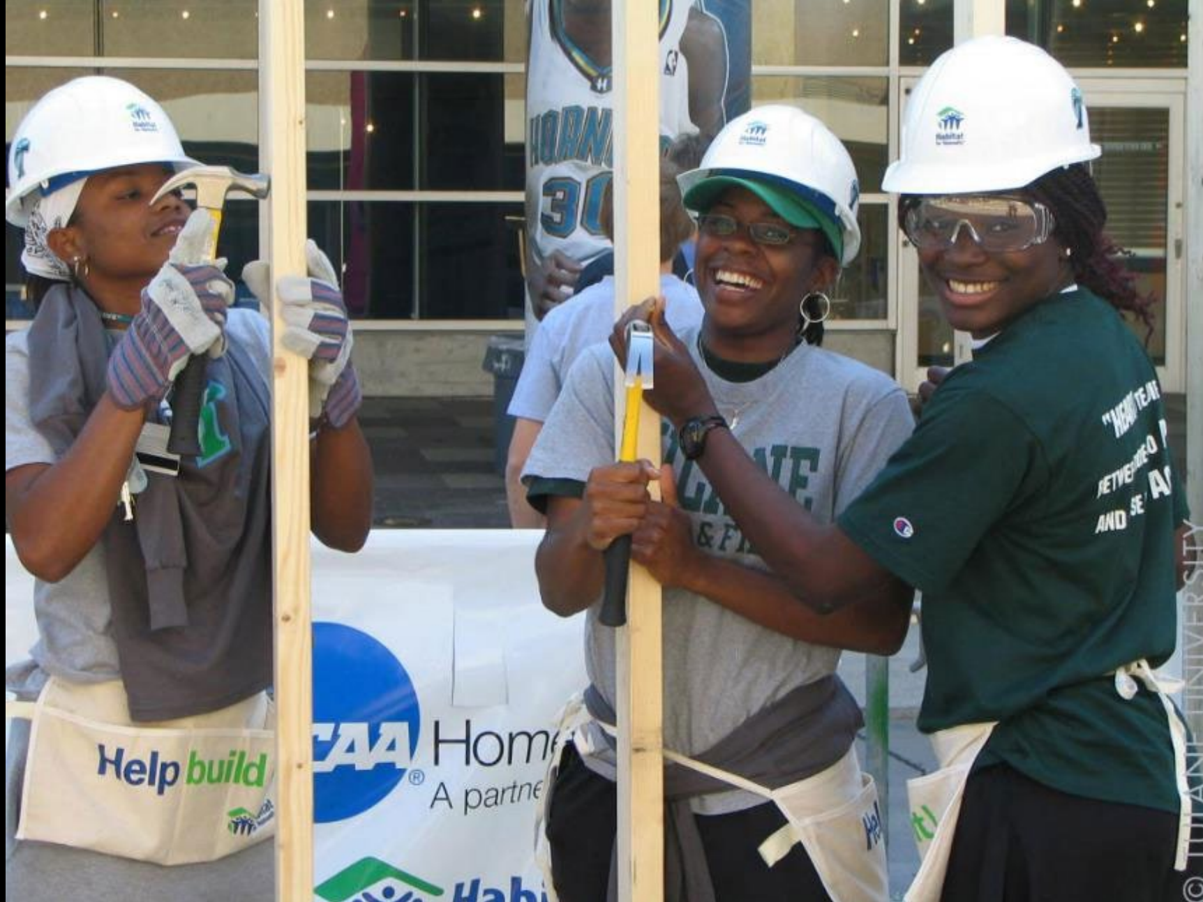
Tulane Students Helping to Build a Habitat for Humanity House