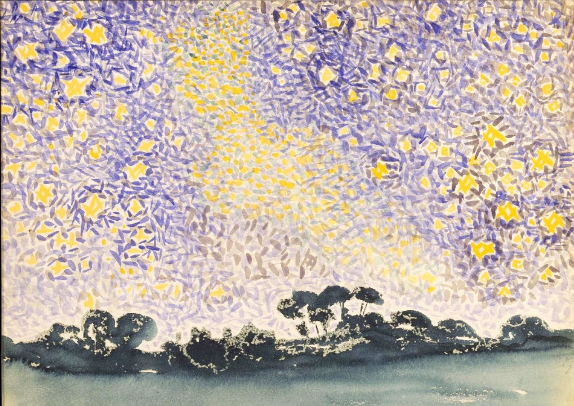
Landscape with Stars -- Henri-Edmond Cross, Metropolitan Museum of Art, New York, NY