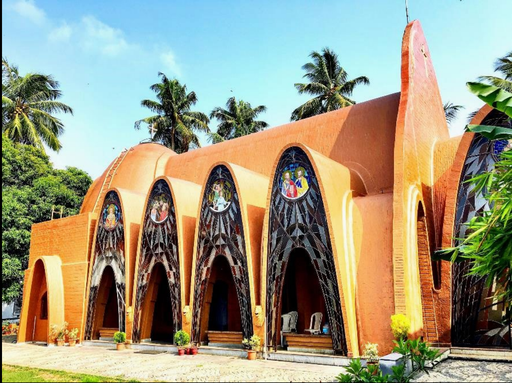
St George Orthodox Koonan Kurish Old Church -- Kerala, India (Mar Thoma, established AD 52)