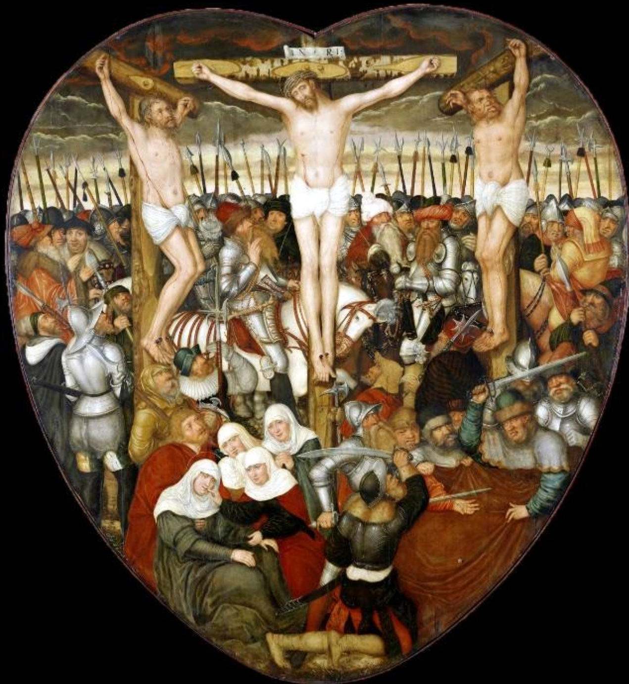
Heart-Shaped Altar, Crucifixion