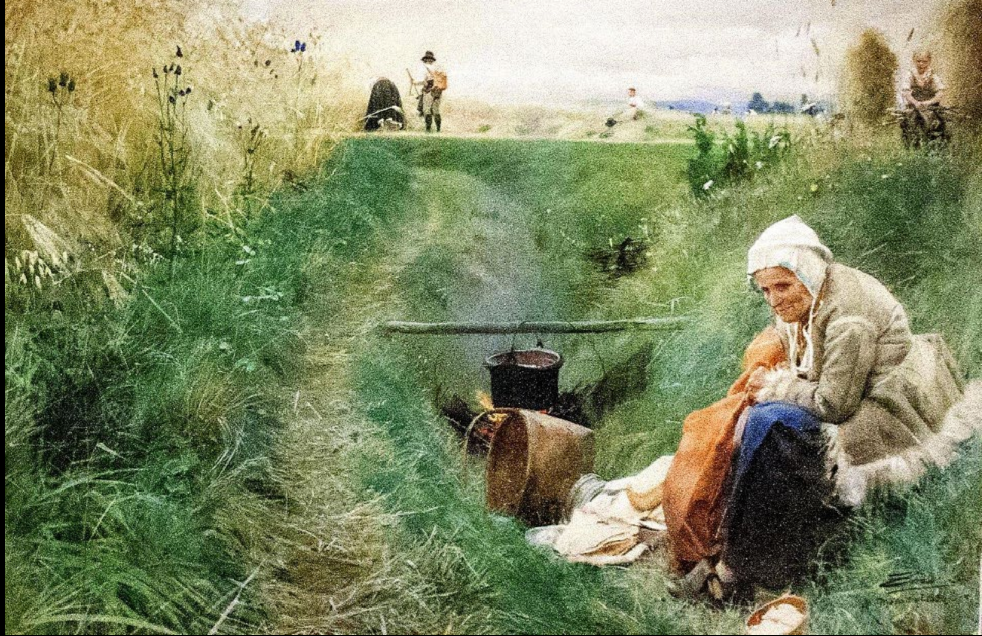
Our Daily Bread -- Anders Zorn, Nationalmuseum, Stockholm, Sweden