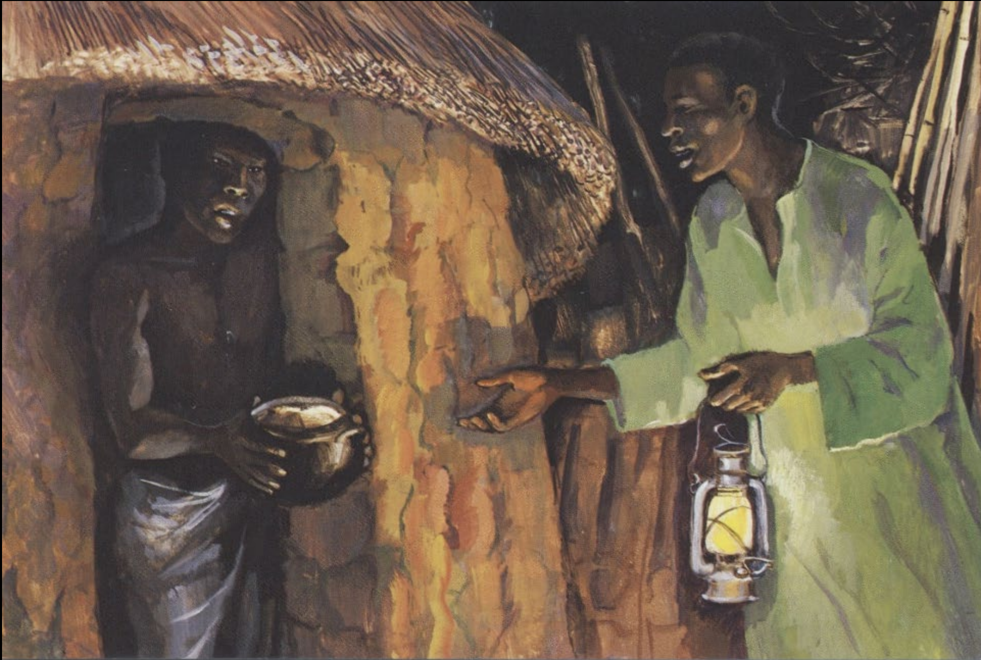
The Persistent Friend -- JESUS MAFA, Cameroon