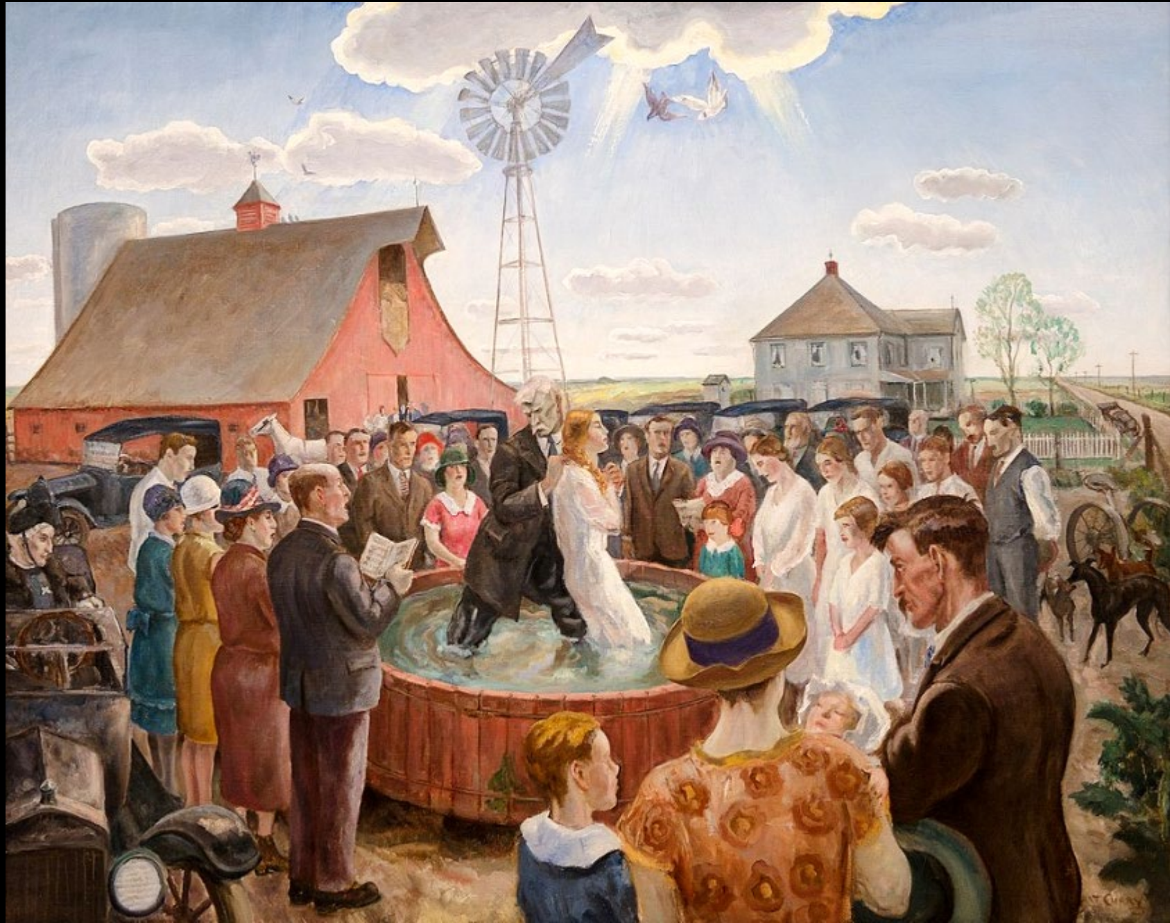
Baptism in Kansas -- John Steuart Curry, Whitney Museum, New York, NY