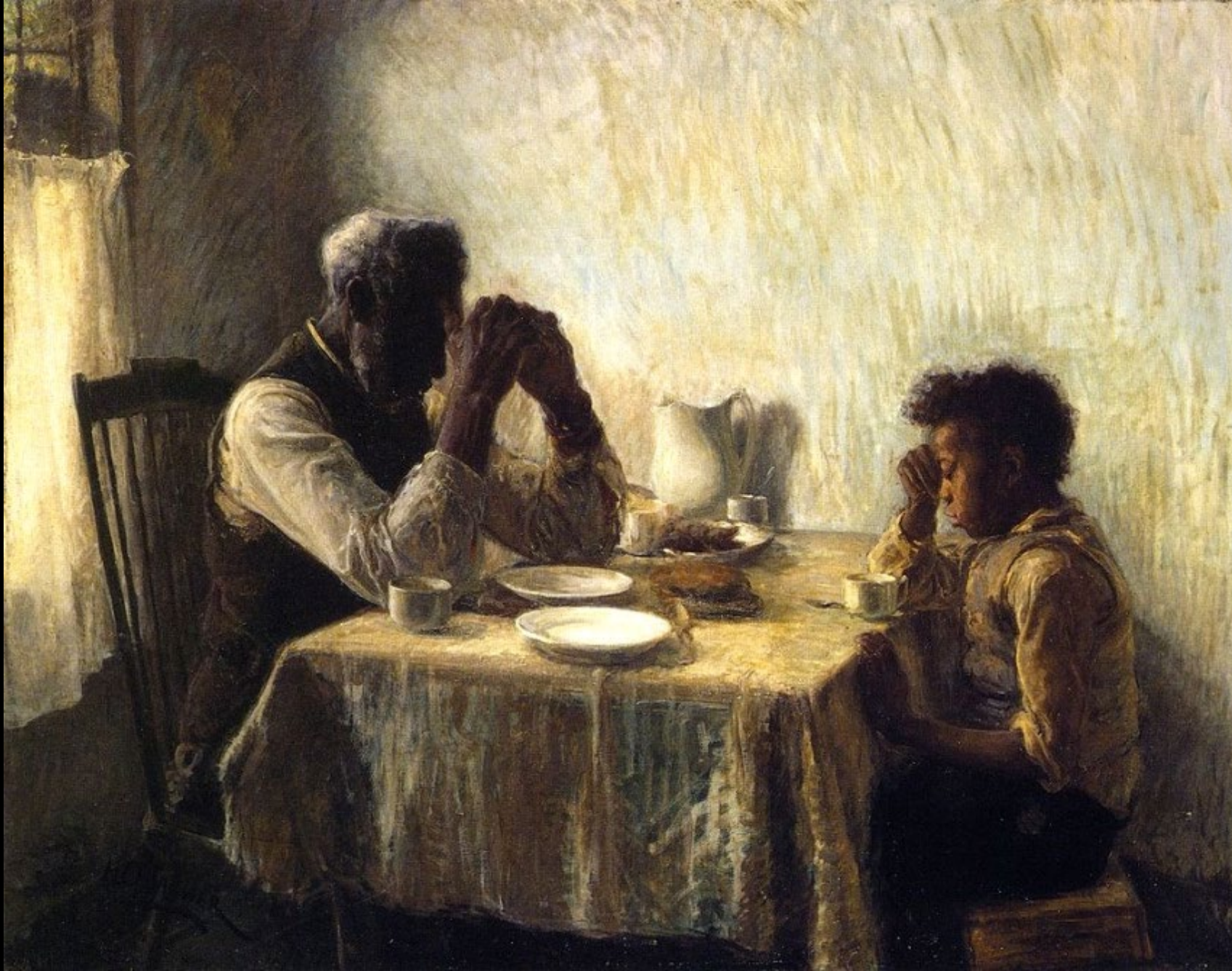
Thankful -- Henry Ossawa Tanner, 1894