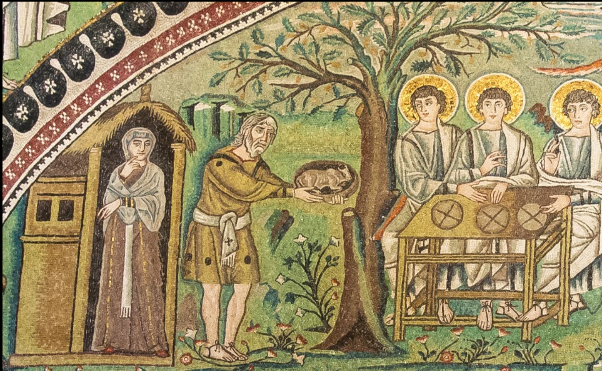
Sarah and Abraham Offer Hospitality to the Visitors -- Basilica of San Vitale, Ravenna, Italy