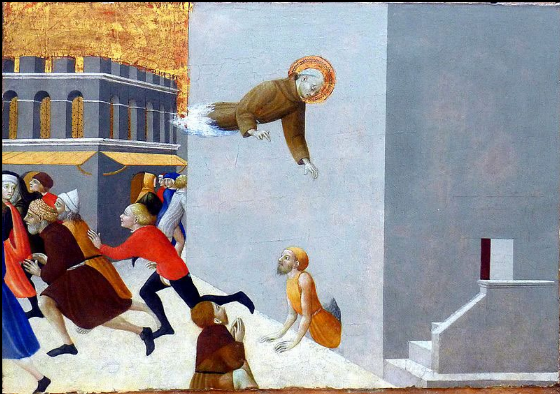
Saint Ranerius Frees the Poor From Prison -- Sassetta, Louvre Museum, Paris, France