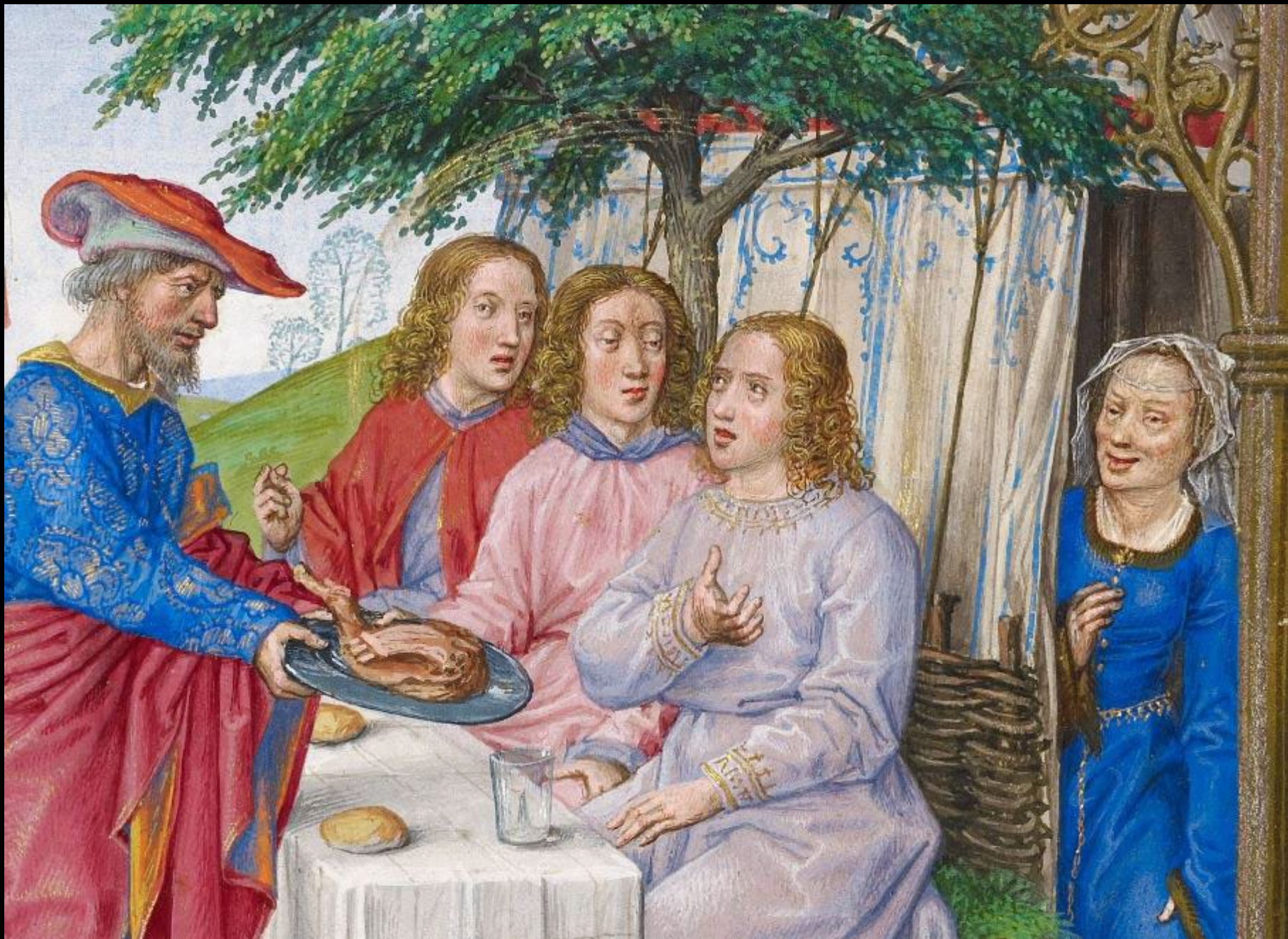
Sarah Hears the Visitor's Promise -- Master of James IV of Scotland, Getty Center, Los Angeles, CA