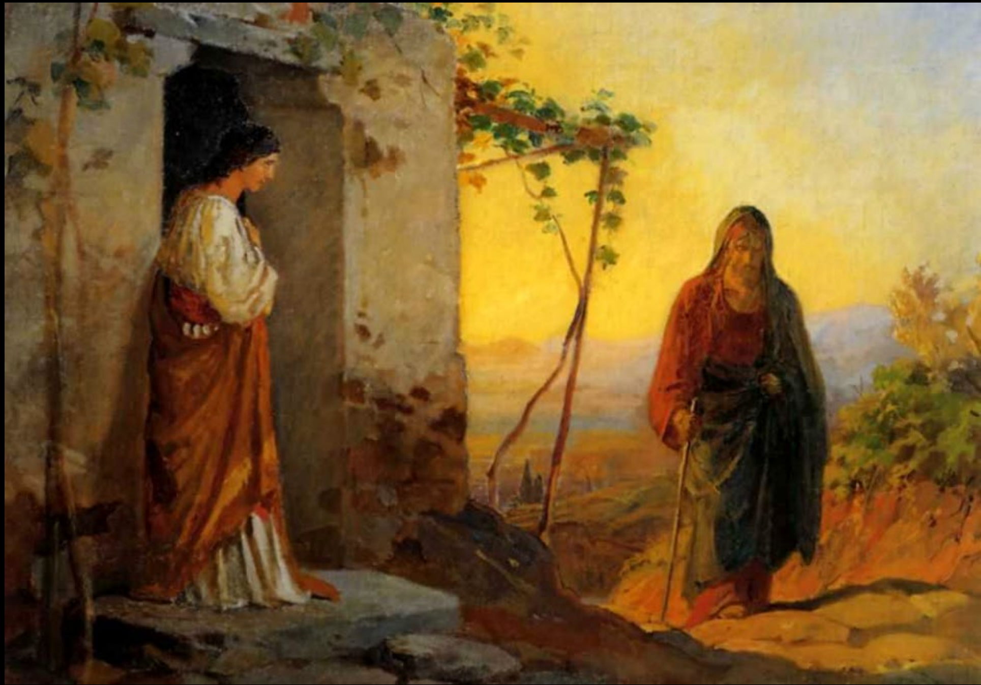
Mary, Sister of Lazarus, Welcomes Jesus Into Her Home -- Nikolai Ge