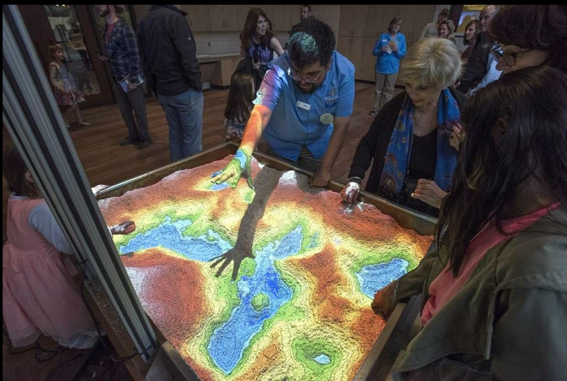
Land Stewardship Lab -- Witte Museum, San Antonio, TX