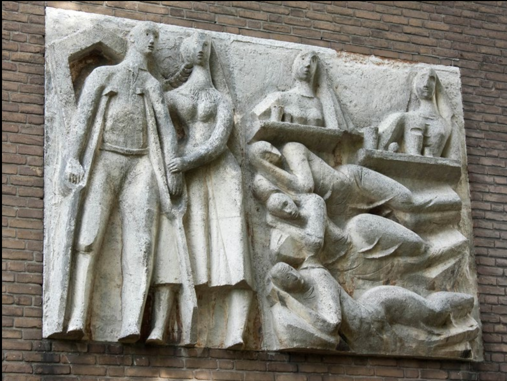
The Good Samaritan Cared for at the Inn -- Charles Eyck, Wageningen, Netherlands