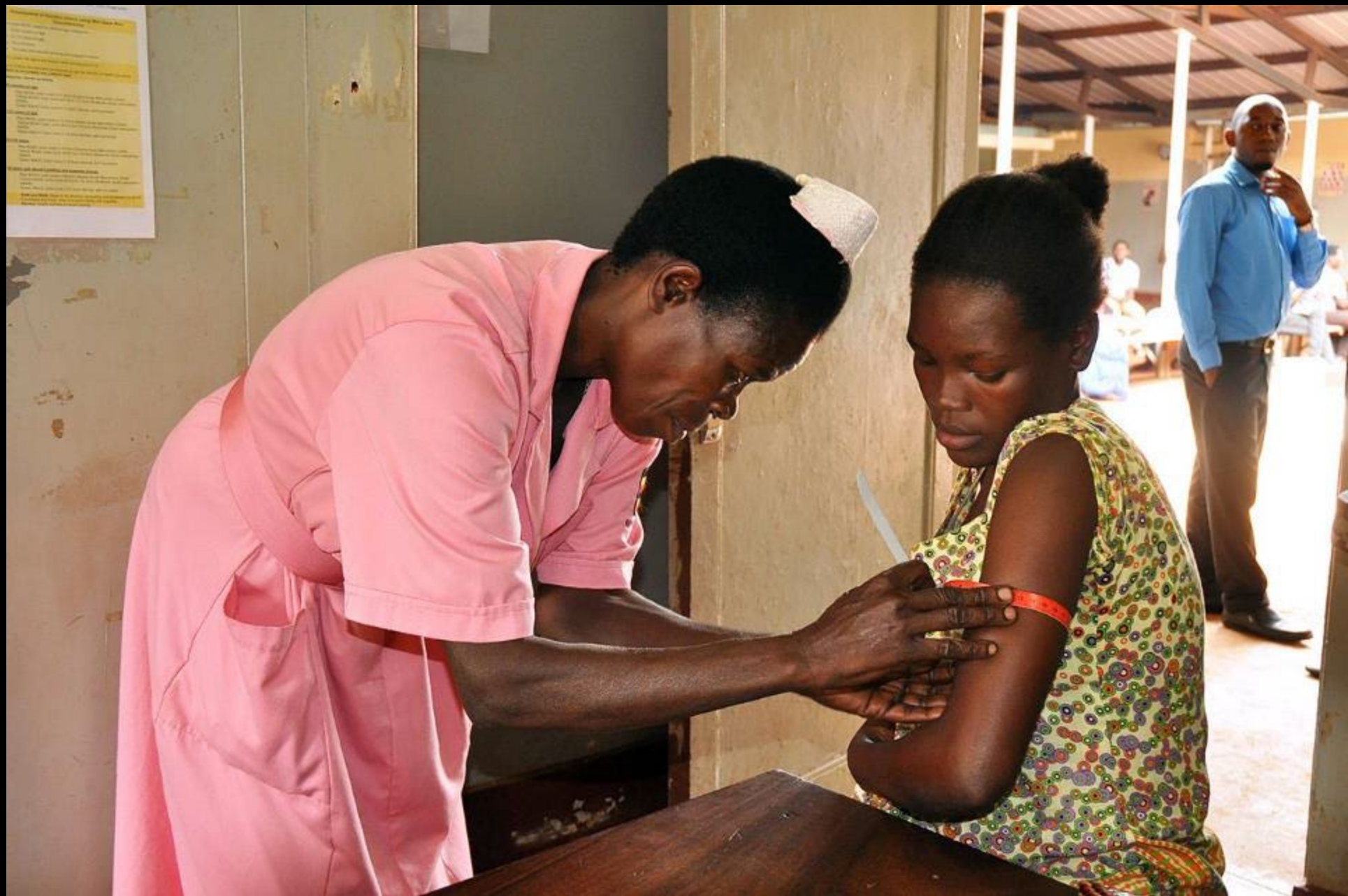
Maternal Health Checkup -- Jinja Regional Referral Hospital, Jinja, Uganda