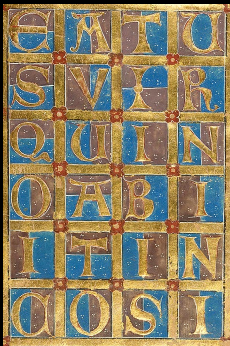
Text of Psalm 1 Manuscript leaf, Getty Center, Los Angeles, CA