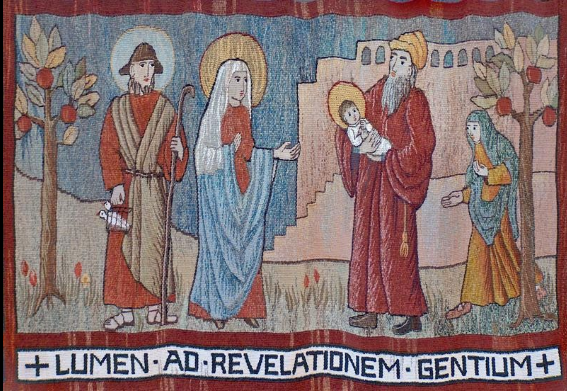
Presentation in the Temple -- Abbey of St. Walburga, Virginia Dale, CO