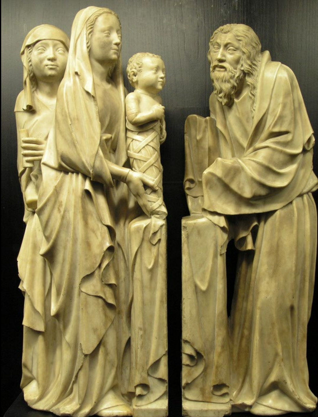
Presentation in the Temple

Musee National du Moyen Age, Paris, France