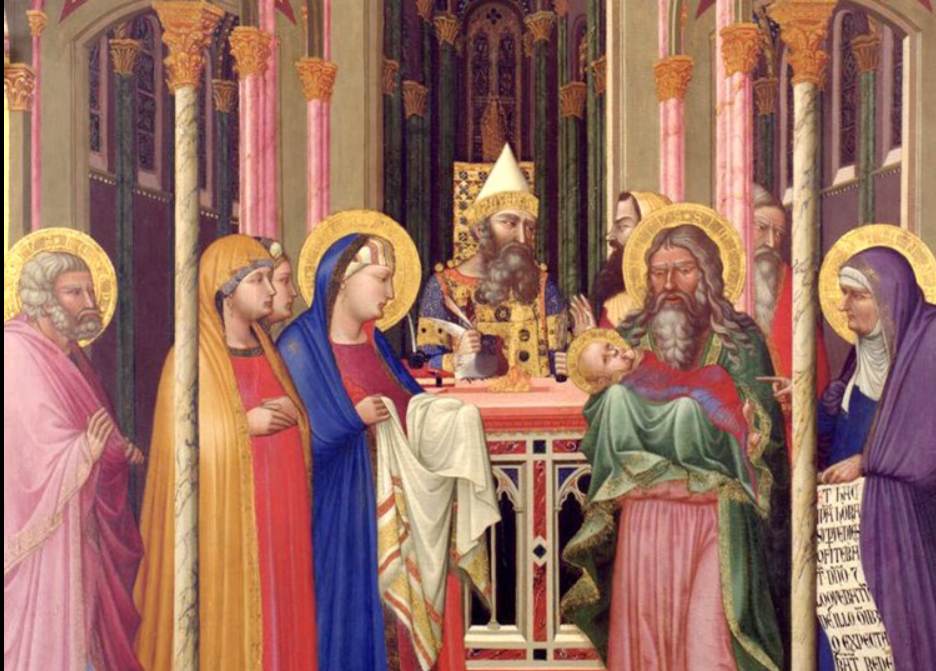
Presentation in the Temple -- Ambrogio Lorenzetti, Uffizi, Florence, Italy