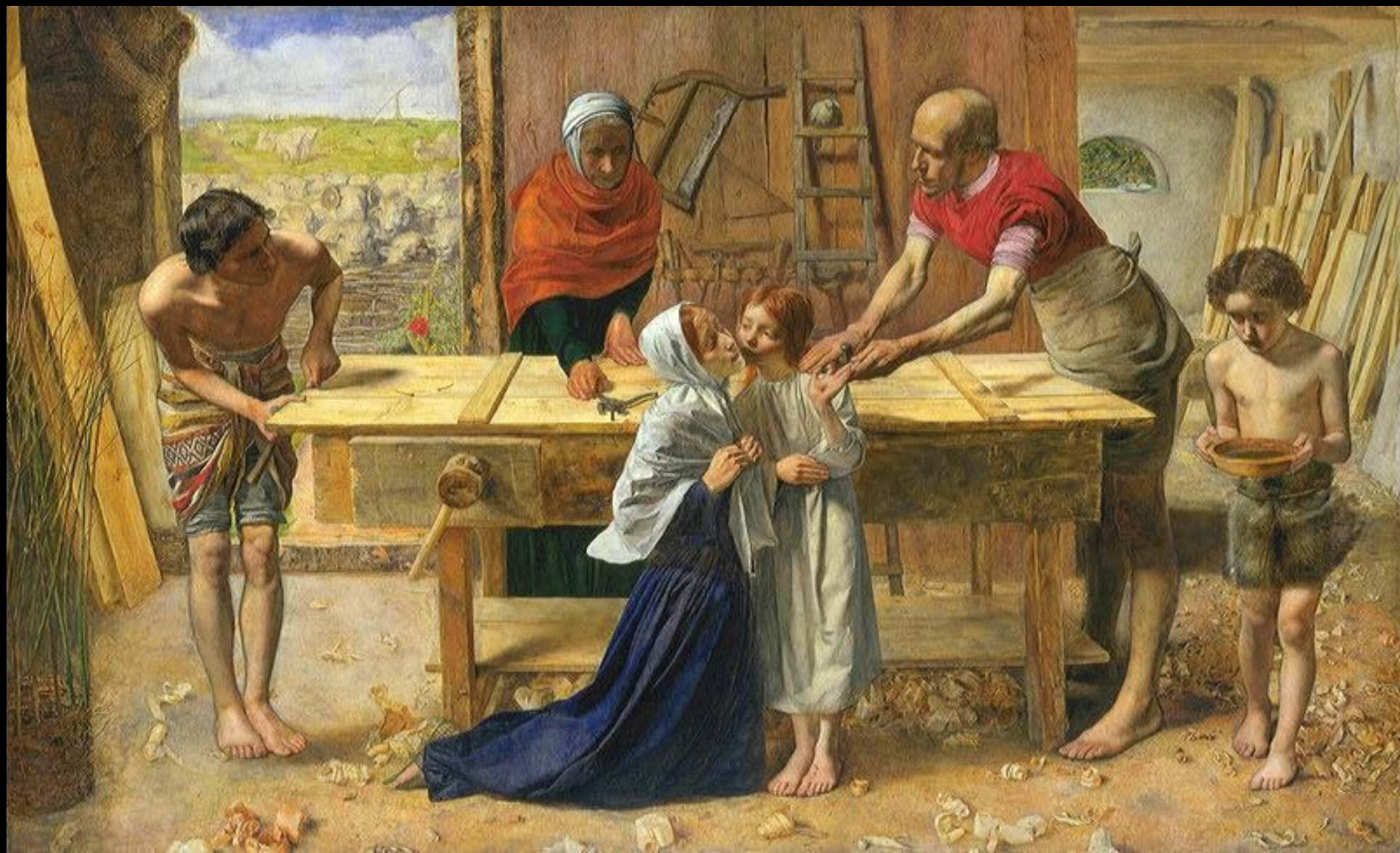
Christ in the House of His Parents -- John Everett Millais, Tate Britain, London