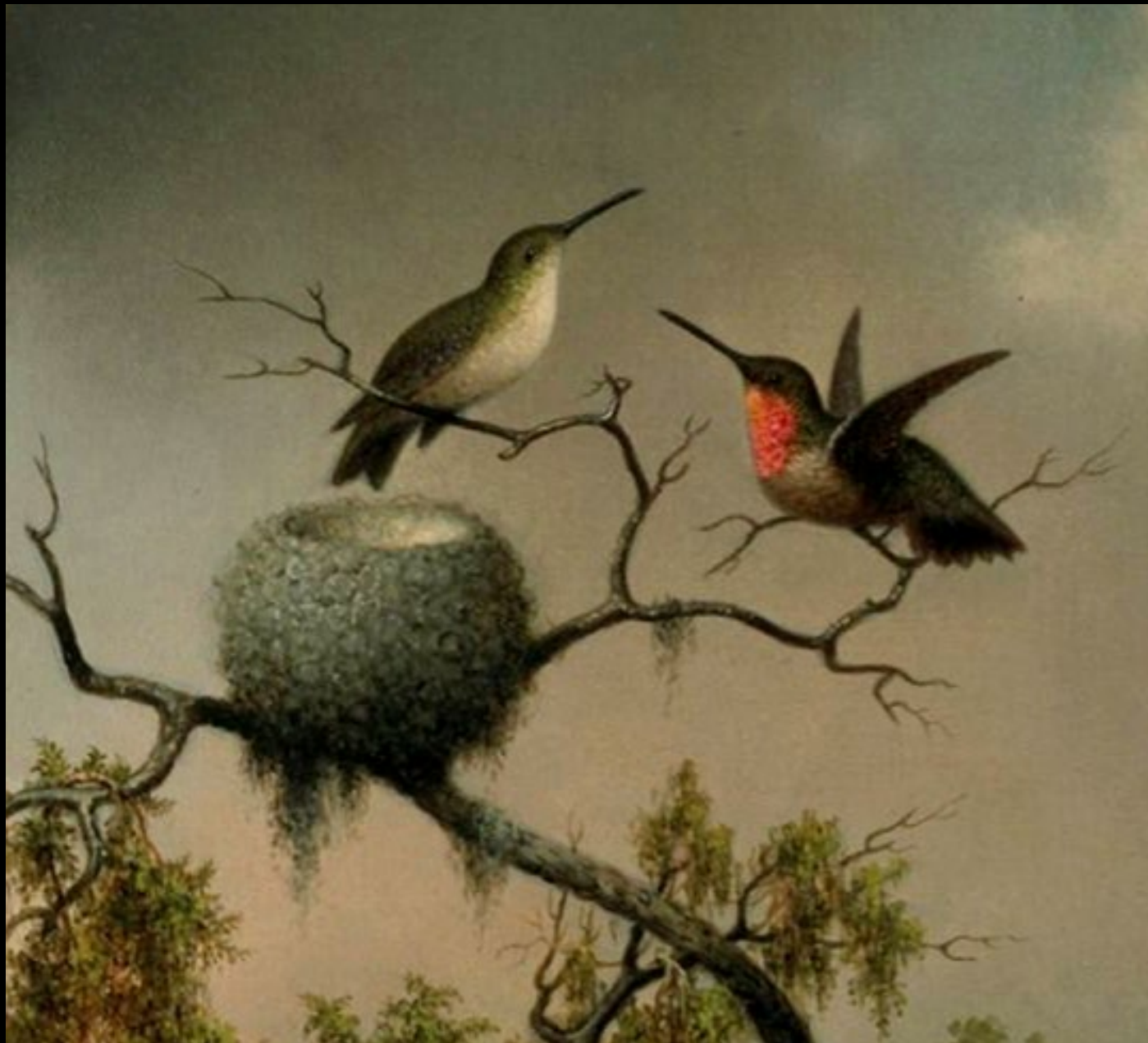
Hummingbirds with Nest -- Martin Heade, Museum of Fine Arts, Boston