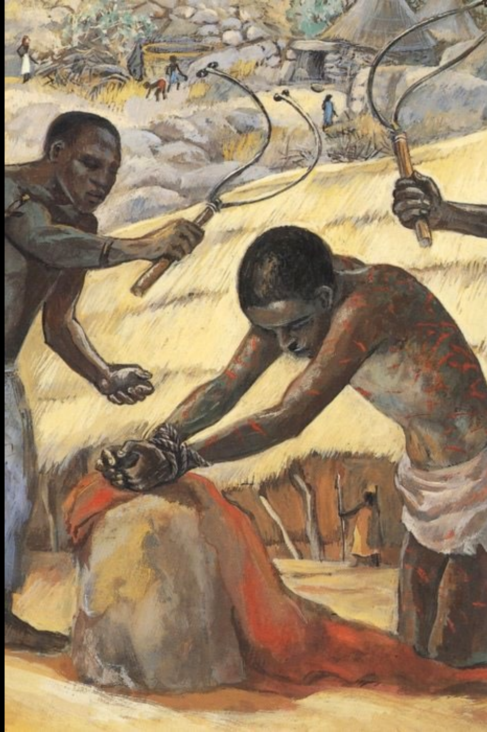
The Flagellation JESUS MAFA, Cameroon