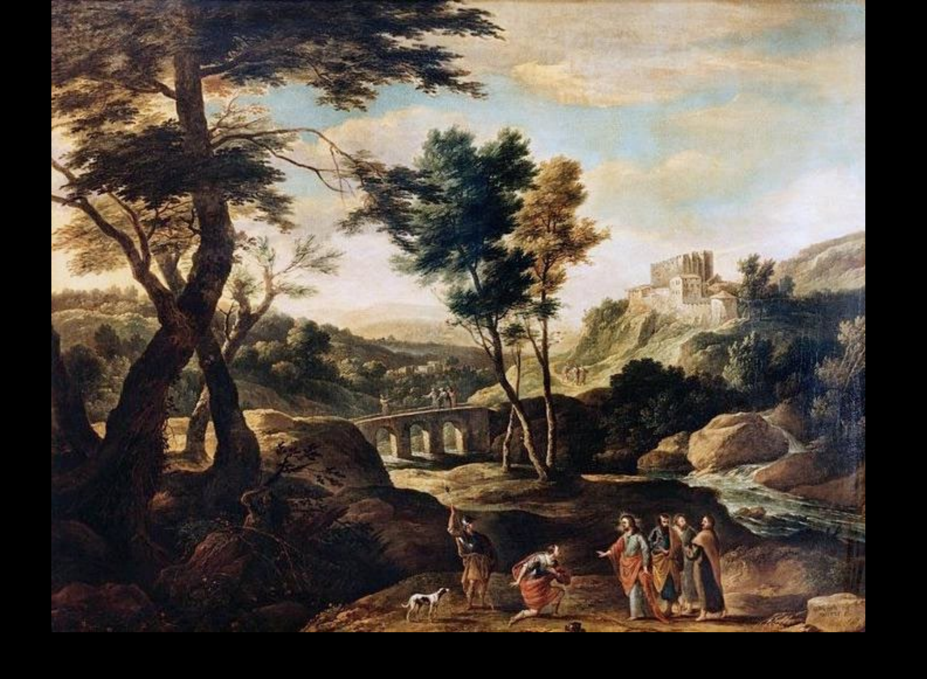
Jesus Heals the Centurion's Servant