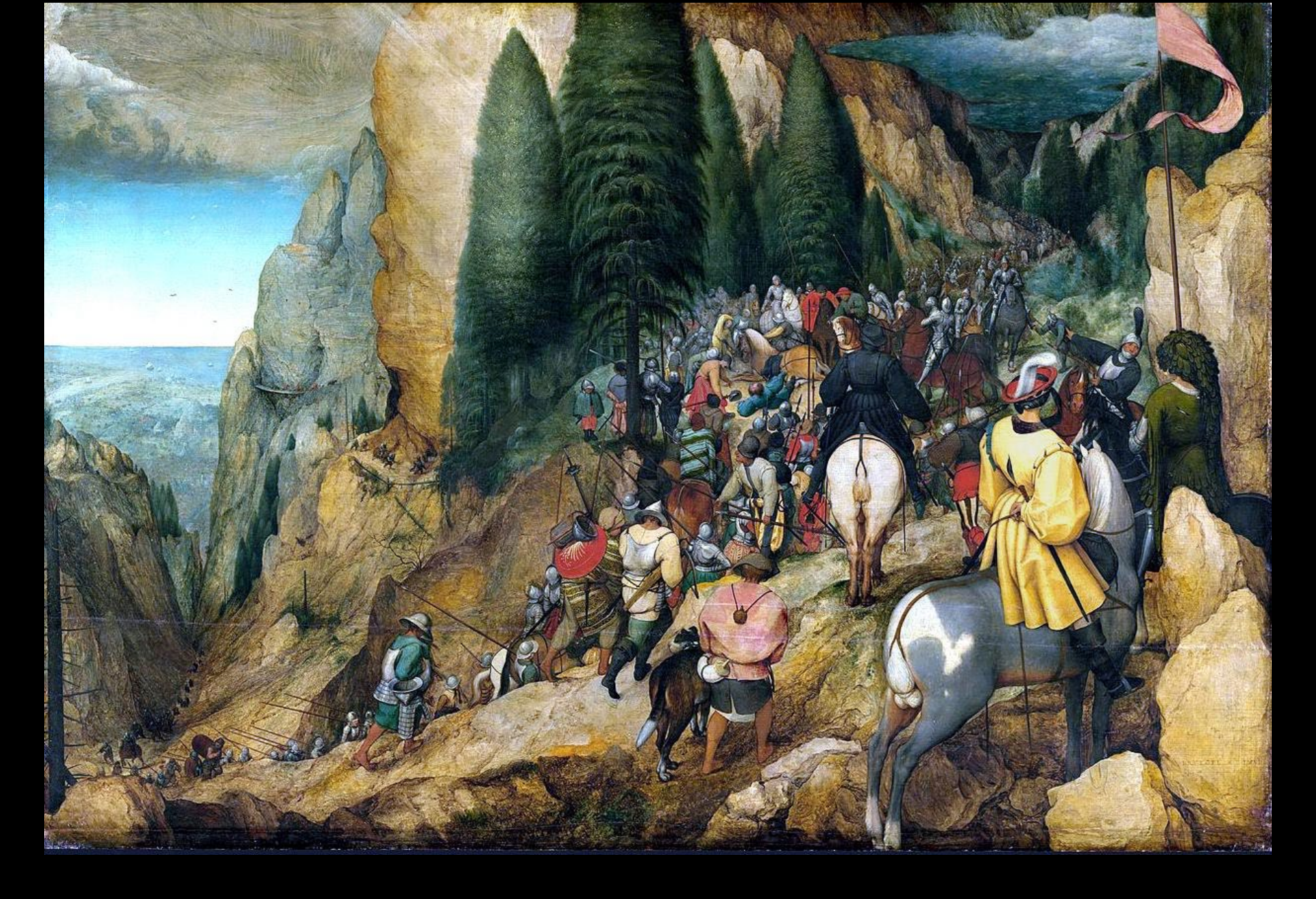
Conversion of Paul, Pieter Bruegel, 1567