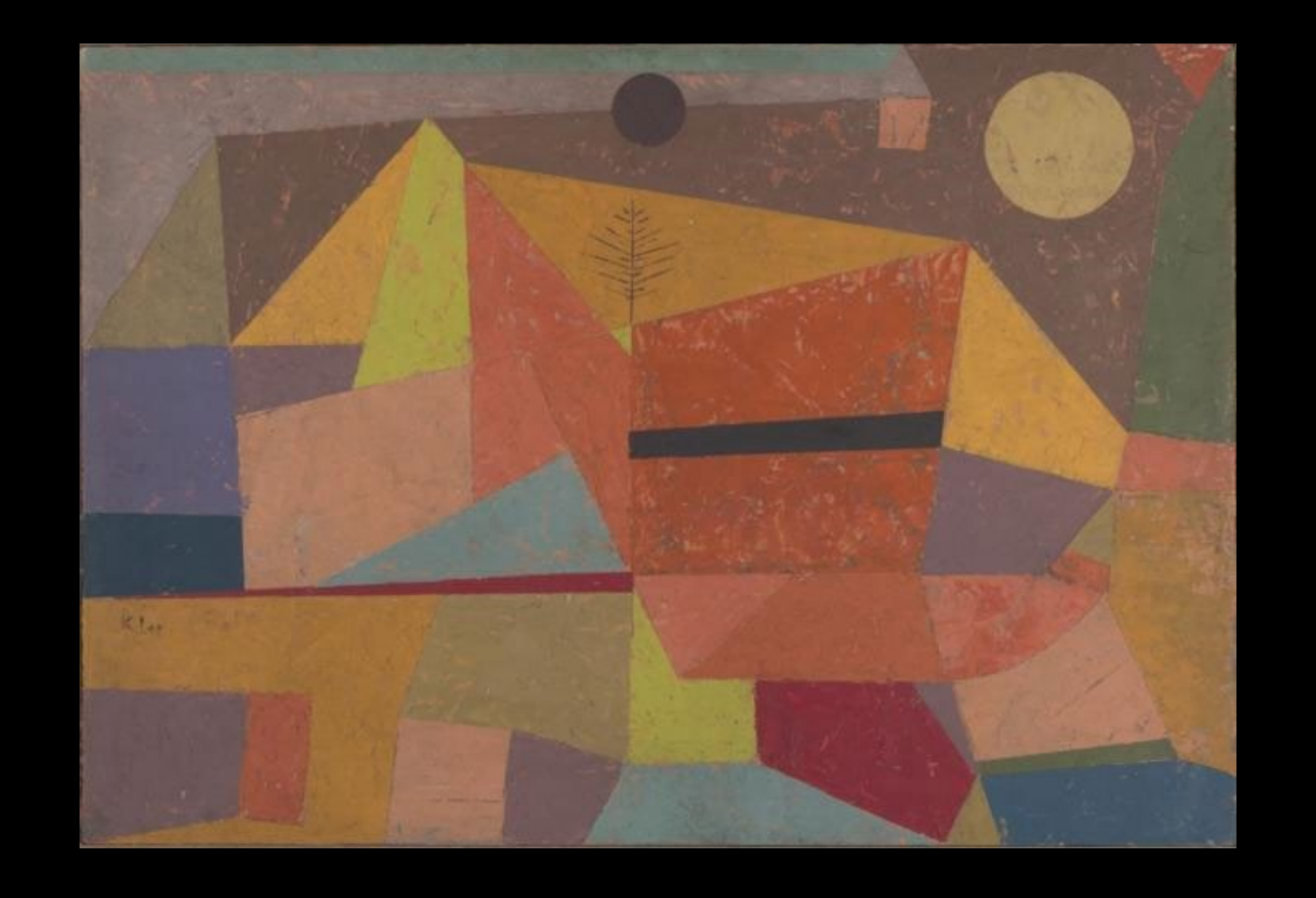
Joyful Mountain Landscape, Paul Klee, 1929