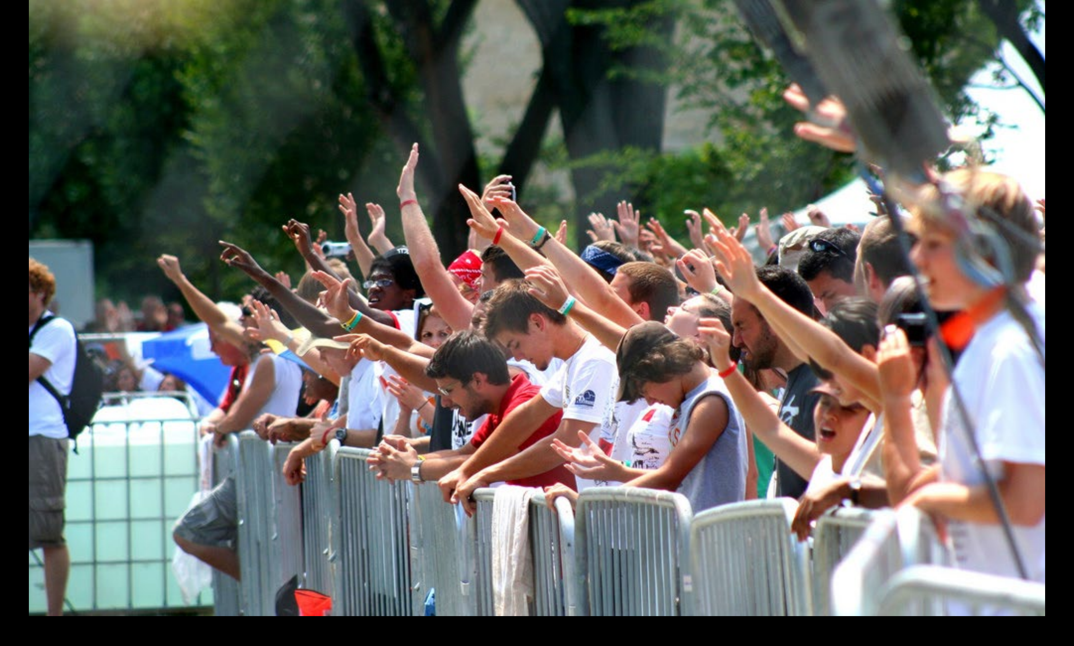
Unite Washington DC, 2008