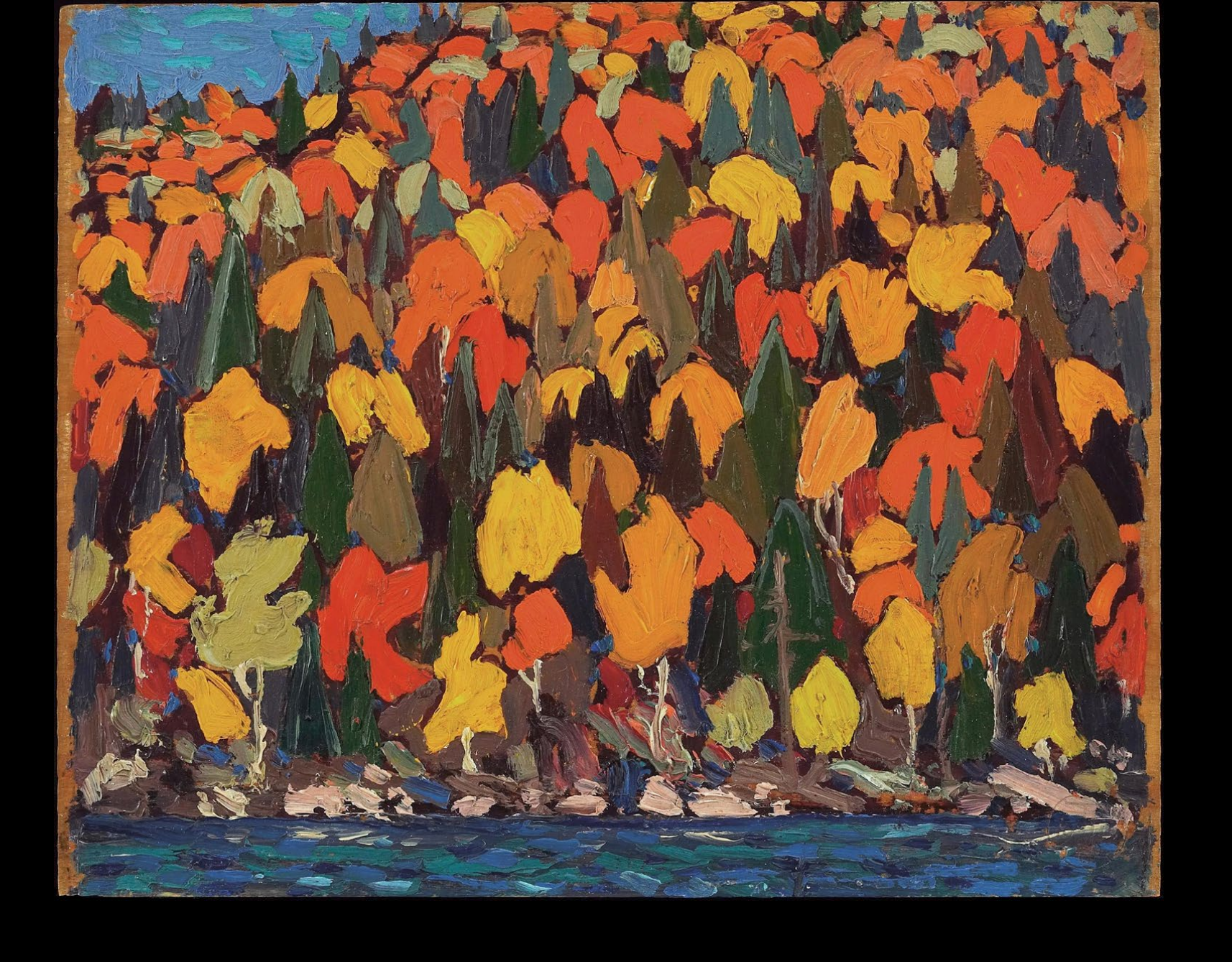
Autumn Foliage, Thomas John Thomson, 1915