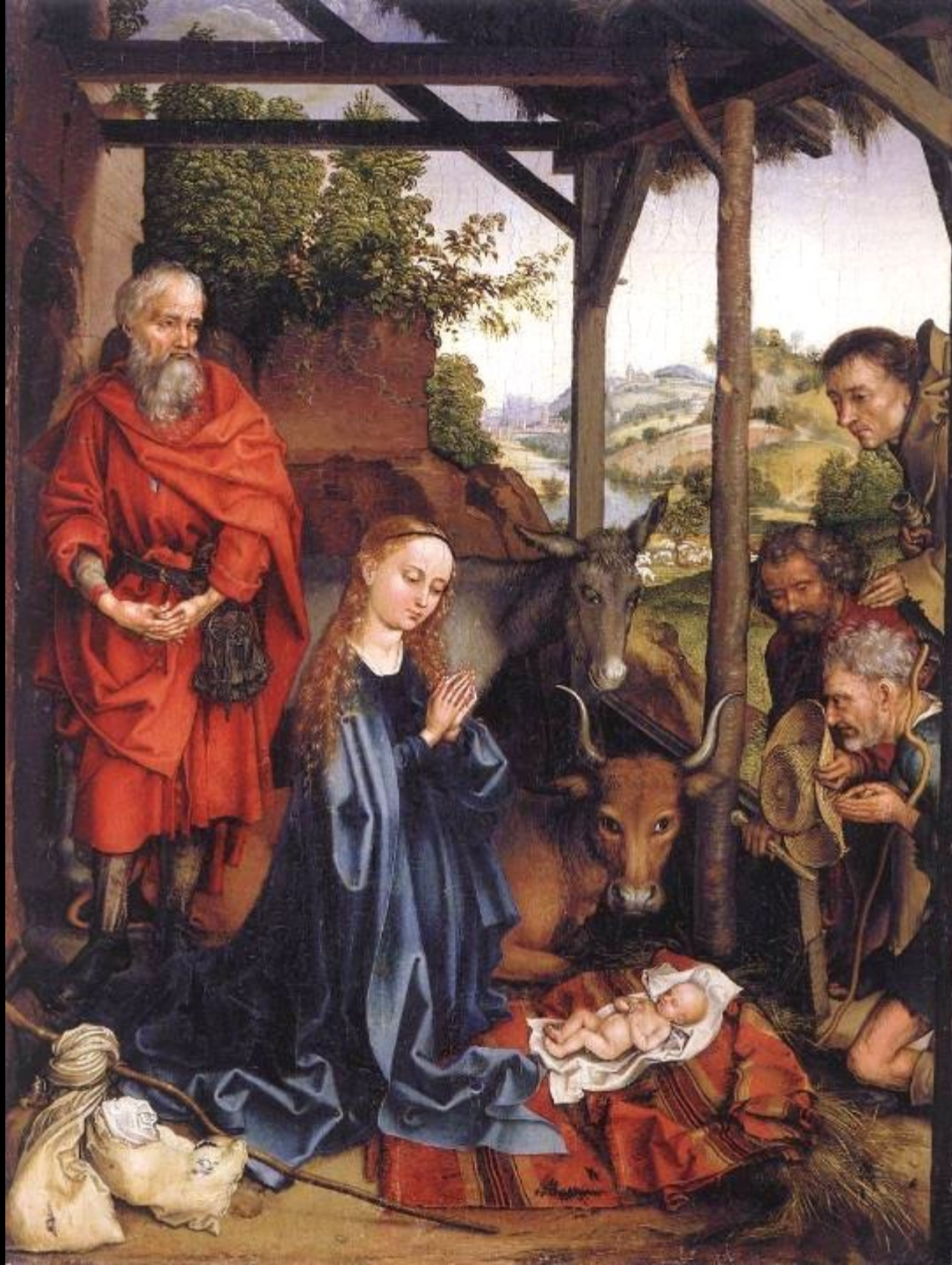
Birth of Christ

Martin Schongauer Gemaldegalerie Berlin, Germany