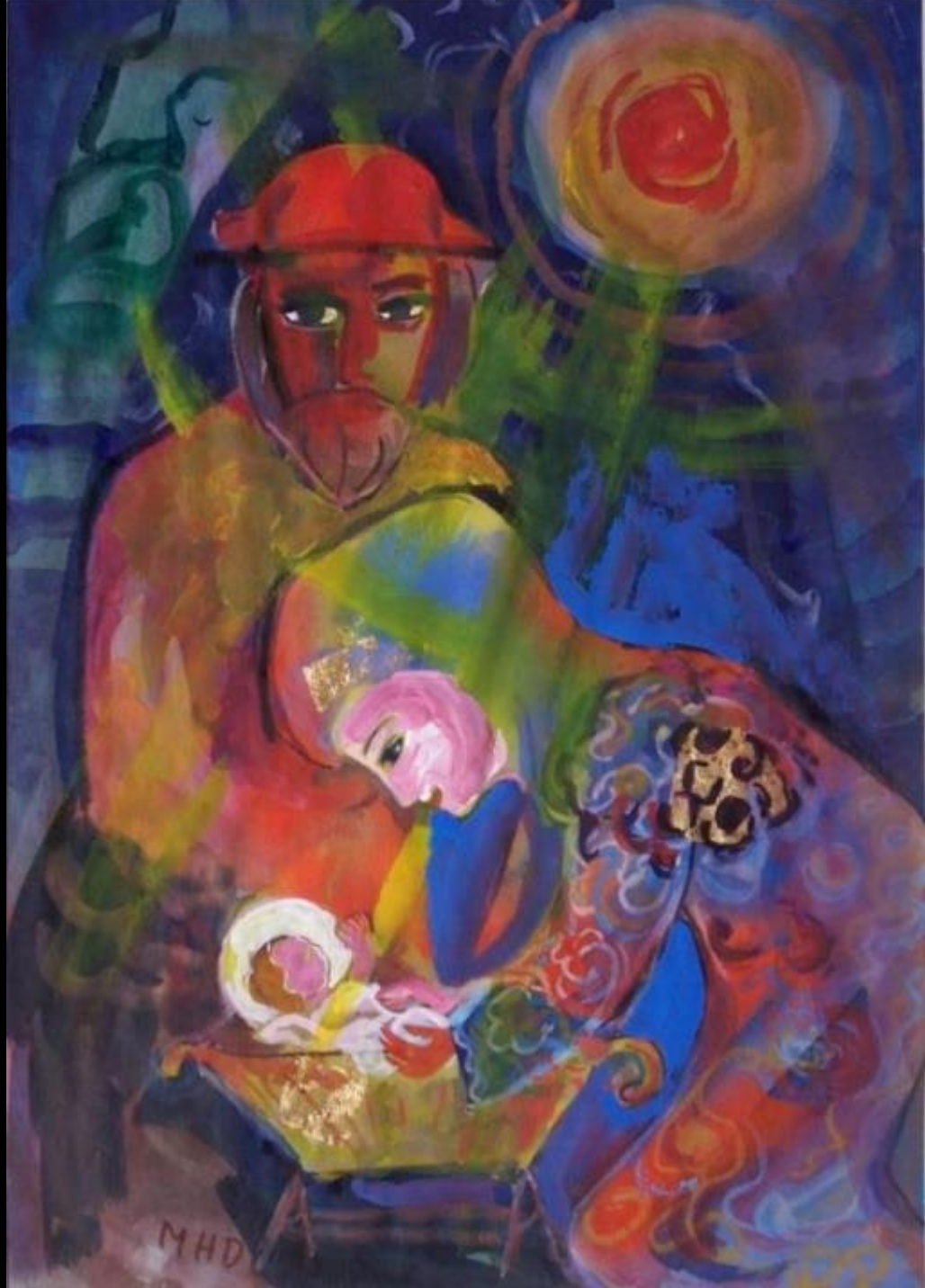
The Birth of Christ