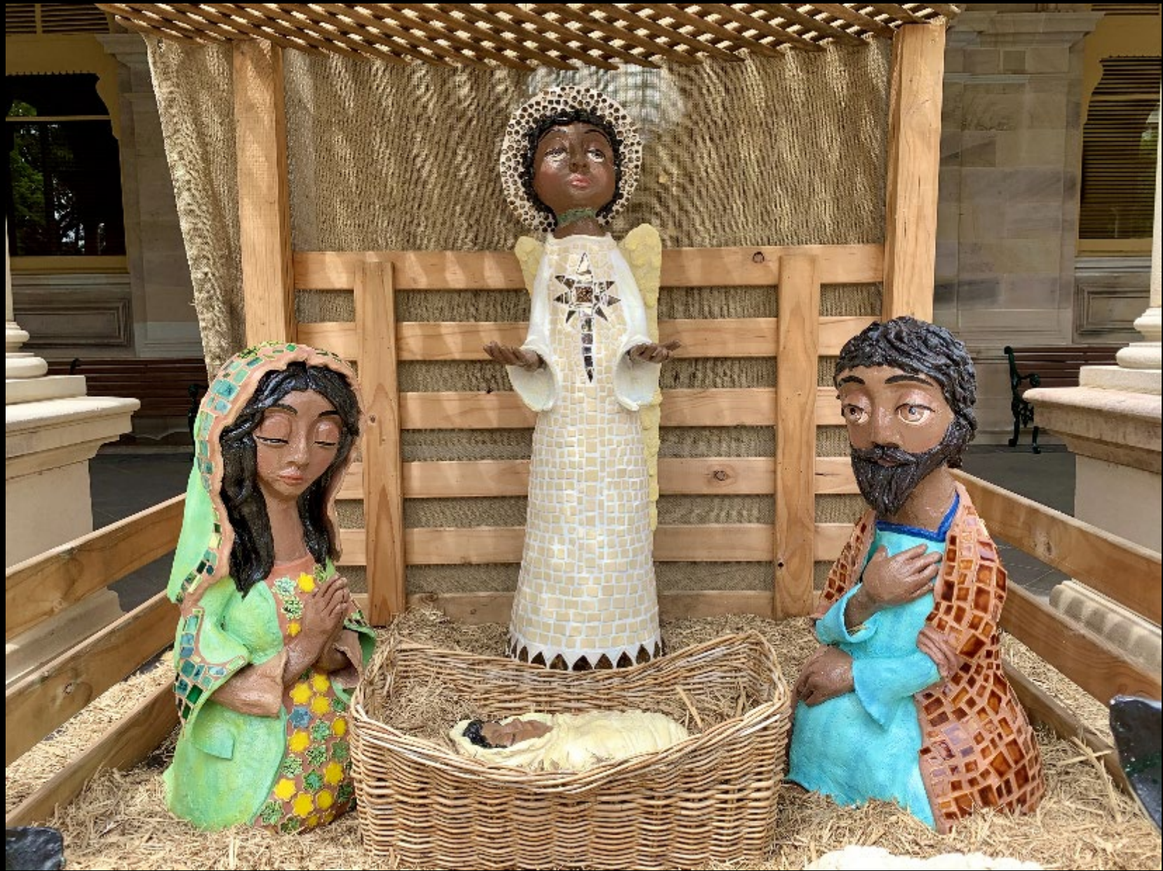
Nativity -- Parliament House, Brisbane, Australia