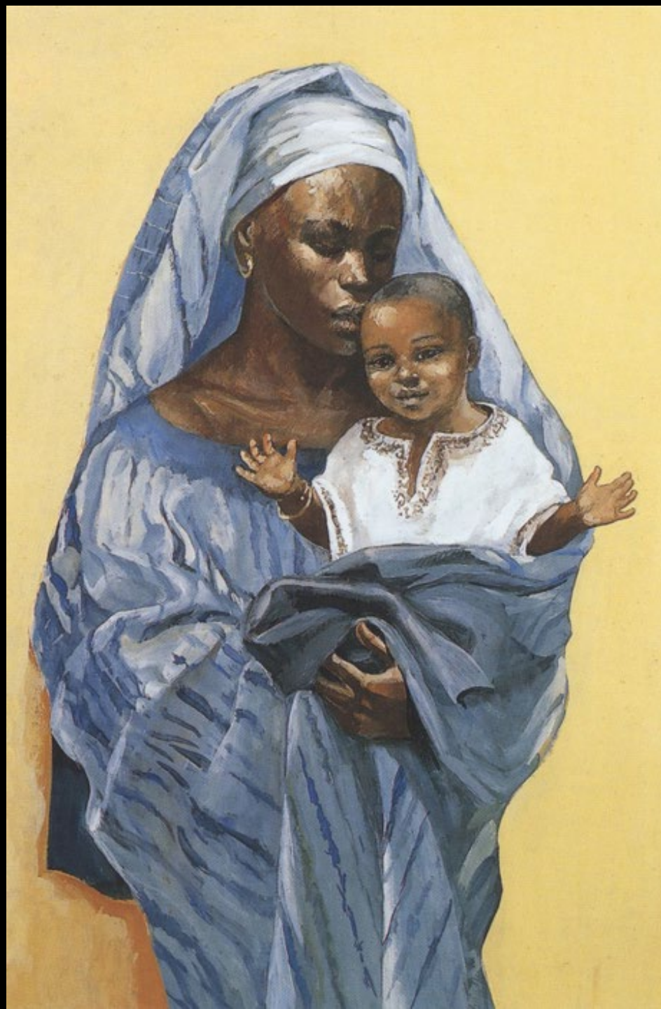
Madonna and Child