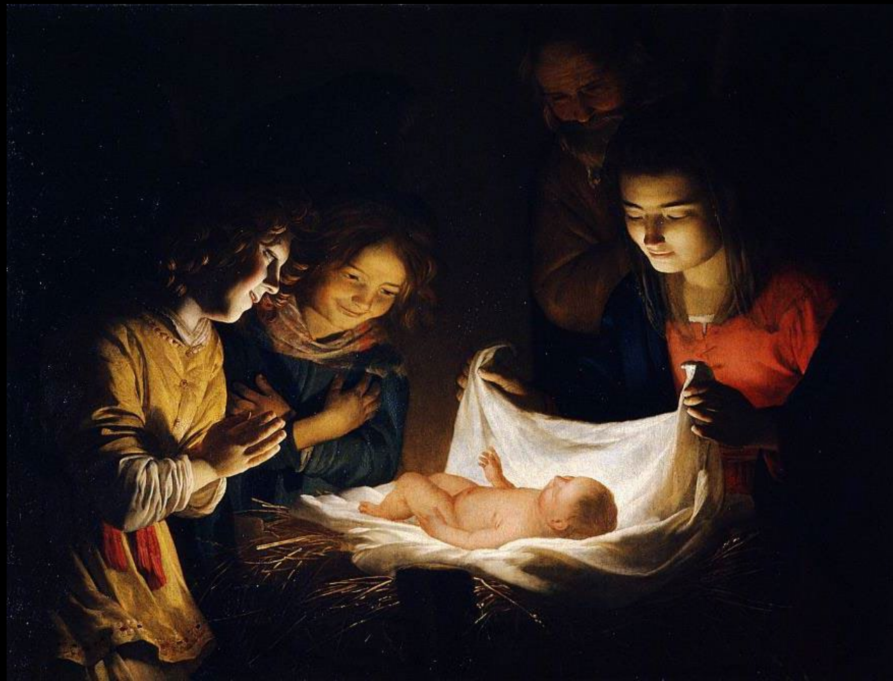
Adoration of the Child -- Gerard van Honthorst, Uffizi Gallery, Florence, Italy