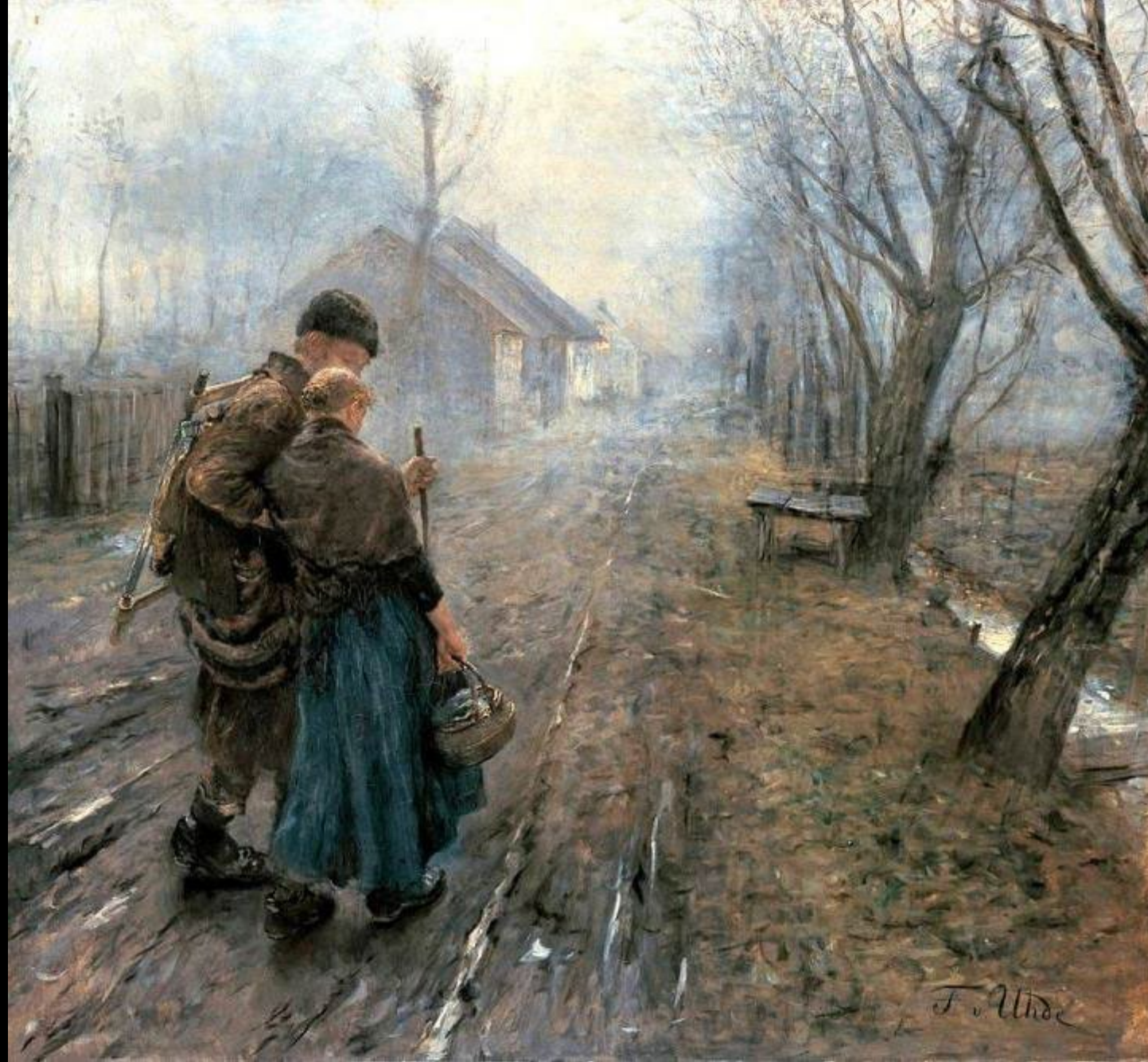
Difficult Journey – Transition to Bethlehem – Fritz von Uhde, Neue Pinakothek, Munich, Germany