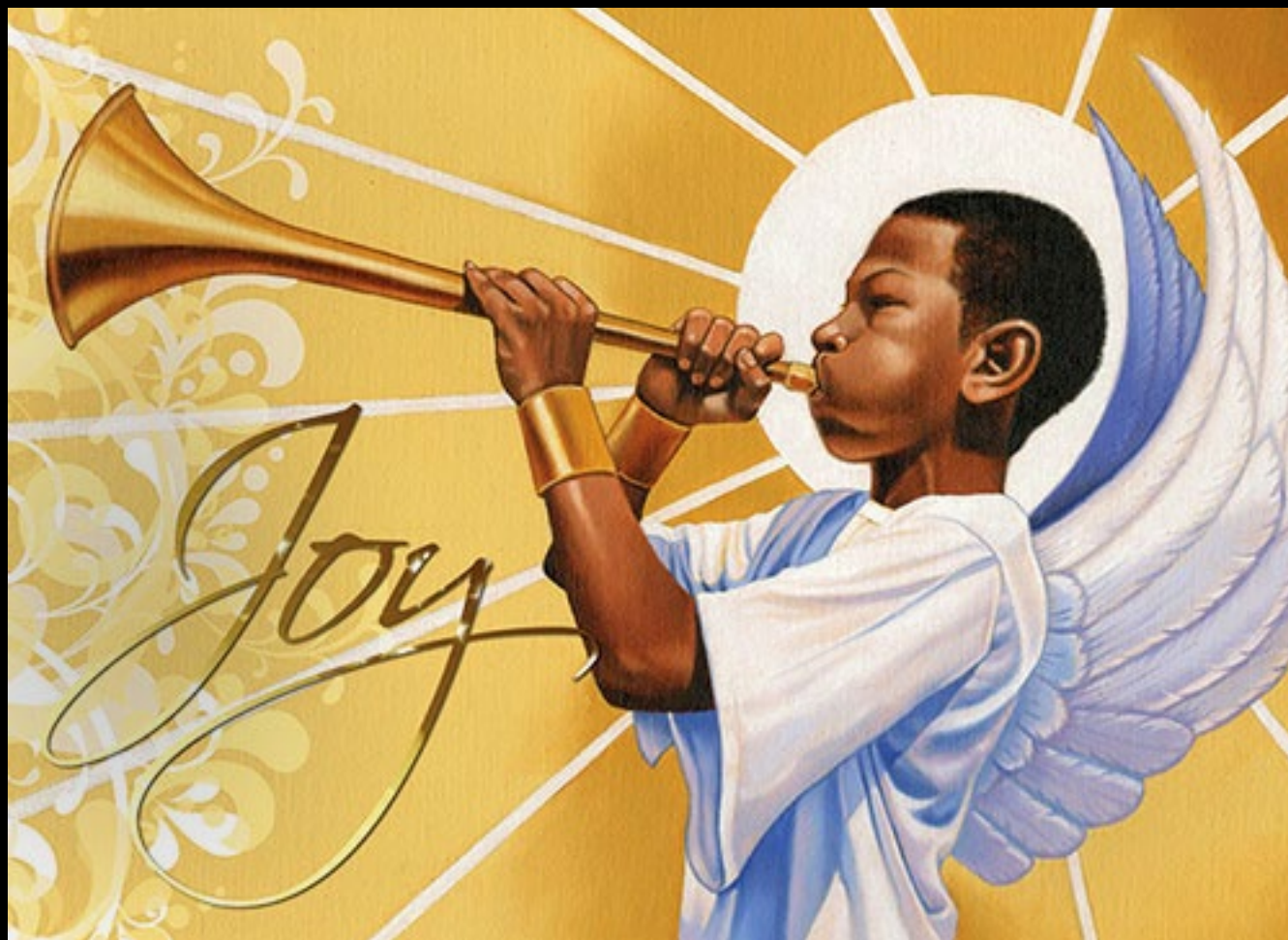
Joy to the World, the Lord is Come -- Illustration from Dem. Republic of Congo