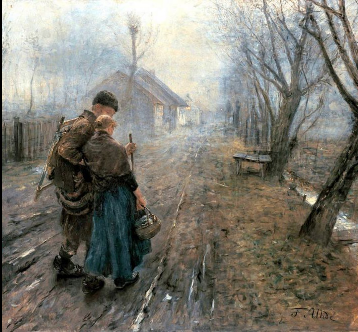
Difficult Journey – Transition to Bethlehem – Fritz von Uhde, Neue Pinakothek, Munich, Germany