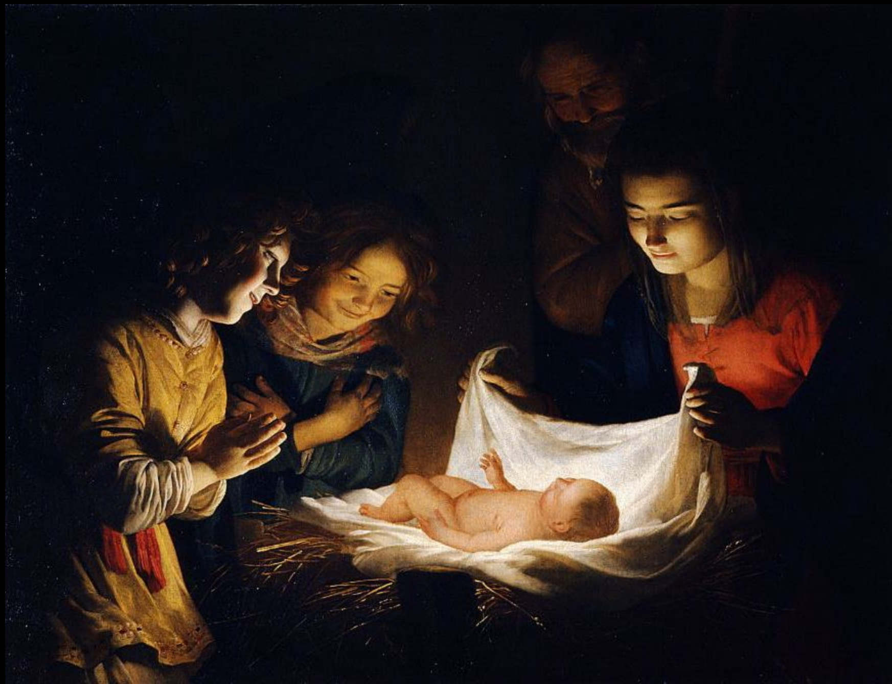
Adoration of the Child -- Gerard van Honthorst, Uffizi Gallery, Florence, Italy