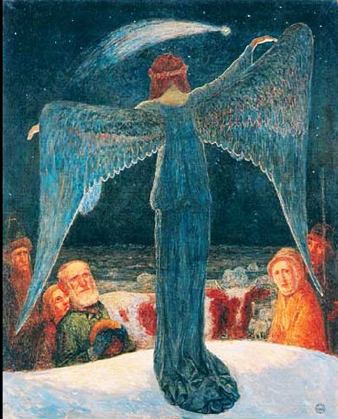
Annunciation to the Shepherds