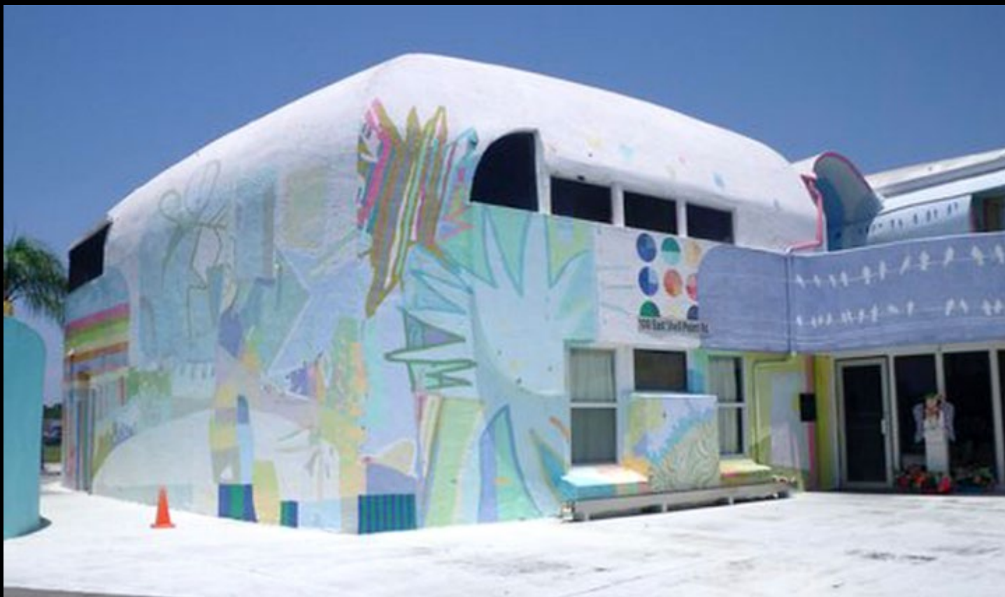
Mary and Martha House -- Domestic Violence Homeless Shelter for Women in Ruskin, FL