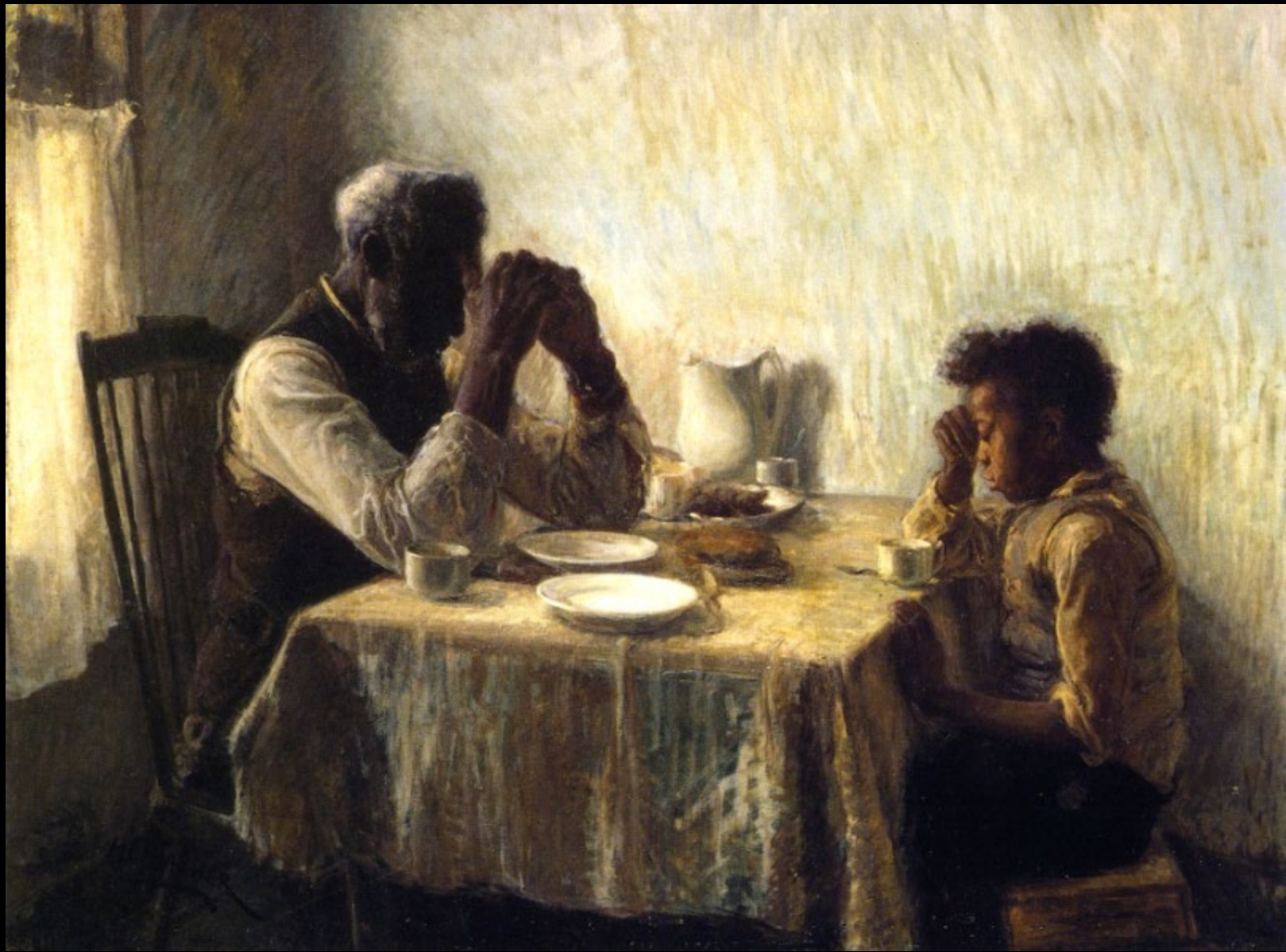
Giving Thanks -- Henry Ossawa Tanner