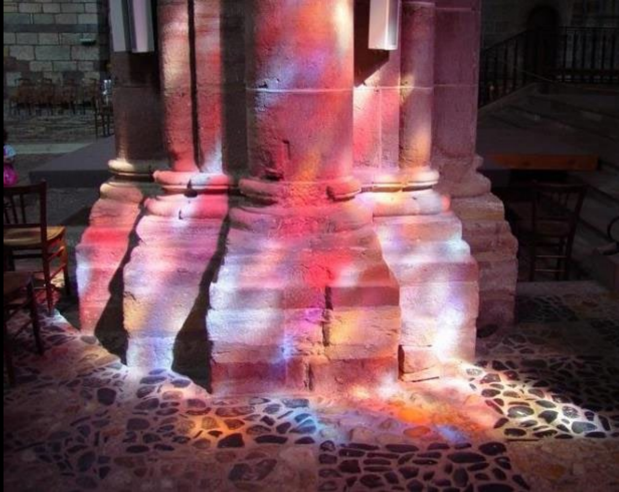
Interior Light -- Saint-Julien, Brioude, France