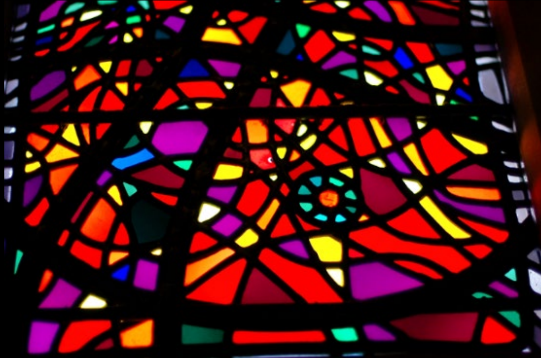
Light and Color -- Washington National Cathedral, Washington, DC