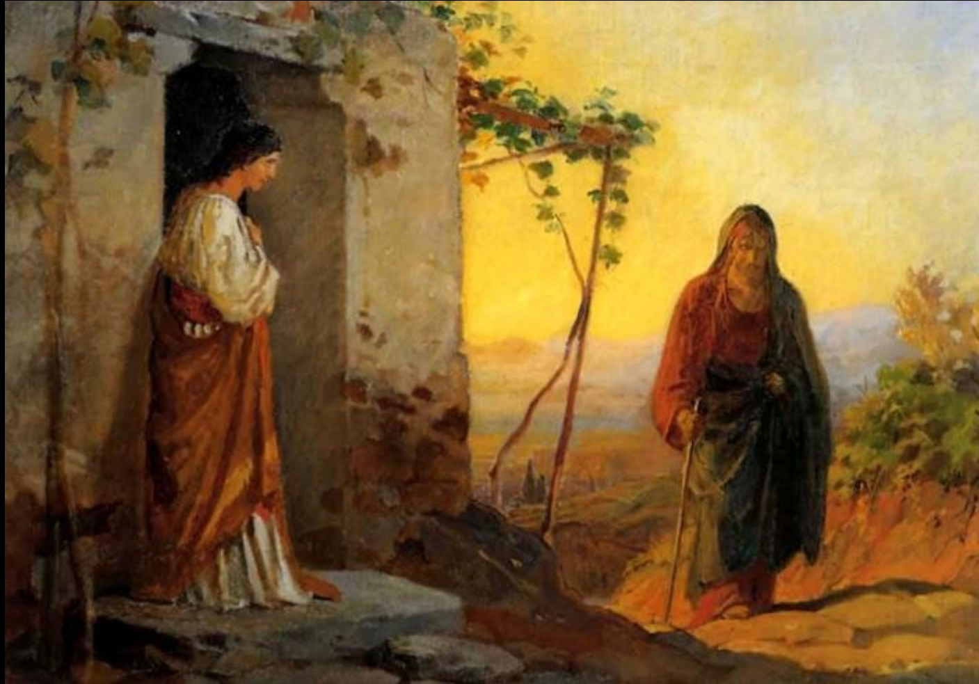
Mary Greetes Jesus -- Nikolas Ge