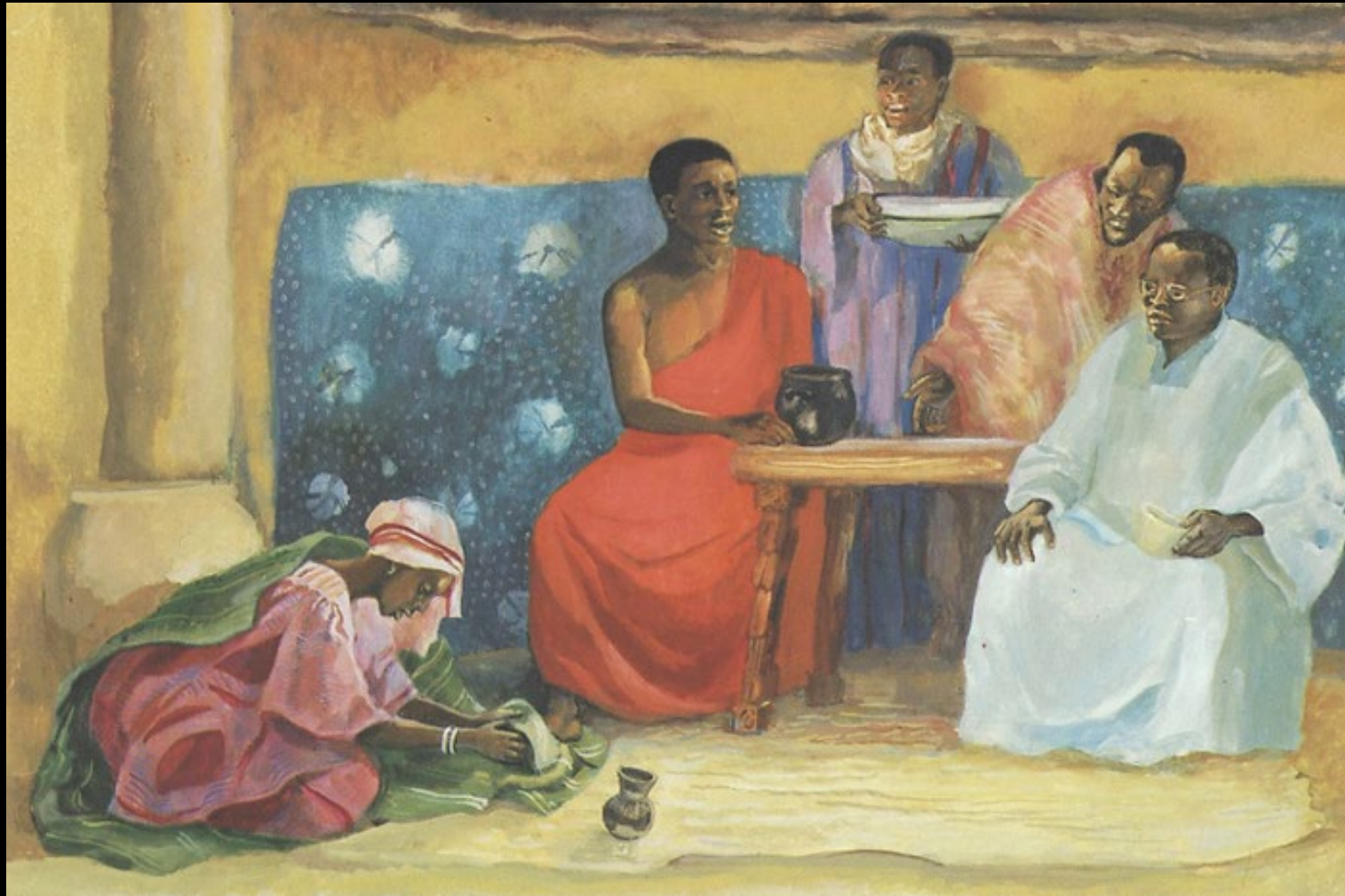
Anointing of Jesus' Feet -- JESUS MAFA, Cameroon