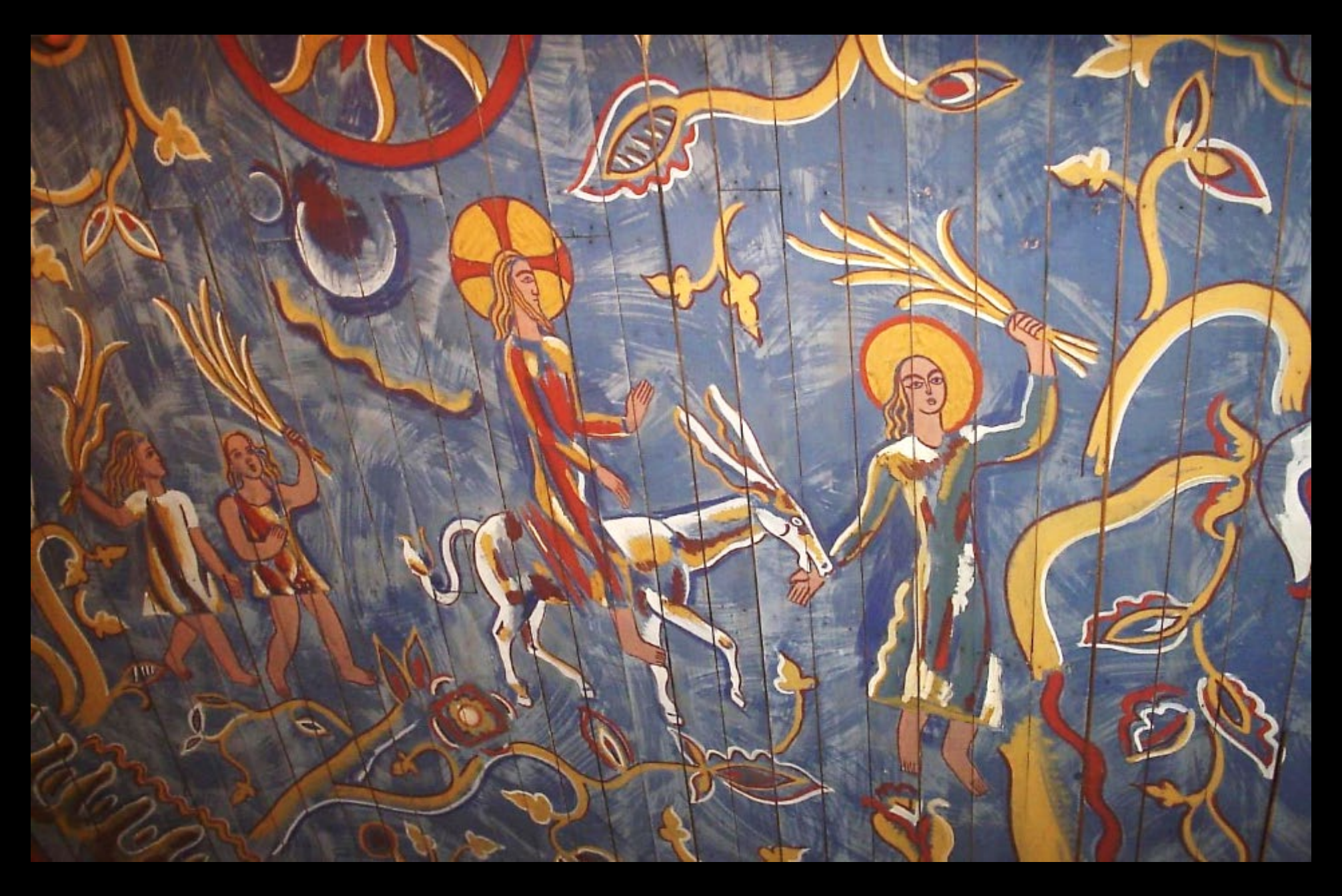
Christ on the Colt -- Church of Saint Matthew, Methodist Assembly, Goteborg, Sweden