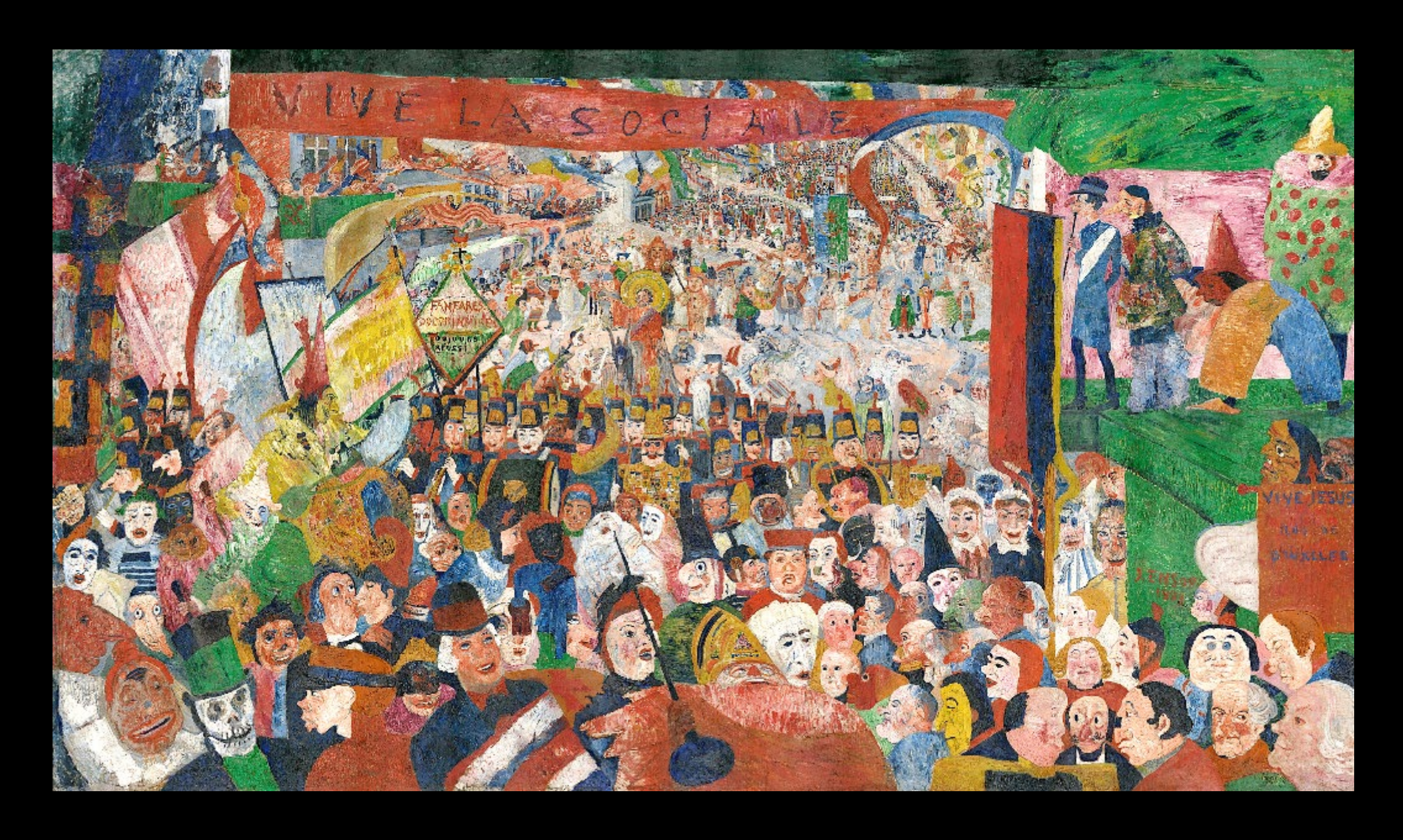
Christ's Entry into Brussels, 1889 -- James Ensor, Getty Museum, Los Angeles, CA