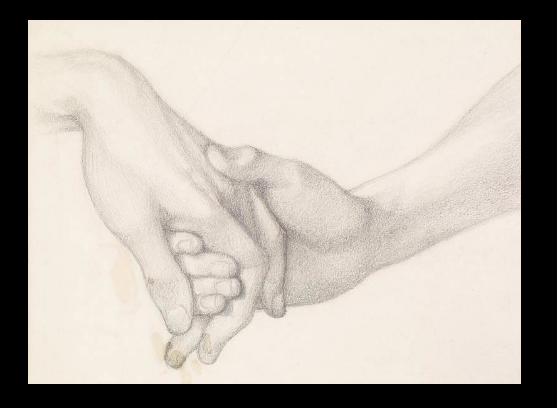
Hand of Love (study) -- Dante Rossetti, Birmingham Museum, Birmingham, England