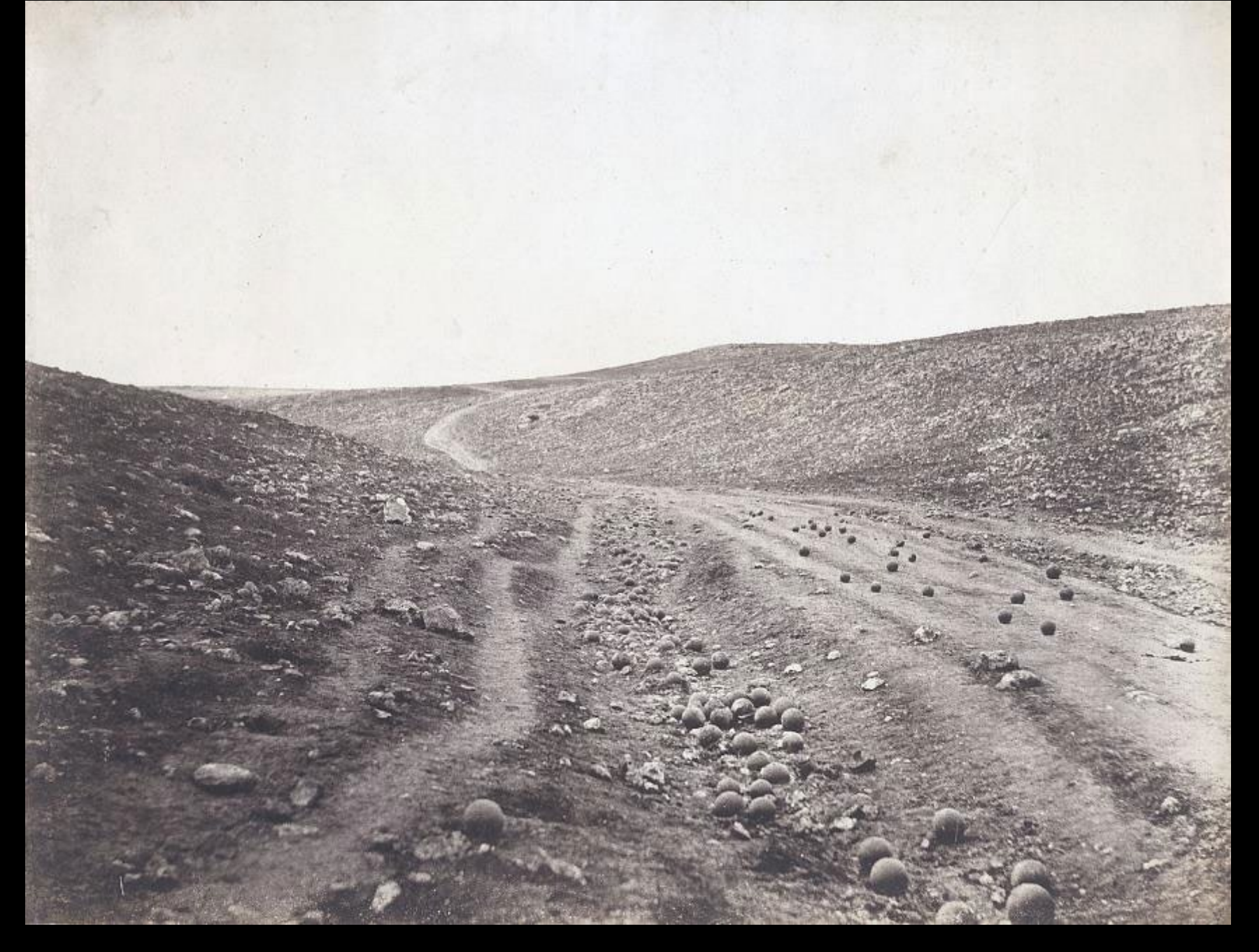
Valley of the Shadow of Death, Crimean War -- Roger Fenton, V&A Museum, London