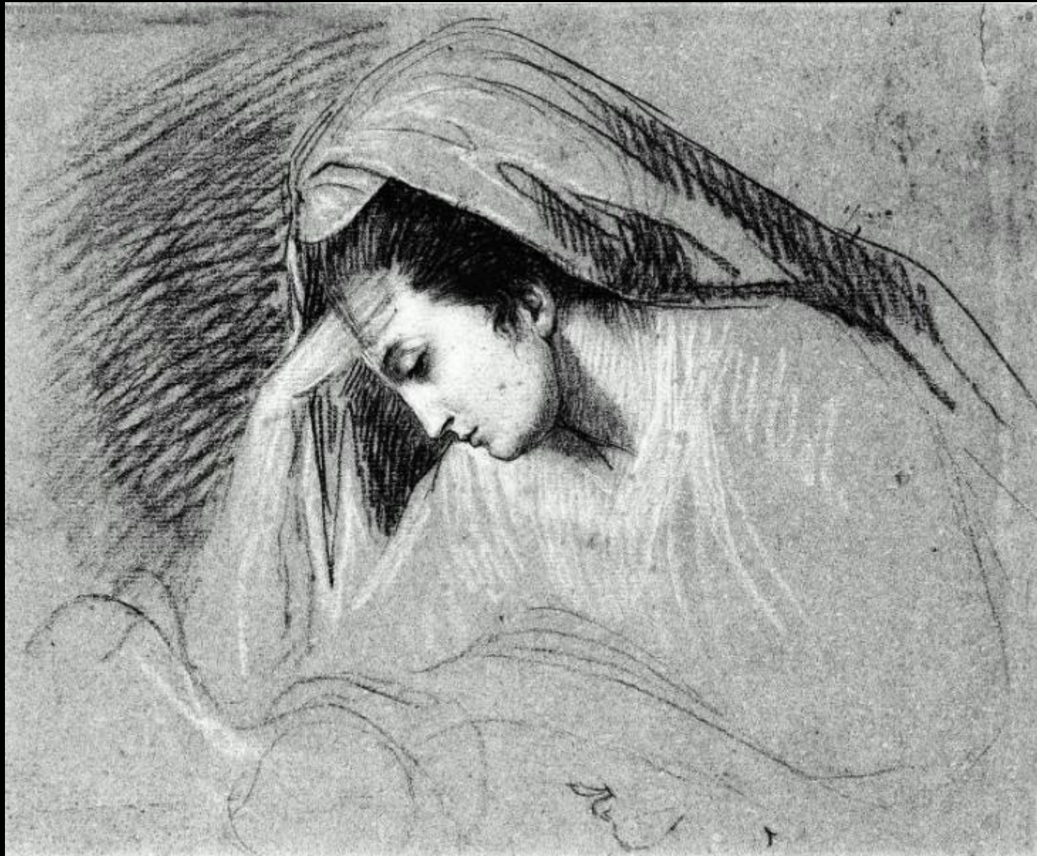
Study for the Head of the Virgin -- John Singleton Copley, Museum of Fine Arts, Boston, MA