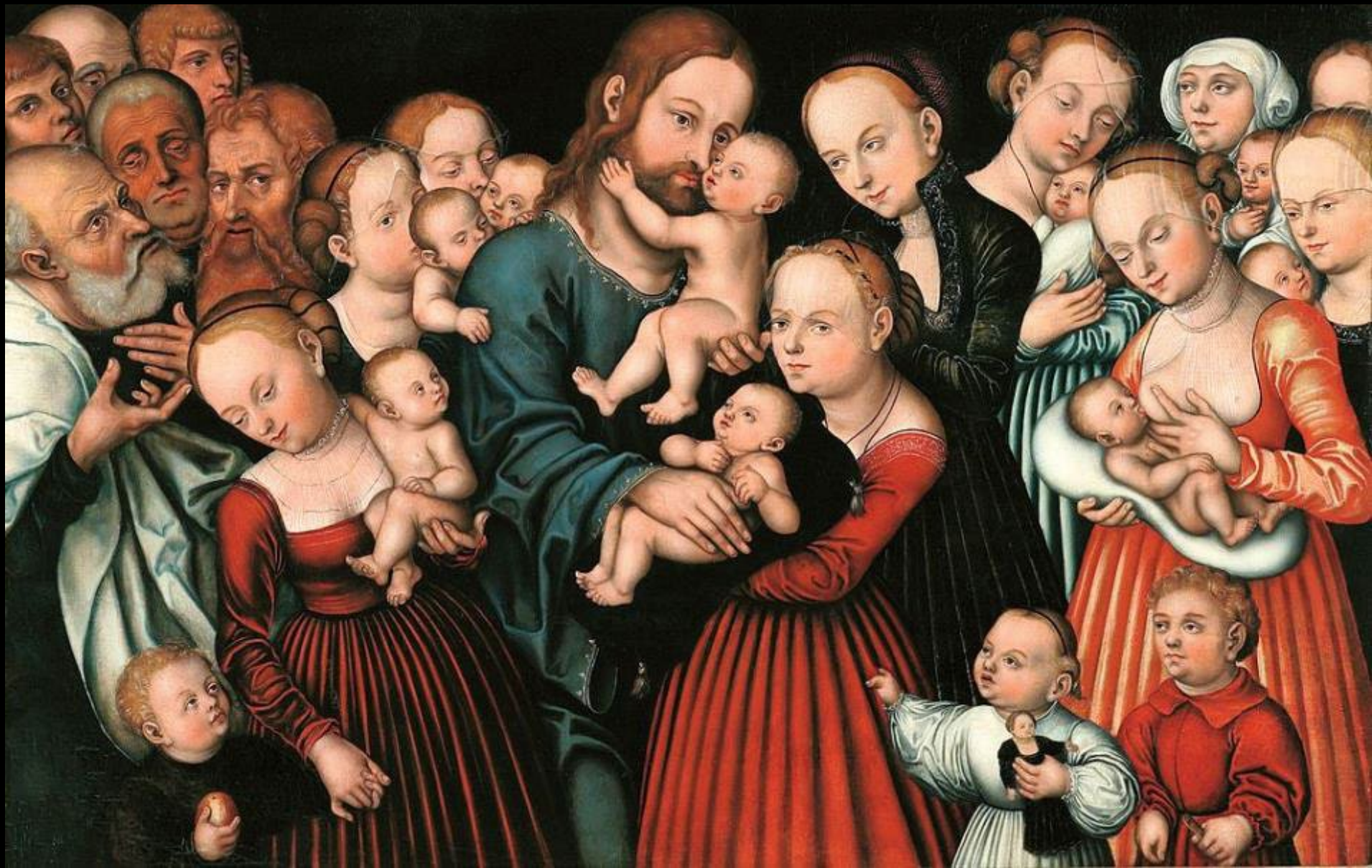
Christ Blessing the Children -- Lucas Cranach, Wawel Castle, Krakow, Poland