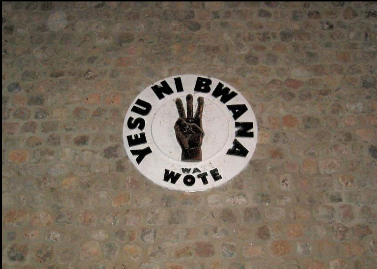
Jesus is Lord of All -- Panel in Chapel, Mulungwishi Mission, D. R. Congo