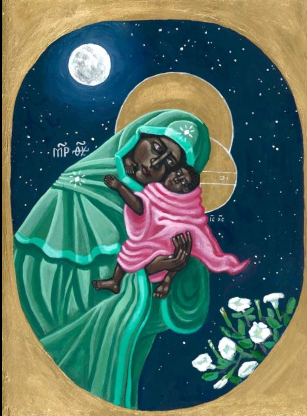
Mary and Jesus