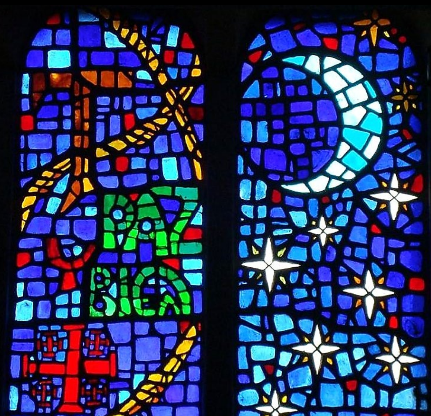
Moon and the Stars Window