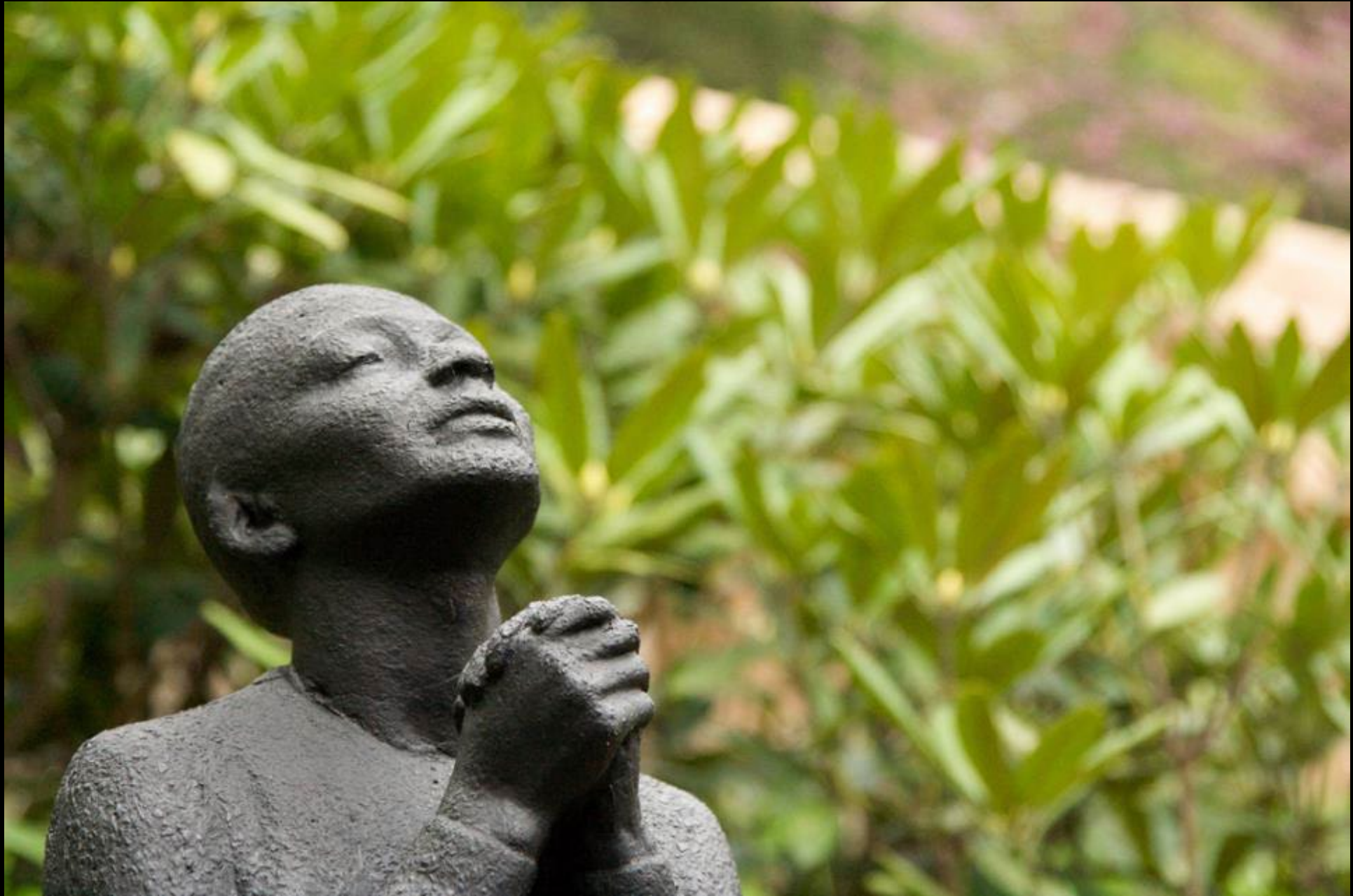
Rose McClendon in Prayer -- Richmond Barthe, Fallingwater, PA