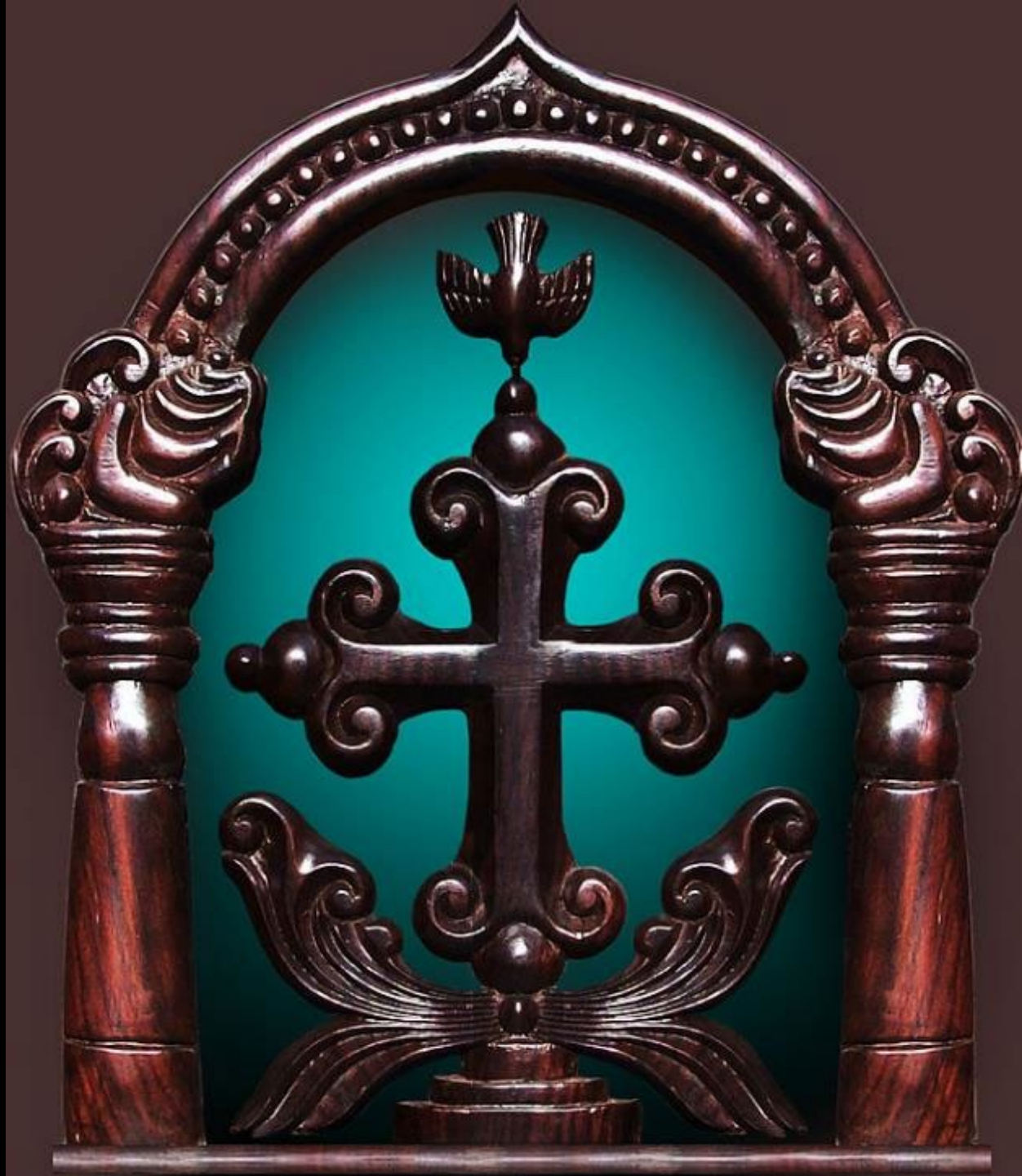
Mar Thoma Sliva Cross