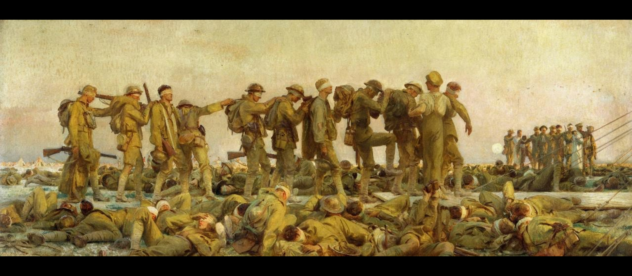
Gassed -- John Singer Sargent, Imperial War Museum, London, England