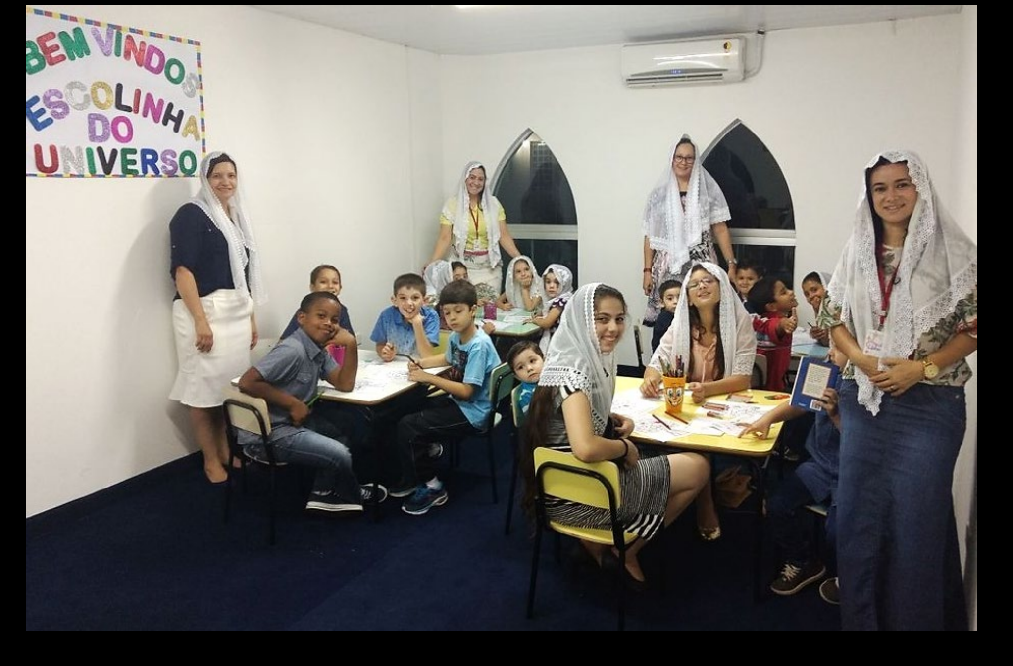
Children's Sunday School -- Pentecostal Church, Brazil