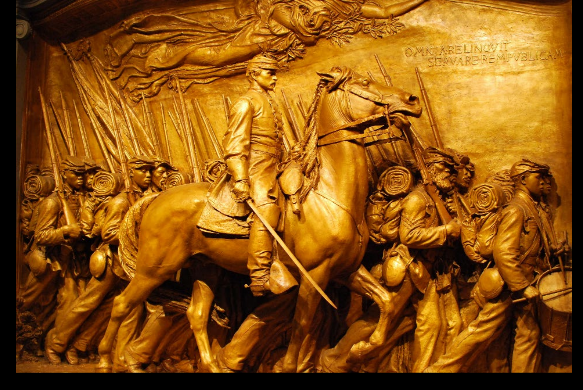
Shaw Memorial, Civil War -- Augustus Saint-Gaudens, National Gallery of Art, Washington, DC