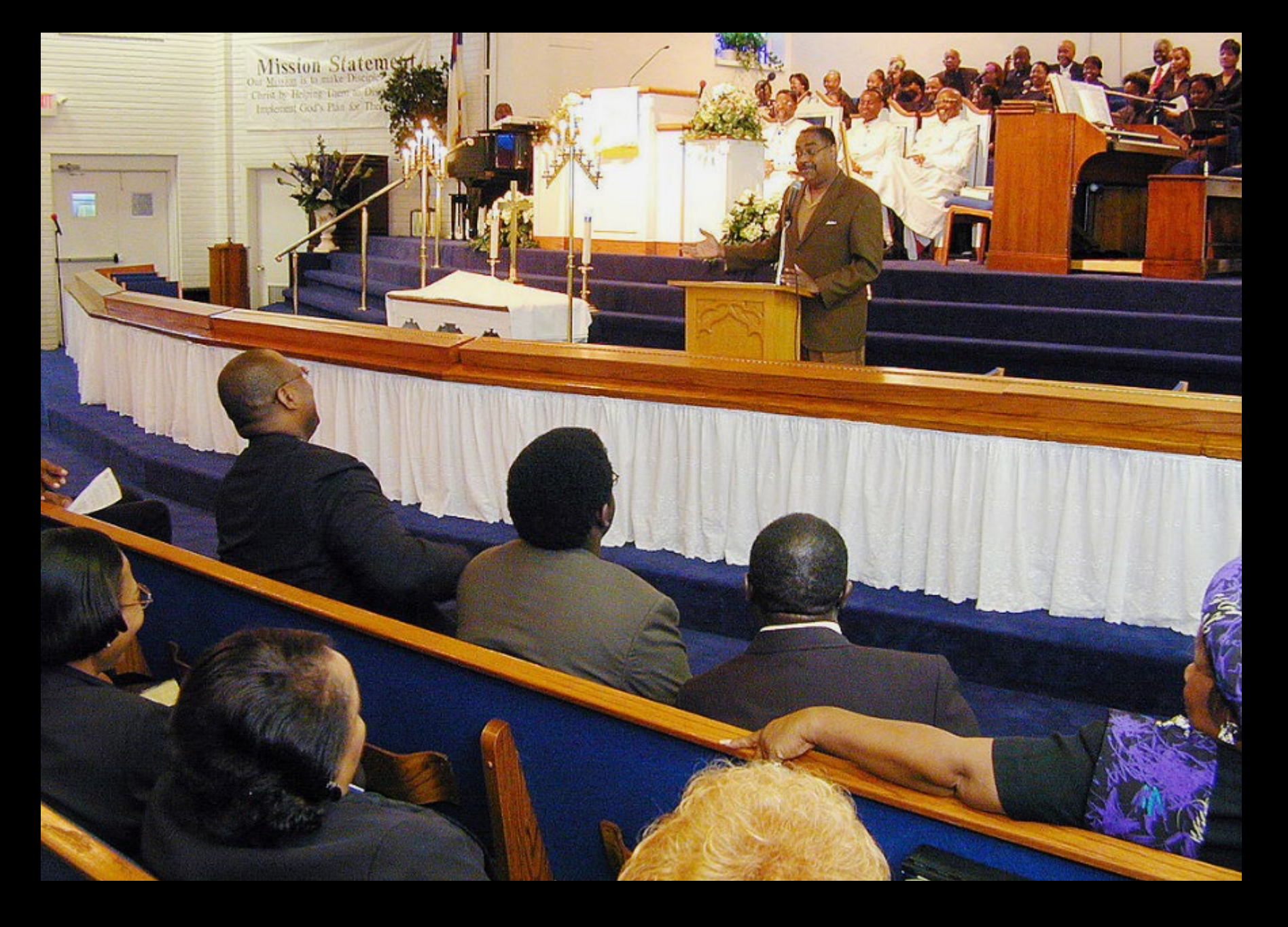
Address on Flood Relief, Payne Memorial AME Church, Houston, TX