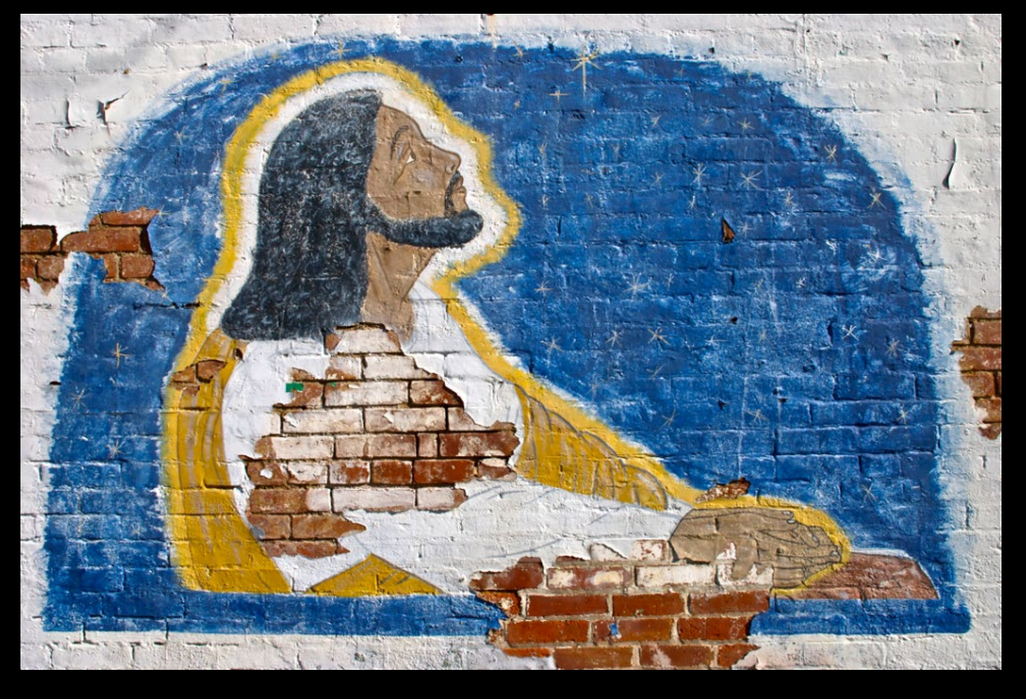
Jesus Christ -- Mural, West End, Louisville, KY