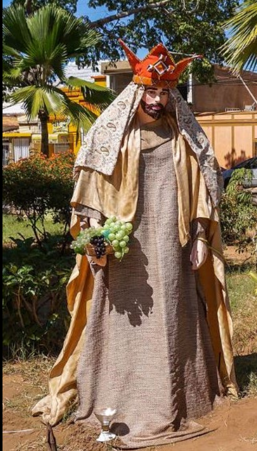
Figure of the Tres Reyes Magos Maracaibo, Venezuela