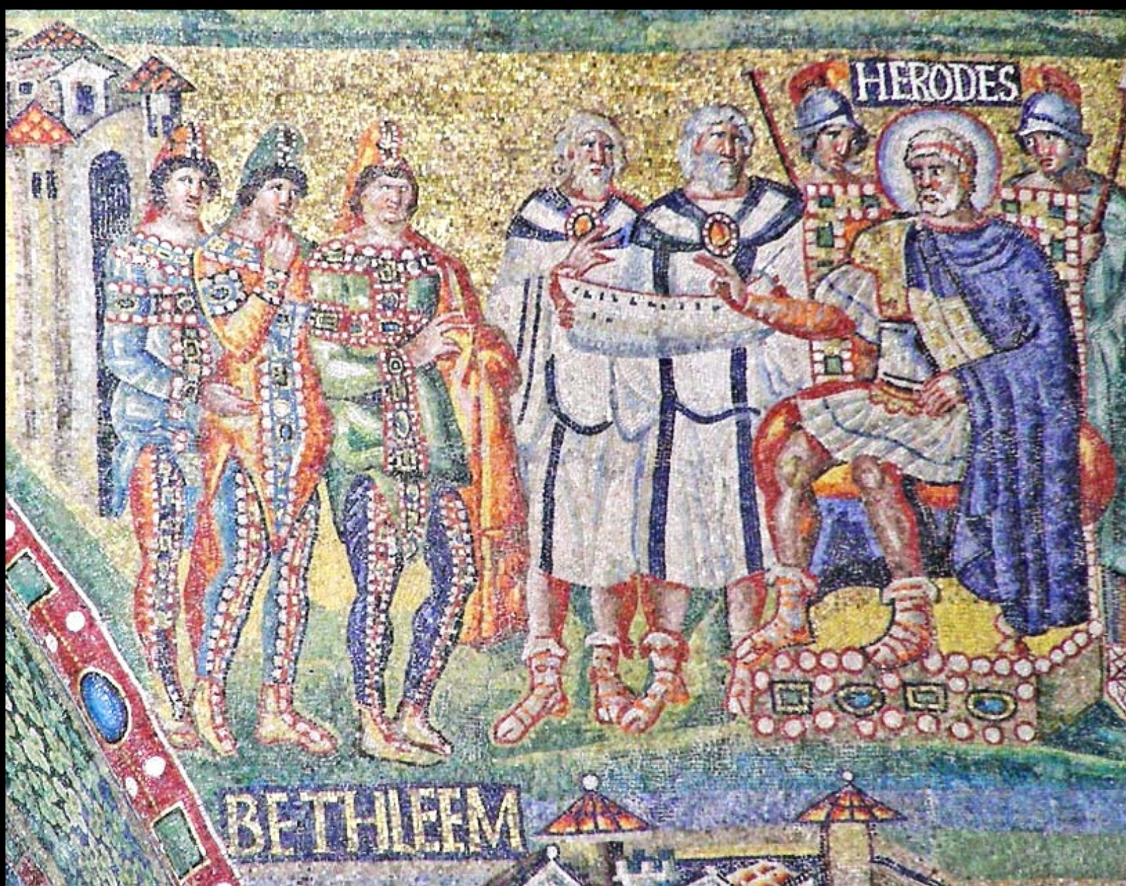
Herod Speaks with the Magi -- Mosaic, Santa Maria Maggiore, Rome, Italy