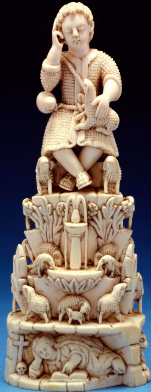
Christ Child as Good Shepherd

Goa, India Walters Art Museum Baltimore, MD