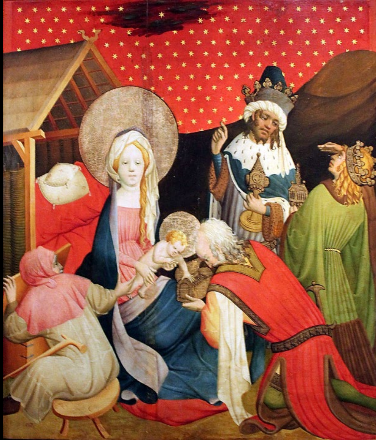
Adoration of the Magi

Master Francke Kunsthalle Hamburg Hamburg, Germany