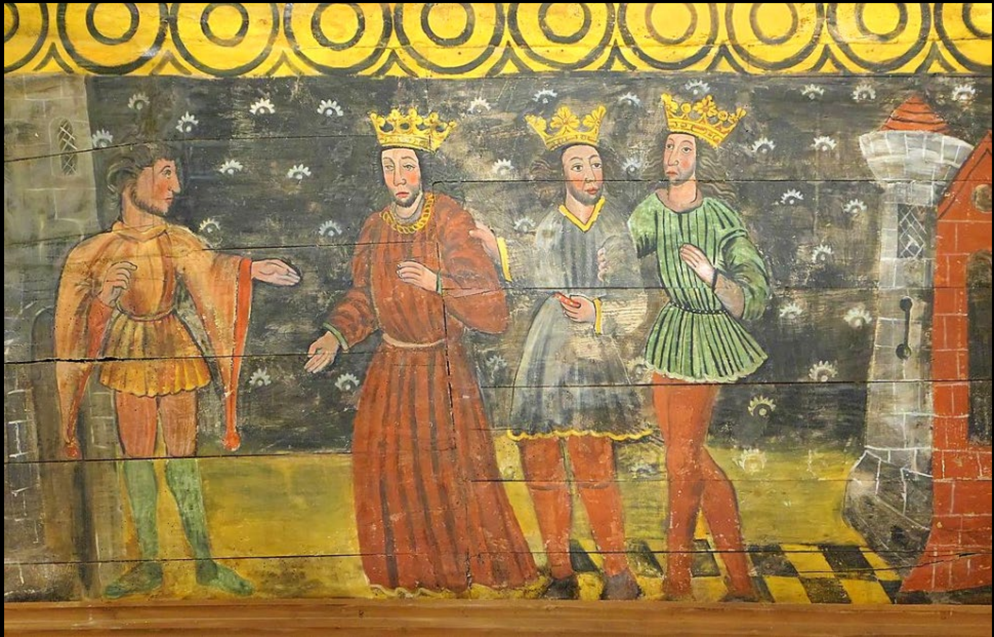
Herod with the Three Kings -- Church of Saint-Gonery, Plougrescant, France