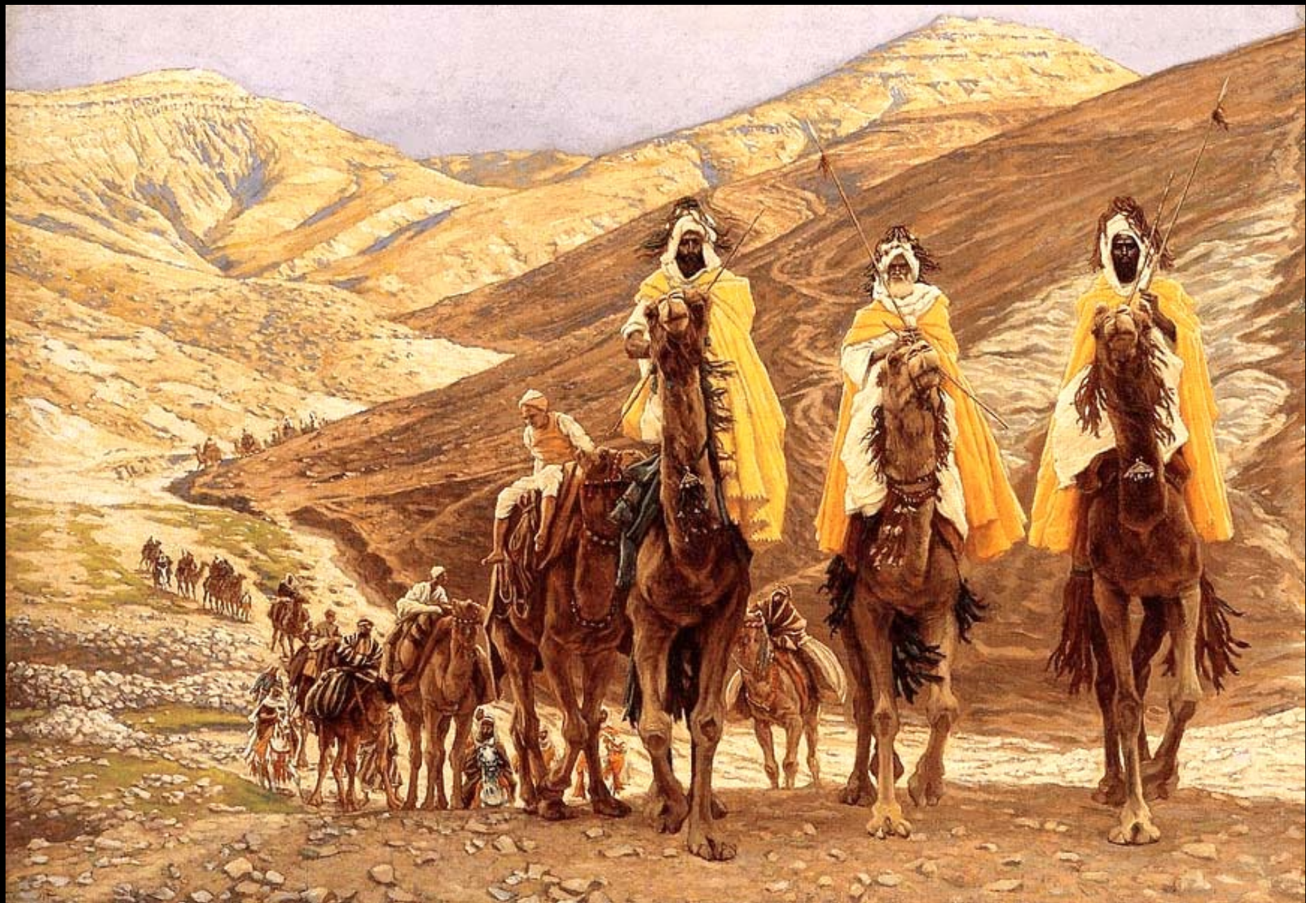
Journey of the Magi -- James Tissot, Minneapolis Institute of Art, Minneapolis, MN