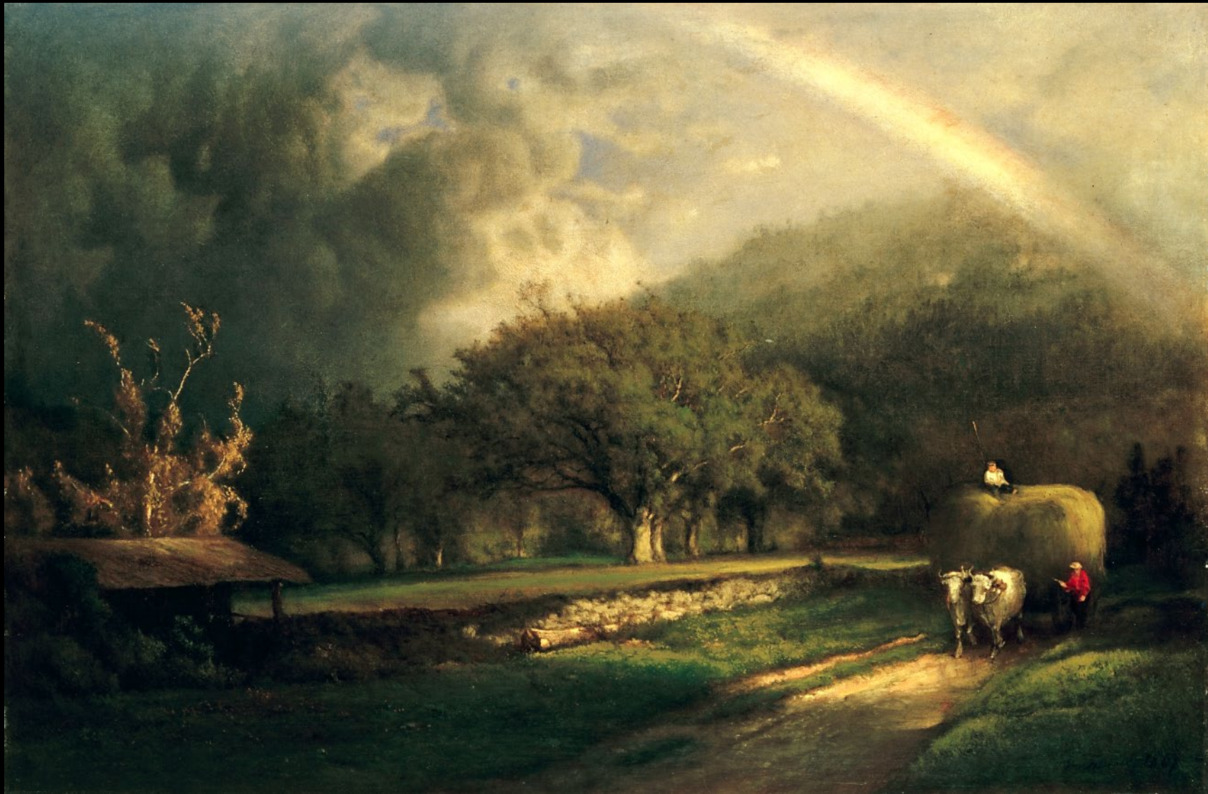
Rainbow in the Berkshire Hills George Inness, 1869