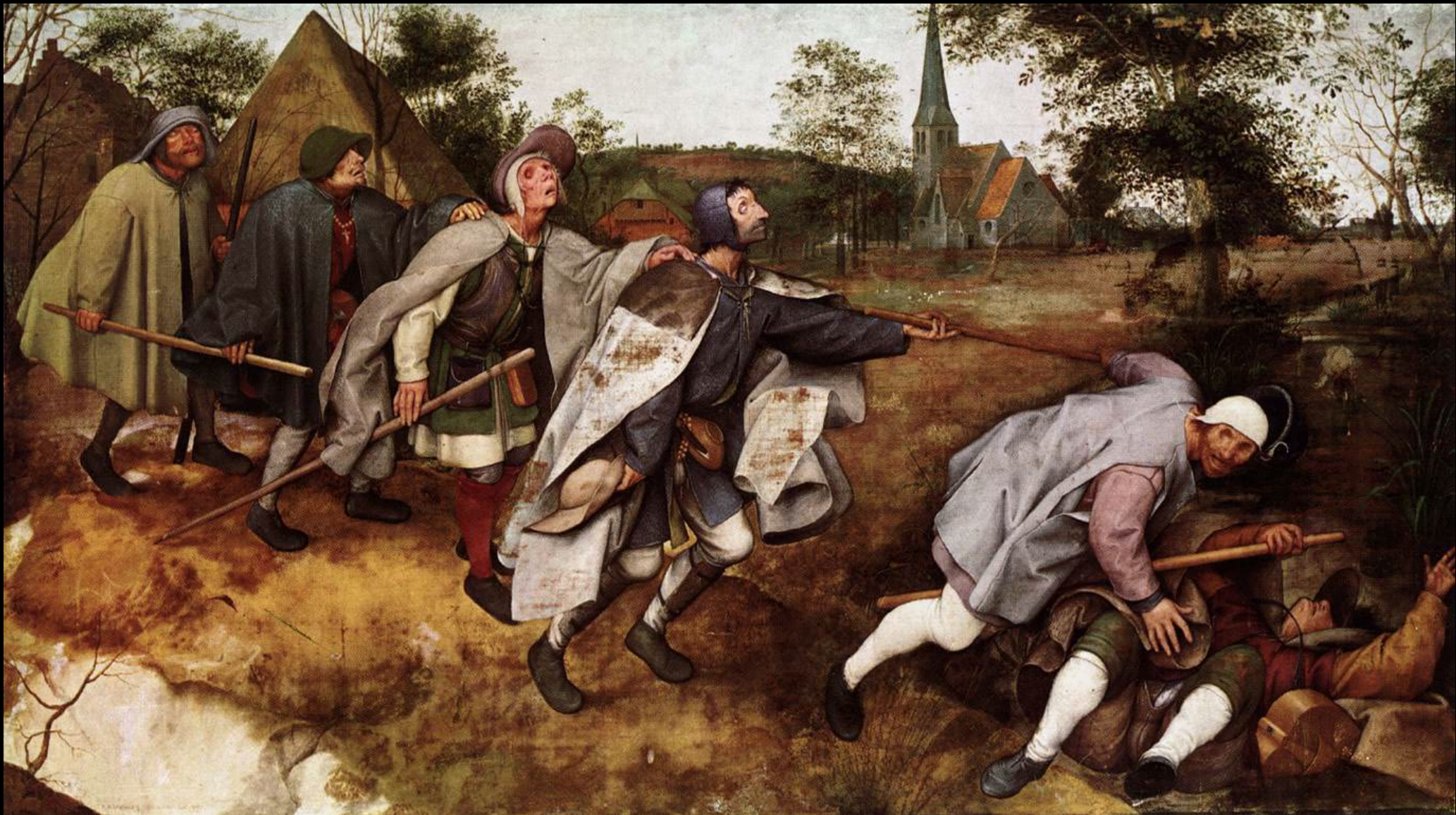
Calling of the Disciples -- JESUS MAFA, Cameroon