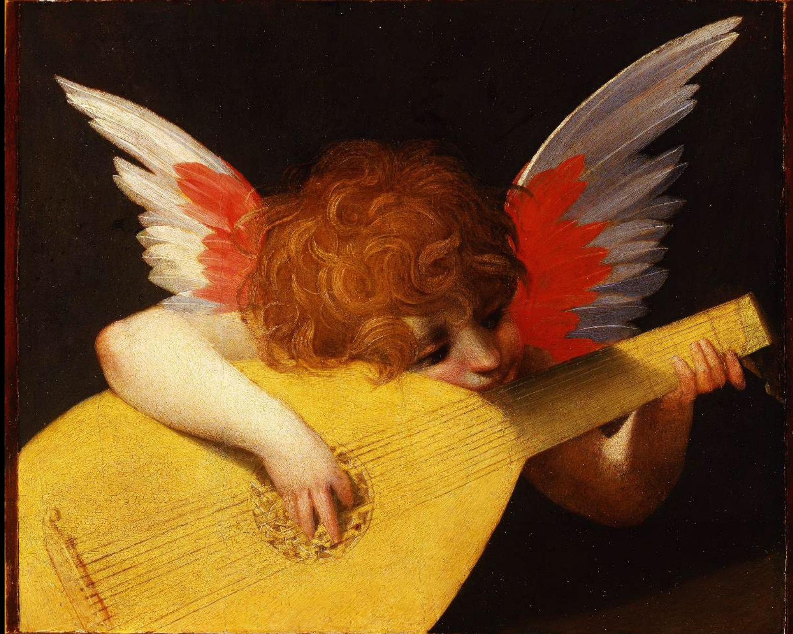
Small Angel Playing (detail from Madonna of Spedalingo), Rosso Fiorentino, 1518