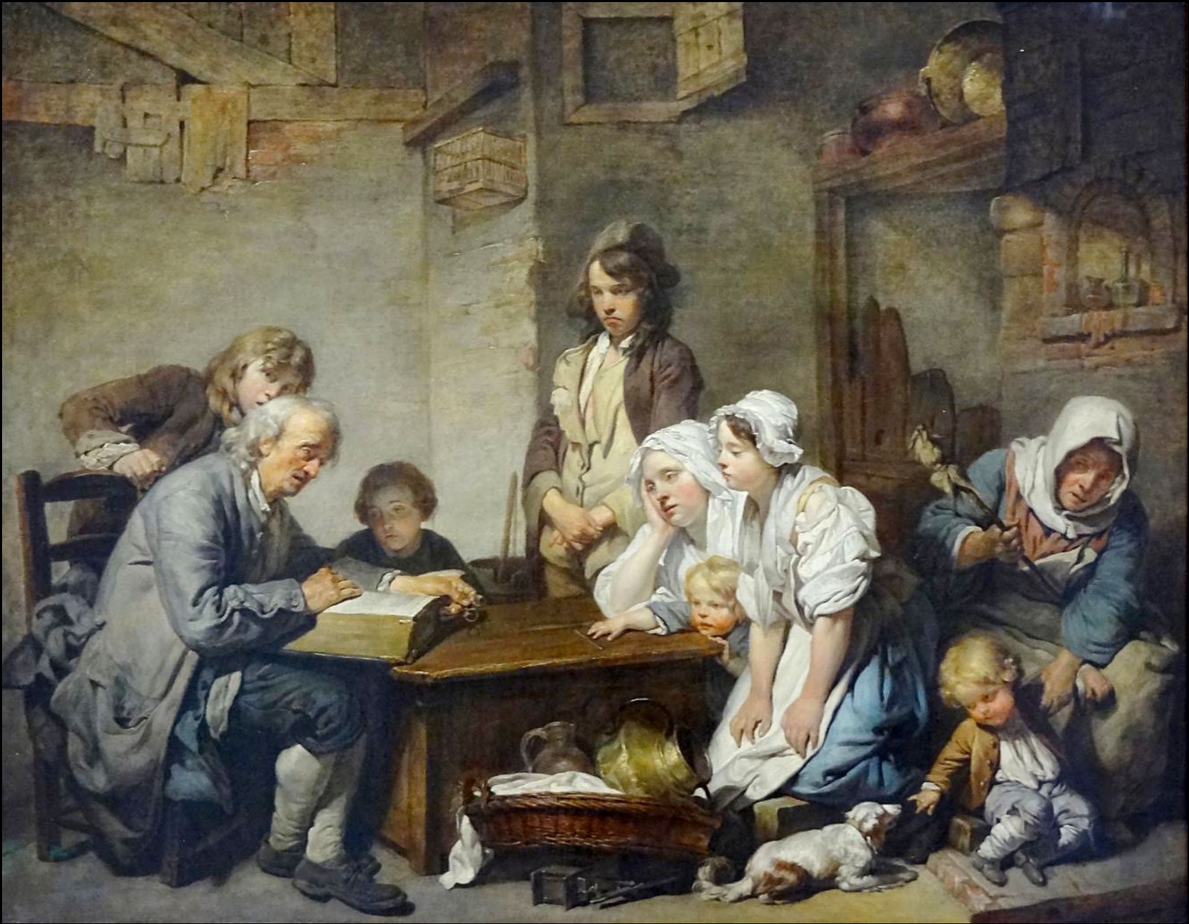
Reading the Bible -- Jean-Baptiste Greuze, Louvre, Paris, France