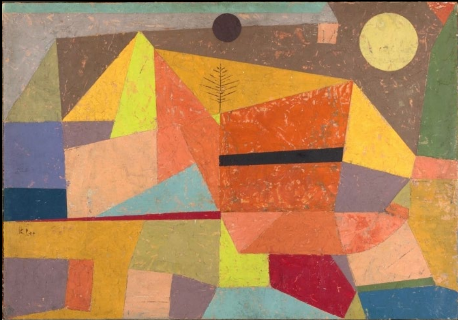
Joyful Mountain Landscape -- Paul Klee, Yale University Art Gallery, New Haven , CT