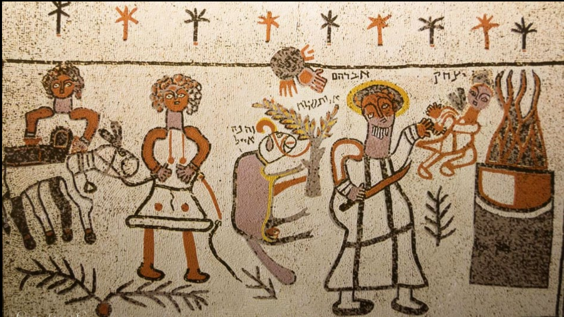
Bet Alfa Synagogue 5 th century floor mosaic -- Bet Alfa, Israel