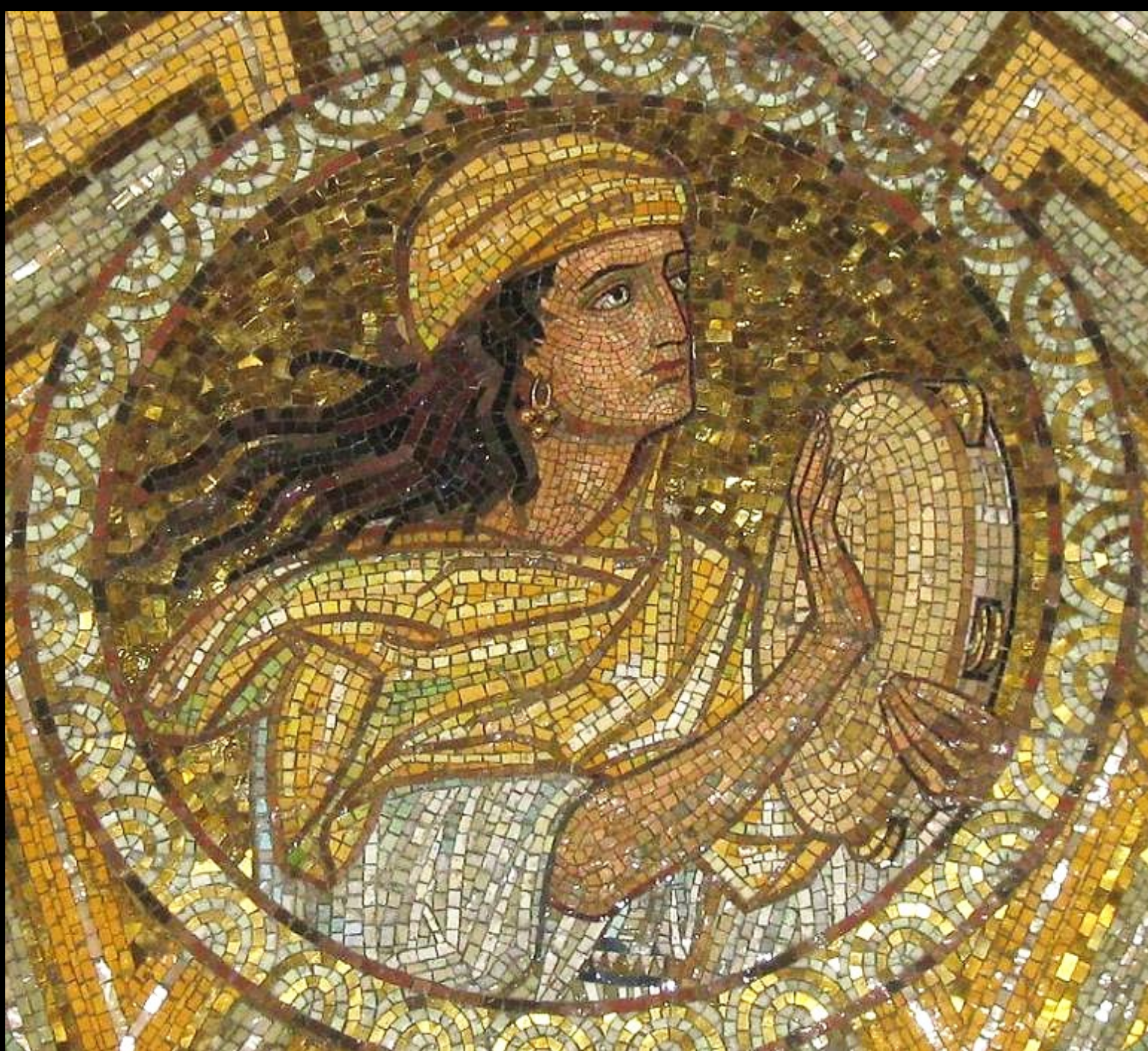
Miriam Dormition Church Mt. Zion, Jerusalem