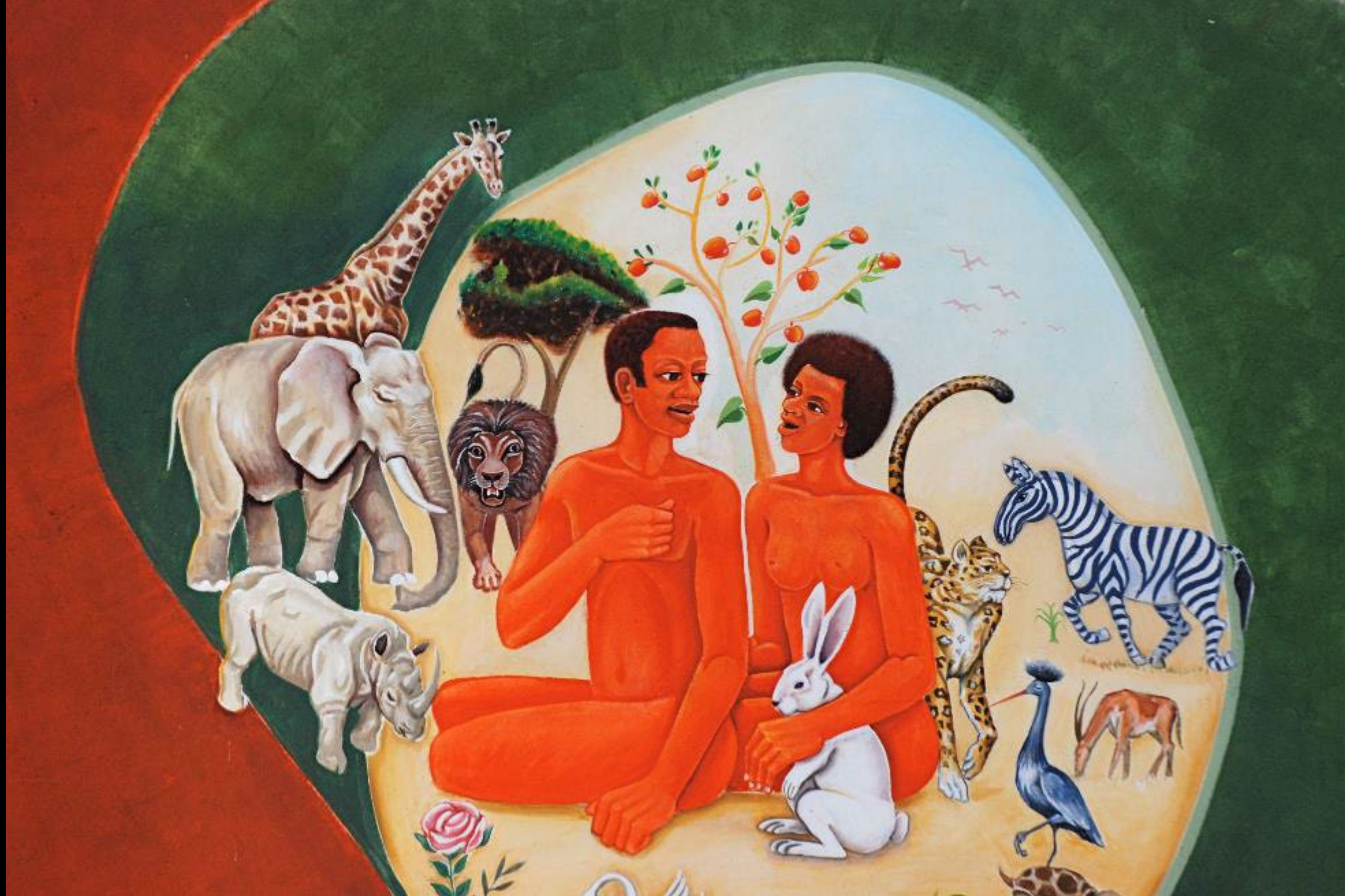
Creation -- Songea Cathedral, Tanzania