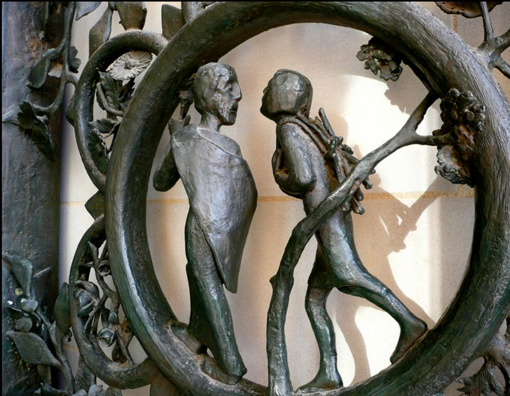
Sacrifice of Isaac -- Washington Cathedral, Washington, DC