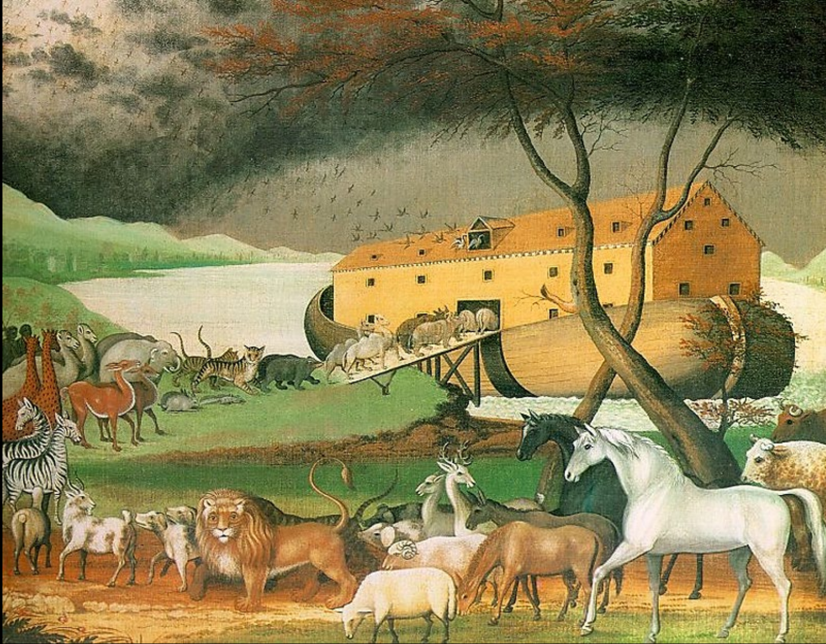
Noah's Ark -- Edward Hicks, Philadelphia Museum of Art, Philadelphia, PA