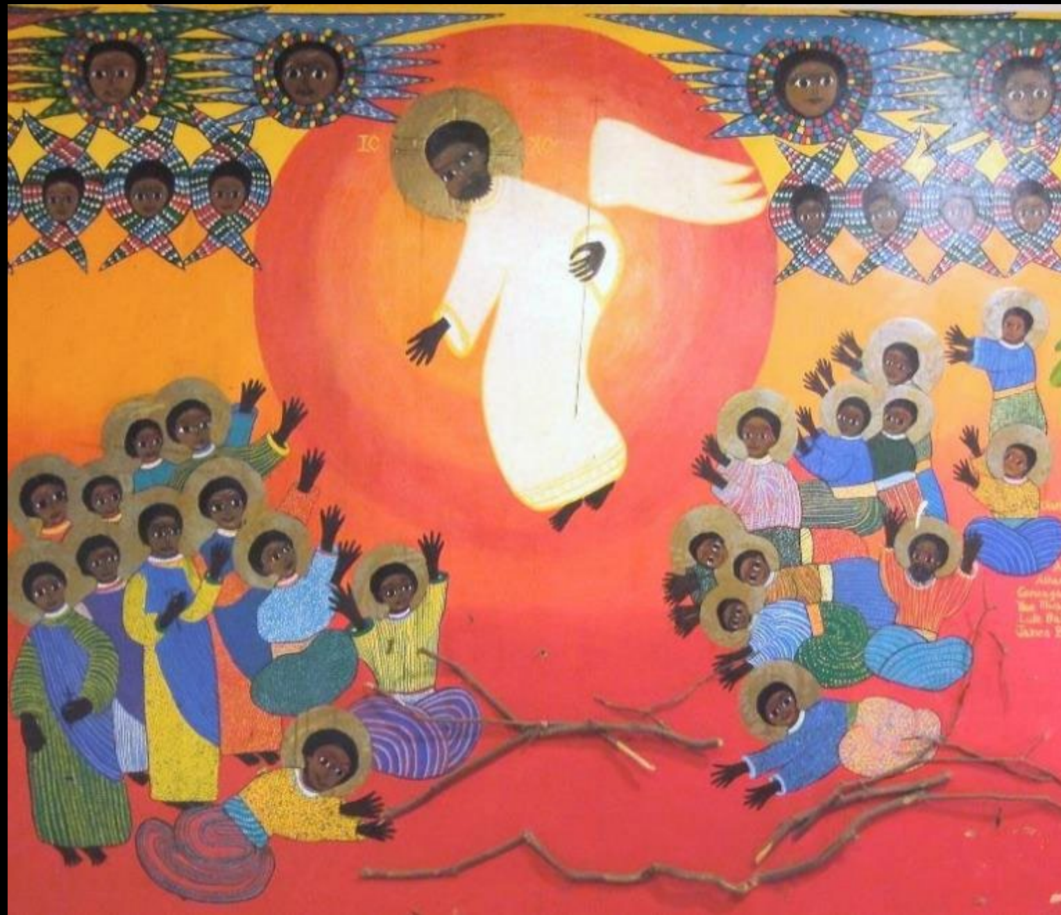
Emmaus House – Martyrs of Uganda, Kamapala, Uganda