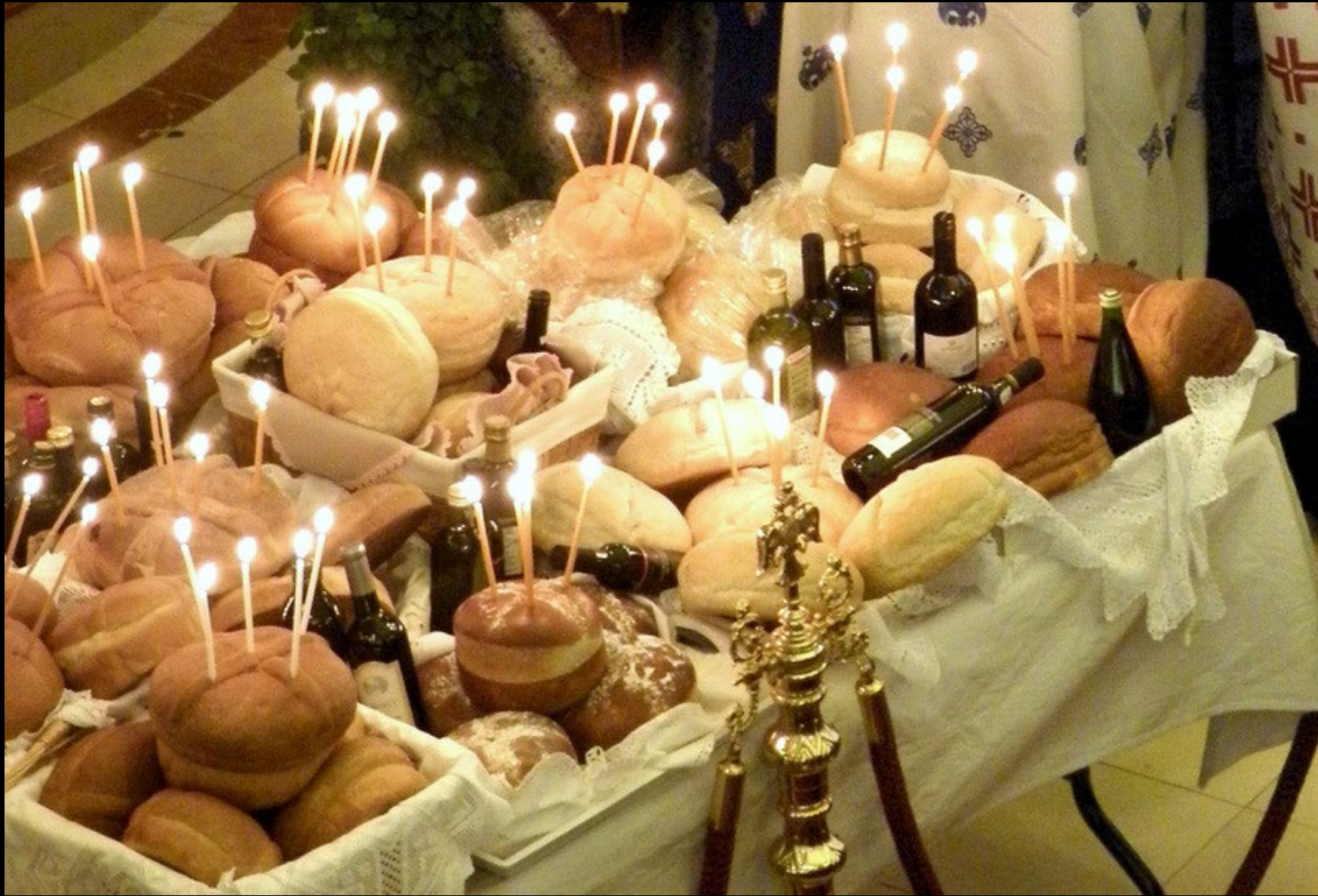
Breaking of Bread Service -- Annunciation Greek Orthodox Cathedral, Toronto, Canada