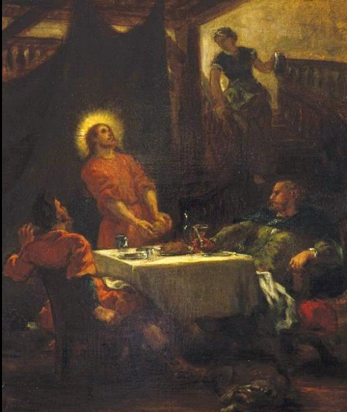
Disciples at Emmaus

Eugene Delacroix Brooklyn Museum New York