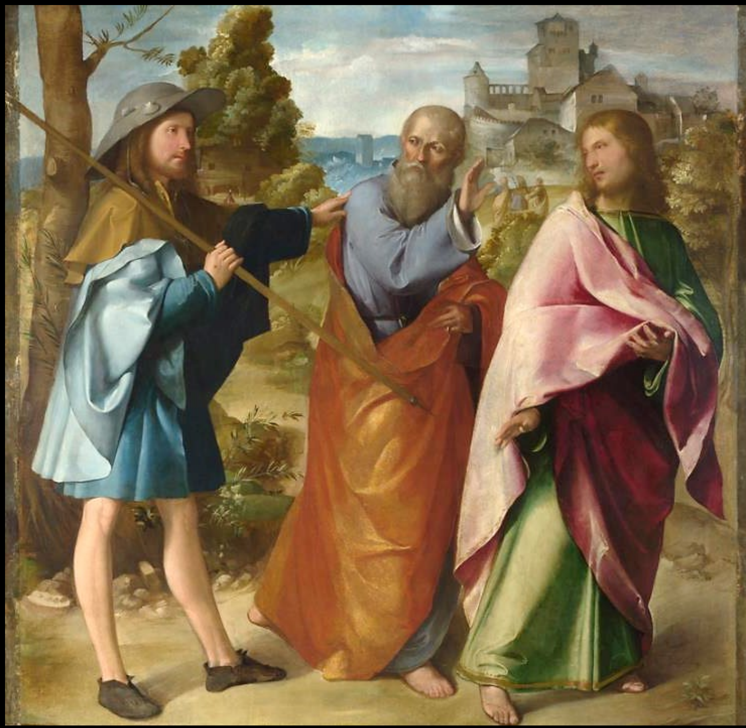
Road to Emmaus

Altobello Melone National Gallery, London