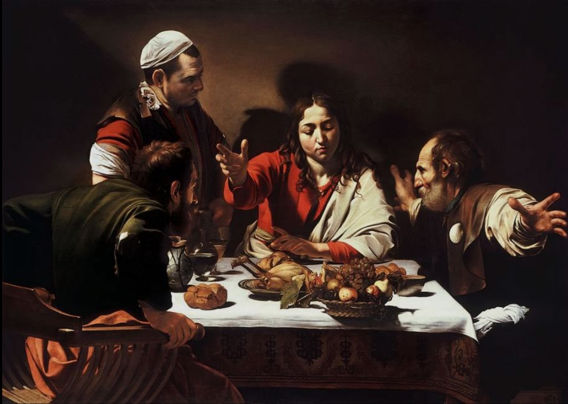
Supper at Emmaus -- Caravaggio, National Gallery, London