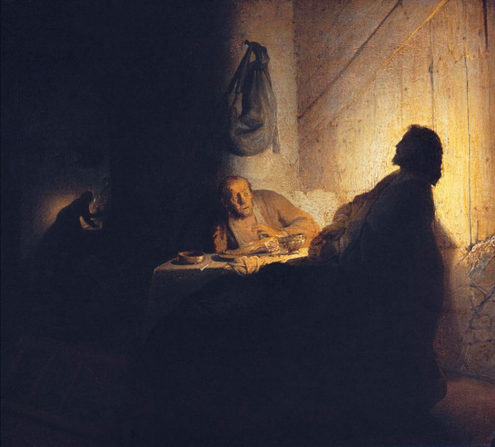
Supper at Emmaus