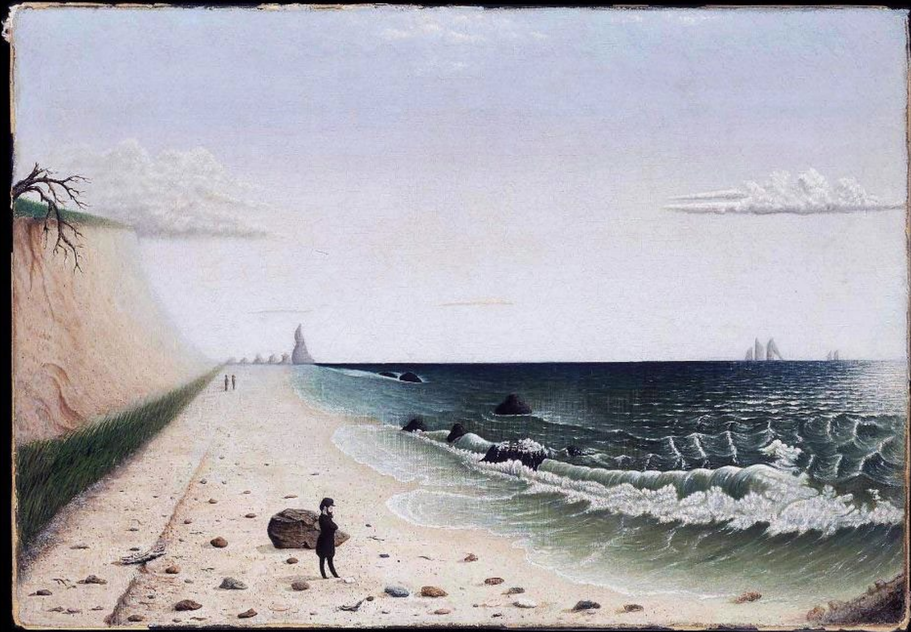
Meditation by the Sea -- American, Museum of Fine Arts, Boston