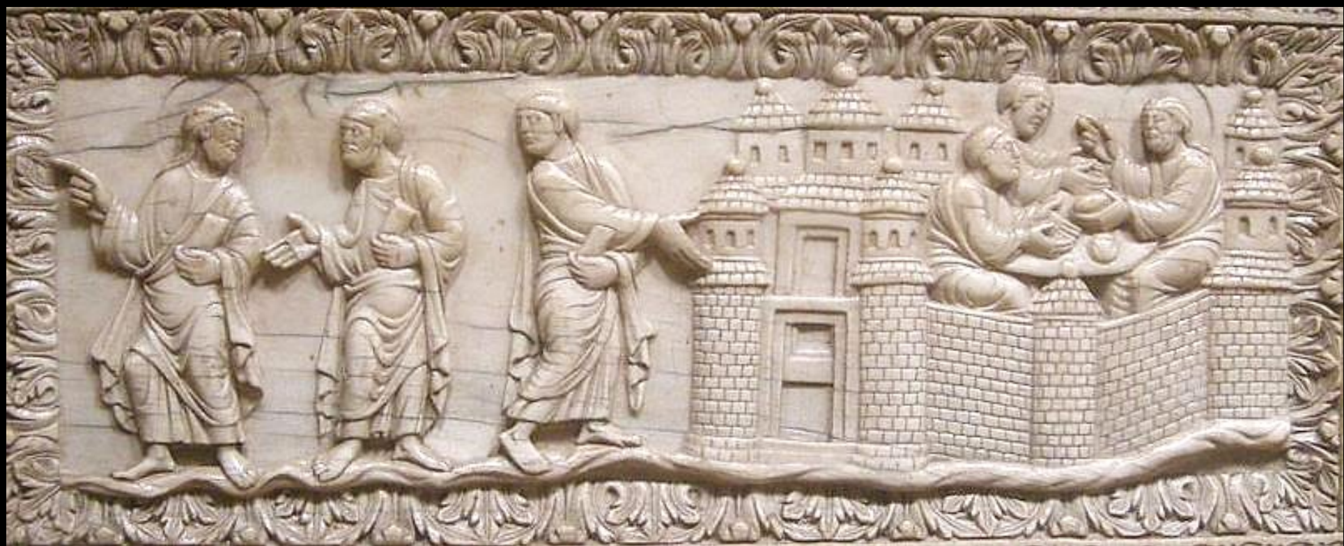
Road to Emmaus -- Carolingian, 9 th c., Cloisters Museum, New York