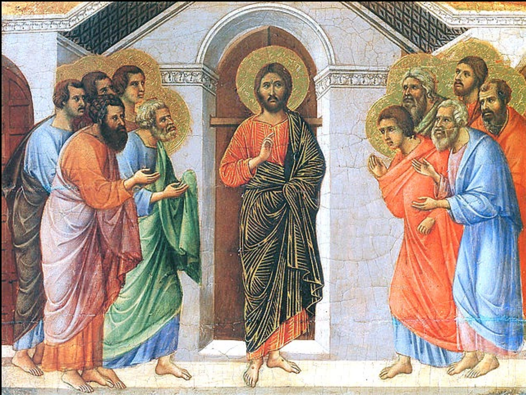
Christ Appears to the Apostles -- Duccio, Museo dell'Opera del Duomo, Siena, Italy