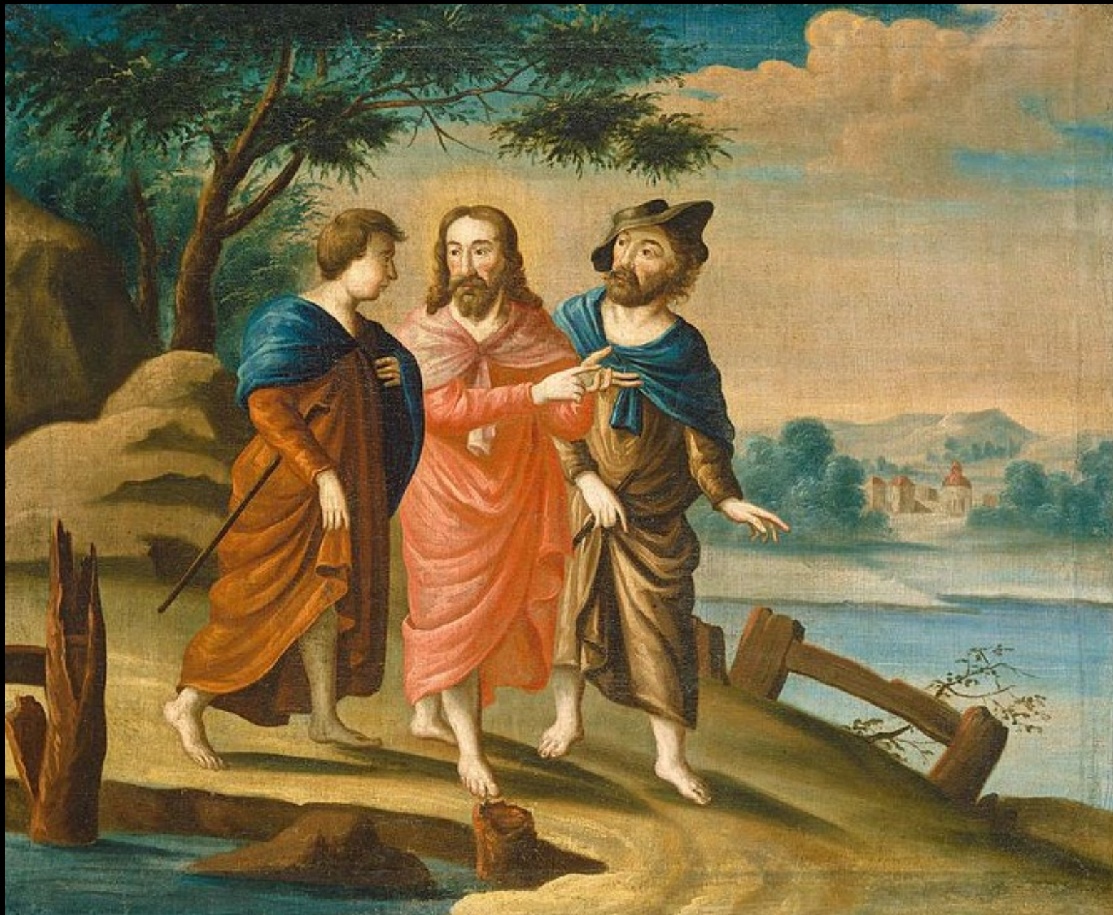
Road to Emmaus -- American, early 18 th c., National Gallery of Art, DC