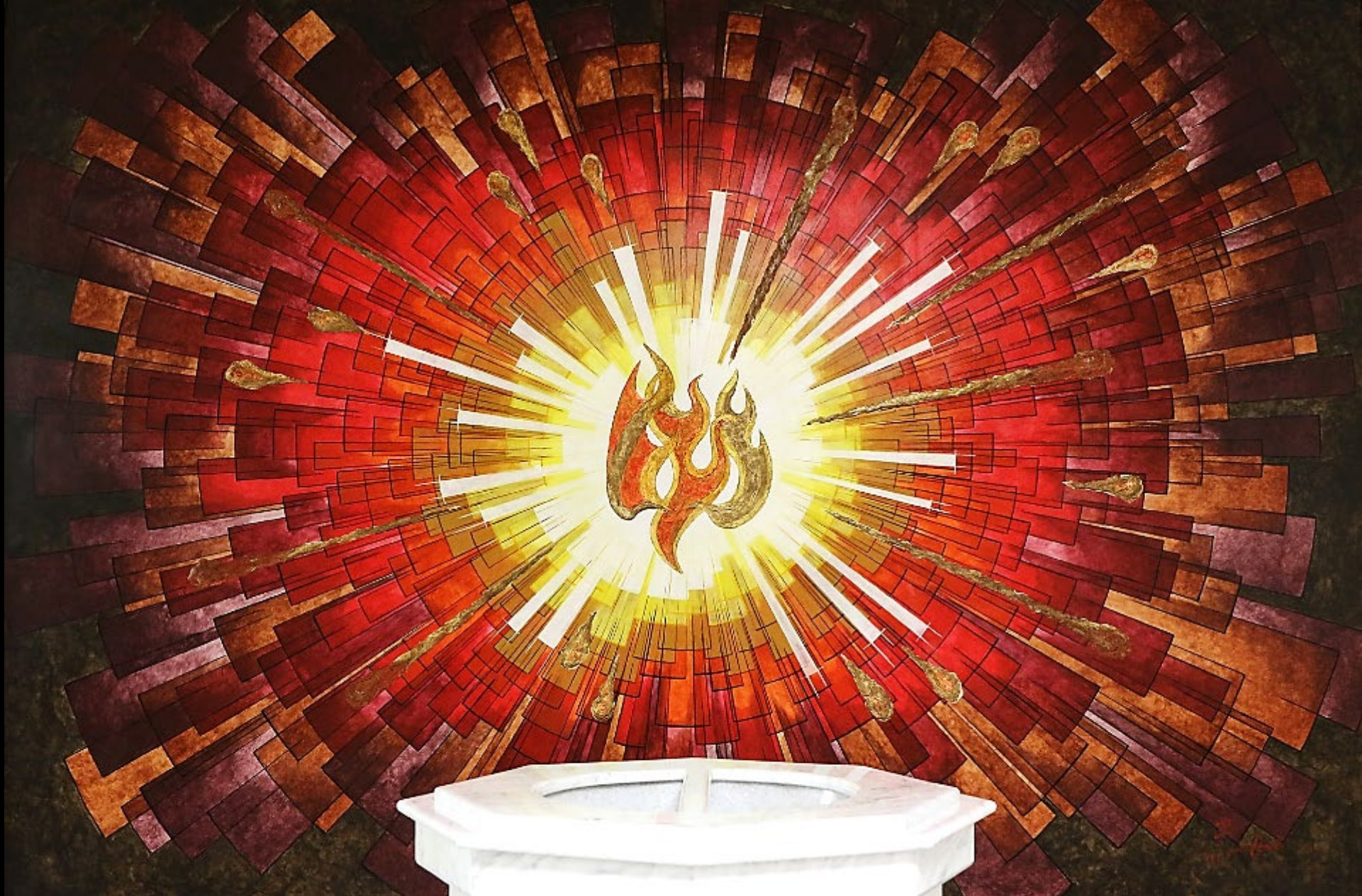
The Holy Spirit and Fire with Baptismal Font -- Church in Mexicali, Mexico