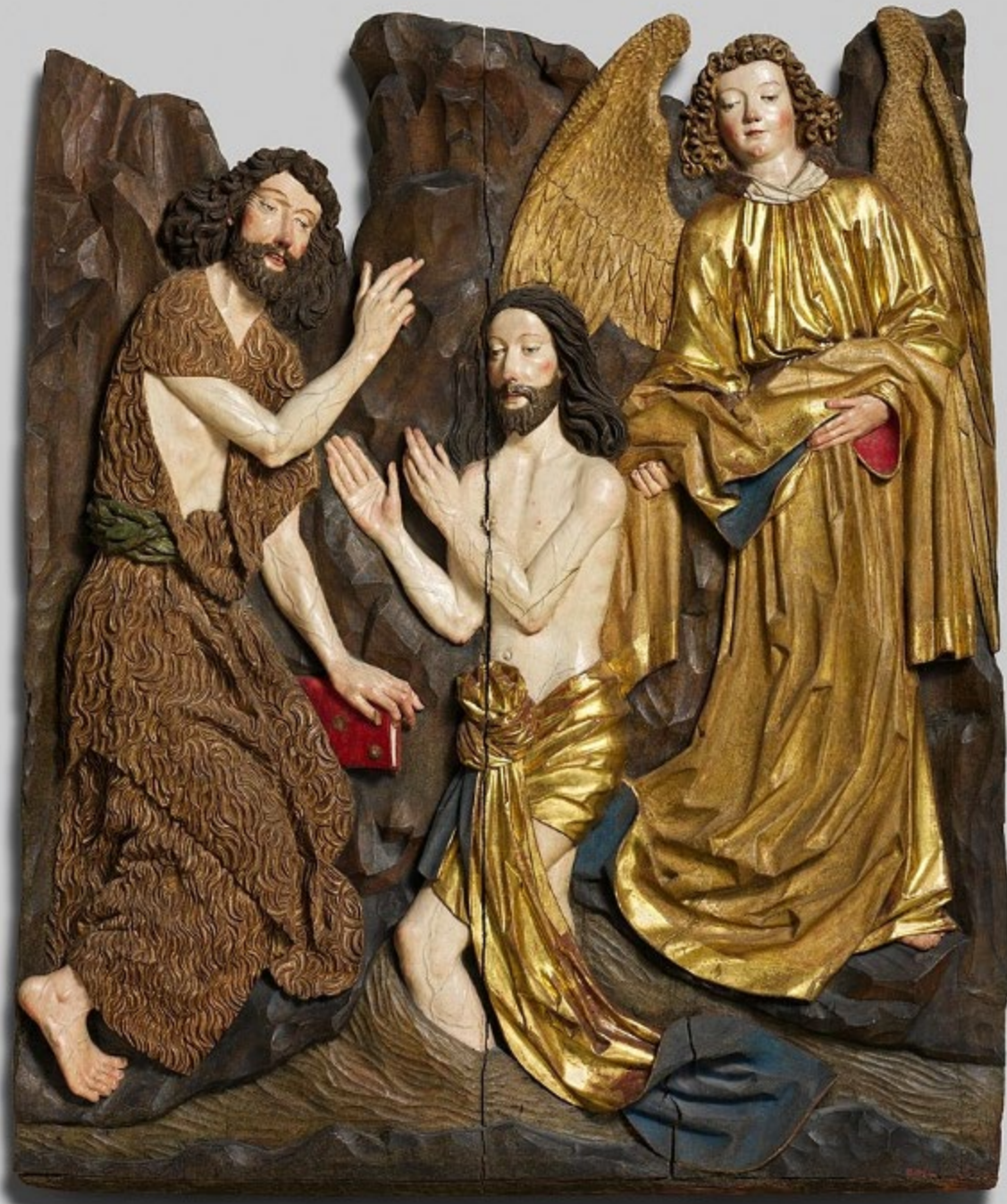
Baptism of Christ Veit Stoss Metropolitan Museum of Art New York, NY