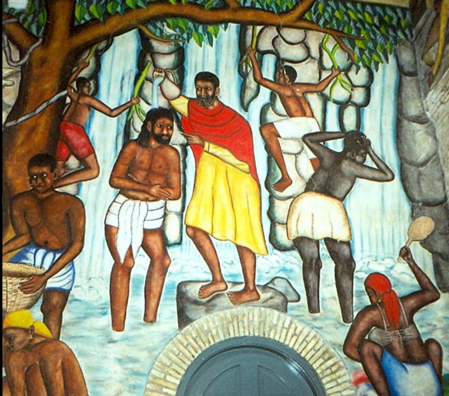
Baptism of Jesus -- Castera Bazile, Cathedrale de Sainte Trinite, Port-au-Prince, Haiti