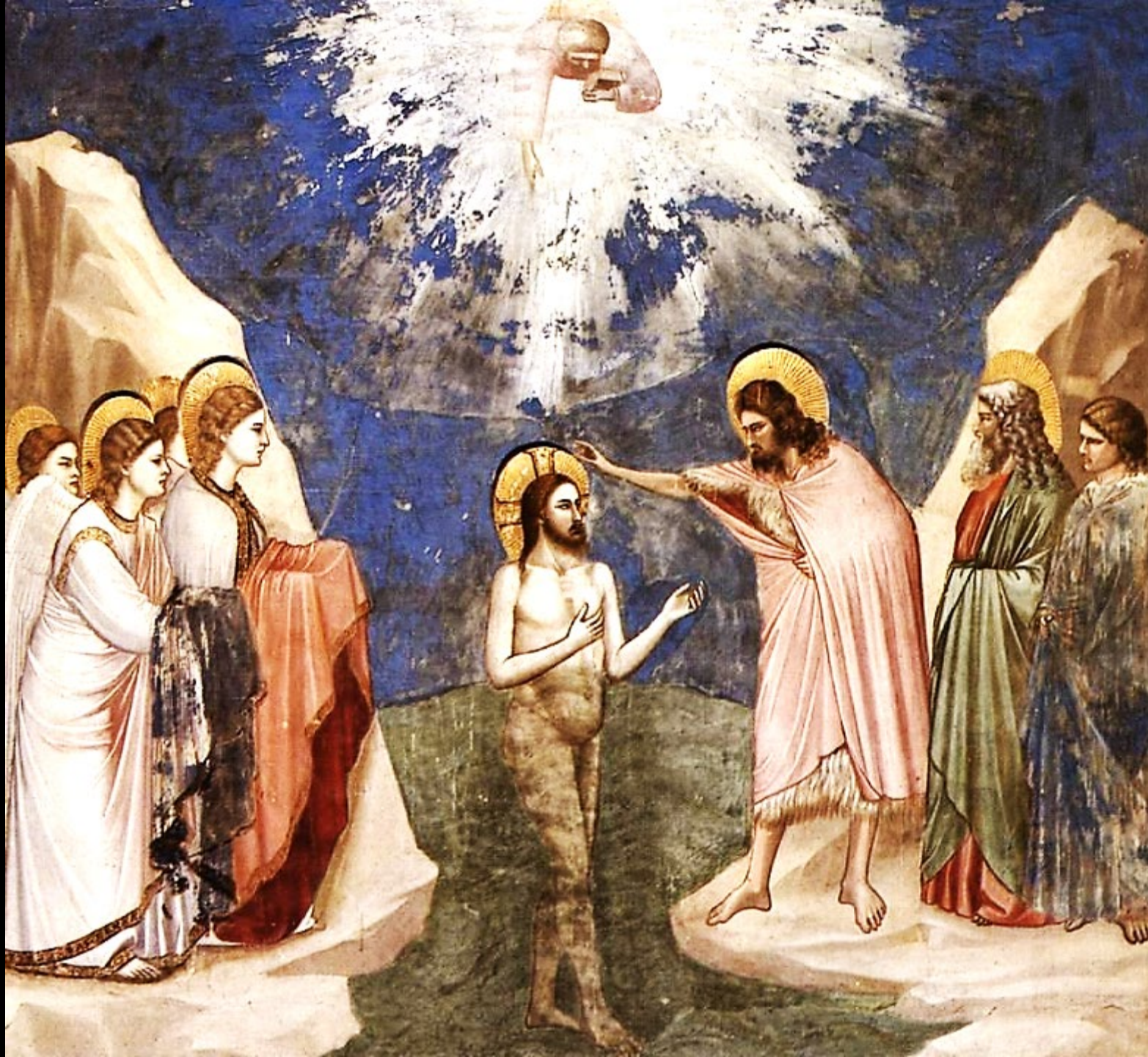
Baptism of Christ