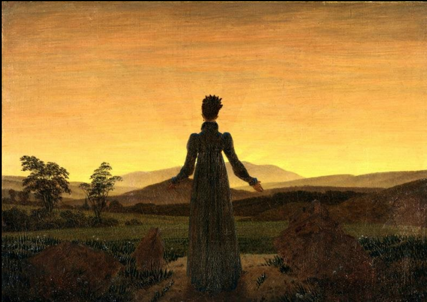
Woman Before the Rising Sun -- Caspar David Friedrich, Museum Folkwang, Essen, Germany