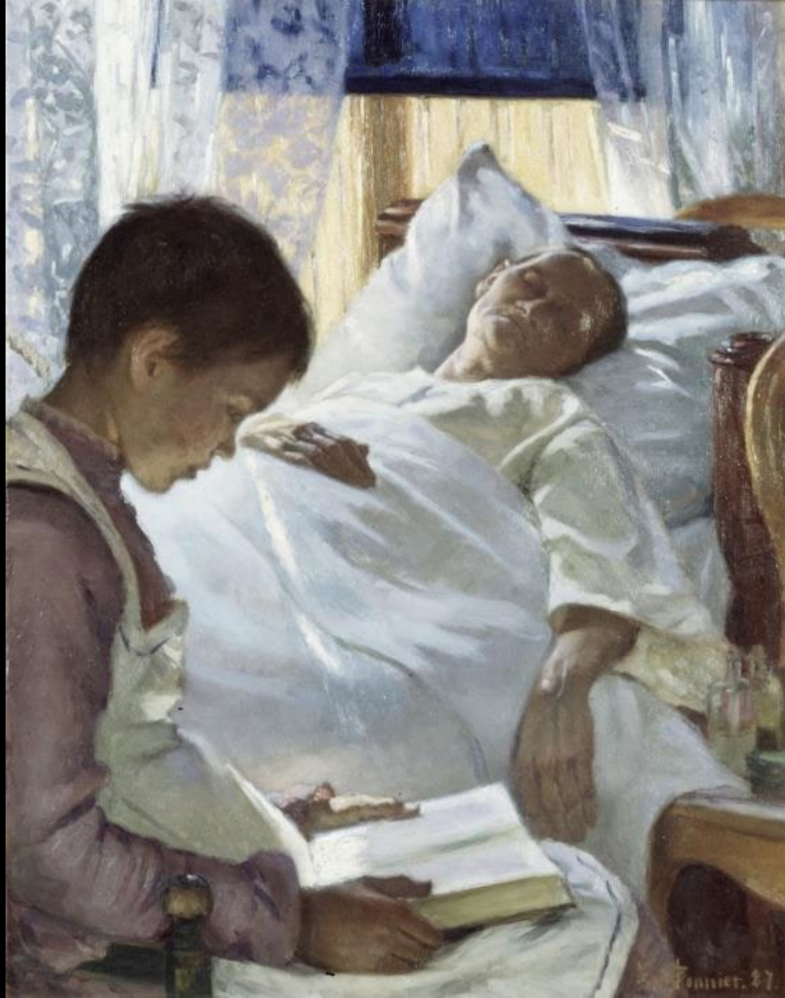
Reflection in Blue Eva Bonnier Nationalmuseum Stockholm, Sweden