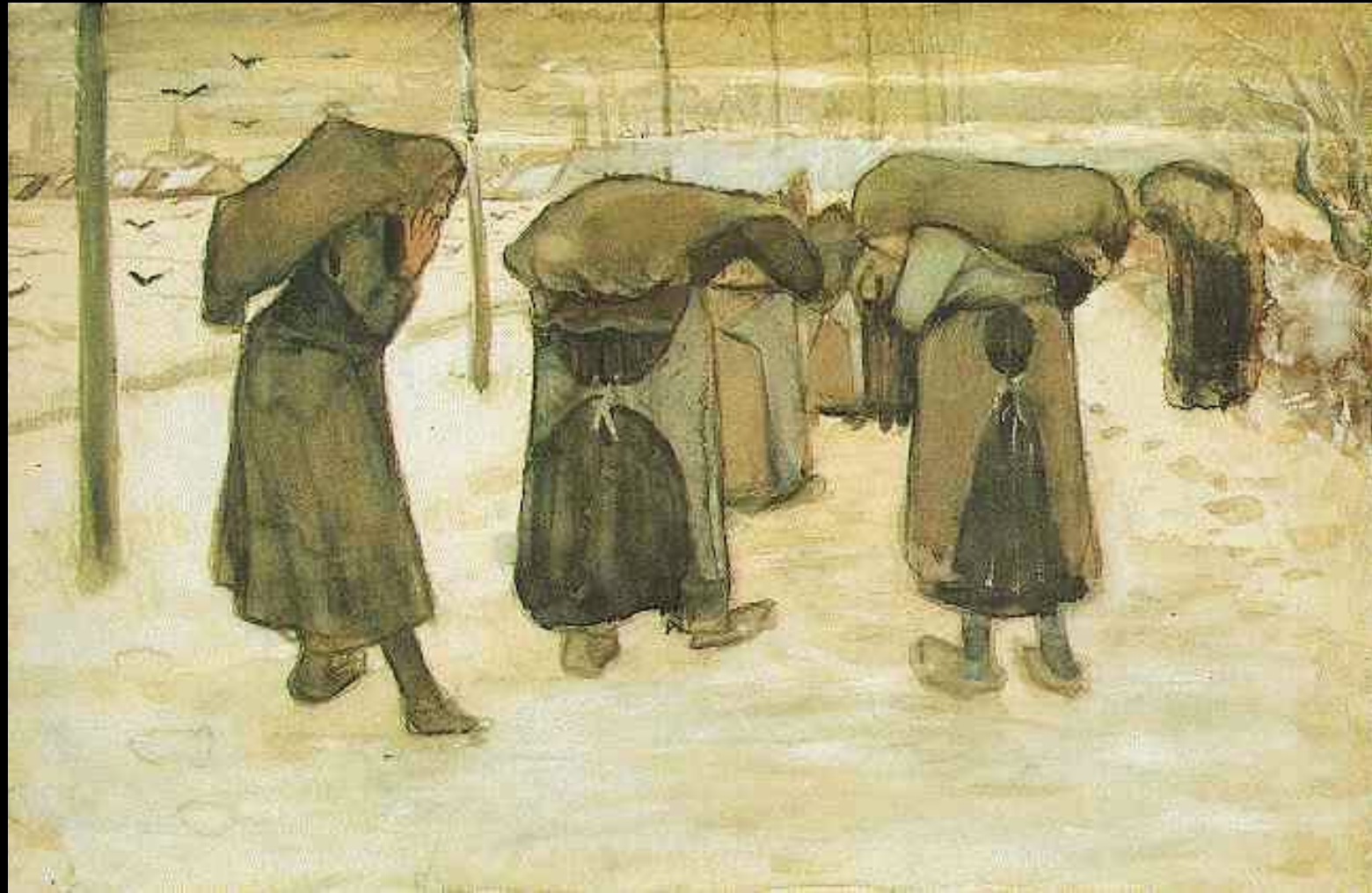
Women Miners -- Vincent Van Gogh, Kroller-Muller Museum, Otterlo, Netherlands