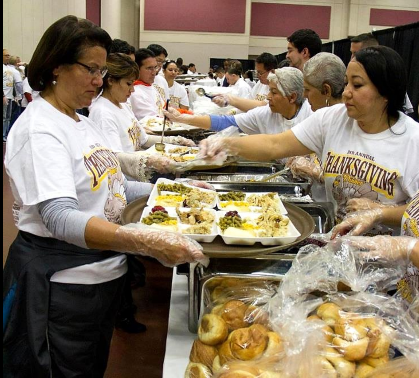
Members of the Fort Bliss and El Paso community prepare Thanksgiving dinner for El Pasoans in need