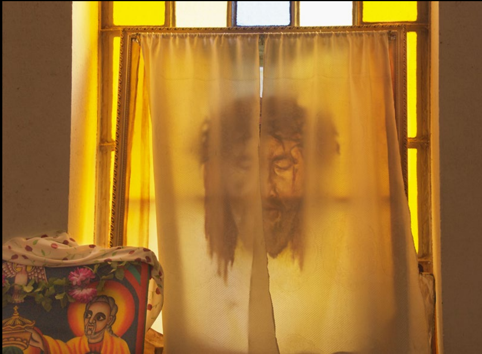
Translucence -- Church of Saint Mary of Zion, Axum, Ethiopia