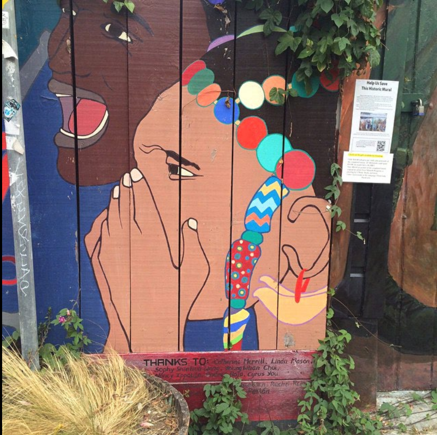
Grief Mission District Mural San Francisco, CA