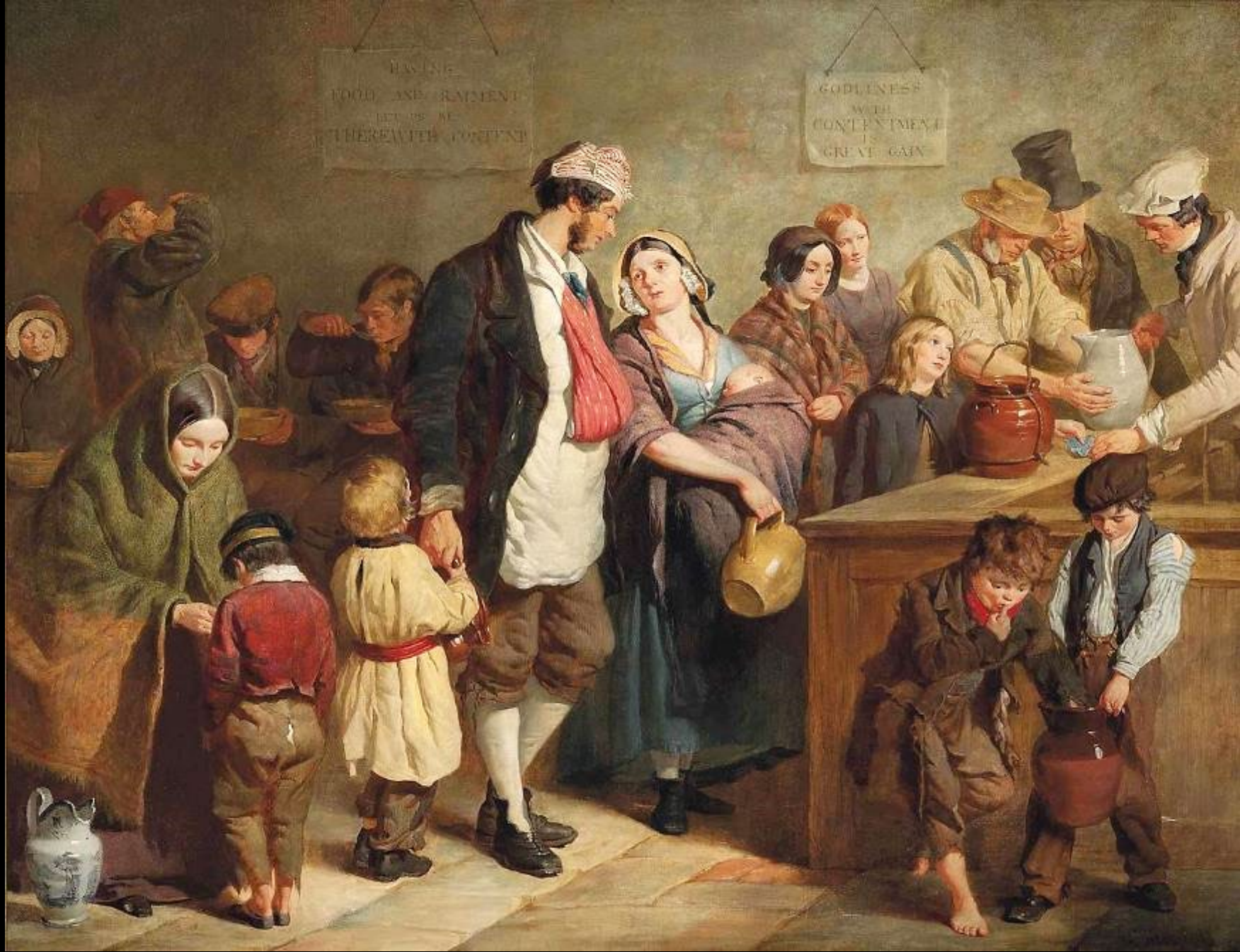
The Parish Soup Kitchen -- George Elgar Hicks, Royal Academy, London, England