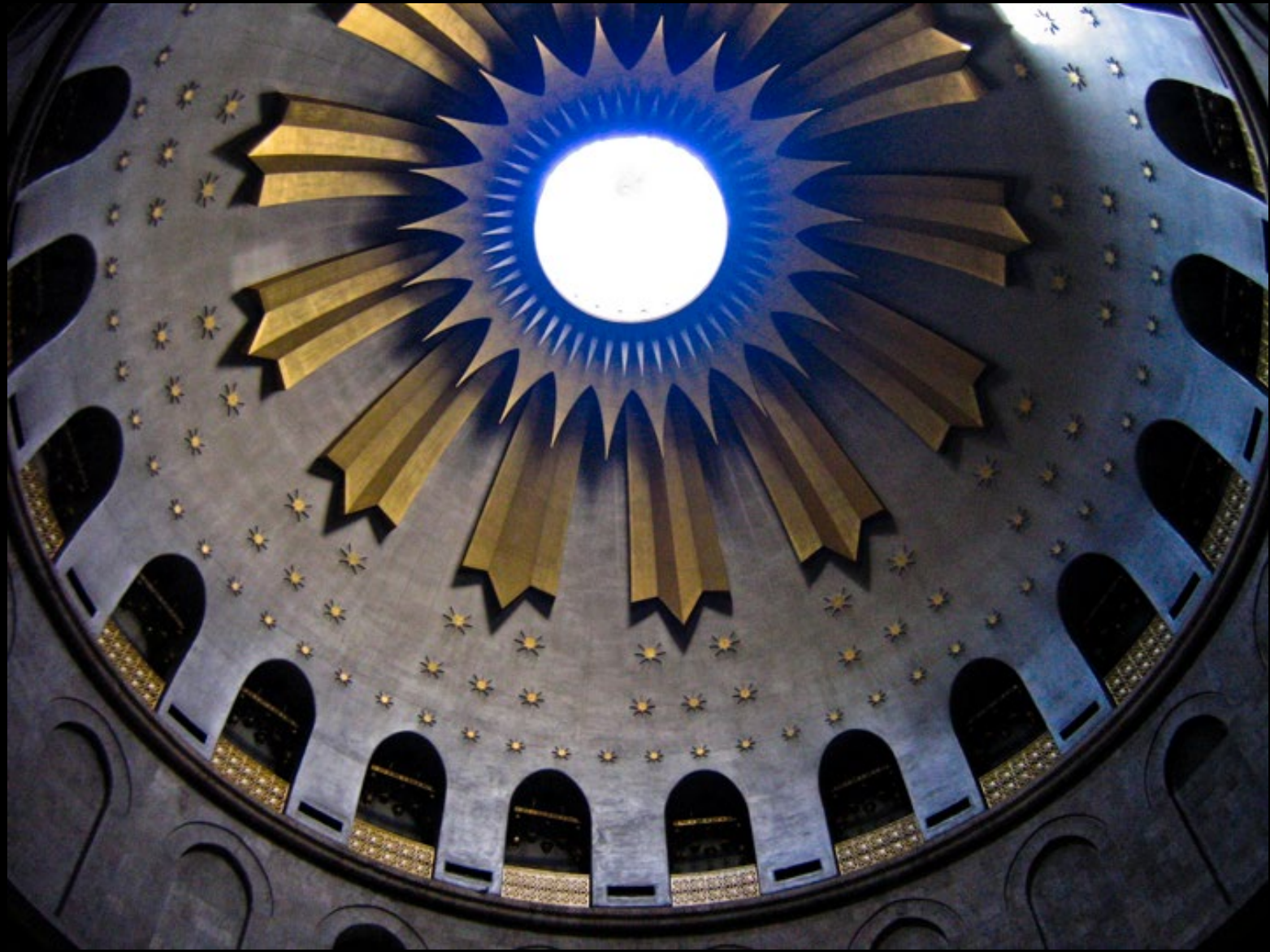
Church of the Holy Sepulcher -- Jerusalem