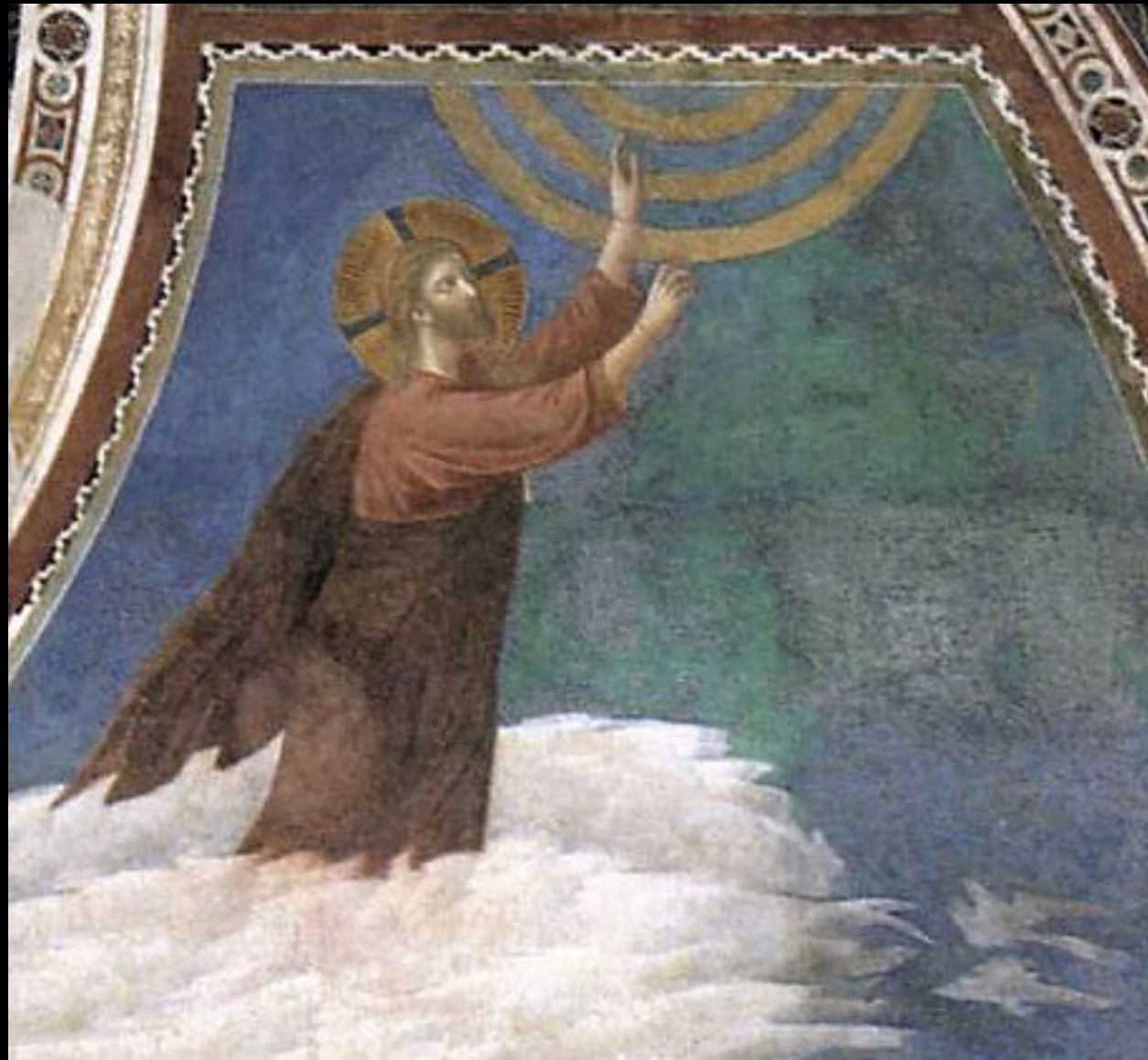
Ascension -- Giotto, Basilica of San Francis of Assisi, Assisi, Italy