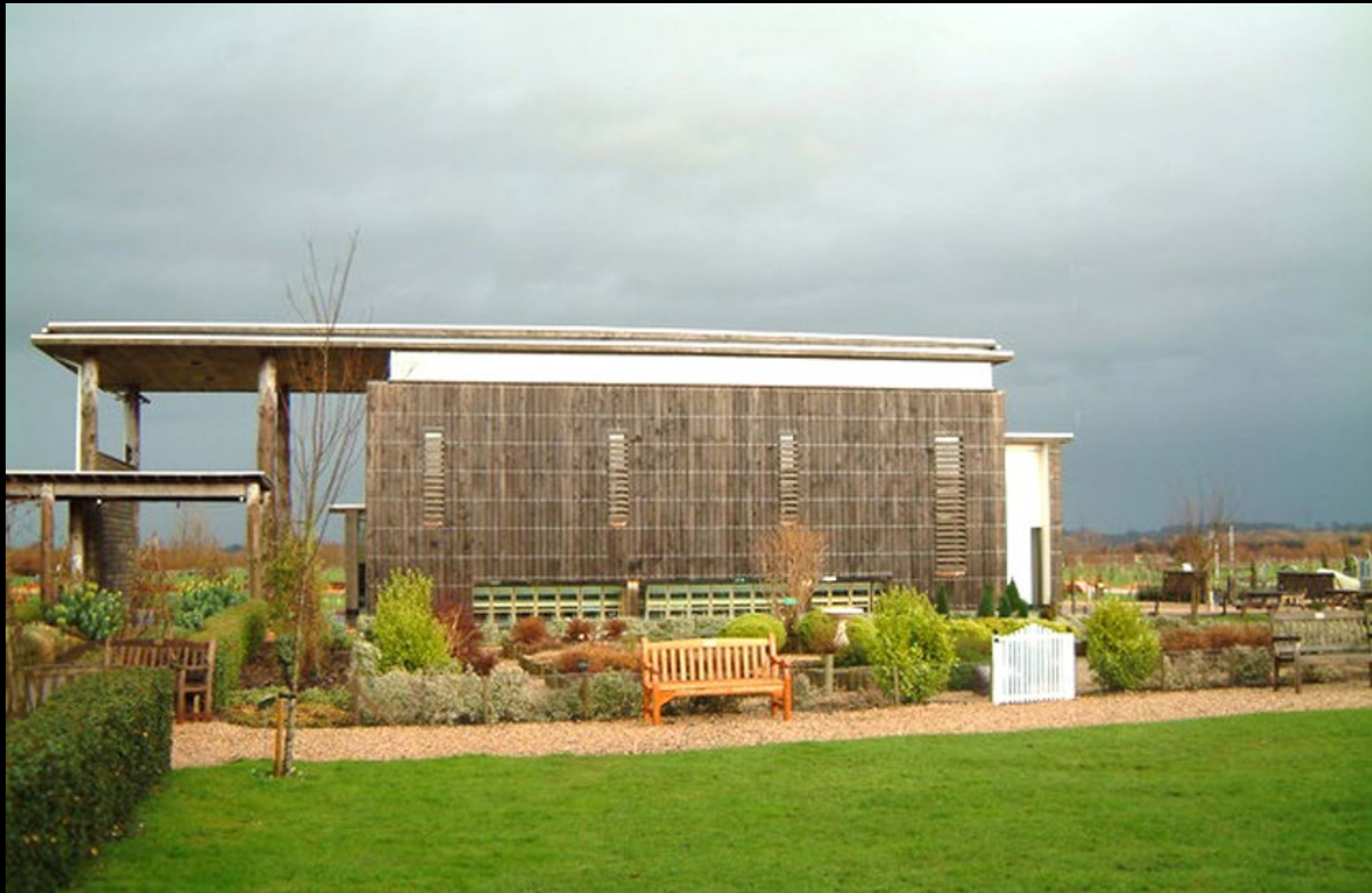
Millenium Chapel of Peace and Forgiveness, Alrewas, England