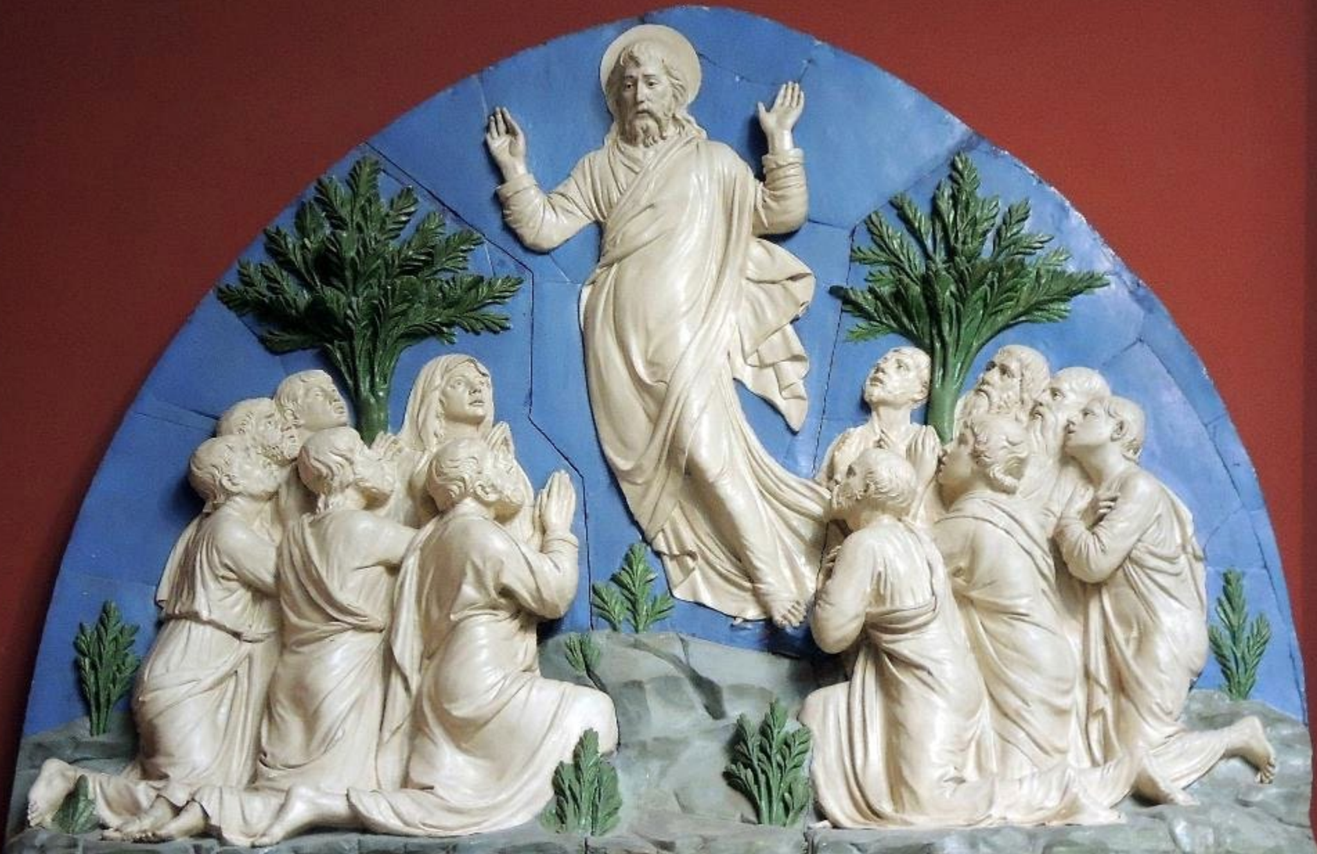
Ascension of Christ -- Lucca della Robbia, Pushkin Museum, Moscow, Russia