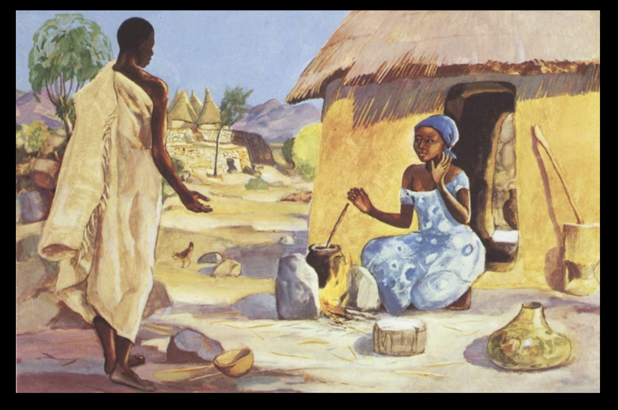
Annunciation -- JESUS MAFA, Cameroon