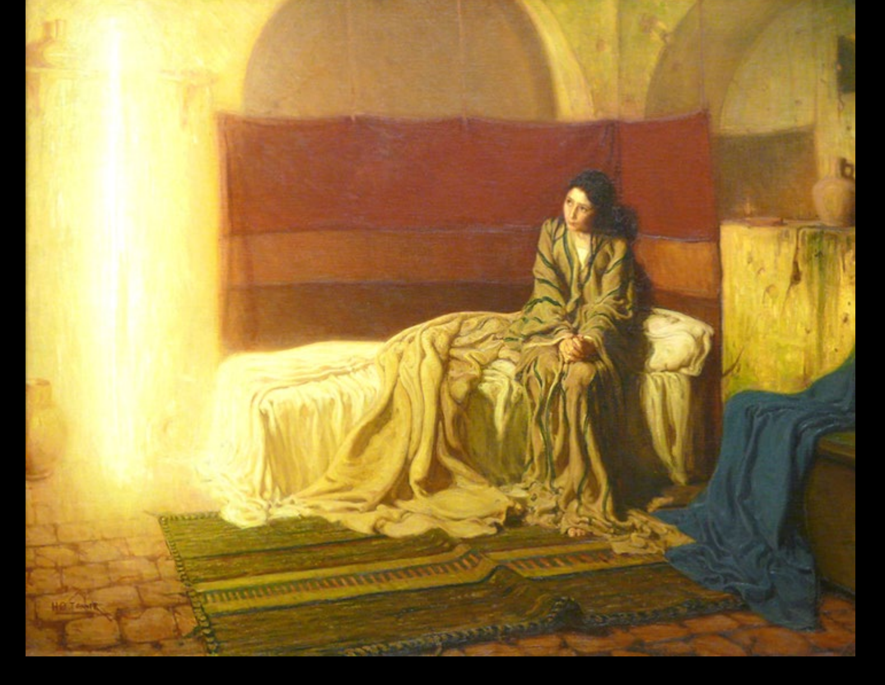
Annunciation -- Henry Ossawa Tanner, Philadelphia Museum of Art, Philadelphia, PA