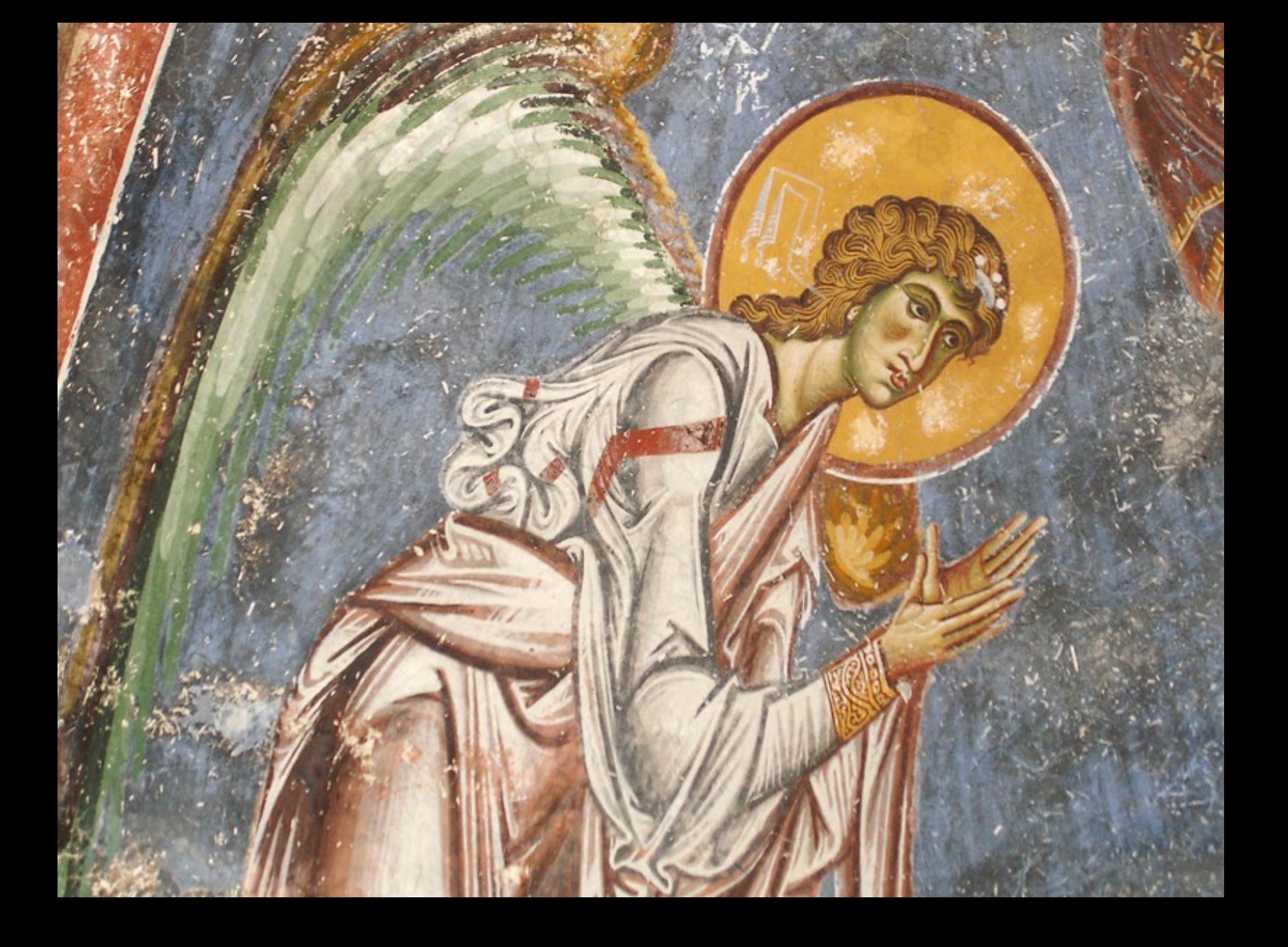
Gabriel -- St. George Church, Kurbinovo, Macedonia