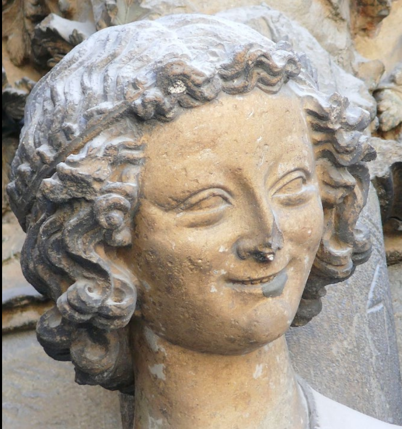
The Laughing Angel