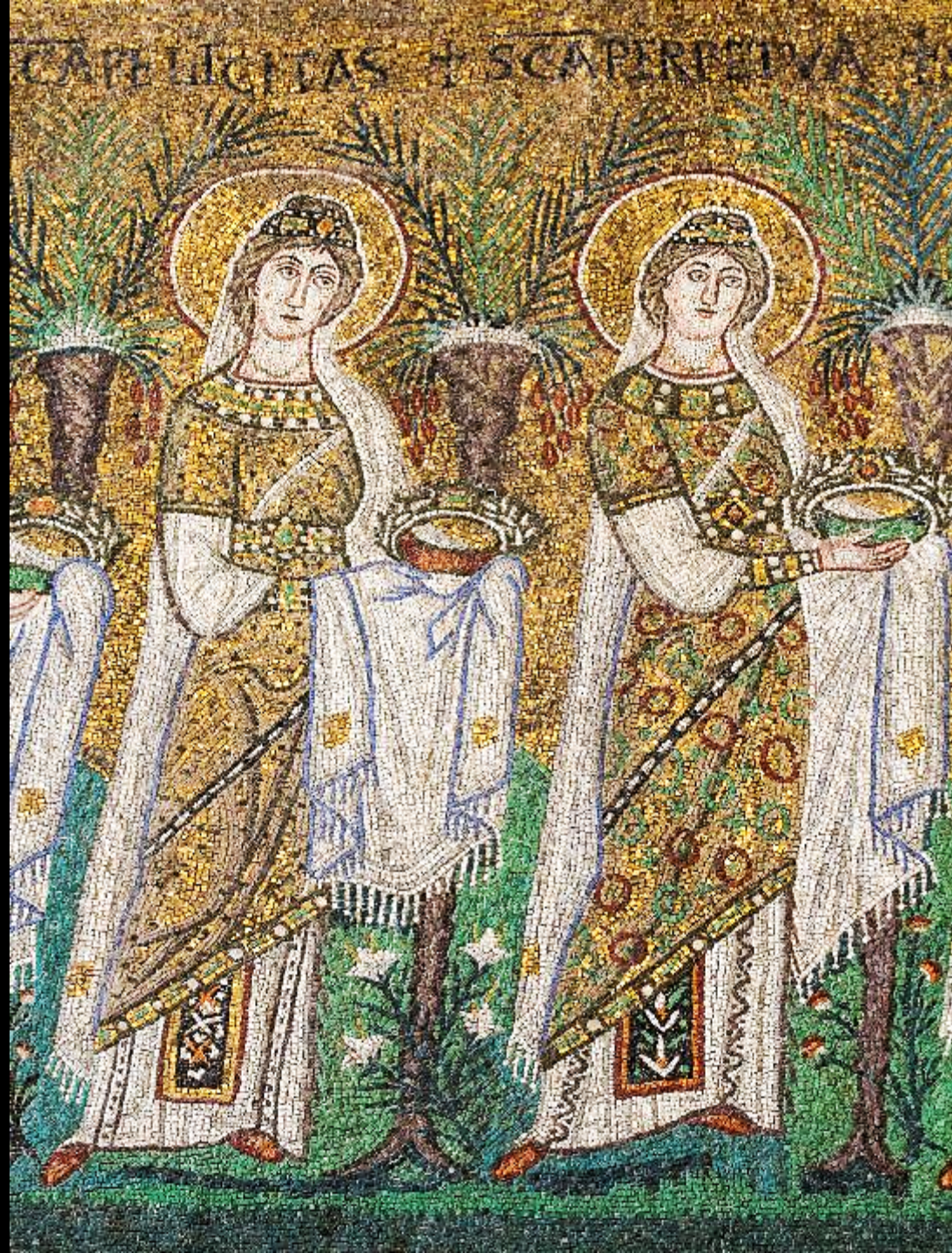
Felicitas and Perpetua Martyrs of the early 3 rd c.