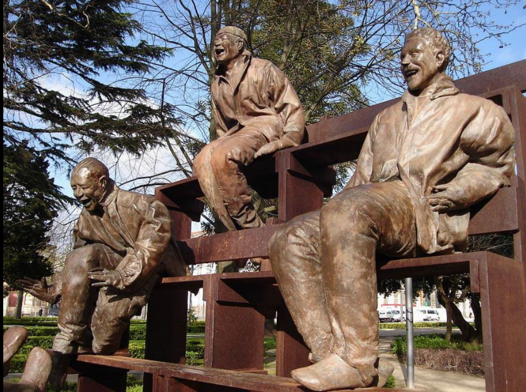
Thirteen Laughing Men -- Juan Muñoz, Porto, Portugal