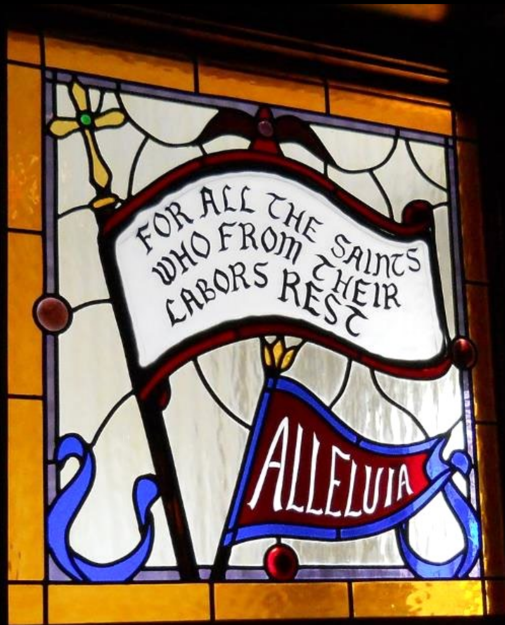
Hymn "For All the Saints" -- All Saints Episcopal Church, Jensen Beach, FL