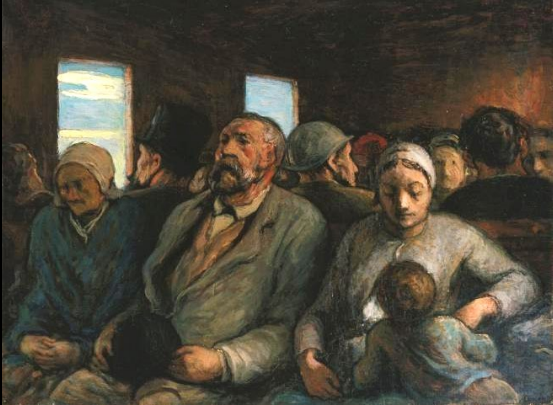
Third Class Carriage -- Honoré Daumier, Palace of Legion of Honor, San Francisco, CA