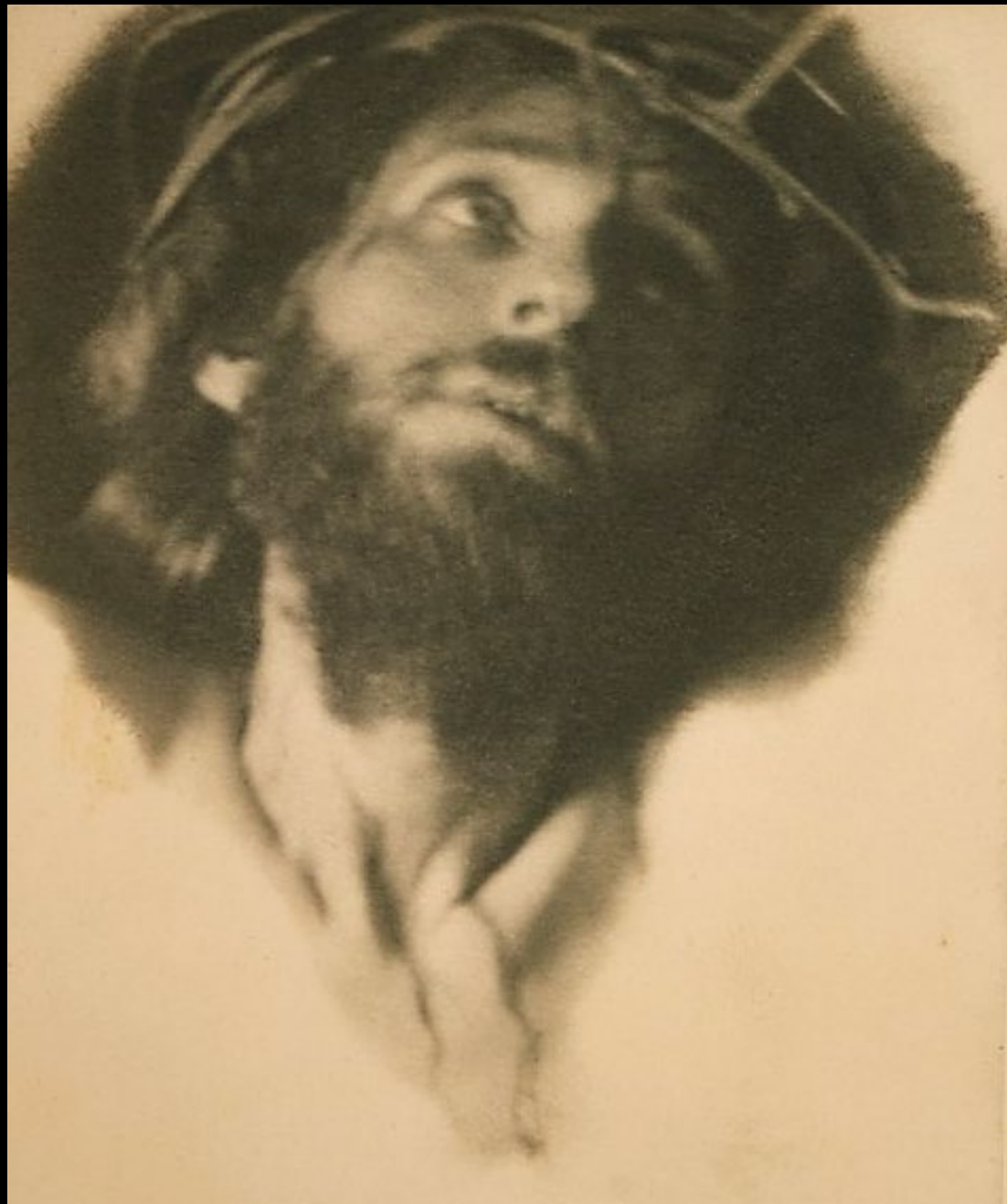
"Father Forgive Them..." -- Fred Holland, photographic print, 1898, Library of Congress