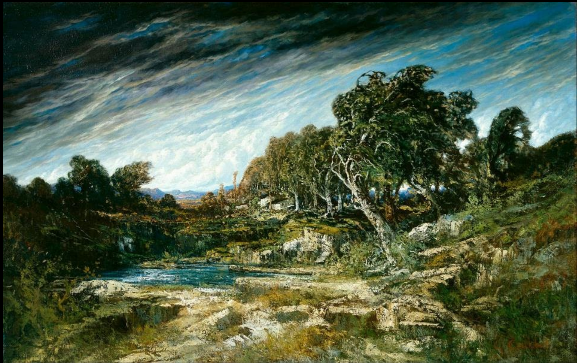
The Gust of Wind -- Gustave Courbet, Museum of Fine Arts, Houston, TX