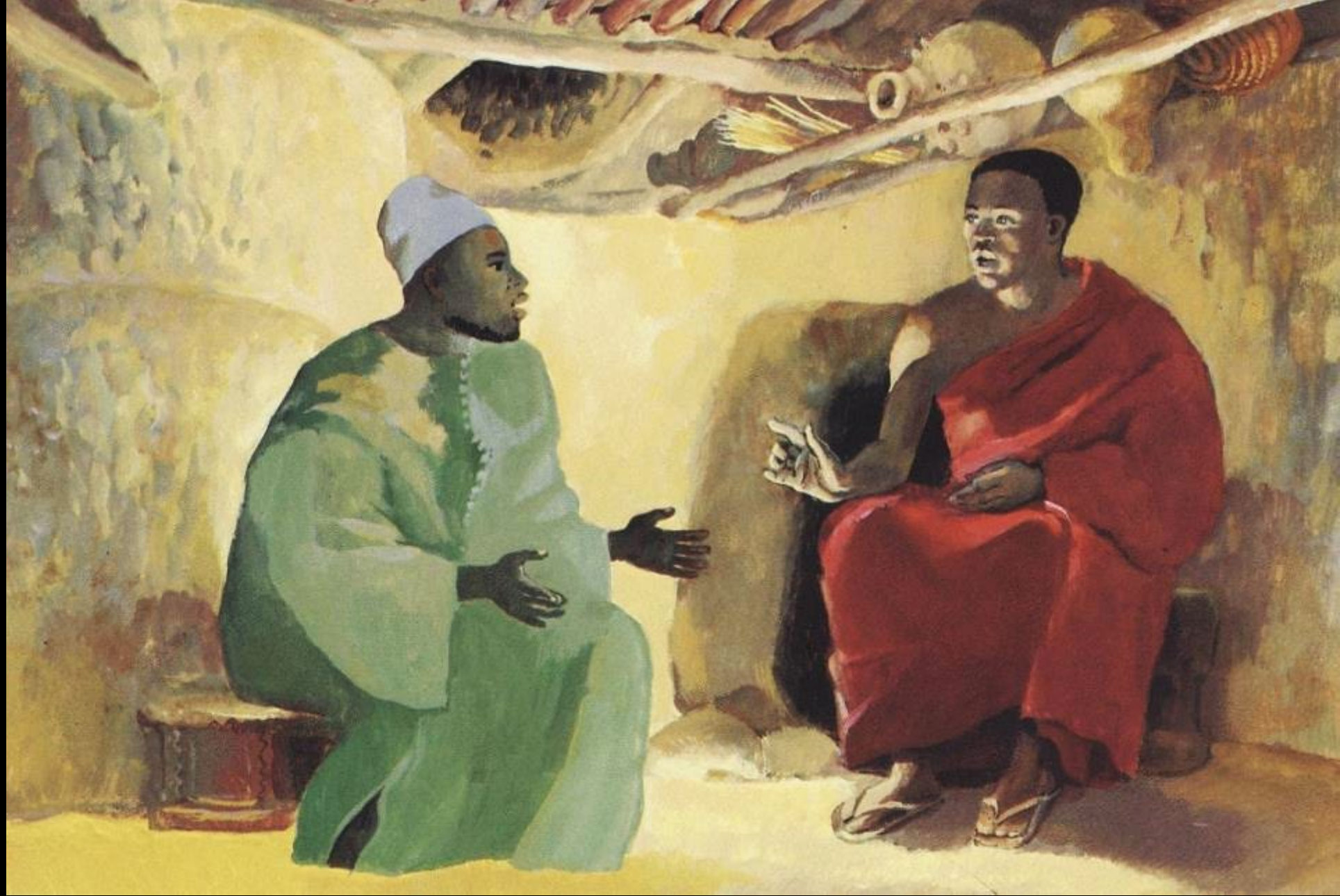
Nicodemus and Jesus -- JESUS MAFA, Cameroon