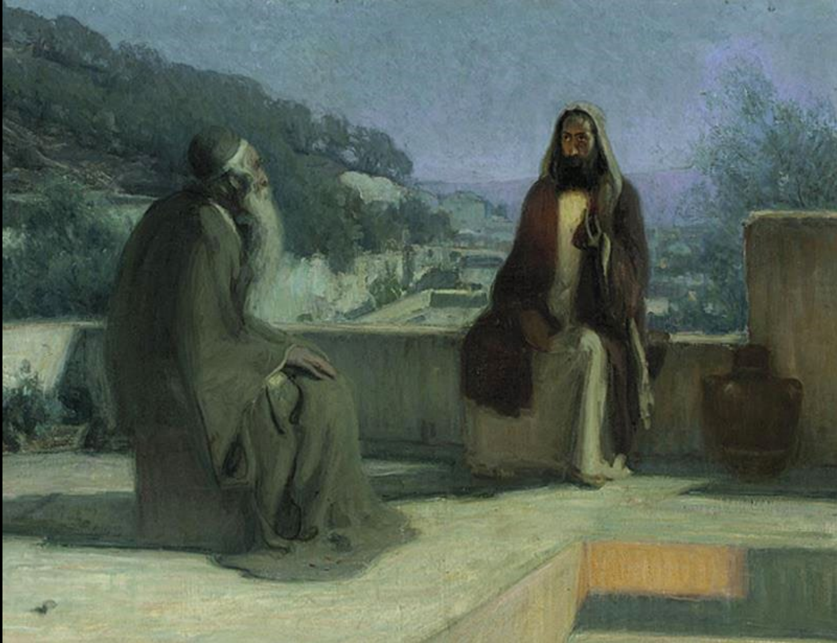
Nicodemus Comes to Jesus at Night -- Henry O. Tanner