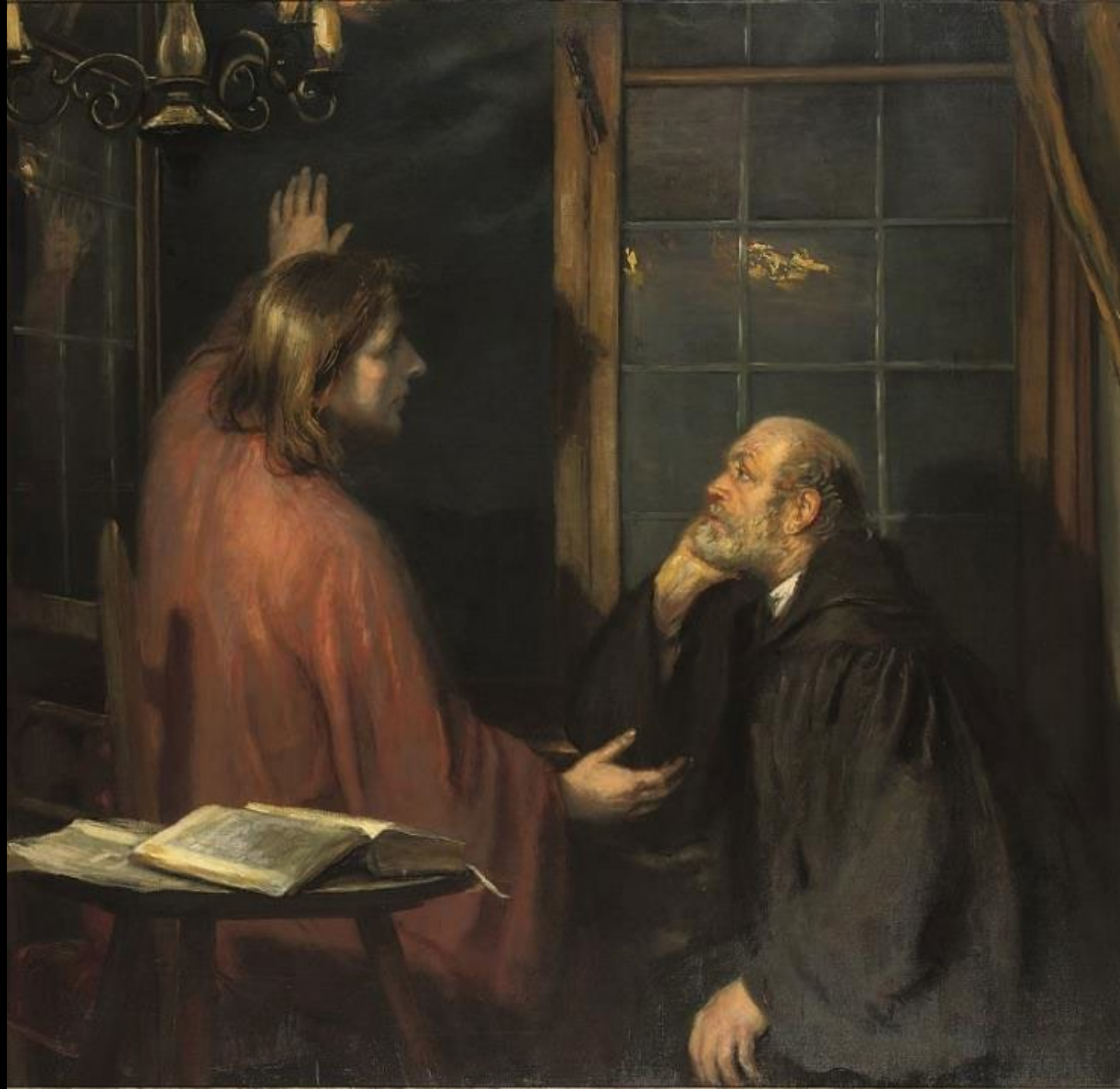
Christ and Nicodemus