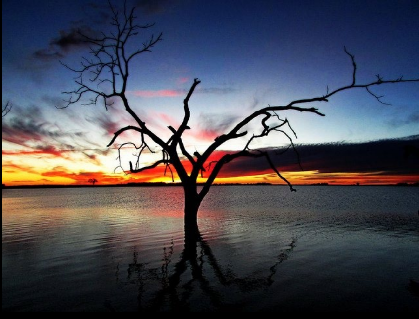
Sunset Sets the Sky Ablaze, Waubay National Wildlife Refuge, SD