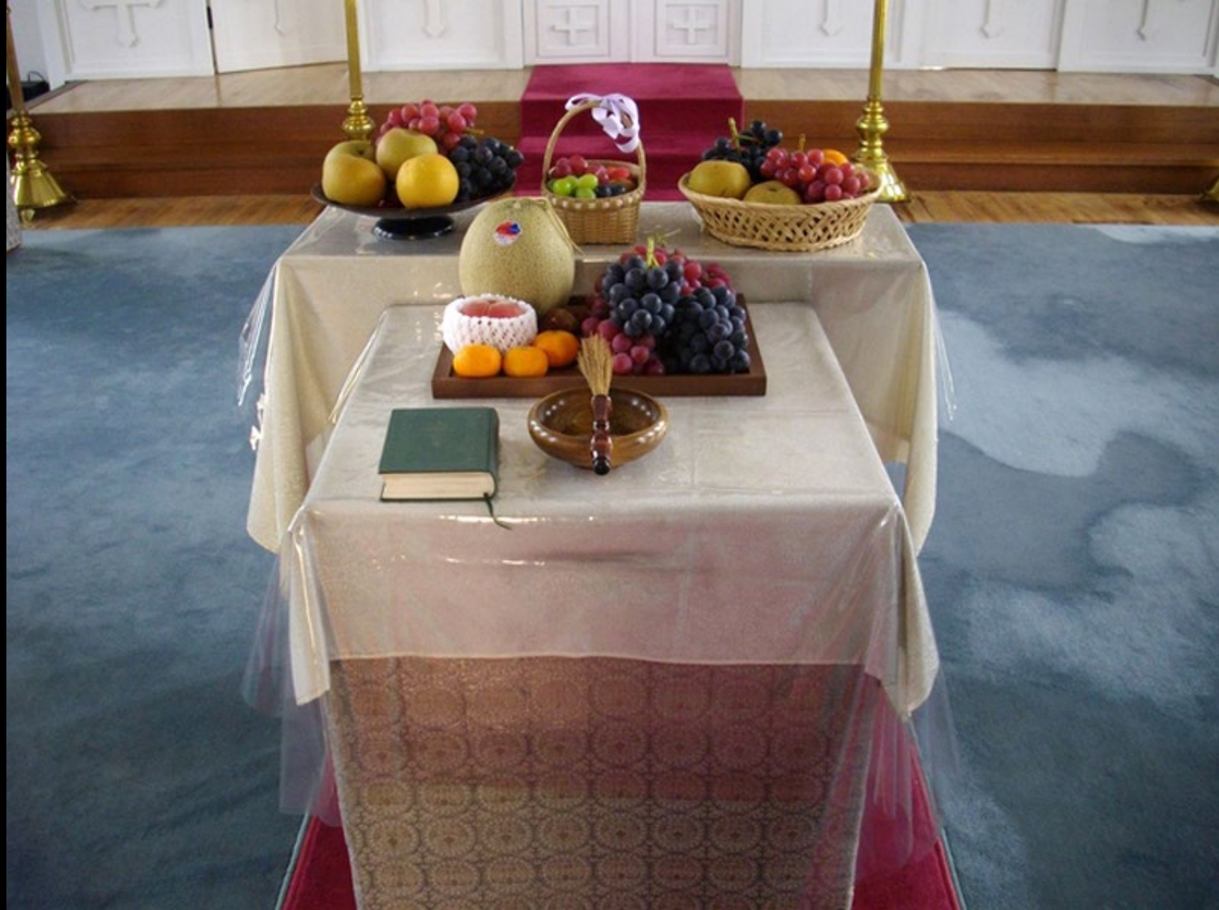
Blessing of First Fruits on the Great Feast of the Transfiguration of Jesus -- Tokyo, Japan