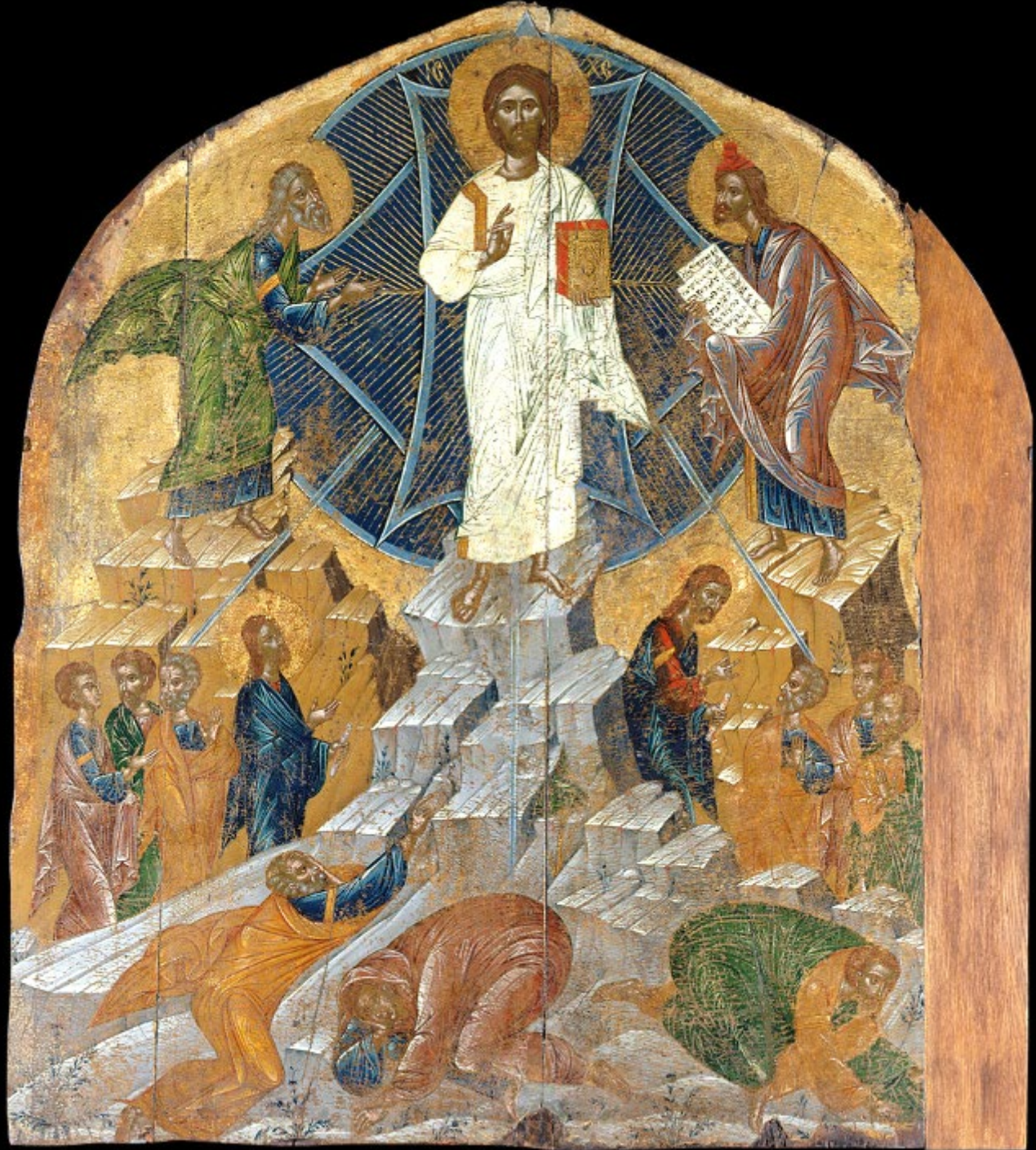
Transfiguration of Jesus Icon