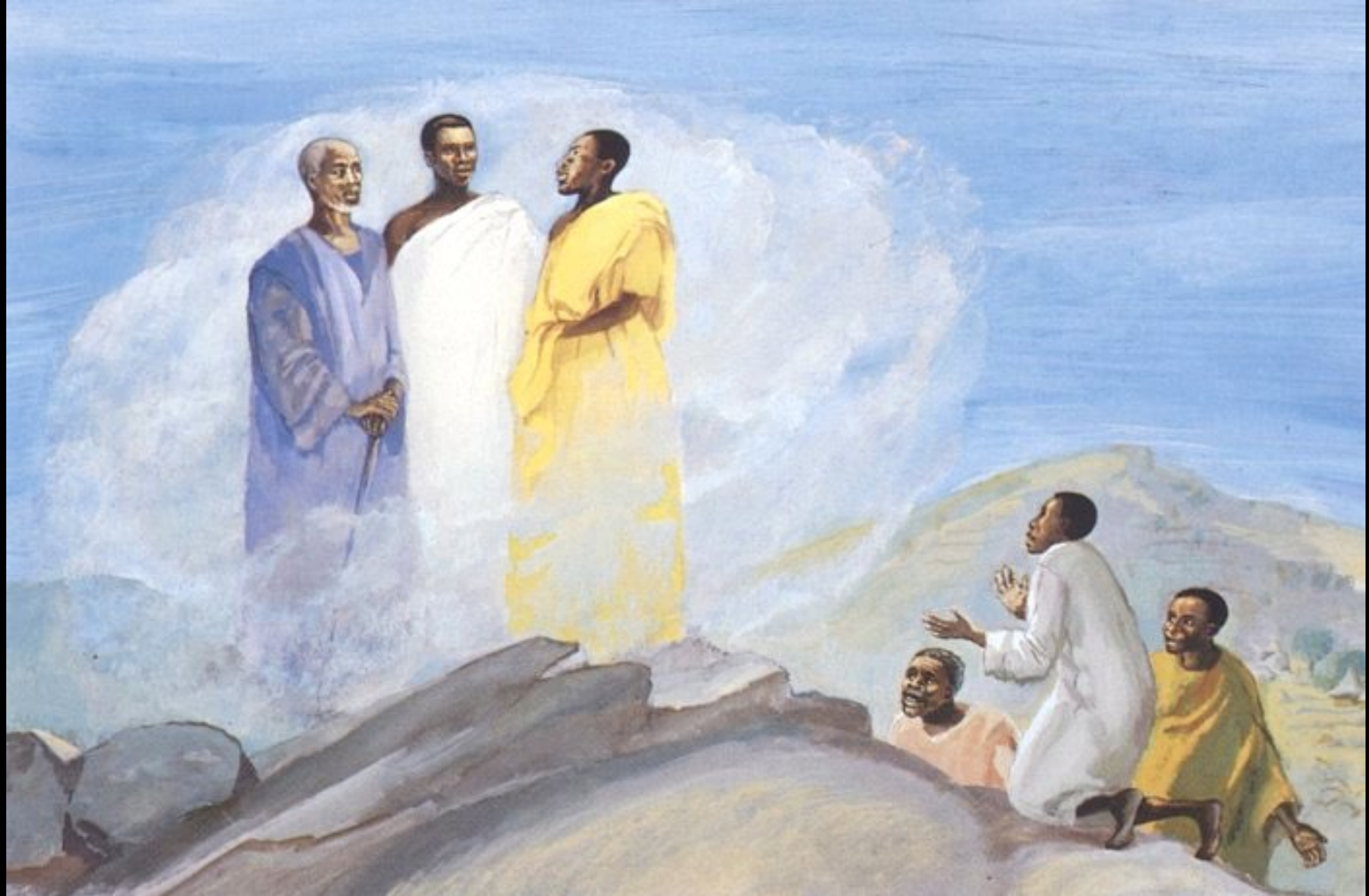
Transfiguration of Christ -- JESUS MAFA