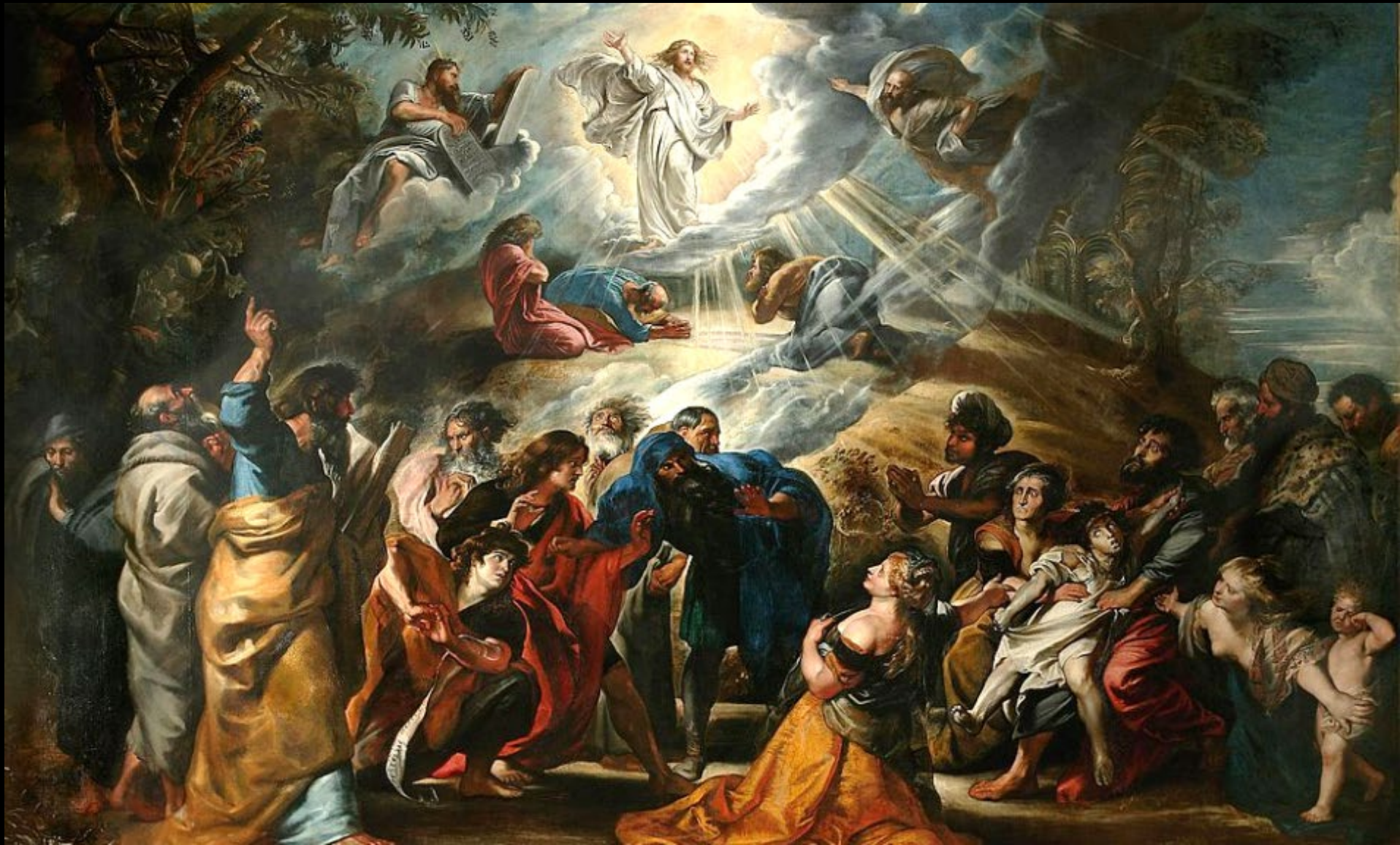
Transfiguration -- Peter Paul Rubens, Museum of Fine Arts, Nancy, France