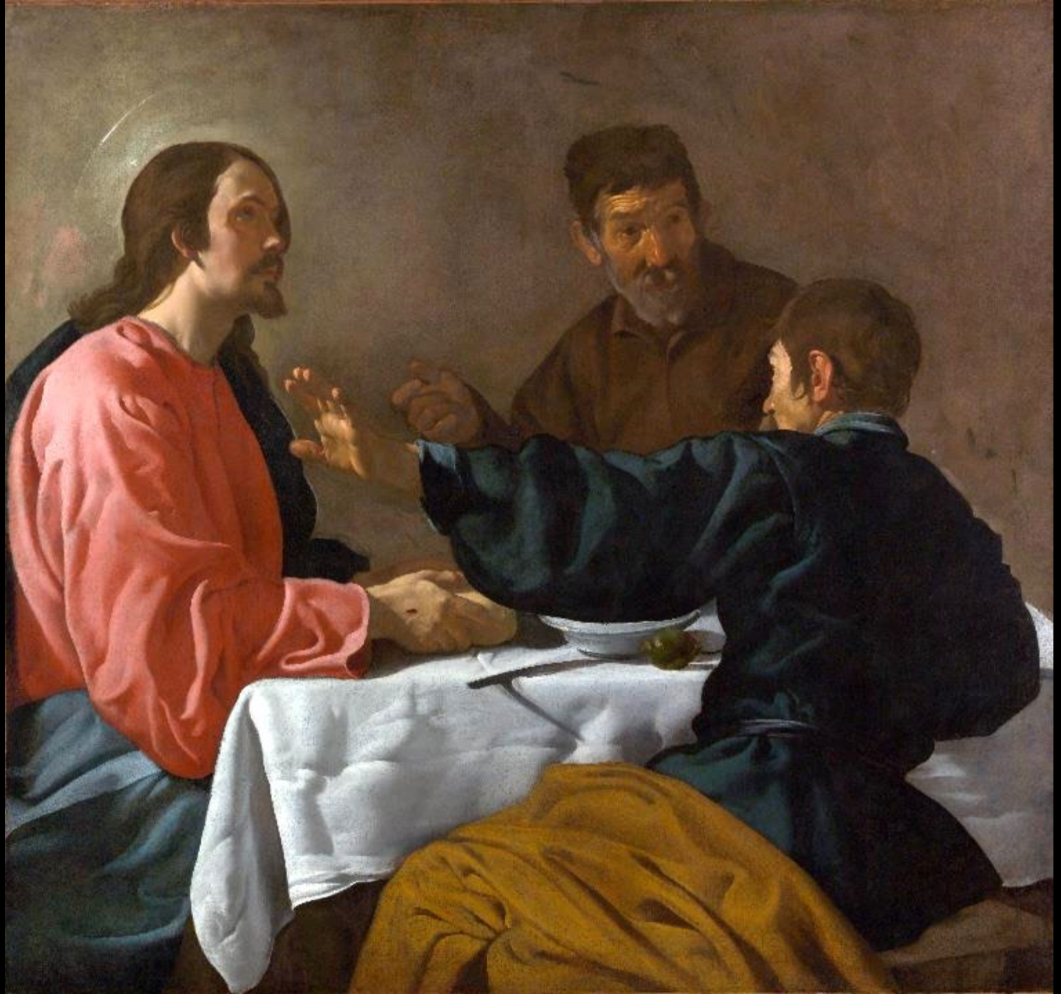
Supper at Emmaus