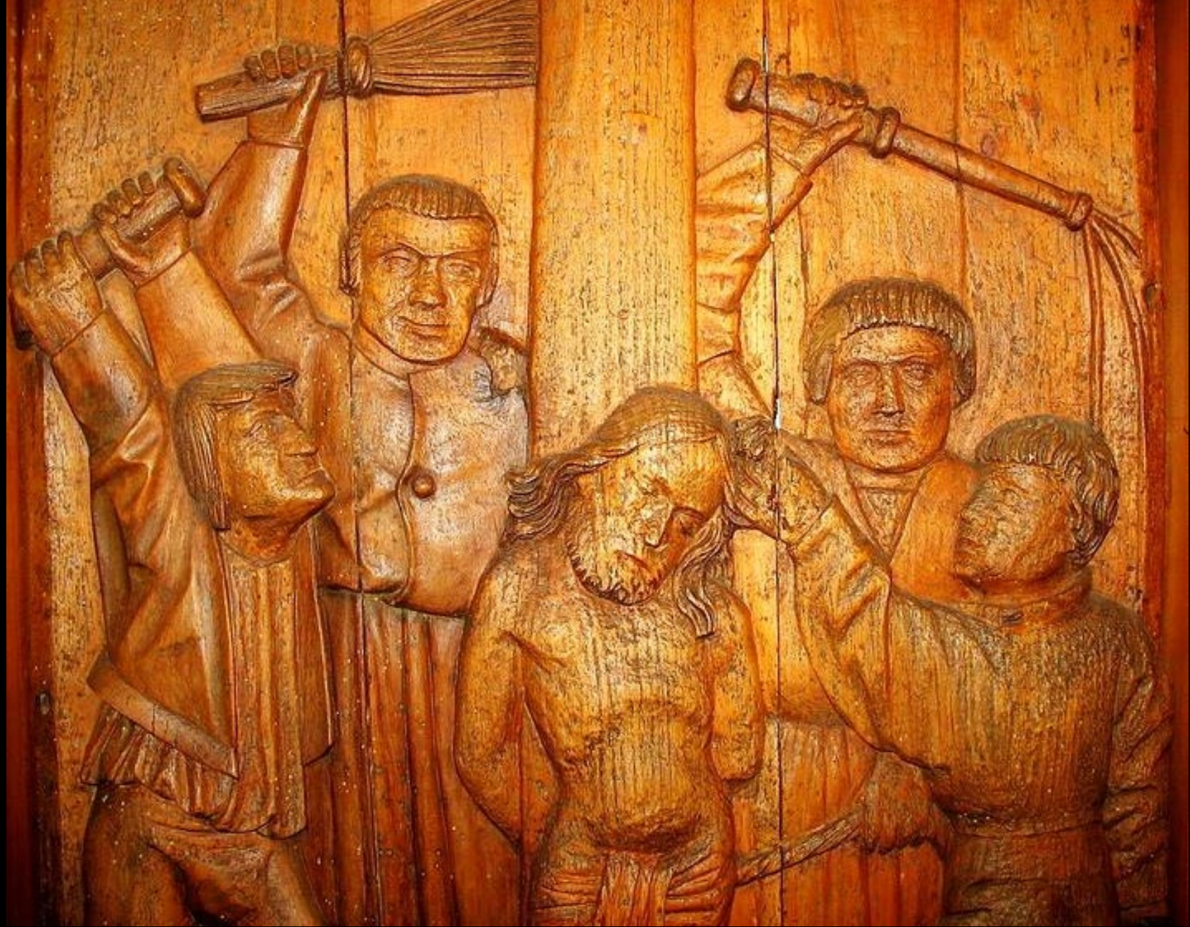
Flagellation of Jesus -- Museum Hallstatt, Hallstatt, Brazil