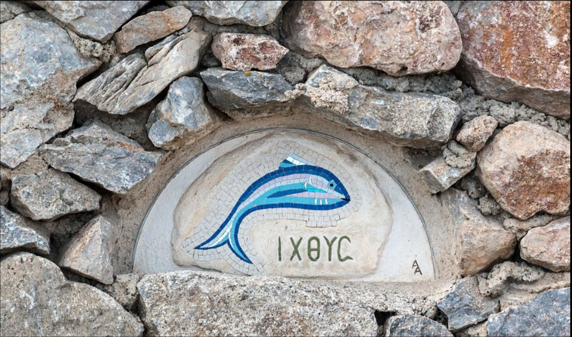
Fish Mosaic , Profitis Ilias Monastery, Kallistis, Greece