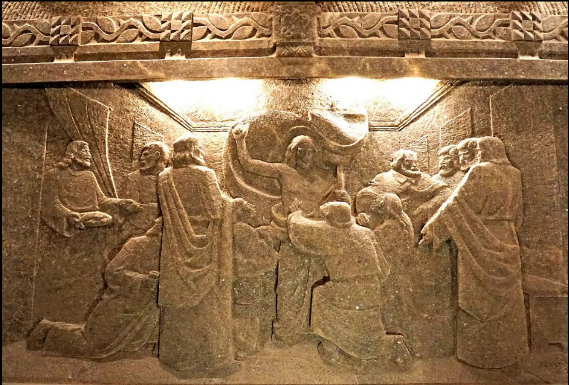
Christ Appears to Disciples -- Salt Mines Cathedral of Bogucice, Poland