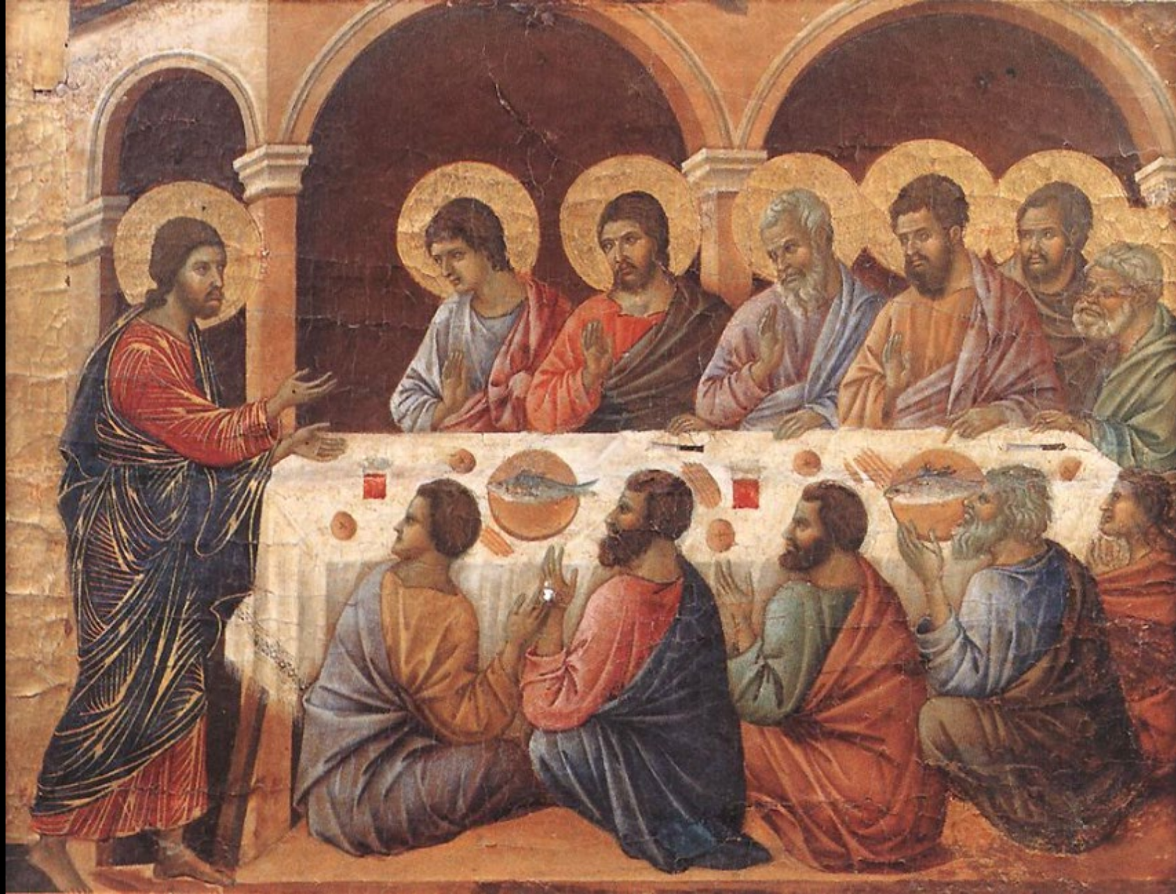
Christ Appears to the Disciples -- Duccio, Altar of Duomo, Siena, Italy