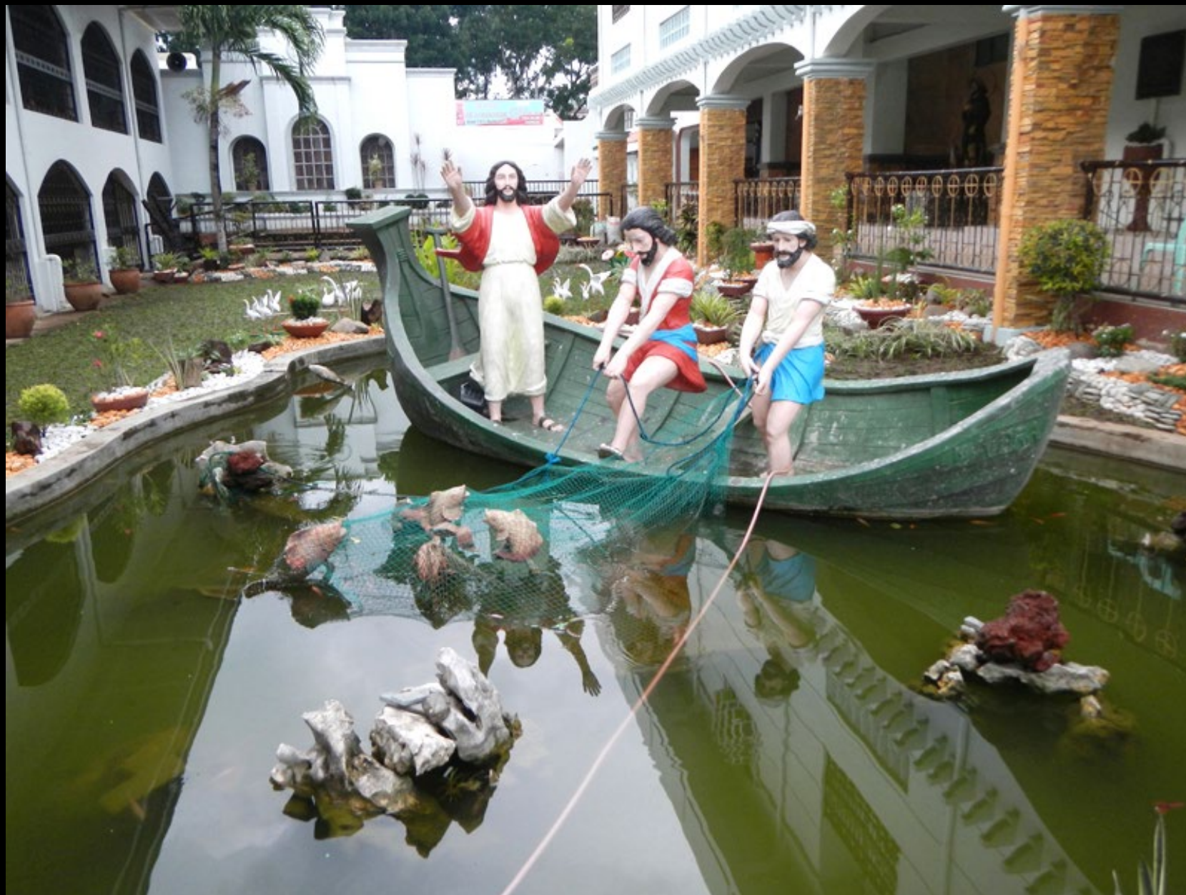
Christ Calling the Disciples -- Nuestra Senora de la Candelaria, Candelaria, Philippines