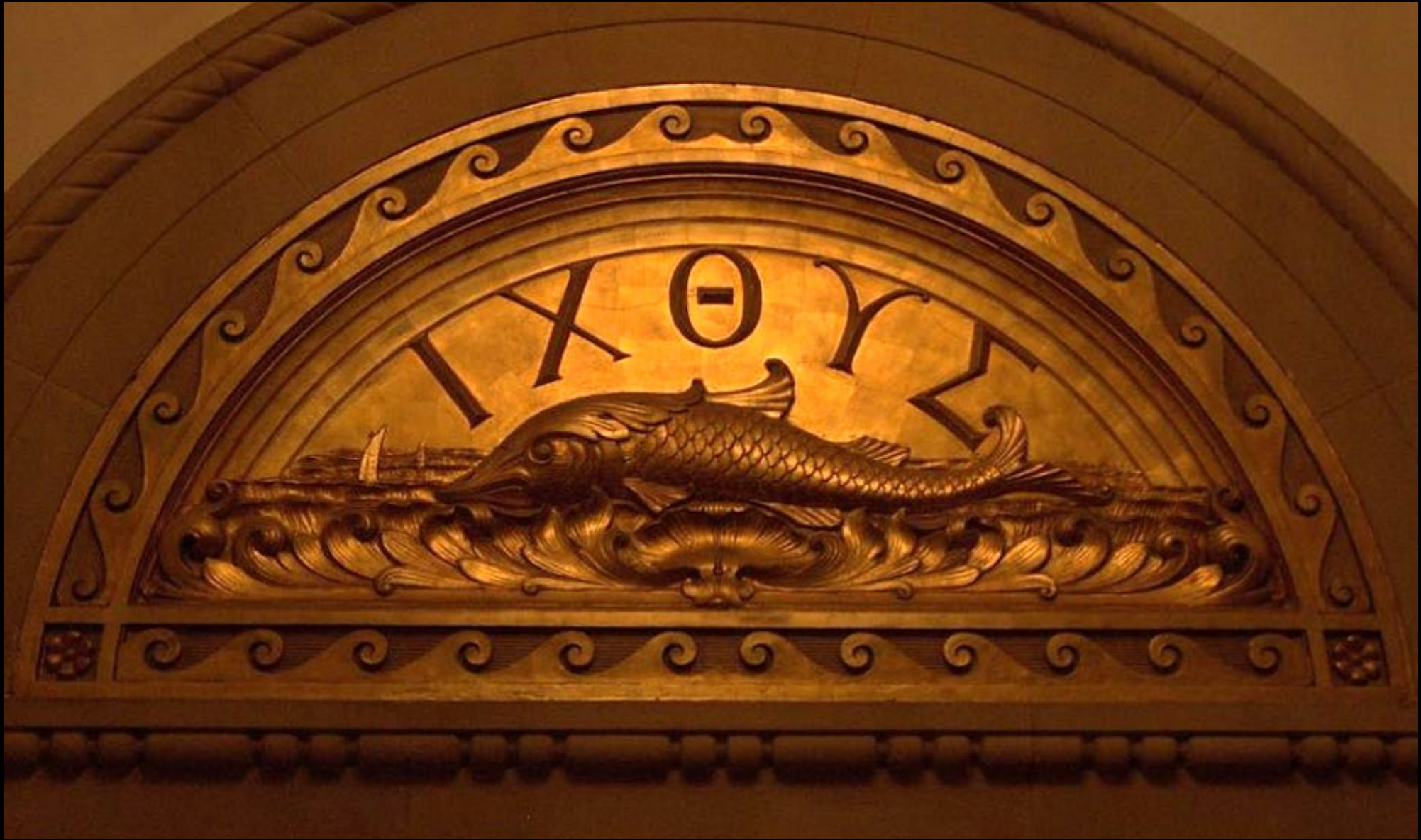
Ixthus Door -- Brite Divinity School, Texas Christian University, Fort Worth, TX