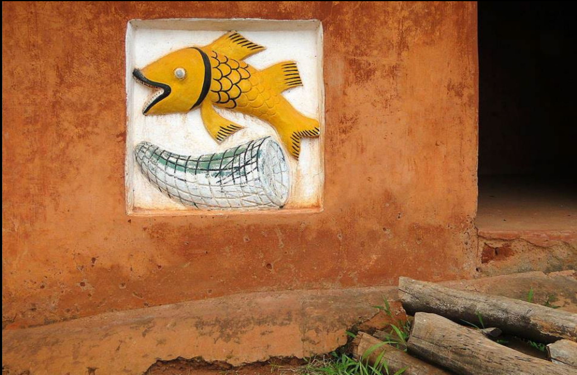
Fish Symbol on Shrine Wall -- Abomey, Benin