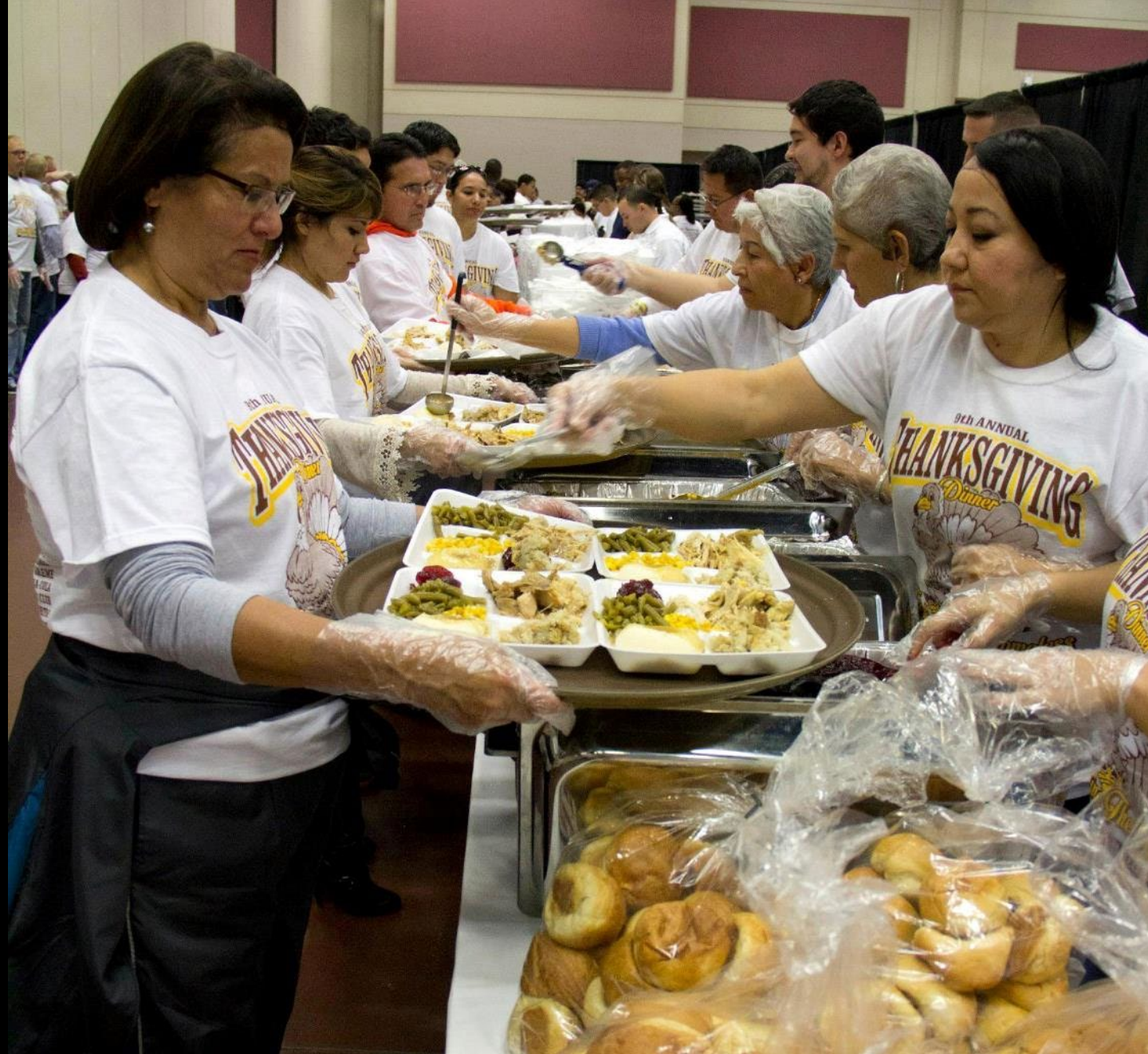
Preparing Thanksgiving for Homeless Community -- El Paso, TX