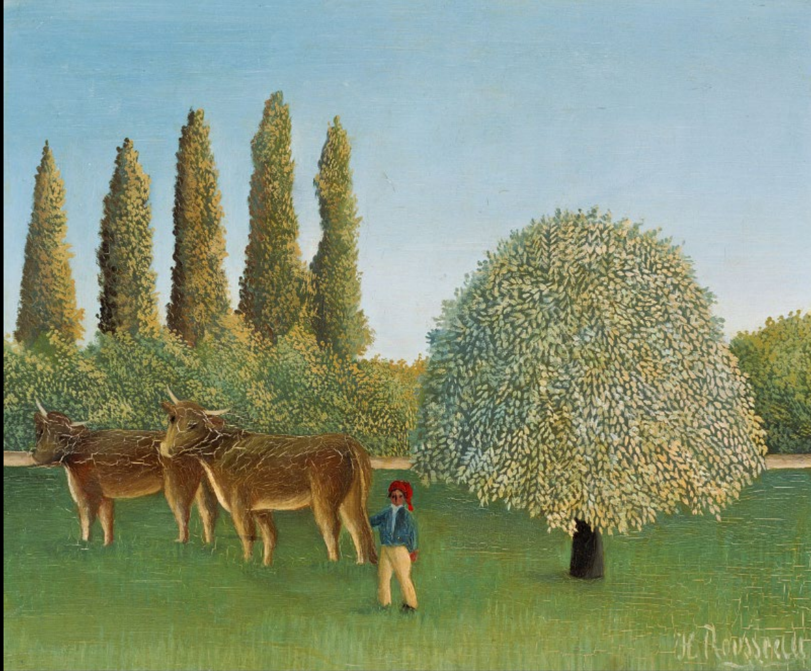
Meadowland -- Henri Rousseau, Bridgestone Museum of Art, Tokyo, Japan