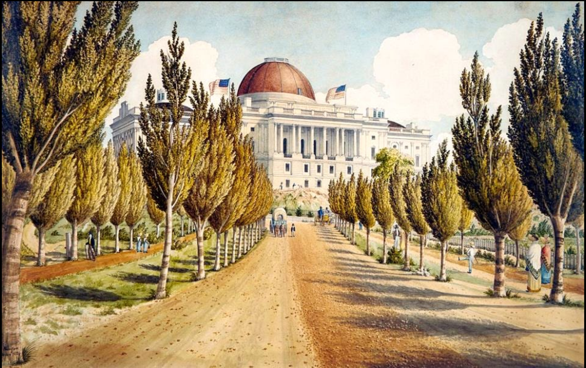
View of the United States Capitol -- watercolor, 1824, Metropolitan Museum of Art, New York, NY