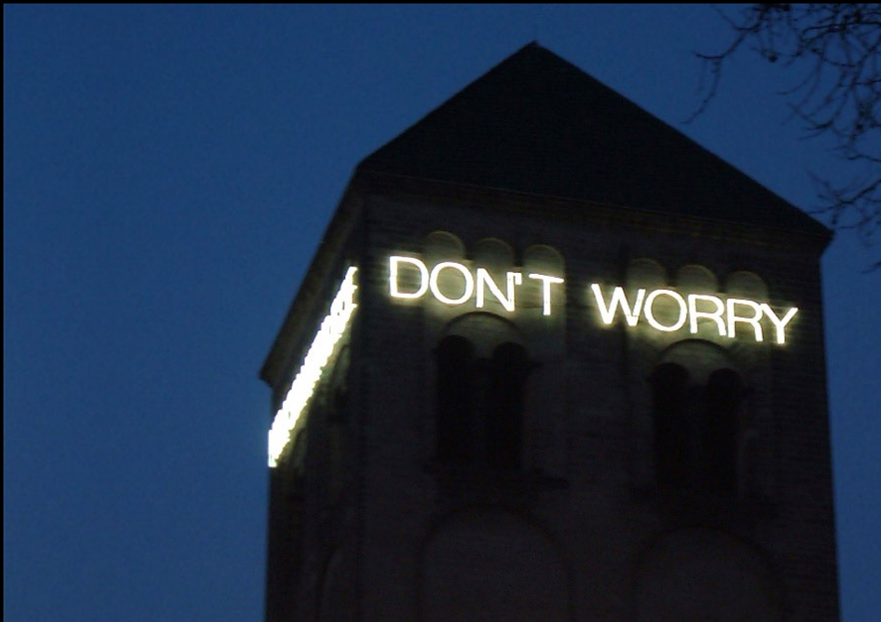
Don't Worry -- Martin Creed, permanent installation, St. Peter's Cathedral, Cologne, Germany