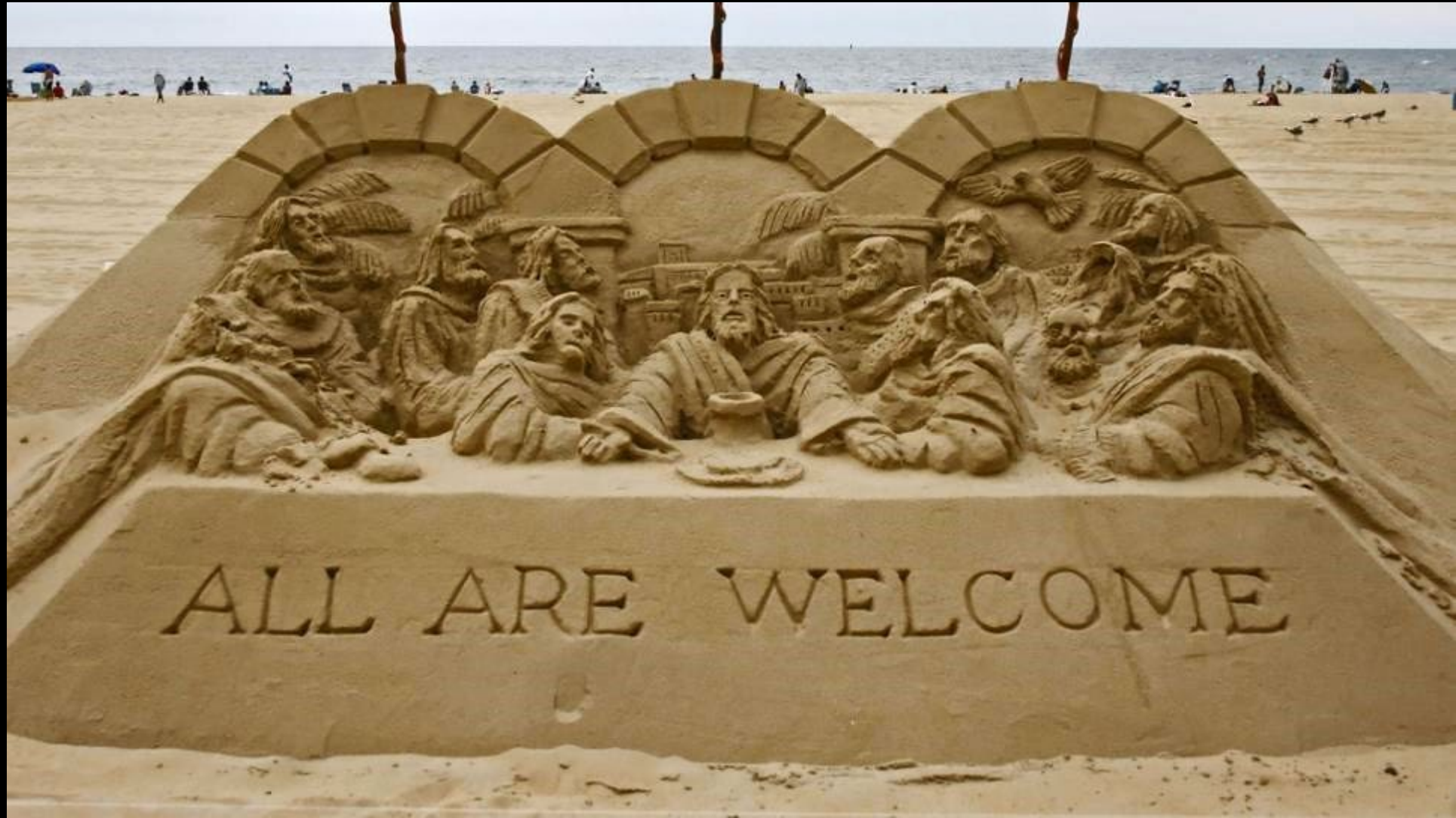
All Are Welcome in the Kingdom of God -- Sand sculpture, Ocean City, MD