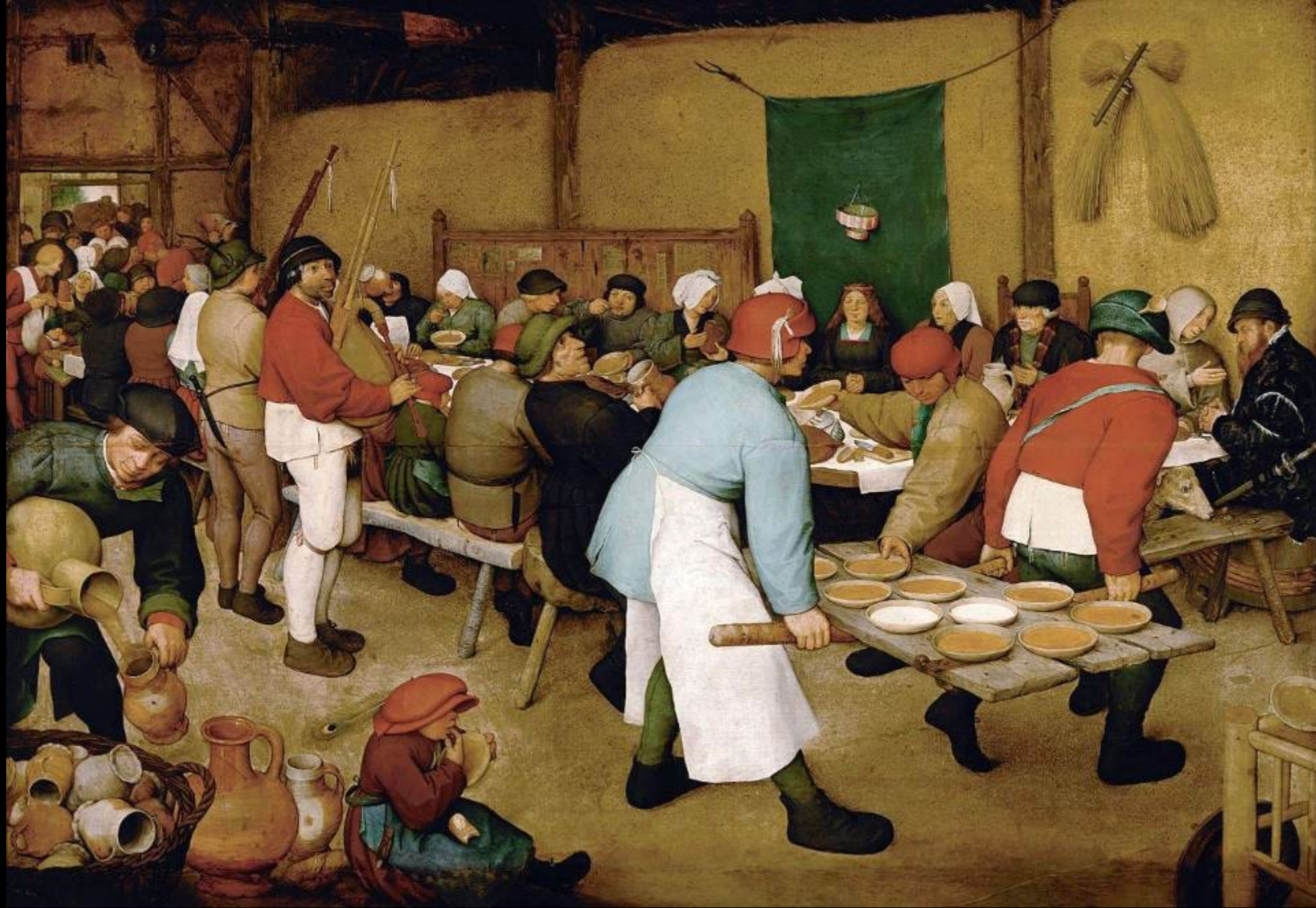
Peasant Wedding -- Pieter Bruegel,

Kunsthistorisches Museum, Vienna, Austria