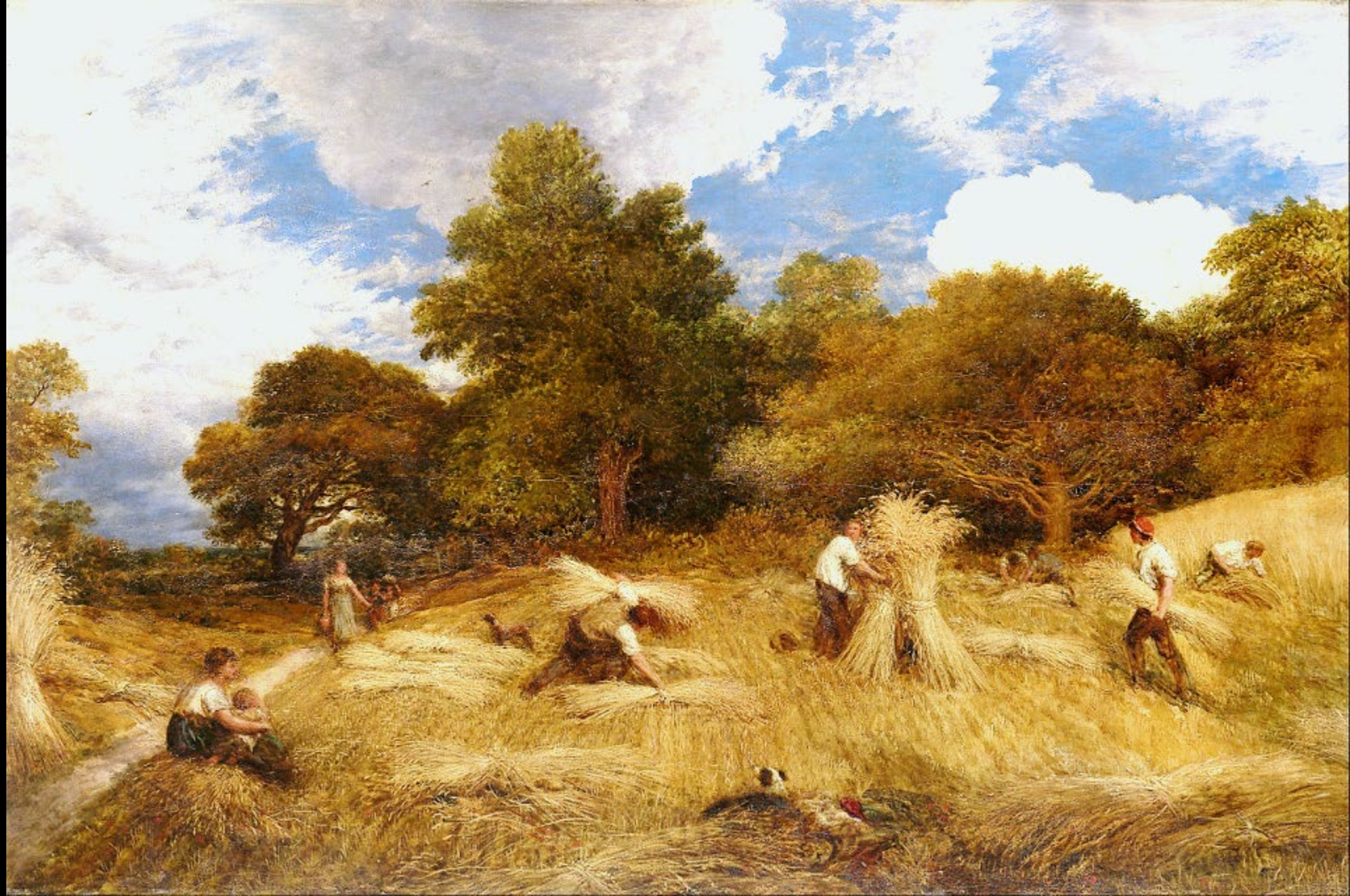
Wheat -- John Linnell, National Gallery of Victoria, Melbourne, Australia