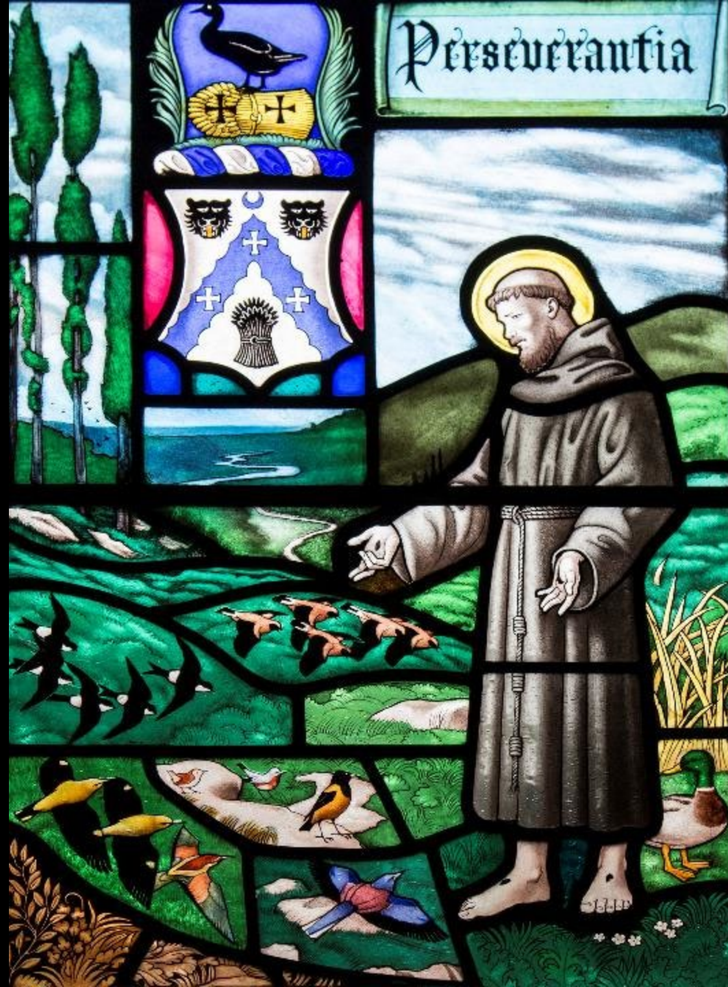
St. Francis and the Birds