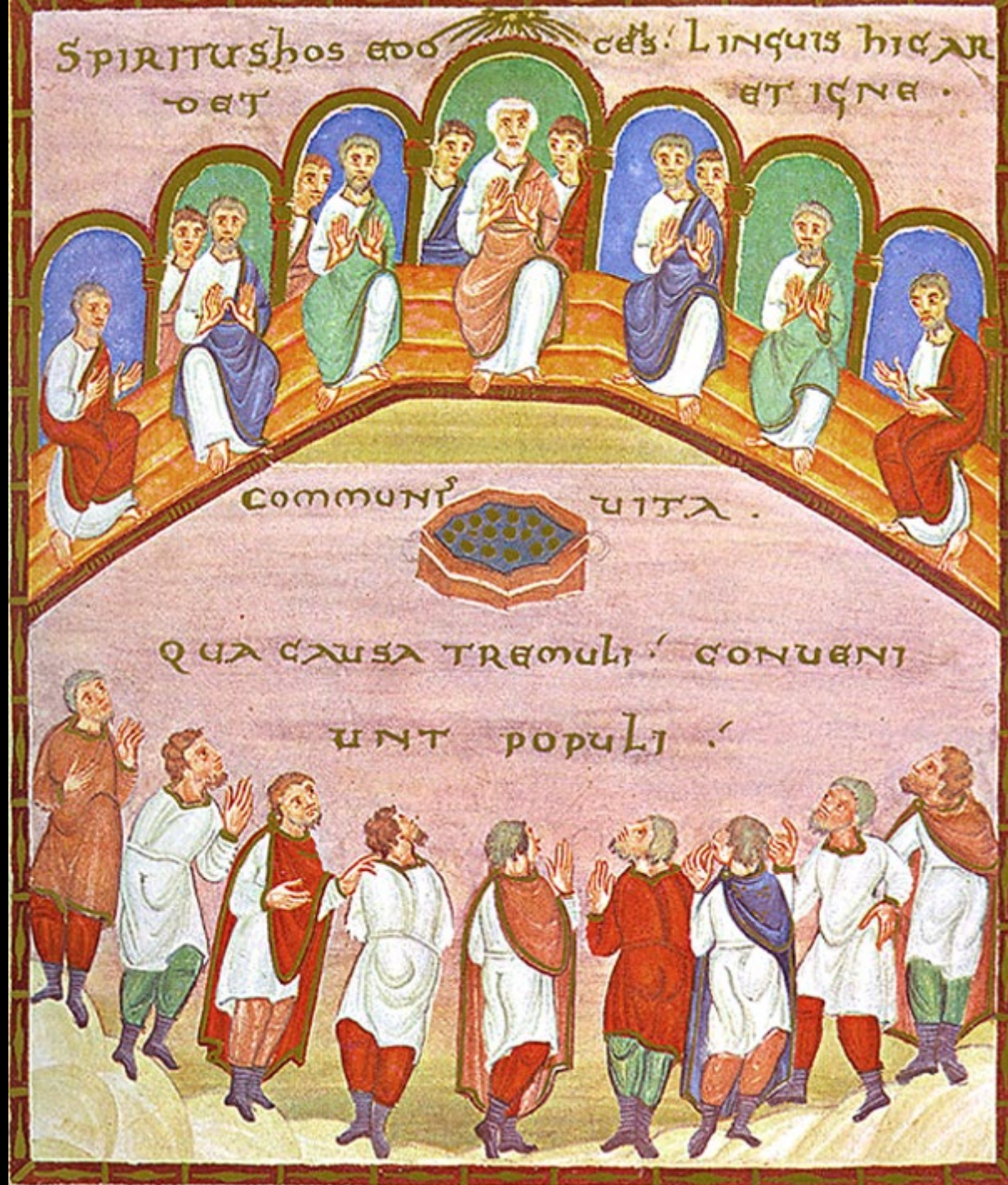
Holy Spirit Comes to the Disciples