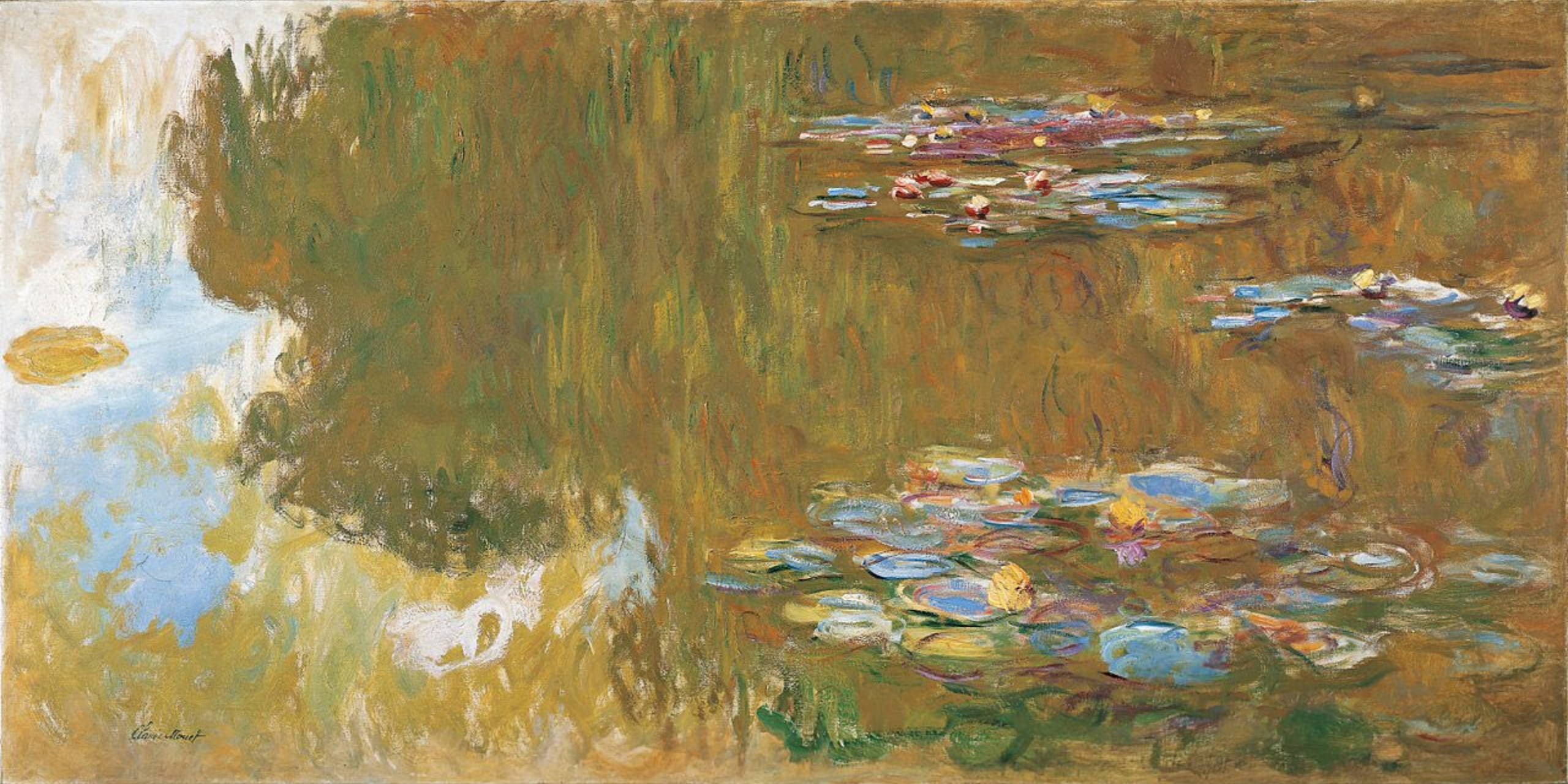
Water Lily Pond -- Claude Monet, Albertina, Vienna, Austria