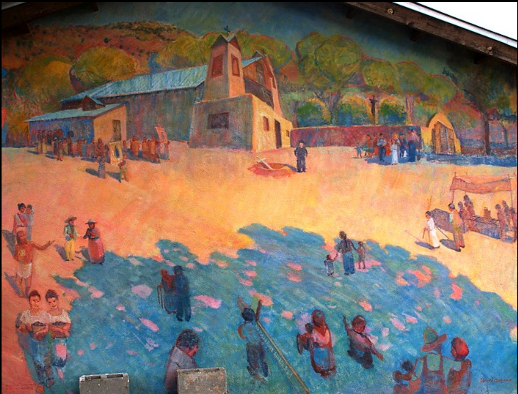
Gathering to Worship -- Sanctuario de Chimayo, Chimayo, NM