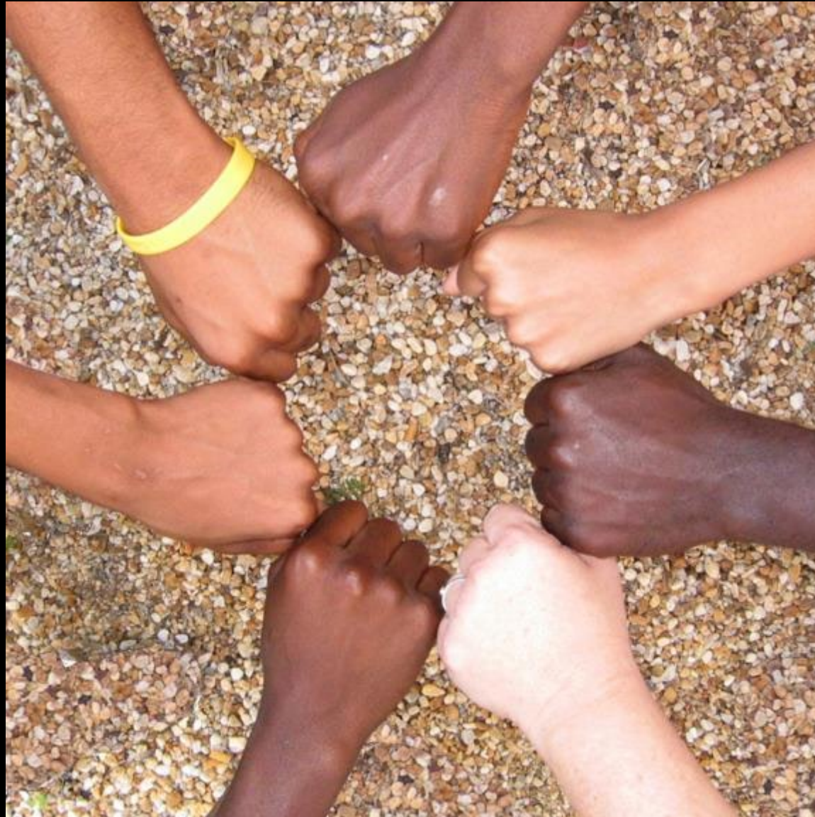
Hands All Together -- Avondale Pattillo United Methodist Church, Decatur, GA