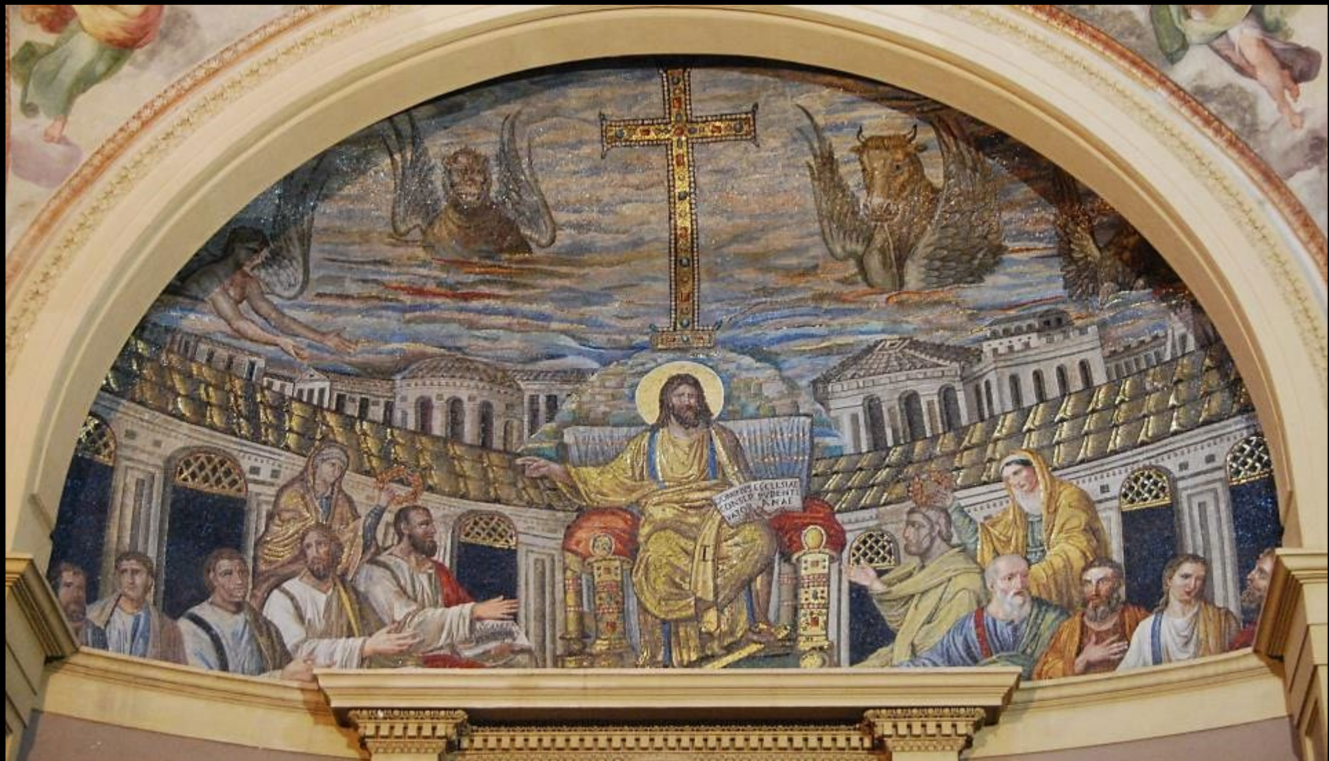
Christ with Christians, Jews, and Gentiles -- Santa Pudenziana, Rome, Italy