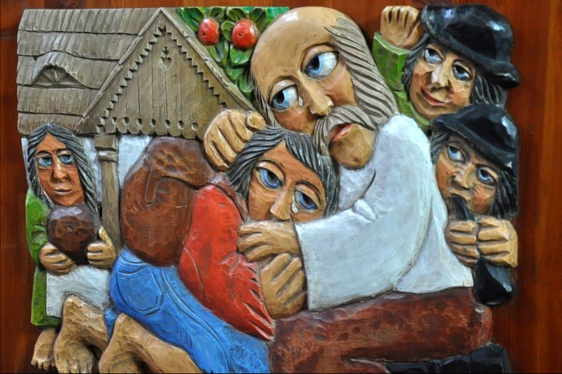
Prodigal Son -- Church carving, Poland